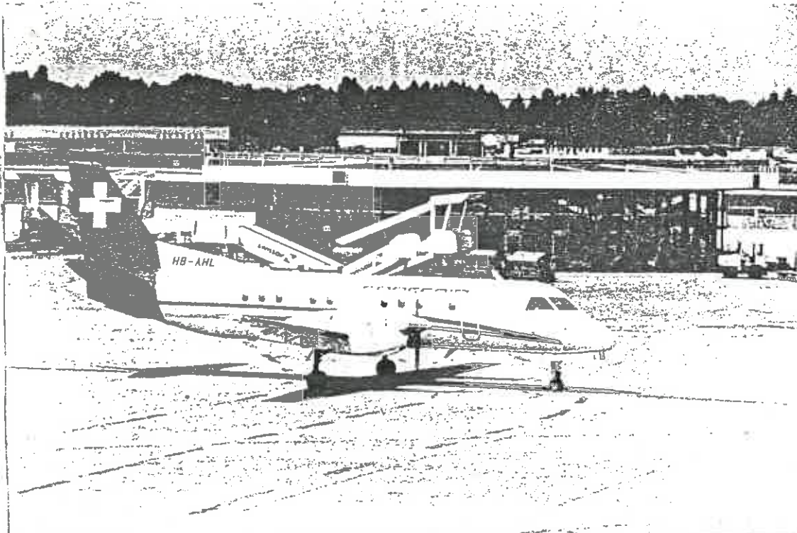
SAAB SF.340A HB-AHL of Crossair, light A/C hangars in background