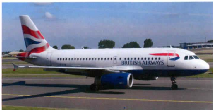
G-EUOA Airbus 319 Amsterdam 17 June 2008 Alan Sinfield