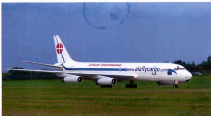
ZS-OSI Douglas DC-8-63 Doncaster 7 Sept 2008 Clive Featherstone