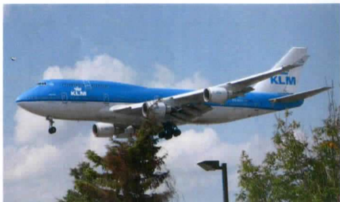
PH-BFV Boeing 747-406 Toronto 31 August 2008 i Ian Morton