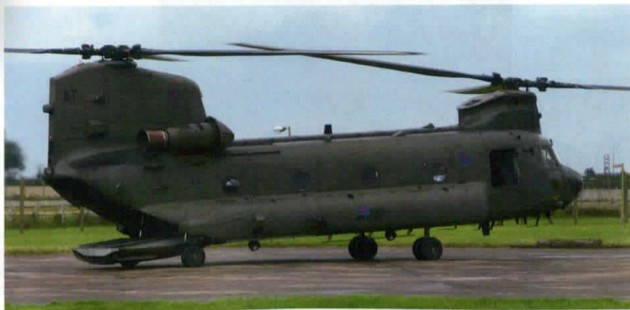
David Senior captured this shot of Chinook ZA712/AT at Waddington on 08 June 2008