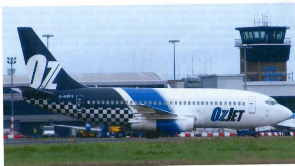
Charter positioned from Bournemouth to operate t/f Mahon(375/6) As can be seen in the photo the aircraft was in full Oz Jet colours.

Jet2:- G-CELY(015P) positioned in to operated the morning Belfast, G-CELA operated the other Belfast flights and positioned to Newcastle(016P). Boeing 737/200 G-GPFI(071P) of European Air