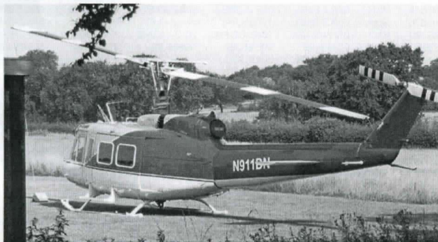
Bell UH-1H Super Huey N911DN Cony Park 25 July 2006 Terry Sykes