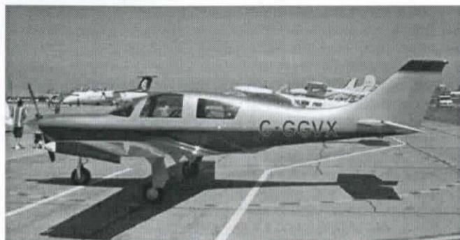
Wheeler Express 2000RG C-GGVX at Downsview 23-06-06 c/n 0333.