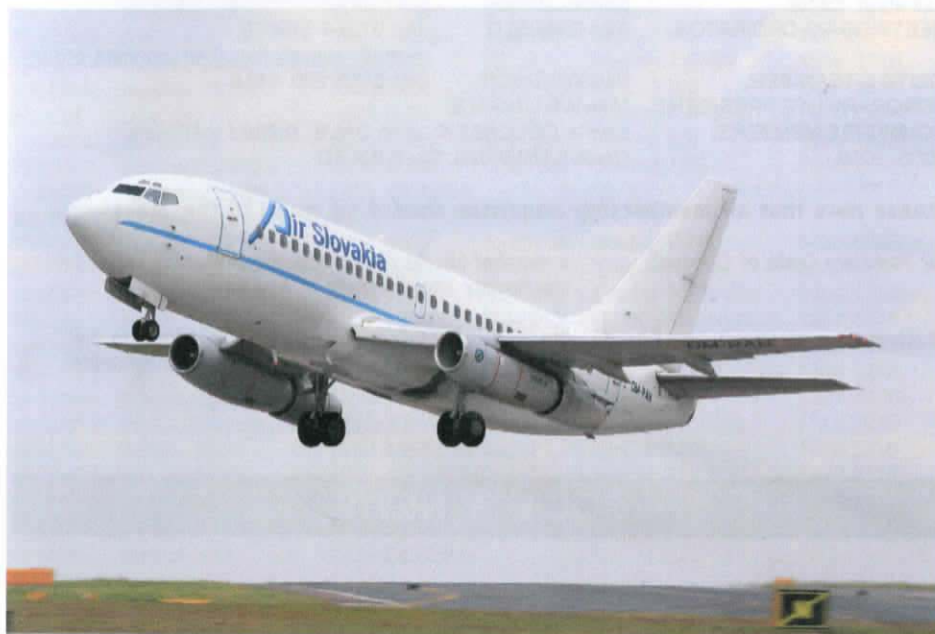
Boeing 737-230 OM-RAN Air Slovakia Leeds Bradford 30 July 2006