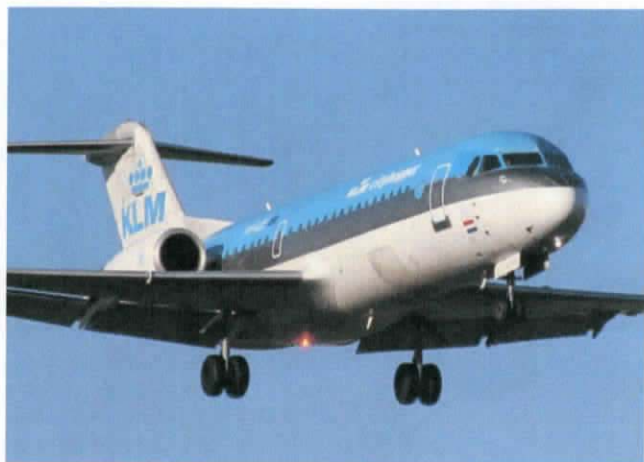
Fokker 70 PH-KZE KLM Leeds Bradford Airport 28 January 2006 Andrew Holden