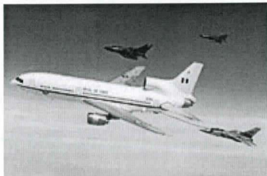
TristarThree-engined transport and/or air-to-air tanker