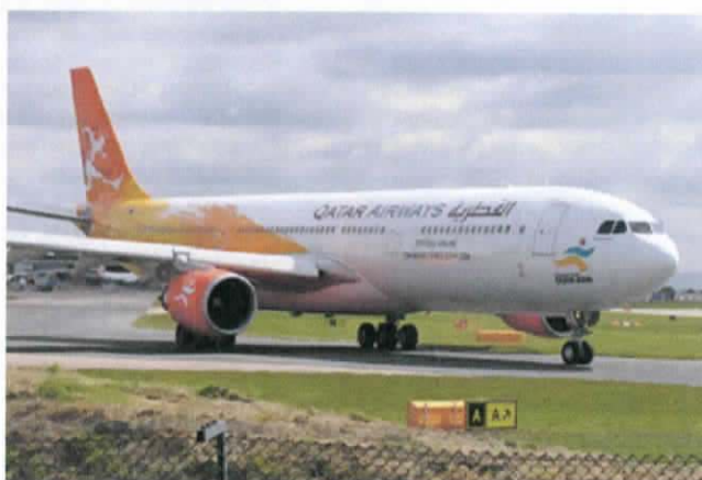
Airbus A330 A7-AEE Qatar Airways Manchester Airport 31 May 2006