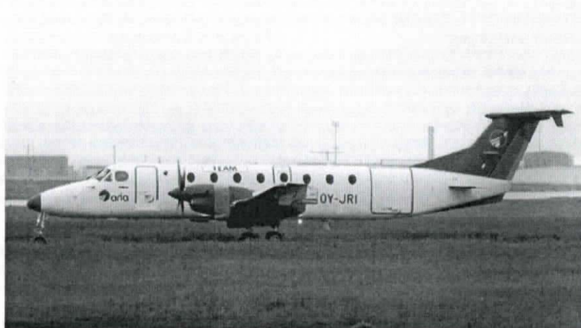
Beech 1900C-1 OY-JRI Danish Air Transport Leeds Bradford 26 May 2006