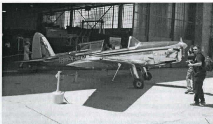
DHC-1 Chipmunk G-AKDN con.no.011. The oldest known Chippie still flying. At Downsview, Ont, 23-06-06.