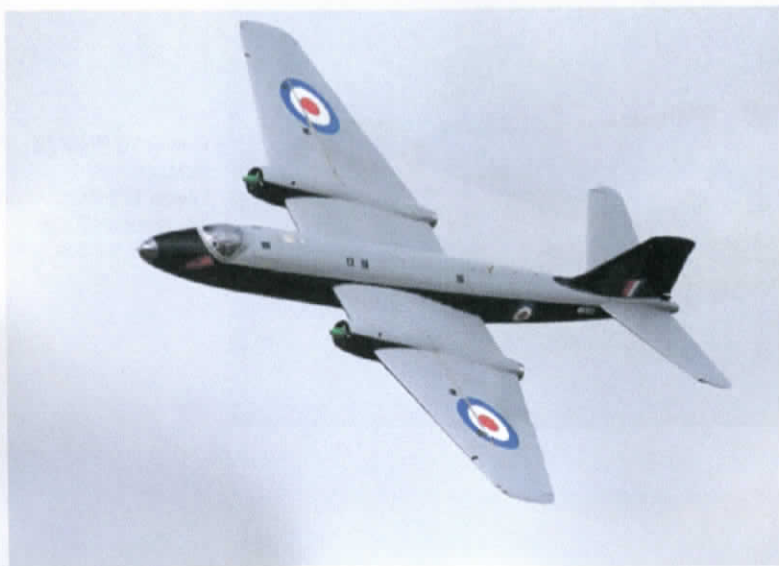
Canberra - Air Atlantique The Yorkshire Air Show Elvington August 2006 Cliff Jayne