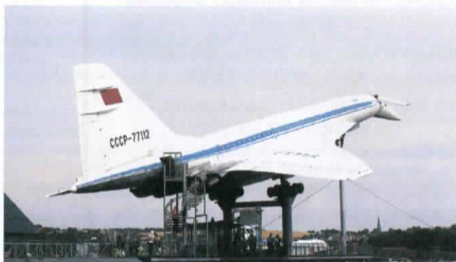
TU-144 Concorde CCCP-77112 Aeroflot Auto + Technik Museum, Sinsheim, Germany 31 July 2006