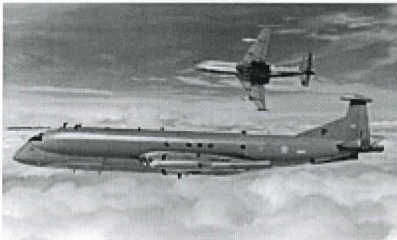
Nimrod R1 Electronic Surveillance