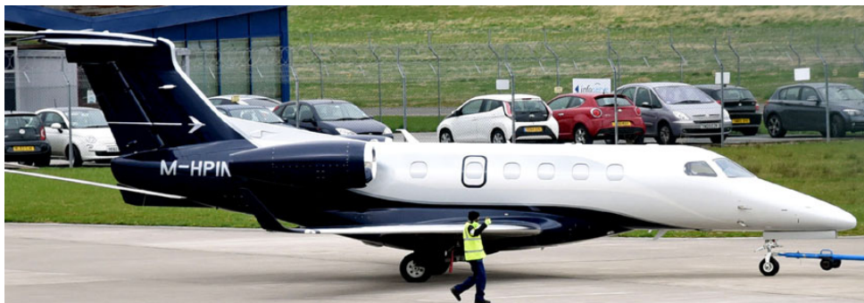
Phenom 300 M-HPIN is the latest addition to the LBIA resident list, owned by Harpin Ltd