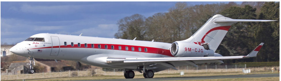
Operated by Air Asia, Global Express 9M-CJG arrived on 21/2 for the football at Hull City