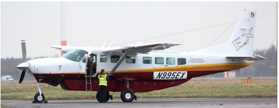
Passing through on delivery to Kansas on 5/2 was Cessna 208 Caravan N995EX