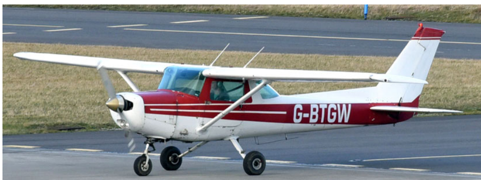
Cessna 152 G-BTGW of Stapleford Flying Club seen arriving on 17/2(Rod Hudson)