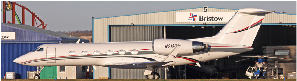
Gulfstream 4 N515UJ owned by MH Holdings of Baco Ranton, Florida arrived 8/2