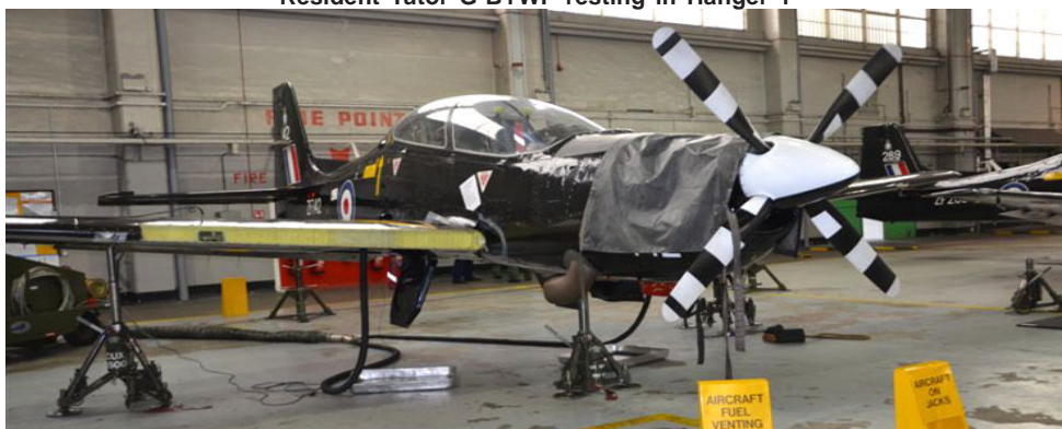
Tucano ZF412 undergoing some major maintenance.