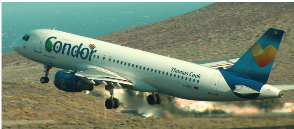
Airbus A.320 D-AICG of Condor, departing Tenerife 22/02/15(Alan Sinfield)