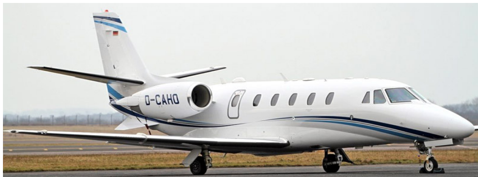
Citation XL D-CAHO of Air Hamburg parked at Teeside , having arrived from LBIA

The rest of the local scene movements will appear as usual next month as we have got a little ahead of ourselves with them in recent months in order to fill space.