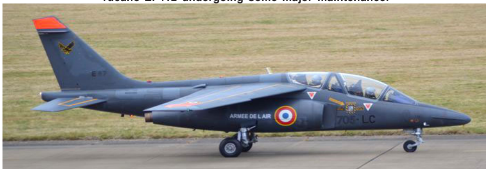
French Air Force Alpha Jet E.87/705-LC was visiting from its base at Tours