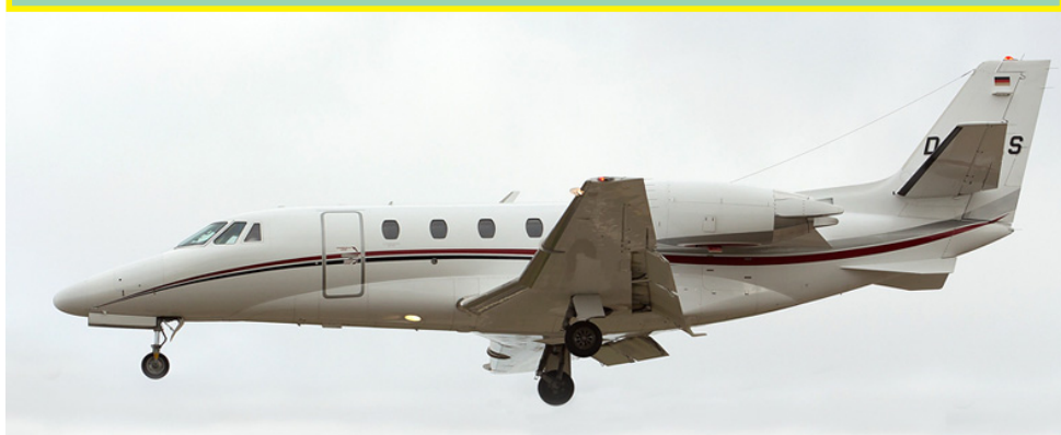
Citation XL D-CXLS of Air Hamburg arriving LBIA, 21/03/15(Stewart Robershaw)