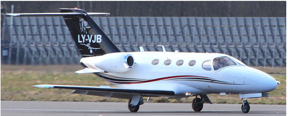
Departing the Cessna Service Centre, 13/2, Citation Mustang LY-VJB(Clive Featherstone)