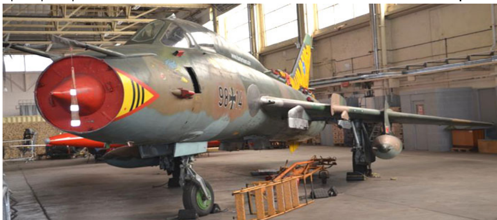
Sukhoi SU.22 98+14