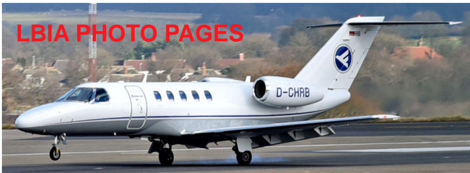
Citationjet 3 D-CHRB of Hahn Air touching down on runway 32, 17/2(Rod Hudson)