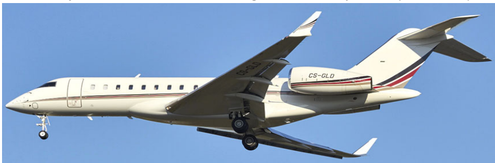
Global Express CS-GLD of Netjets on finals for runway 32, 3/2(David Blaker)