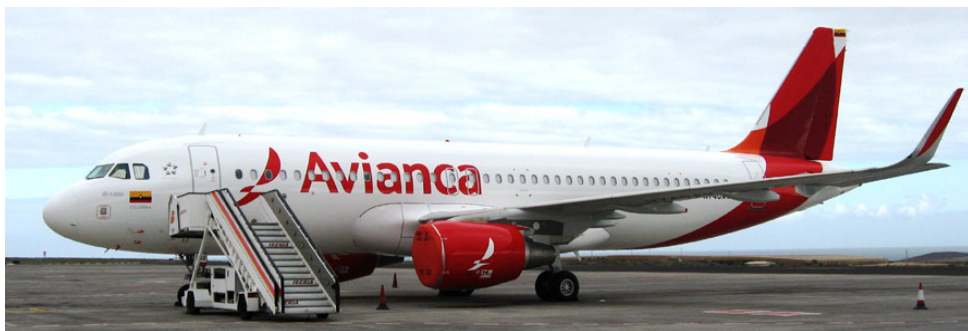
Airbus A.320 N740AV at Tenerife/South, 29/01/15(Martin Zapletal)