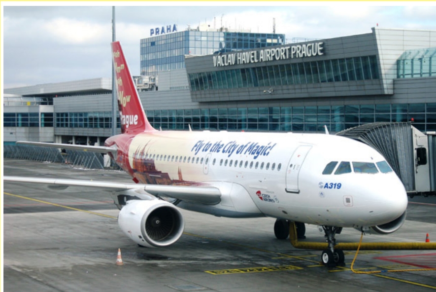
OK-NEP Airbus A320 of CSA Prague International, 04/02/15 Martin Zapletal