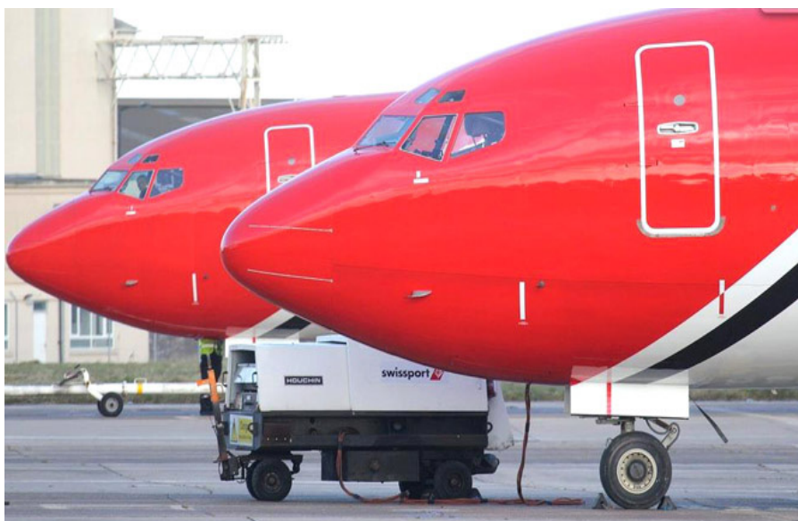
The two Boeing 727/200s of T2 Aviation, G-OSRA/G-OSRB parked at Doncaster/Robin Hood in February