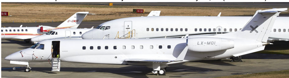
Legacy LX-MOI of Luxaviation parked on a crowded Multiflight/East, 27/2