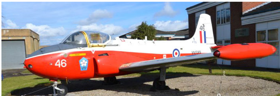
Jet Provost XN589/46 in the marking of 1FTS