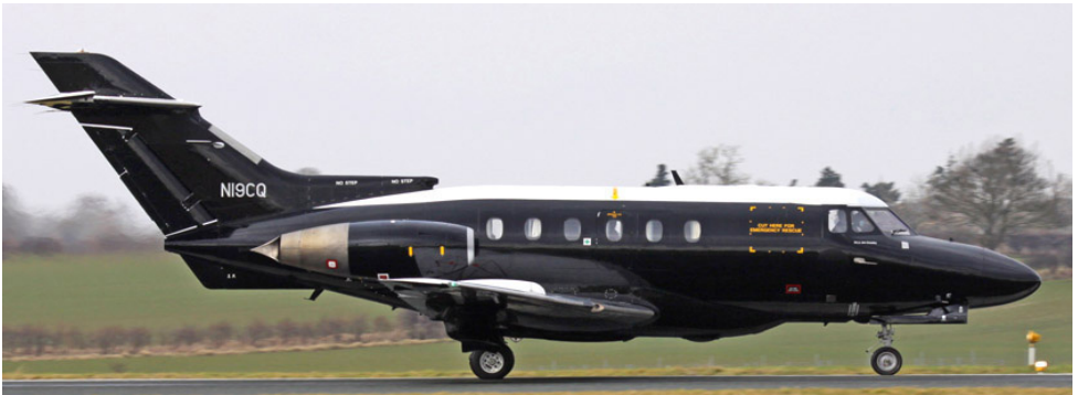
Dominie N19CQ(ex XS712) arrived on 20/2 and is to be used by the new BAe College