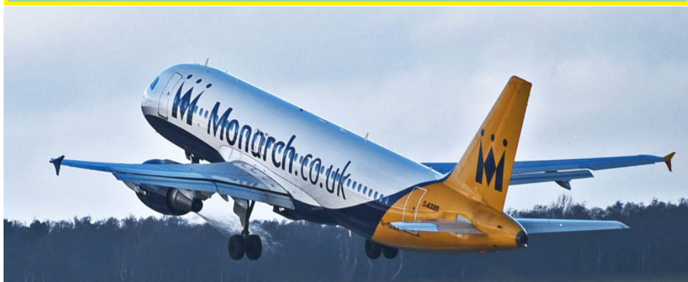
Airbus A.320 G-OZBX of Monarch departing LBIA on 17/02/15(Rod Hudson)