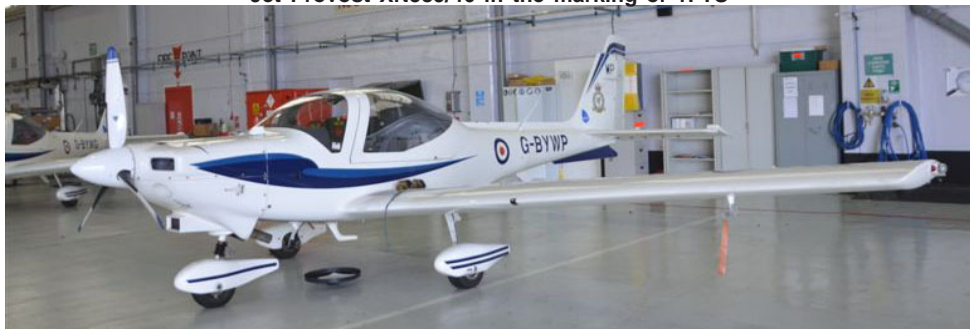
Resident Tutor G-BYWP resting in Hanger 1