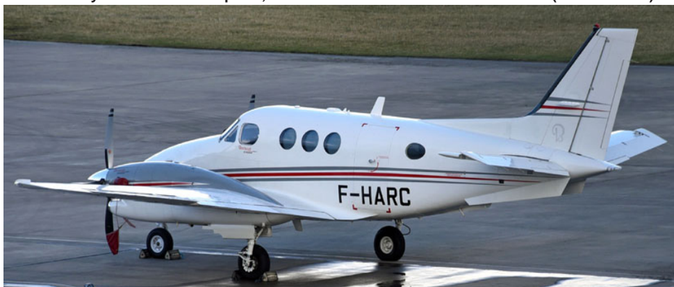
King Air C90GTi F-HARC of Reel Air SAS, parked on Multiflight/East, 17/2