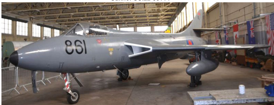
Hunter GA11 XE685/861/VL