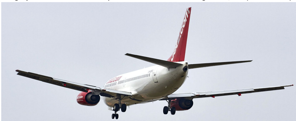
Jet2 Boeing 737/300 G-GDFE diverted into LBIA on 12/2 while operating "Channex 507" from Newcastle to Prague. The crew had reported smoke in the cabin(David Blaker)