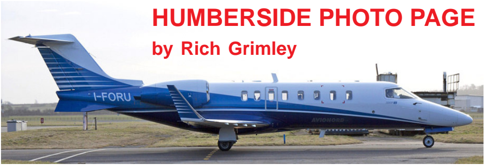
Lear Jet 45 I-FORU operated by Air Four, seen arriving on 24/2