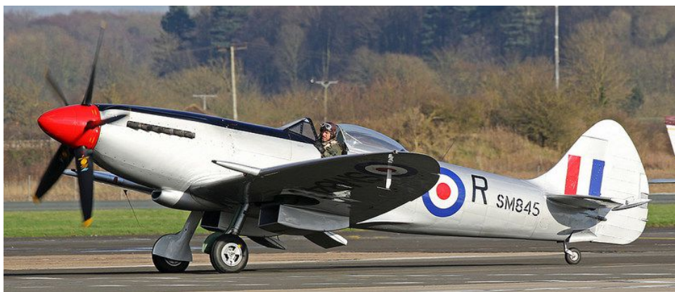
11 February SM845 Spitfire