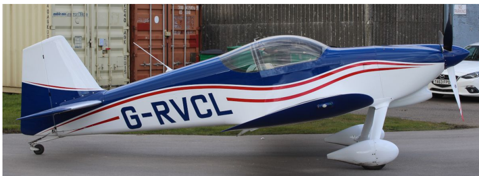
G-RVCL VANS RV-6