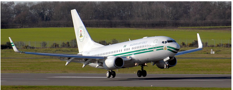
5N-FGT Boeing 737-700 Nigerian Air Force 10/02

1st N243PC Hawker Beechcraft Corp Hawker 4000 Bank of Utah Trustee. Dep. 1st G-LXWD Citation 560XL Catreus AOC Ltd. Dep. 2nd 4th N112WJ Gulfstream IV TNT Aero Inc. Pembroke Pines Dep.5th (FV) 6th 9H-ILA Bombardier Canadair Regional Jet 200 VistaJet (FV) 7th N7799T Gulfstream IV Wells Fargo Bank Northwest NA Trustee Dep. 8th very early morning (FV)