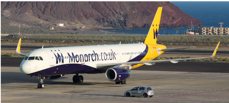
G-ZBAD Airbus A321 Monarch Tenerife South 21/02/16