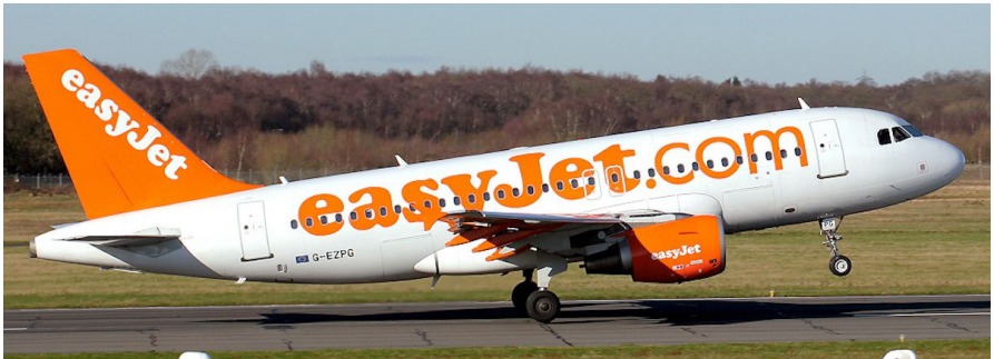
G-EZPG Airbus A319 Easyjet 09/02 & 10/02