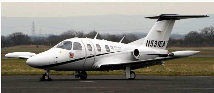
N531EA Eclipse EA500 29/02