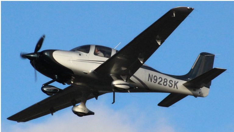
N928SK Cirrus SR22T Leeds Bradford 18/02/16