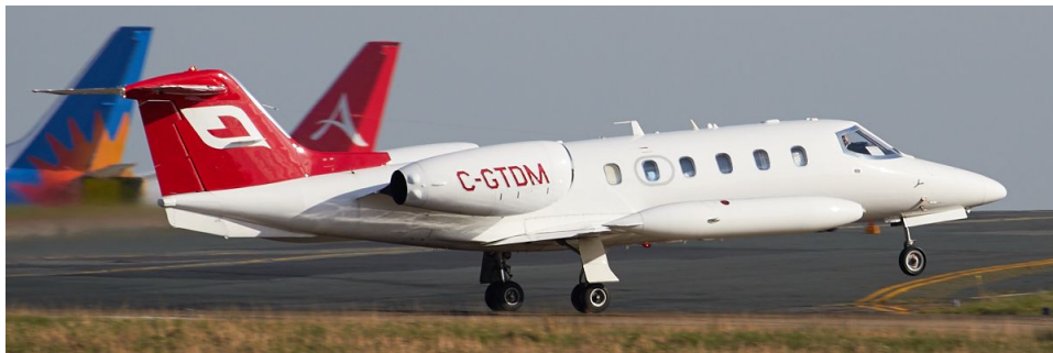
C-GTDM Learjet 35A

Astra D-CRIS dep 08:52 to Innsbruck, Cessna 525 CJ1 M-OLLY f/t Memmingen-Allgau (09:31/16:50), Learjet 35 C-GTDM dep 12:12 to Keflavik, Cessna 750 Citation X N752TX arr from Theodore Francis Green State Airport until 19th, Augusta A109 G-ZIPE arr 18:43.