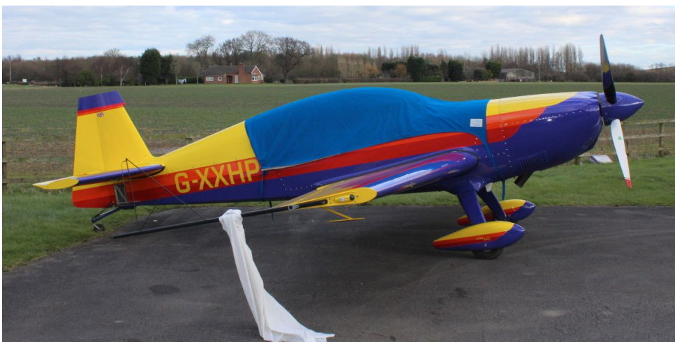
G-XXHP EXTRA 300L