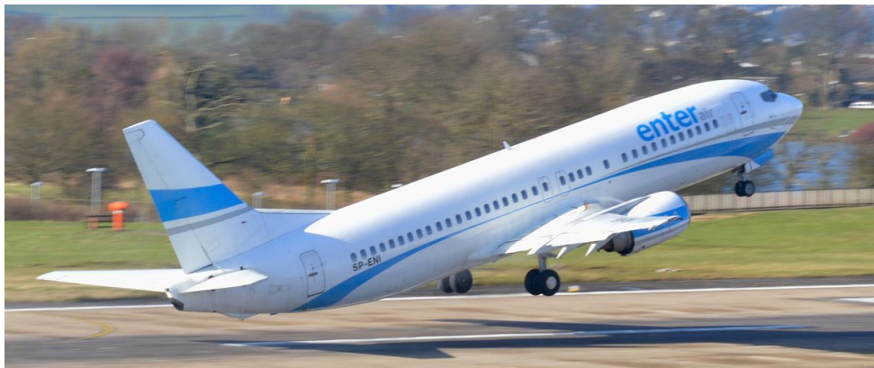
SP-ENI Boeing 737-800 Enter Air 18 February 2016

Additional flights:-G-CERY(014P) positioned in from Aberdeen, G-CFLU(015P) positioned out to Aberdeen, 8/2 G-CDKB(014P) positioned in from Norwich, 9/2 G-CGWV(12W) positioned in from Humberside, G-CDKB(025P) positioned out to Aberdeen, 10/2 G-MAJJ(031P) positioned out to Humberside, 19/2 G-CISK(057P/058P) positioned in from/out to Humberside, 22/2 G-MAJB(25Z) positioned in from East Midlands, 24/2 G-CFLV(9603/096P) operated out to/positioned back from Gatwick, G-CIEC(78H) positioned in from Norwich, G-MAJK(32Z) positioned out to East Midlands, 25/2 G-MAJA(31Z) positioned in from East Midlands, G-CIEC(4718D) departed to Aberdeen, 26/2 G-MAJI(62L) arrived from Durham Tees Valley, 27/2 G-CFLV(062P) positioned out to Aberdeen.