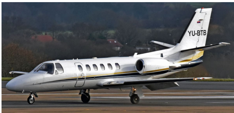
YU-BTB Cessna 550 Citation Rod Hudson