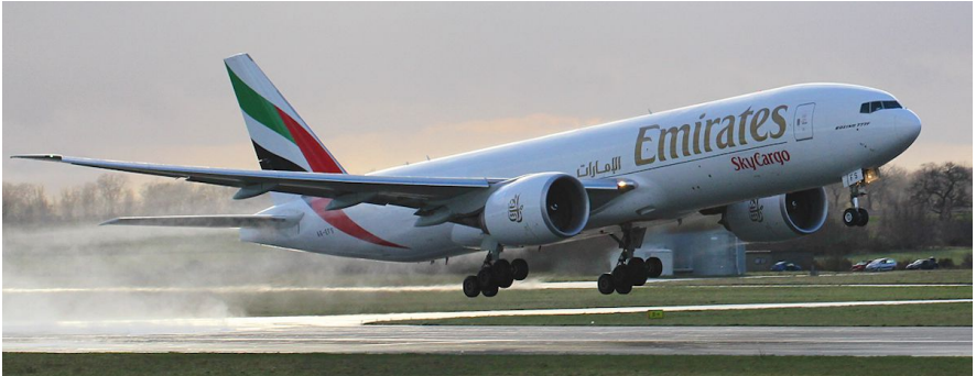
A6-EFS Boeing 777-200 Emirates SkyCargo 14/02