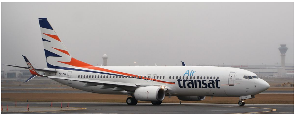
OK-TVV Boeing 737 Air Transit (Hybrid) Toronto 13/12/15 (Ian Morton)