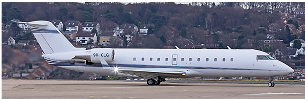
9H-CLG CRJ200 Stuart Robertshaw

Cessna 550 Citation YU-BTB dep 05:19 to Geneva , Cessna T206H G-NIME dep 09:44 to Blackpool, Challenger 850 9H-CLG arr 09:56 from Nice dep 11:19 to Palma, Cessna 550 Citation YU-BTB arr 13:02 from Geneva n/s, Cessna 525A CJ2 D-IPCC arr 15:56 from Jersey dep 16:42 to Egelsbach, Shorts Tucano ZF244 overshoot 16:00 as LOP55,