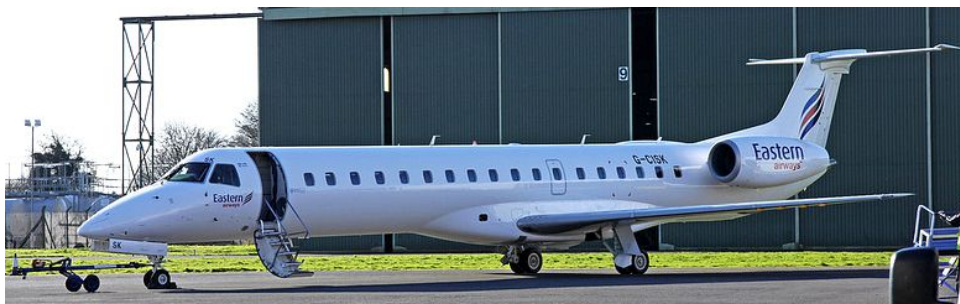
25 February G-CISK EMB145