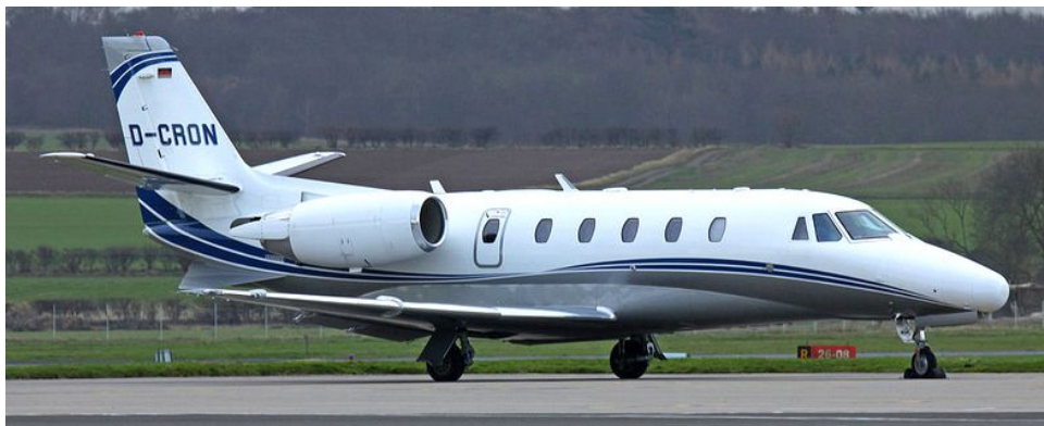
9 February D-CRON Citation Sovereign