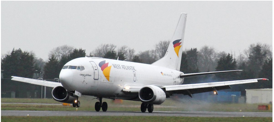
G-JMCM Boeing 737-300 West Atlantic Cargo 20/02

14th SP-ENI Boeing 737-400 Enter Air. Return of charter flight from 7th 15th D-CBIN SA-226TC Metro 2 Bin Air (F) Dep 15th UR-CNT Antonov AN-12 Ukraine Air Alliance. Dep 18th (F) (FV) 15th UR-82009 Antonov AN-124 Antonov Design Bureau (F) Dep 16th 16th G-EZIP Airbus A-319 EasyJet (T) 18th G-EZDC Airbus A-319 EasyJet (T) 20th G-JMCM Boeing 737-300 Atlantic Airlines/West Atlantic (F) (T)