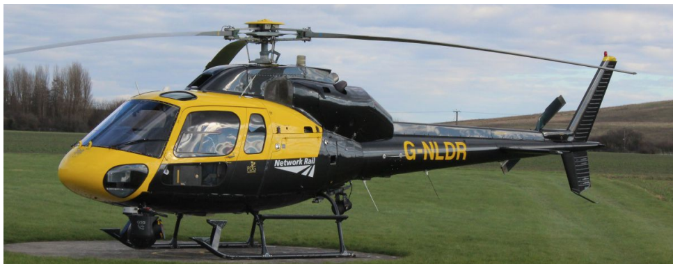
G-NLDR AS355F2 ECUREUIL 2 (On flying Scotsman Duty)