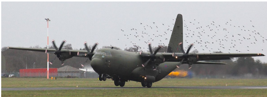
ZH883 C-130 Hercules RAF 20/02

2nd ZF293 Tucano (T) 4th ZF269 Tucano (T) 4th ZF291 Tucano (T) 8th ZF491 Tucano (T) 20th ZH883 C-130 Hercules on ground c.30 minutes engines running for a pick-up. Rtn later & Dep. 21st ZH883 C-130 Hercules made 2 visits again