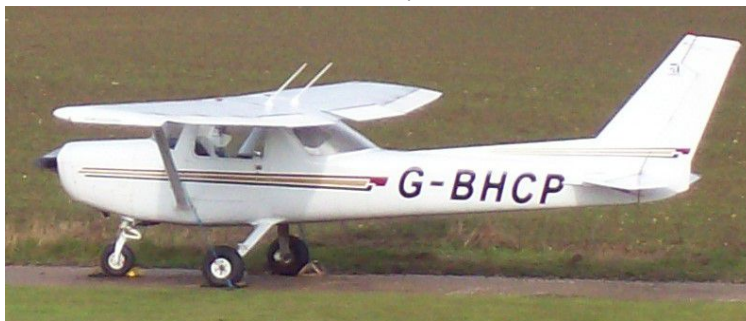
G-BHCP F152 Sturgate 05/03 - Normally out on lease