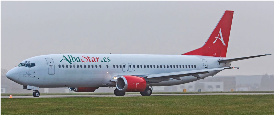
EC-LAV Boeing 737 Alba Star 13 Feb 2016 Stewart Robertshaw

13/2 EC-LAV(976P/5001) positioned in from Milan, operated out to Rome, 15/2 EC-LTG(5002) operated in from Rome, 20/2 EC-LTG(975P) positioned out to Grenoble.