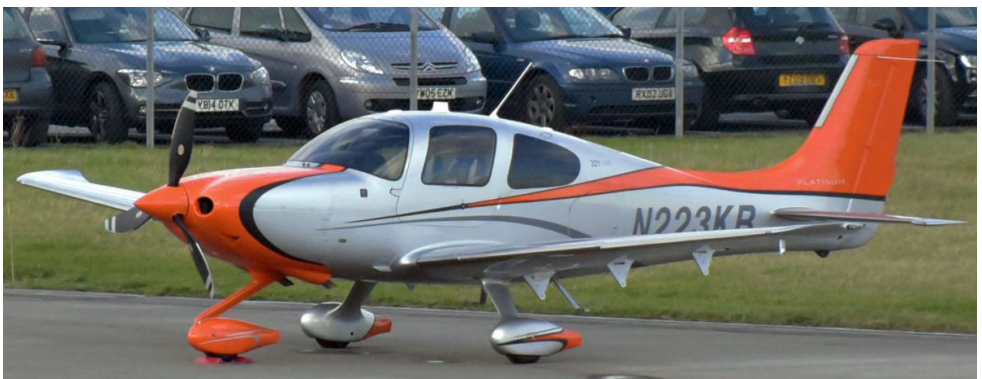
N223KB Cirrus SR22 11 February 2016 Rod Hudson