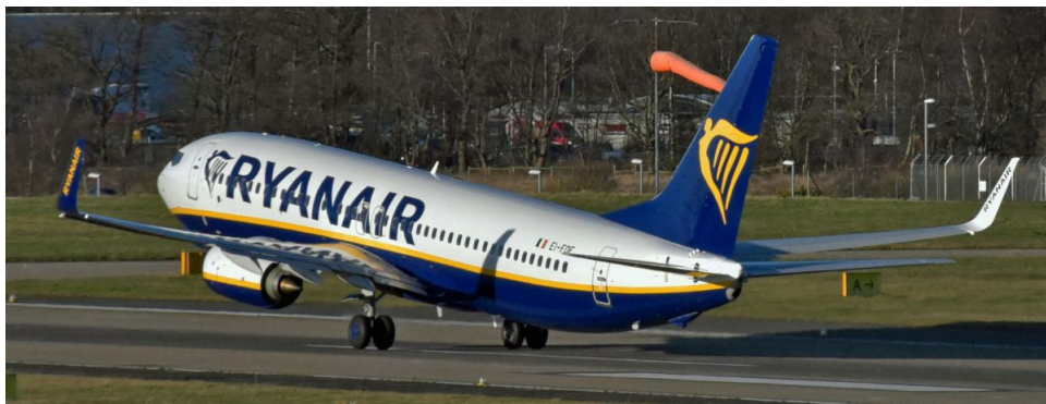
EI-FOF Boeing 737-*AS Ryanair 10 February Rod Hudson

Additional flights:-2/2 EI-EFD(247P) positioned in from Liverpool then departed to Lanzarote(691A).