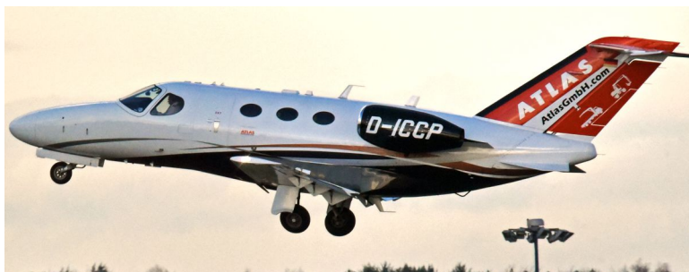
D-ICCP Cessna 510 Citation Mustang Rod Hudson

Cessna 510 Citation Mustang D-ICCP from/to Bremen (08:12/14:53), Cirrus Sr22 N223KB f/t Leicester (09:21/16:55), Cirrus SR22 N174MW f/t Leicester (10:51/15:57), Aerospatiale AS355NP G-DCAM stopped for 2 minutes arr 13:45 dep 13:47 arrive back 16:59 dep again 17:30 return 18:05 dep finally 18:51,