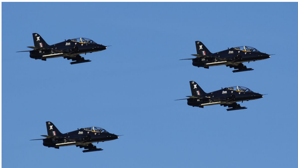
Hawks XX201, XX202, XX255 and XX339