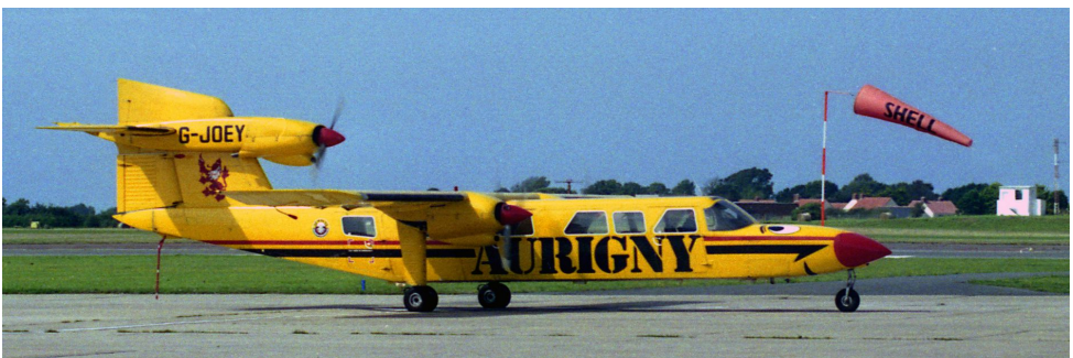
G-JOEY Trislander Guernsey Airport 1994