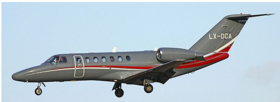
2 February LX-DCA Citationjet 3

1/2 M-ICRO Citationjet 3( East flight 08A) 2/2 LX-DCA Citationjet 3, G-LNCT MD.900 Explorer(Helimed 29A) 3/2 G-CILR G2 Cabri, G-OWST Cessna 172N, G-BOMP PA-28 4/2 ZZ416 Shadow(Widget 46, ILS), ZF140 Tucano(LOP 54, ILS) 5/2 F-HATG Citationjet 3 7/2 M-OTOR King Air 200 9/2 D-CRON Citation Sovereign(Silver Cloud 782), F-HATG Citationjet 3 10/2 ZK455/ZK460 King Air 200(Cranwell 74/67, training), G-DSKY DA-42(White Knight 02) 11/2 CS-GLF Global Express(Fraction 886G), M-TSRI King Air 90(Ambassador 910B) 12/2 D-CBCT Citationjet 4, F-HATG Citationjet 3, ZK336 Typhoon(Triplex 33, ILS) 14/2 G-GCVV Cirrus SR.22, G-BSYV Cessna F.150H 15/2 G-RJXG EMB.145(Midland 8208, Brighton FC to play Hull City) 16/2 G-RJXM EMB.145(Midland 9408, to collect Brighton FC), ZF343 Tucano(LOP 39, ILS) 18/2 F-HATG Citationjet 3, ZK460 King Air 200(Cranwell 67, training) 19/2 ZM405 A.400M Atlas(Ascot 409, training) 21/2 M-AXIM Cessna T.206H(n/s), G-CILN AW.139(Coastguard 187, n/s) 22/2 ZK458 King Air 200(Cranwell 74, ILS), ZF142 Tucano(Cranwell 08, ILS) 26/2 M-USHY Cessna 441, ZE375 Lynx(Armyair 962, ILS), SP-ENI 737/400(Enterair 4786) 27/2 G-LEAI Citation Mustang(Lonex 05LE), G-ROLY Cessna 172P, G-GHKX PA-28 29/2 XW216 Puma(Vortex 232), ZF343/170/407 Tucanos(LOP 4712/472/46, training)