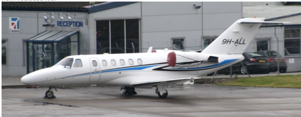
9H-ALL Citation 525A 02/02 Rod Hudson

Beech 200 Kingair G-PCOP arr 10:55 from Glasgow dep 13:33 to Cambridge as Gamma 218, Cessna 525A CJ2 9H-ALL dep 15:51 to Luton, Challenger CL605 M-FRZN arr 15:56 from Farnborough n/s, Learjet 60 M-DMBP arr 17:57 from Poznań dep 18:42 to Dublin, Beech 200 Kingair G-XVIP arr 18:11 from Toulouse n/s.