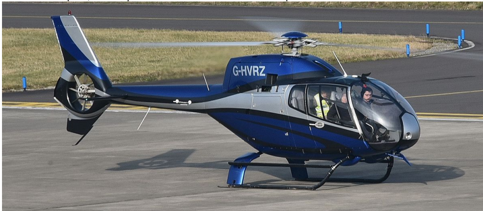
G-HVRZ Eurocopter EC120 14/02 Rod Hudson

BN-2T Defender ZH536 f/t Waddington (10:23/11:33), Cirrus SR20 N203CD arr 11:28 from Liverpool, Diamond DA-42 G-SUEI f/t North Weald (13:19/15:01), Eurocopter EC120 G-HVRZ arr 13:39 dep 13:44 to Liverpool, Eurocopter EC135 G-SENS arr 15:17 dep 16:43 to Battersea.