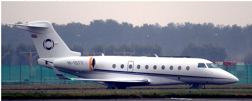
M-ISTY Gulfstream G280 Ineos Aviation 08/02