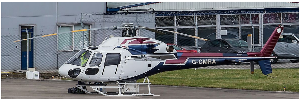
G-CMRA Aerospatiale AS355N 27/02 Stewart Robertshaw

Cessna 510 Mustang 2-MSTG arr 08:58 fr Leeds East dep 09:13 to Hawarden arr back at 19:04 from Guernsey and dep 19:21 to Leeds East, Aerospatiale AS355N G-CMRA f/ to Teeside (09:53/12:13), Challenger CL600 N222MC arr 14:13 fr Leipzig n/s, Cessna 680 Sovereign PH-CTR arr 16:59 from Le Bourget n/s,