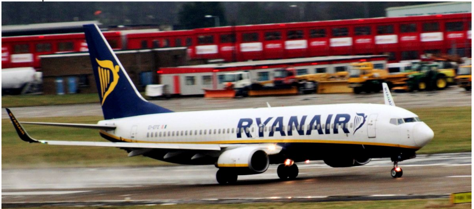
El-EFE Boeing 737-800 Ryanair 02/02 Rod Hudson

Other flights:-22/2 EI-DPD(15P/153) positioned in from Manchester, operated out to Dublin, 23/2 EI-EFF(92kf/96) arrived from Wroclaw/positioned out to Liverpool, EI-FRP(20DM/26) arrived from Warsaw/positioned out to Manchester.