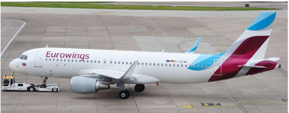
D-AEWC A320 Eurowings