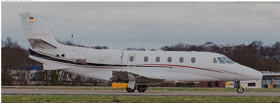
D-CGMR Cessna C560XLS 26/02 Stewart Robertshaw

Aerospatiale AS355N G-CMRA dep 10:00 return at 12:40, Cessna 560 Excel CS-DXV f/t Dublin (10:06/10:48) as NJE 961U/228A, Cessna 560 Excel D-CGMR arr 13:41 from Lyon dep 14:25 to Hawarden.