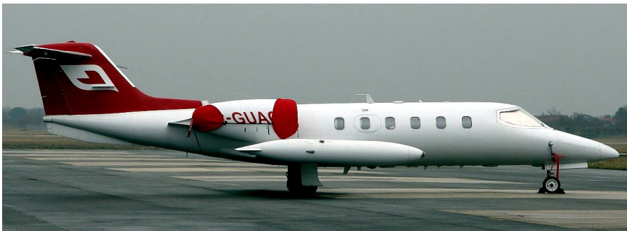
C-GUAC Learjet 35 Fox Flight Inc. 08/02