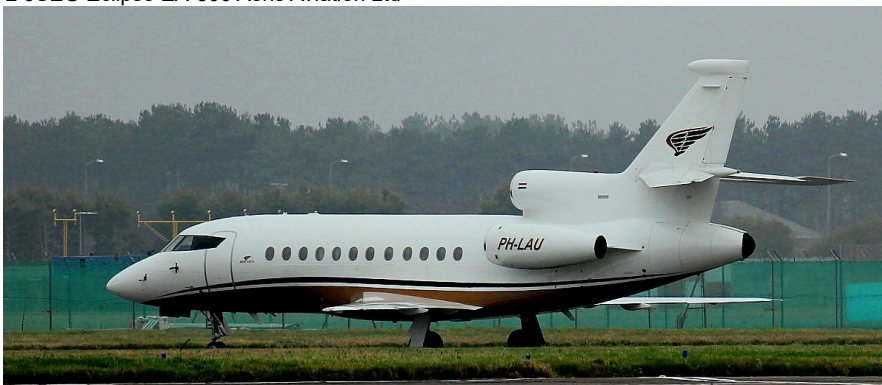
PH-LAU Falcon 900 IQ Air 18/02