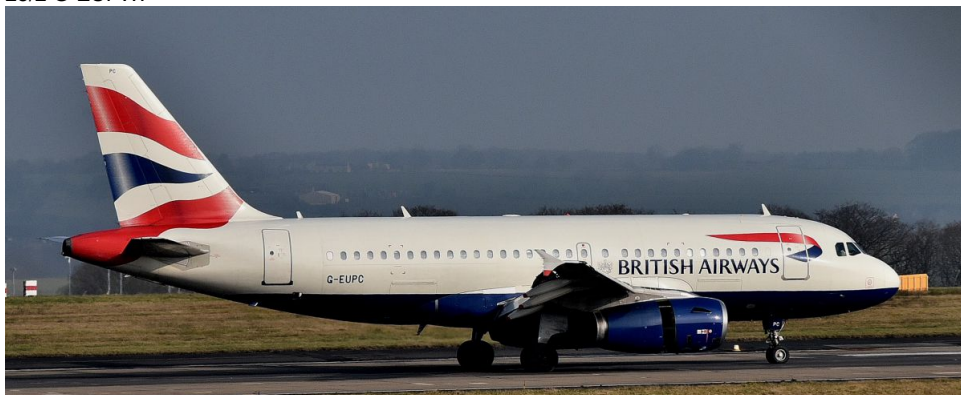
G-EUPC A319-131 British Airways 14/02 Rod Hudson

Heathrow (1346/1347, "20D/21V"):-1/2 G-EUPH, 2/2 G-EUPX, 3/2 G-EUPK, 4/2 G-EUPZ, 5/2 G-EUOH, 6/2 G-EUPW, 7/2 G-EUPG, 8/2 G-EUPE, 9/2 G-EUPX, 10/2 G-EUPH, 11/2 G-EUPA, 12/2 G-EUPJ, 13/2 G-EUPO, 14/2 G-EUPP, 15/2 G-EUOI, 16/2 G-EUPO, 17/2 G-EUPN, 18/2 G-EUOE, 19/2 G-EUPG, 20/2 G-EUPZ, 21/2 G-EUPF, 24/2 G-EUOD, 25/2 G-EUPB, 26/2 G-EUOG, 27/2 G-EUPX, 28/2 G-EUPW.