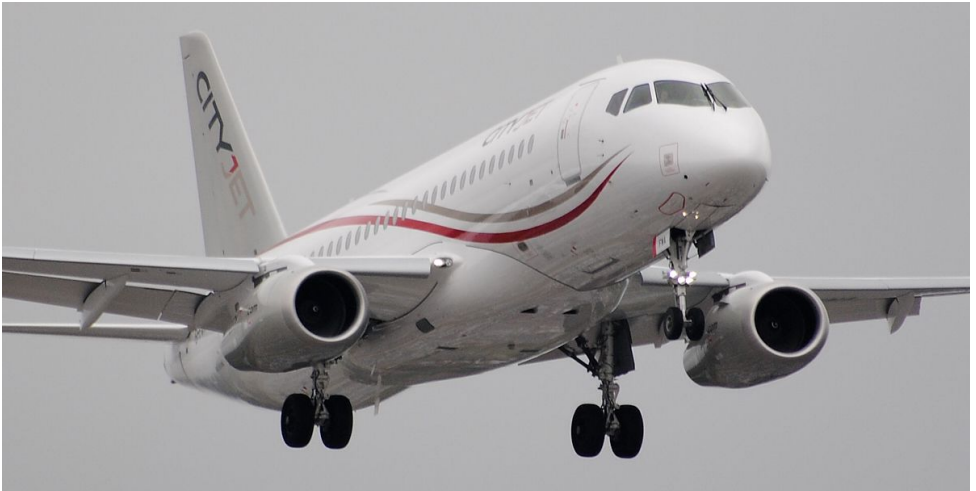
EI-FWA Sukhoi Superjet 100-95 CiyJet