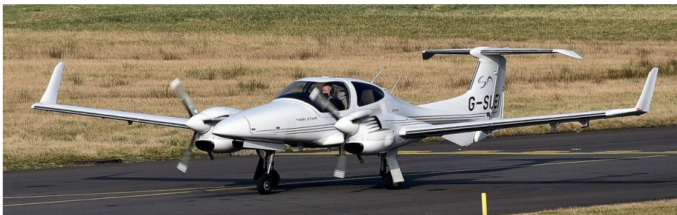
G-SUEI Diamond DA-42 Twinstar 14/02 Rod Hudson