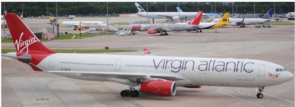
G-VKSS A330-300 Virgin Atlantic