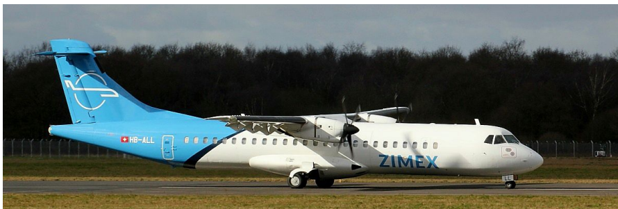
HB-ALL ATR 72 ZIMEX 24/02

24th HB-ALL A.T.R.-72 Zimex (F) (FV) of Airline