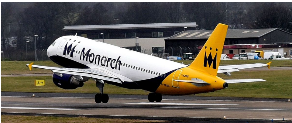
G-ZBAR A320-214 Monarch 21/02 Rod Hudson

One Airbus A.320 is based:- G-ZBAT1/2-21/2), G-ZBAH(21/2-28/2).