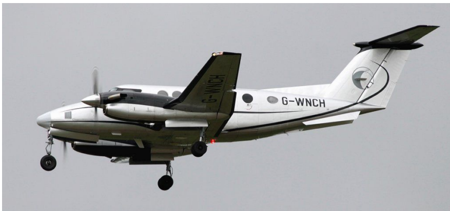
G-WNCH Beech 200 Super King Air 25/02