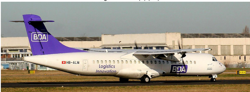
HB-ALM ATR 72 ZIMEX with BDA Titles 24/02

1st F-GZTK Boeing 737-400 ASL Airlines (F) operated all month with 19 flights & 1 Cnx 1st ER-BAM Boeing 747-400 Aerotranscargo (F) Dep. 1st N512JN MD11 Western Global Airlines (F) (FV) 1st RA-82078 AN-124 Volga Dnepr (F) (FV) Dep 2nd 5th SP-ENT Boeing 737-800 Enter Air. Rtn 12th (FV) 5th G-OOBF Boeing 757 Thomson 7th HA-TAD Saab-340 Fleet Air International (F) Dep 8th + Arr back 8th. Dep. 15th 9th ER-JAI Boeing 747-400 Aerotranscargo (F) Dep 10th 11th HA-LXB Airbus A-321 Wizz Air 12th G-CPEV Boeing 757 Thomson (FV) 13th ER-JAI Boeing 747-400 Aerotranscargo (F) Dep 14th 17th G-RJXB Embraer 145 bmi Regional Football related flight Brighton FC (FV) Dep 18th 19th SP-ENI Boeing 737-800 Enter Air. 19th G-OOBE Boeing 757 Thomson 21st G-EZEN Airbus A-319 EasyJet (T) +22nd & 28th 21st HA-LXC Airbus A-321 Wizz Air 21st ER-JAI Boeing 747-400 Aerotranscargo (F) Dep. 22nd 23rd SP-ENP Boeing 737-800 Enter Air. (FV) 24th HB-ALM A.T.R.-72 Zimex with BDA Logistics Titles (F) (FV) of Airline