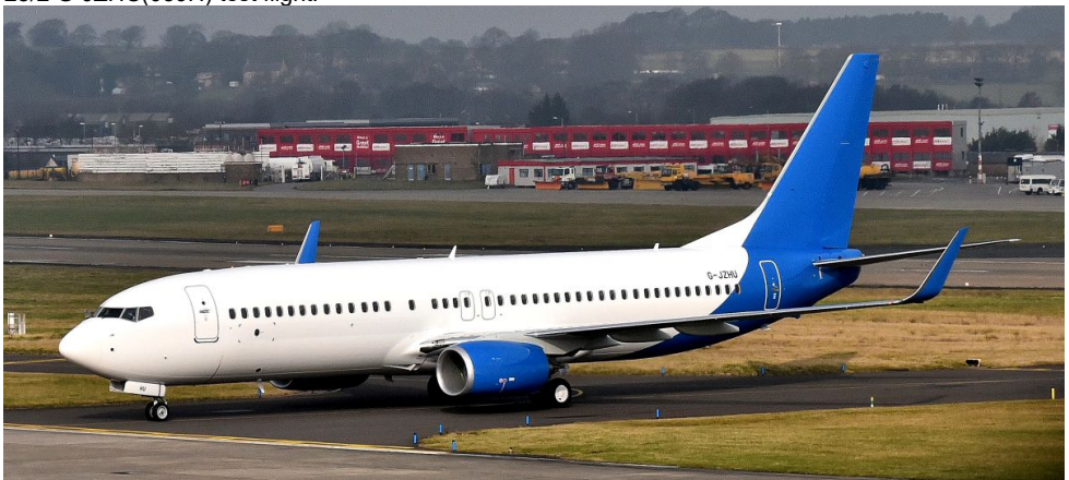
G-JZHU Boeing 737-8MG Jet2Holidays 14/02 Rod Hudson