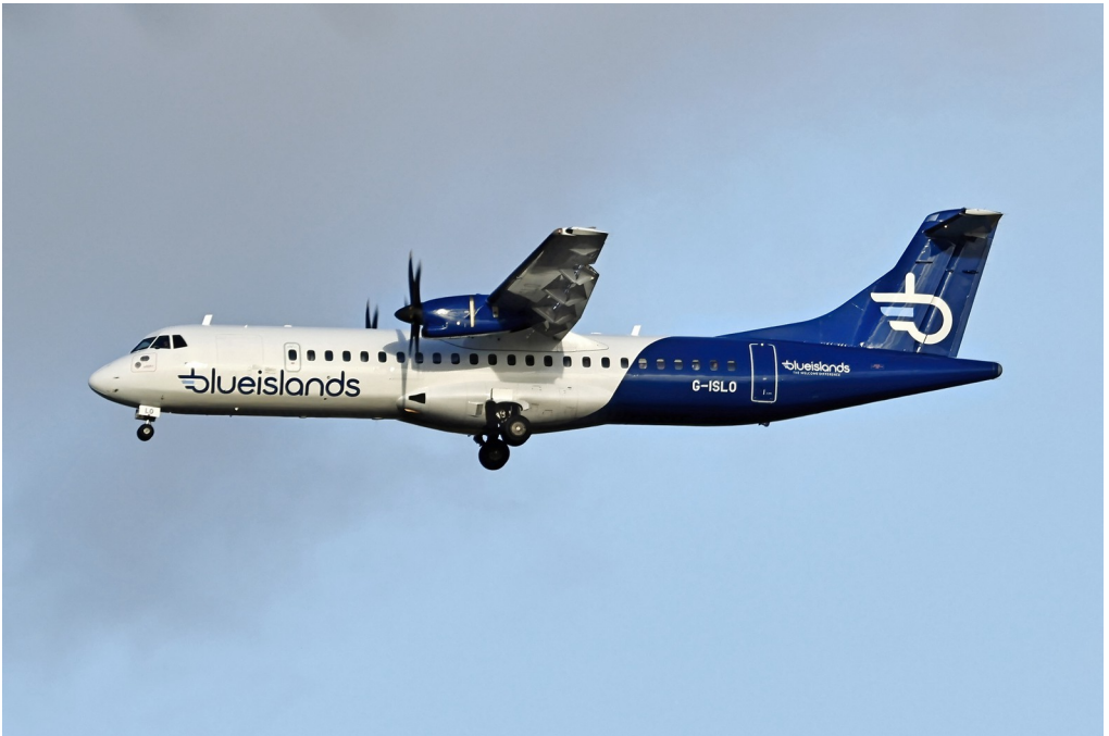
G-ISLO ATR72-500 Blue Islands 24/2 Paul Whincup

Enter Air (ENT/E4, “Enter Air”): -5/2 SP-ENO(3066) arrived in from Enontekio, then departed to Bournemouth.