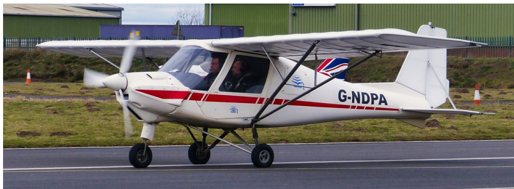
G-NDPA Ikarus C42 11/02