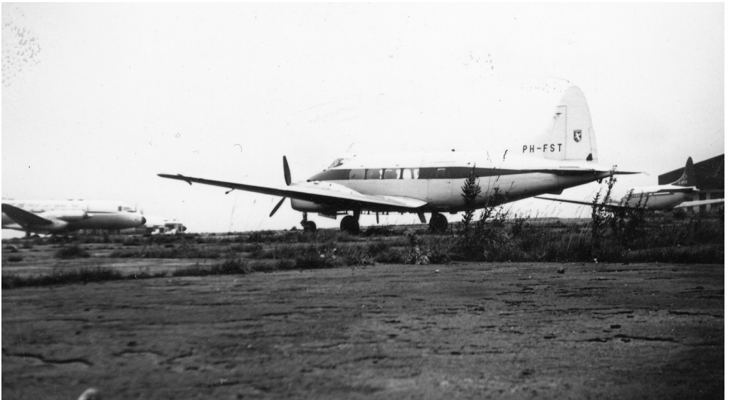
PH-FST Dove 6 LBA with Dove G-APVX Dove 6 of Leyland Motors. leads Resident for several years and Avro G748 G-ATAM in background c 1960s