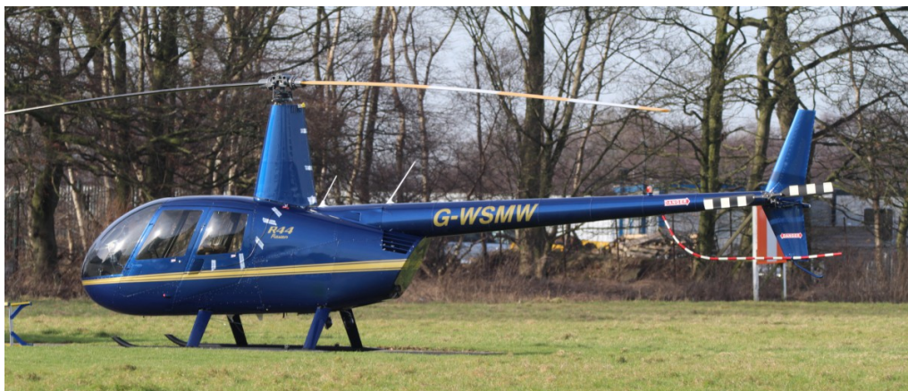
G-WSMW R44 Chunnel Plant Hire 08/02 Ian Gratton