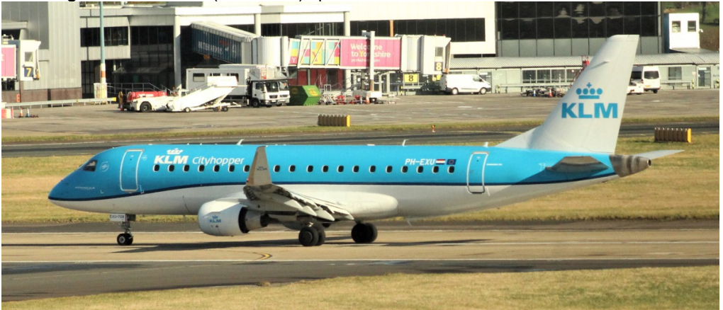
PH-EXU Embraer 170 KLM 23/02 Mike Storey

Other flights :-14/2 PH-EXL(1485/1486) operated in from/out to Amsterdam.