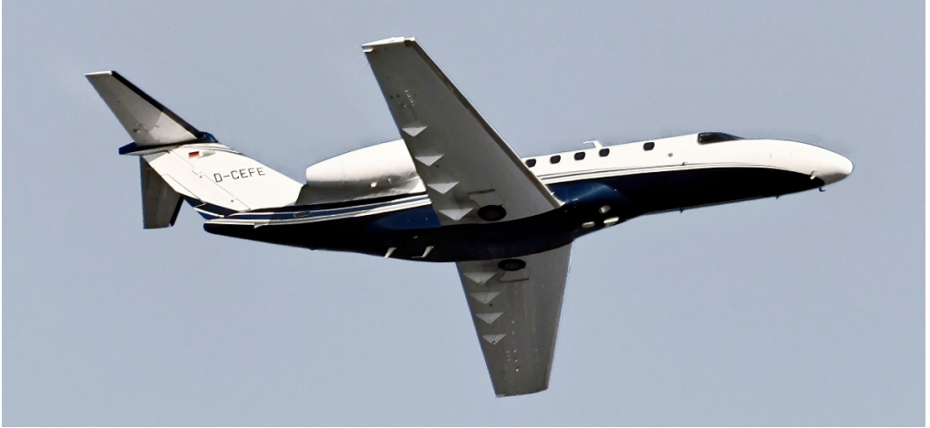
D-CEFE Citation 525 CJ4 14/02 Paul Whincup

Beech 200GT/250 Kingair G-REXA dep 09:55 to Jersey, Cessna 525C CJ4 D-CEFE arr 10:22 fr Geneva dep 13:14 to Farnborough, Cirrus Sr22 N575PW arr 12:46 fr Blackpool n/stop, Cessna 182 Skylane N759AU 2 x ILS approach at 13:43 fr Barton, Cessna 550 Citation Bravo G-IPLY arr 15:41 fr IOM dep 16:16 to Oxford, Learjet 45 M-ABGV arr 21:59 fr Stansted dep 22:38 to Seville,