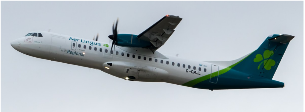
G-CMJL ATR72 Aer Lingus Regional/Emerald 10/02