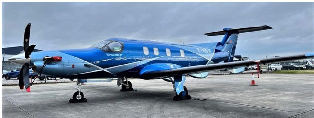
F-HGJF Pilatus PC XII 20/02 Multiflight

Pilatus PC XII F-HGJF arr 10:13 fr Geneva n/stop, Pa-28-161 Archer G-GGEM arr 15:02 fr Beverley n/stop, Challenger 350 N514FB arr 15:32 fr Farnborough n/stop, Cirrus Sr22 G-KMTE f/t Blackpool (15:59/16:52), Socata TBM940 T7-960 arr 16:31 n/stop, Cirrus Sr22 N575PW dep 17:01 to Oxford, Cessna 680 Latitude CS-LTU dep 17:40 to Luton.