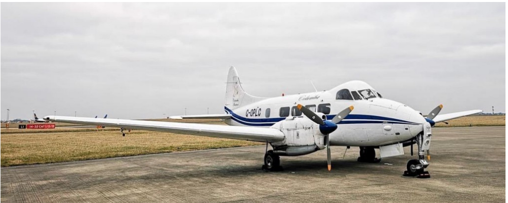
G-OPLC DH104 Dove 8 12/02 Multiflight

Phenom 300 CS-PHO dep 08:11 to Anney, DH104 Dove 8 G-OPLC arr 10:05 fr Weston n/stop, Cirrus Sr20 G-ZACK arr 14:03 fr RAF Woodvale n/stop, Cessna 560 Excel CS-DXK arr 15:59 fr Cannes dep 17:38 to Northolt, Beechjet 400 SP-TAT arr 16:54 fr Prestwick dep 19:17 to Geneva, Learjet 45 D-CSOS arr 17:50 fr Funchal n/stop,