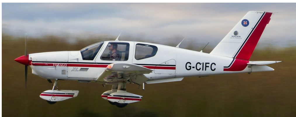
G-CIFC TB-20 Tobago 15/02