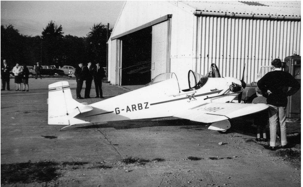
G-ARBZ Durine Turbulent Sherburn Tiger Club c 1960s