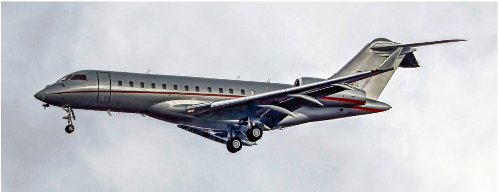
9H-VJH-Global 6000-Vista Jet- Note ram air turbine in outside position on nose, must be some sort of failure 15//02 Paul Whincup

EMB 550 Praetor 600 G-MCEN arr 09:05 fr Luton dep 11:21 to Faro, Cessna 510 Mustang F-HIBF arr 09:21 fr Le Bourget ret at 16:11, Cessna 560 Excel OY-JRU arr 10:33 Billund dep 11:15 Copenhagen, Phenom 300 CS-PHU arr 14:04 Luton dep 15:54 to Seville, Phenom 300 2-EMBR arr 14:16 fr Luton n/stop, Global 6000 9H-VJH arr 14:44 fr Le Bourget n/stop, Cessna 525C CJ4 D-CEFE arr 18:33 fr Farnborough n/stop.