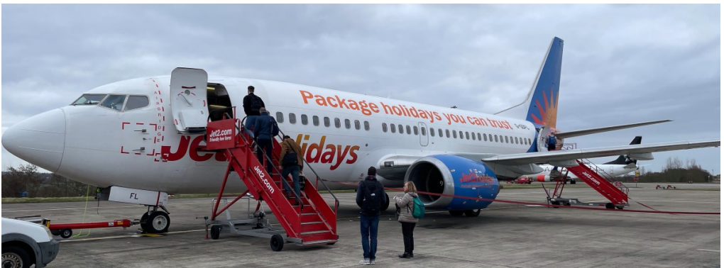
G-GDFL Boeing 737-300 Jet2.com 25/2 Ian Gratton