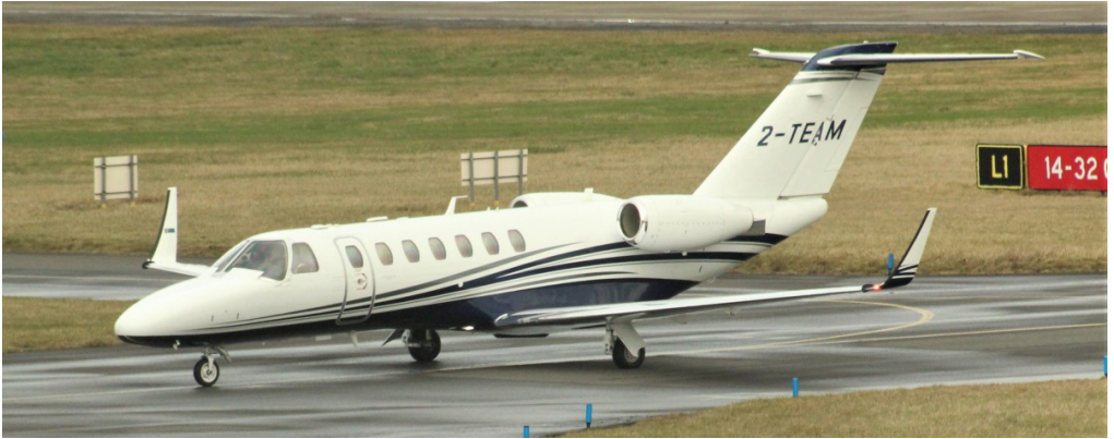
2-TEAM Citation 525B 28/02 Mike Storey

Pilatus PC XII LX-FLG arr 09:04 fr Luton dep 10:38 to Innsbruk, Learjet 45XR G-OSRL arr 09:15 fr Biggin Hill dep 09:55 to Bilbao ret LBA at 17:10 & dep 17:39 to Biggin Hill ret LBA at 17:55 & n/stop, Airbus A400M Atlas ZM405 3 x ILS approaches starting at 10:09 fr Brize c/s Grizzly488, Cessna 525B CJ3 2-TEAM arr 10:13 fr IOM dep 17:13 to Inverness, Hawker 800XP N535RV arr 14:06 fr ST Johns n/stop, Hawker 400XP SP-EAK arr 14:30 fr Birmingham n/stop, Cessna 525B CJ3 D-COKE arr 15:01 fr EDI n/stop, Legacy 650 D-ANXA arr 15:37 fr Rome dep 16:46 to Birmingham, Beech 350 Shadow R1 ZZ417 2 x touch and gos at 17:27 fr Waddington c/s Knight47, Beech 400 SP-TAT arr 17:47 fr Lisbon n/stop.