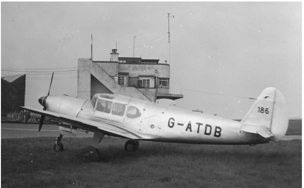
G-ATDB Nord 1101 LBA 29-05-65