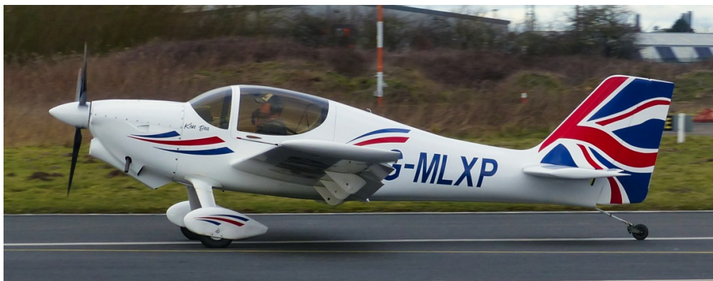
G-MLPX Europa 11/02