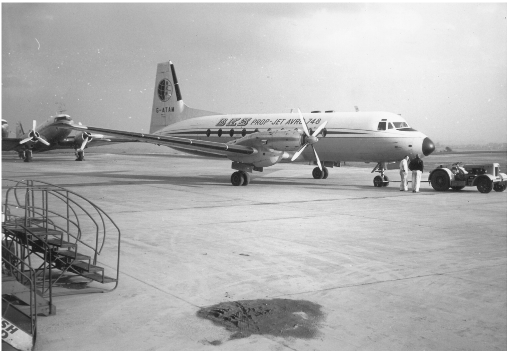
G-ATAM Avro 748 LBA c 1960s with Dakotas G-AMSH and G-APPO in the background