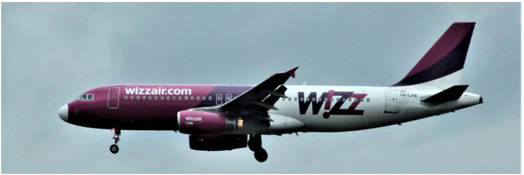
HA-LPR Airbus A320 Wizz Air 04/02