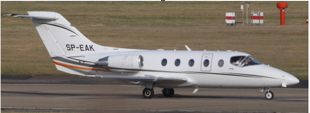
SP-EAK Hawker 400XP 08/02 Ian Gratton