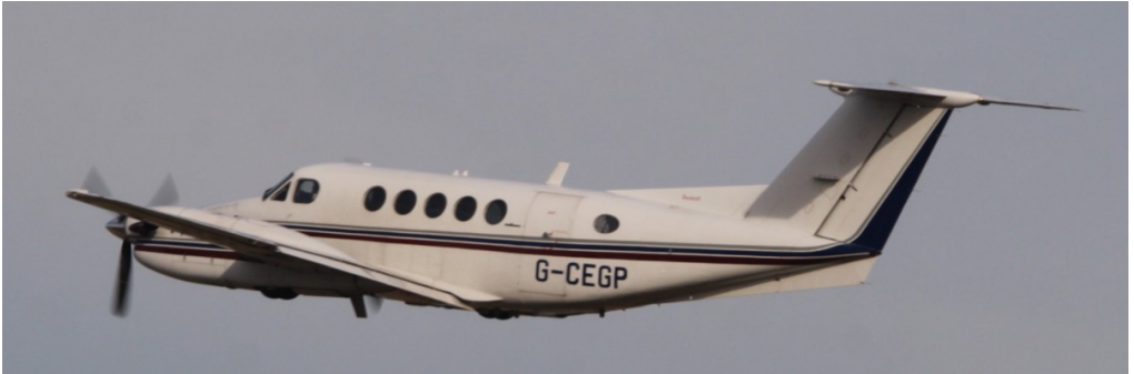
G-CEGP Beech 200 Kingair 08/02 Ian Gratton