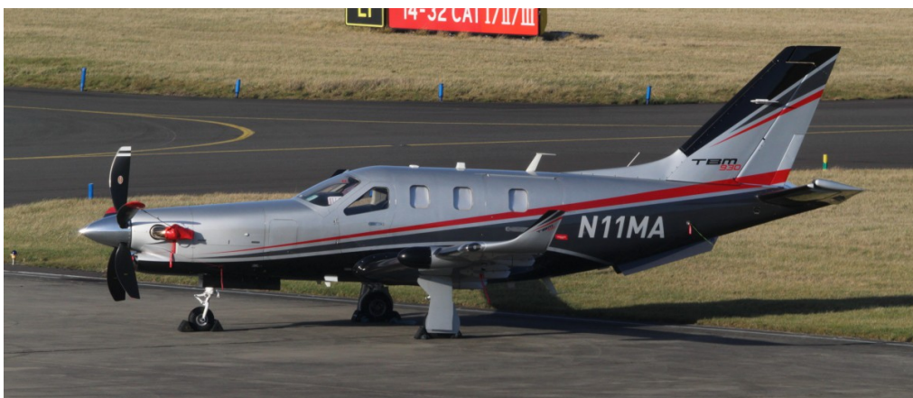
N11MA TBM930 23/02 Ian Gratton