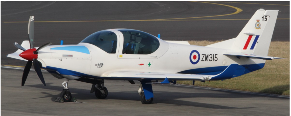
ZM315 Grob G120TP Prefect 08/02 Ian Gratton