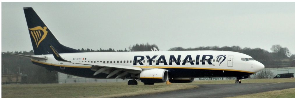
EI-EVH Boeing 737-800 Ryanair 08/02 Mike Storey

Warsaw (1932/1933, "749M/1933", Mon):-6/2 SP-RZO, 13/2 SP-RZL, 20/2 SP-RZF, 27/2 SP-RKG.