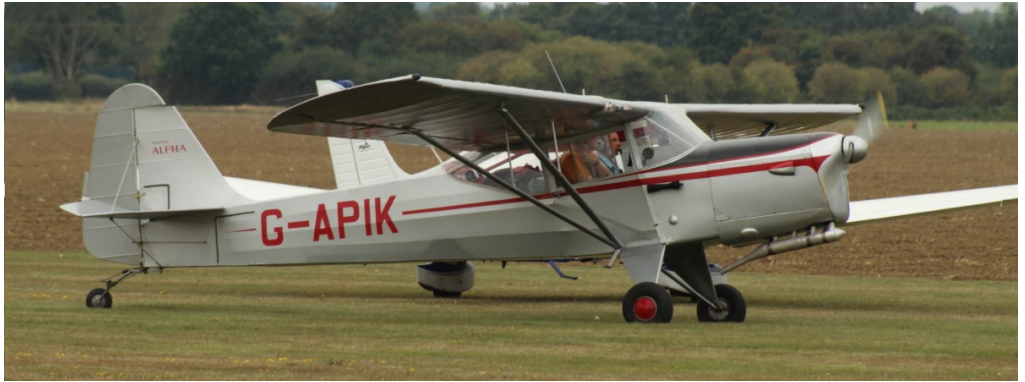
G-APIK Auster Alpha 23/08