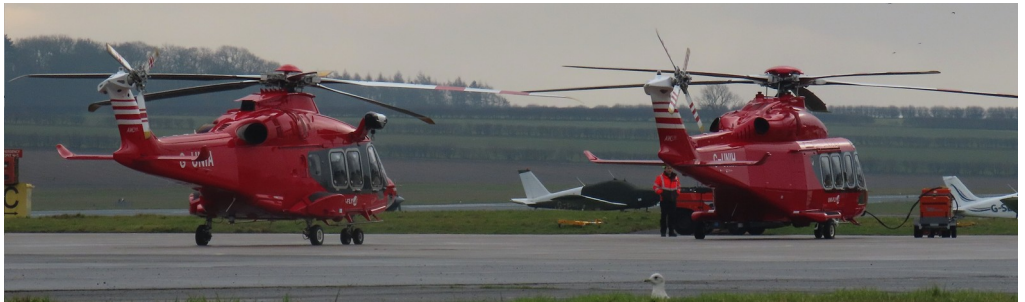
G-UNIA/G-UNIH AugustaWestland AW169