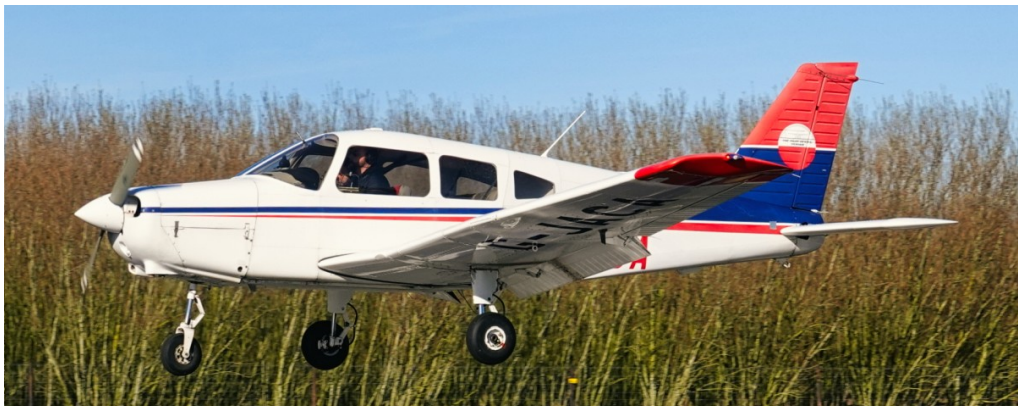
G-FLYO EV-97 Eurostar 14/02

28/02 G-CGCH SportCruiser f/t Mount Airy and G-INXS R22 f/t Gamston