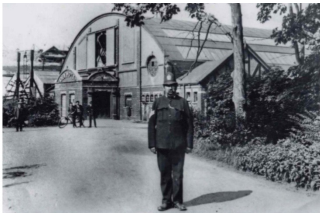
The Oakwood site of the Olympia Works, guarded by a very serious looking policeman