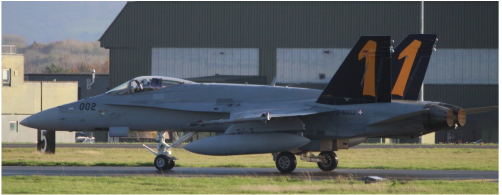
G-5002 McF Douglas Fa-18C Hornet