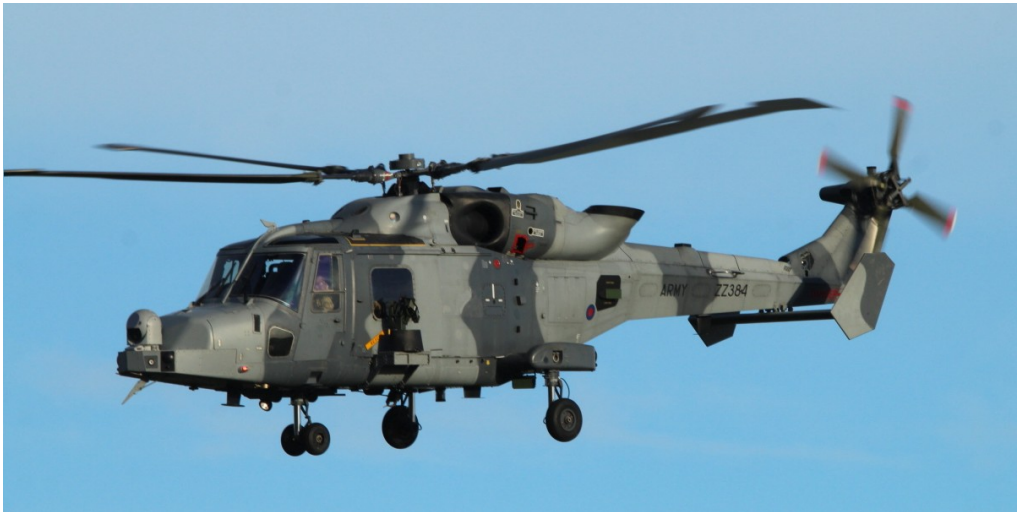
ZZ510 Wildcat AH1-AAC