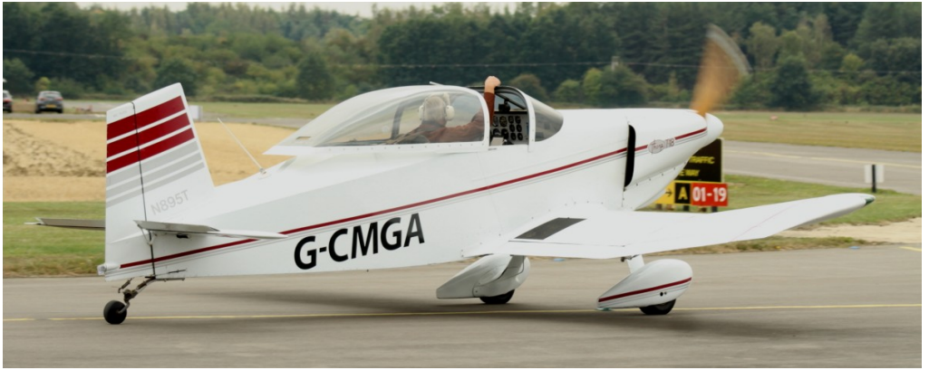
G-CMGA Thorp Tiger 23/08