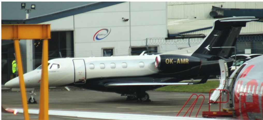
OK-AMR Embraer Phenom 300 24/02 Mike Storey

CE 525A OE-FXM dep 08:45, CE 340 N789MD arr 09:01 dep 09:50, Beechjet 400 SP-TAT dep 09:54, CE 650 OY-CLP arr 14:26 dep 15:27, Praetor 600 G-FHFX arr 15:41 dep 21:48, Global XP CS-GLF arr 17:42 dep 18:54, Praetor 600 9H-JFX arr 18:01 dep 19:39, CE 560XL G-NJAK arr 19:35 dep 21:27, CE 525A D-ISJA arr 21:14 n/stop.