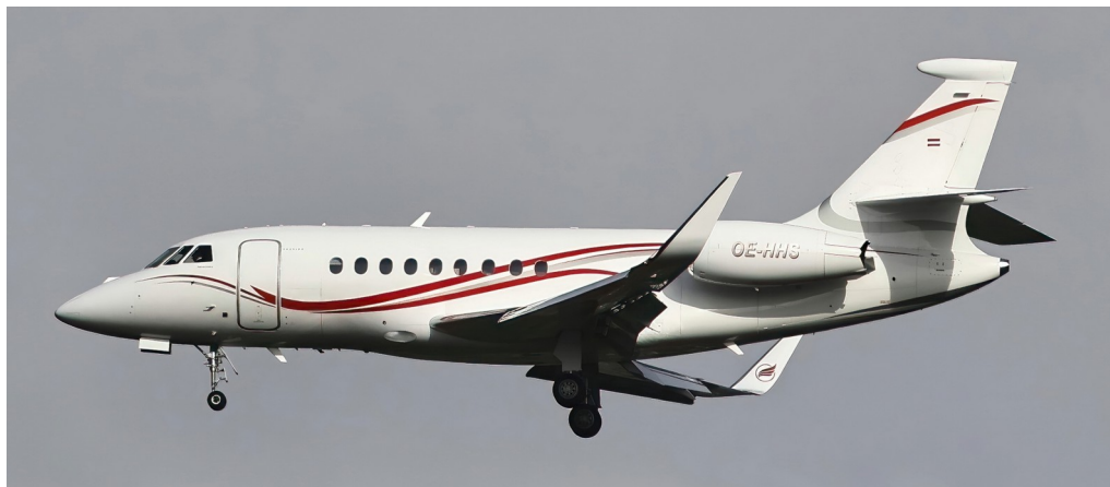
OE-HHS Falcon 2000 21/02 Paul Whincup

CE 560X G-GAAL arr 08:09 dep 14:25, Falcon 2000LX OE-HHS arr 12:57 dep 13:53, Beech 200 G-SASD arr 13:05 dep 15:33,