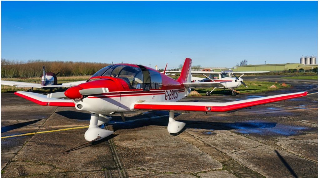
G-BBCS Robin Major 14/02