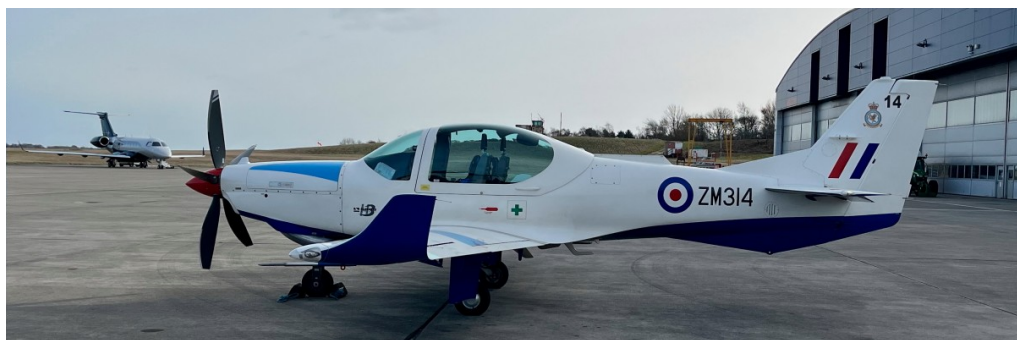
ZM314 Grob Prefect RAF 17/02 Ian Gratton