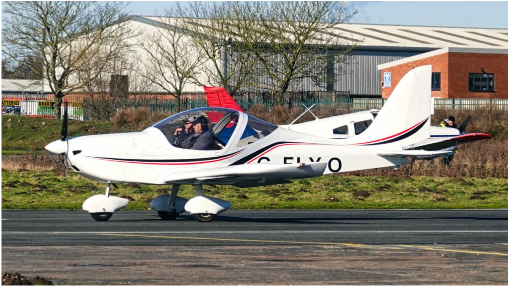
G-FLYO EV-97 Eurostar 14/02