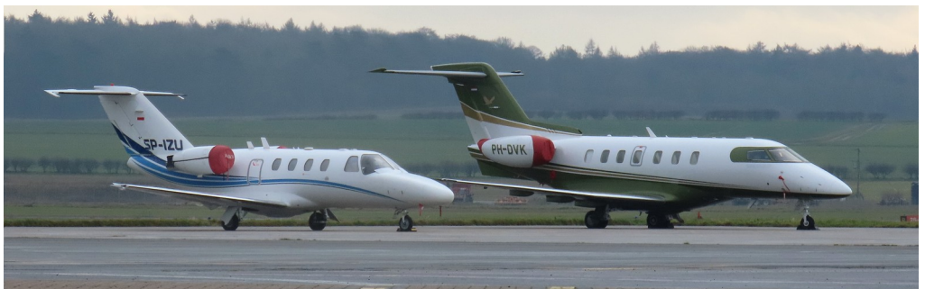
SP-IZU Cessna 525 CitationJet CJ1 and PH-DVK Pilatus PC-24