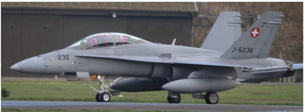
J-5236 McD Douglas FA-18D Hornet