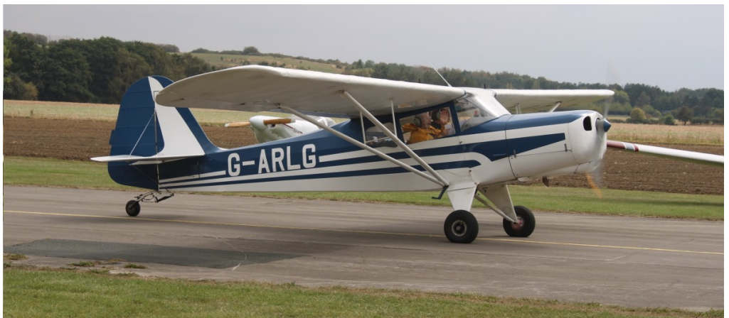
G-ARLG Auster D4 23/08