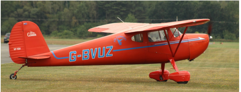
G-BVUZ Cessna 120 23/08