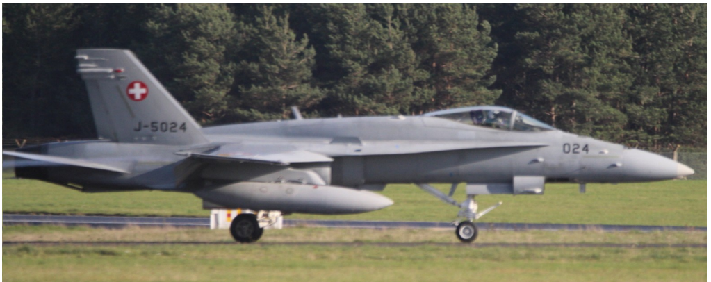
G-5024 McD Douglas FA-18C Hornet