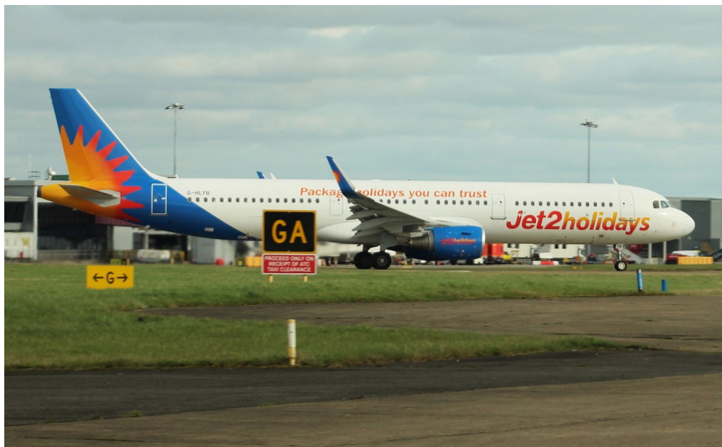
G-HLYB A321 Jet2.com 24/2 Mike Storey

Only positioning/test/training flights shown:-1/2 G-JZHM(010P) positioned out to Newcastle, 2/2 G-JZHM(041A) positioned in from Chambéry, 5/2 G-GDFK(13C) positioned out to Edinburgh, G-JZBA(098C) positioned out to Edinburgh, G-JZBJ(086C) positioned out to Edinburgh, 6/2 G-DRTO(071W) positioned in from East Midlands, 8/2 G-JZBA(99C) positioned in from Edinburgh, G-GDFK(14C) positioned in from Edinburgh, G-JZBJ(87C) positioned in from Edinburgh, 12/2 G-GDFO(35F) training flight to Shannon, 14/2 G-GDFF(31F) training flight to Liverpool, 18/2 G-JZHD(62J) positioned in from Liverpool, G-JZBB(39R) positioned in from Tenerife, 22/2 G-JZBP(50B) training flight to Newcastle, G-JZBV(68J) positioned in from Stansted, 23/2 G-DRTI(61J) positioned out to Tenerife, 24/2 G-HLYB(49A/239/240/48A) positioned in from Manchester/ departed to Malta/arrived back from Malta, then positioned out to Manchester, 25/2 G-GDFS(37F) training flight, 26/2 G-JZBE(39E) positioned in from Teesside, 27/2 G-GDFS(59B) training flight, 28/2 G-GDFW(32K) positioned out to Teesside.