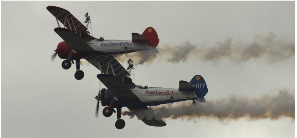
N5075V G-IIIY Boeing Kaydet Wingwalkers 23/08