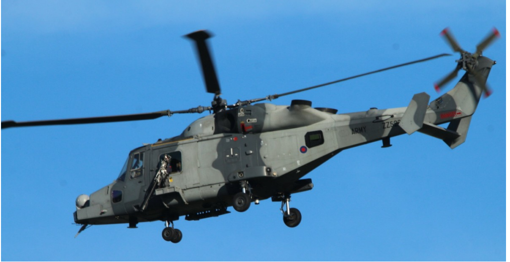
ZA523 Wildcat AH1-AAC