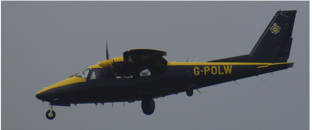
Vulcanair P.68R Victor