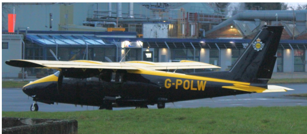
G-POLW Vulcanair P68R 01/02 Mike Storey

Pilatus P68 G-POLW arr 16:18 for fuel dep 16:53,