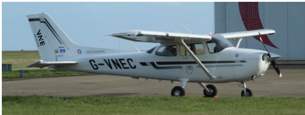
G-VNEC Cessna 172 VNE Aviation 17/02 Ian Gratton

Grob G120TP ZM305 arr 11:43 dep 14:39, Grob G120TP ZM314 arr 11:56 dep 15:21, Challenger 350 9H-VCO arr 14:27 dep 16:16, Falcon 7X D-ARIE arr 18:47 n/stop.