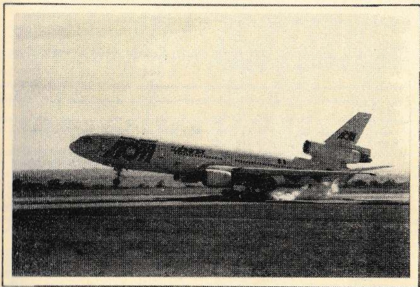
AOM DC10 F-ODLX arrives L.B.A.