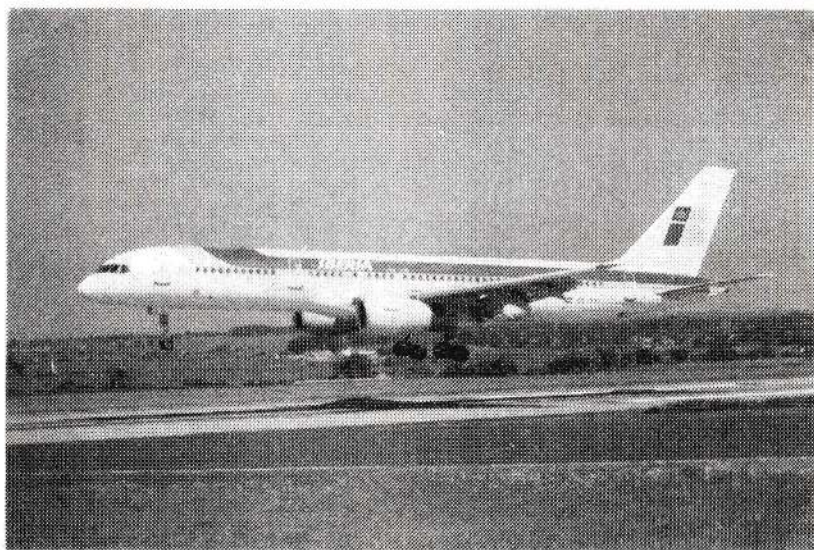
IBERIA B757 EC-FUX