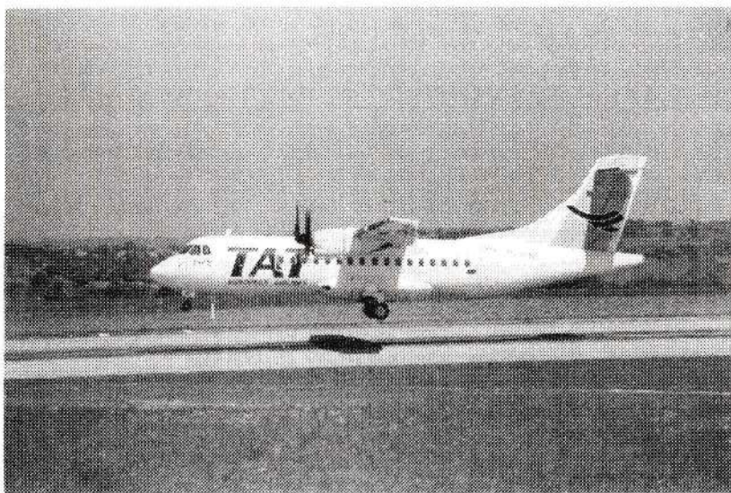
TAT ATR42 300 F-GKNC