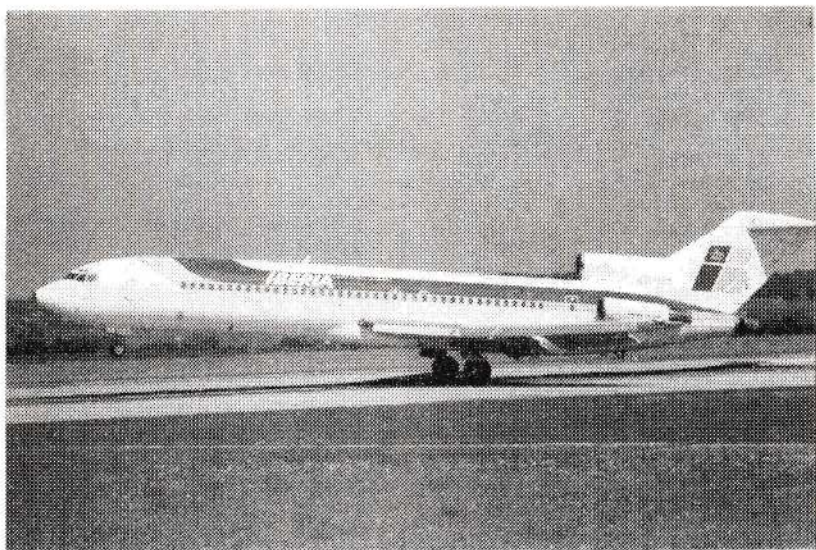
IBERIA B727 EC-CA3