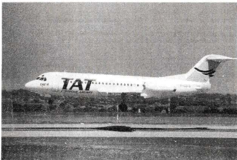
TAT FOKKER F28 F-GDUS