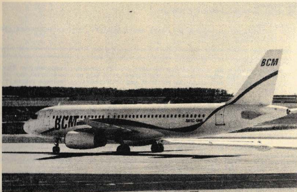
A320 Airbus EC-GNB at Humberside Airport - May 98