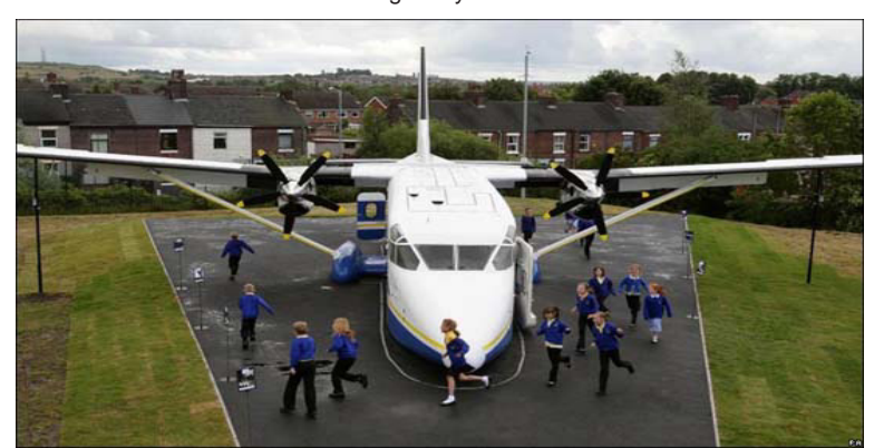
or.....(B) TURN IT INTO A SCHOOL CLASROOM G-SSWE Shorts 360 formerly operated by BAC Leasing Stoke on Trent primary school