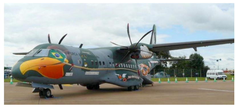
2811 C-105A(CASA 295) Brazillian Air Force(Special Scheme) at Fairford(RIAT) 18/07/09