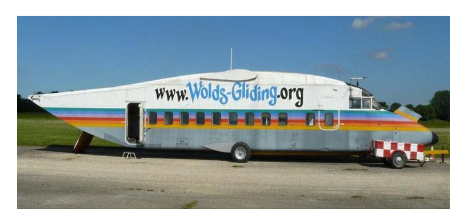
either......(A) TURN IT INTO YOUR CLUB HEADQUARTERS OY-MUB Shorts 330 formerly operated by MUK-Air.