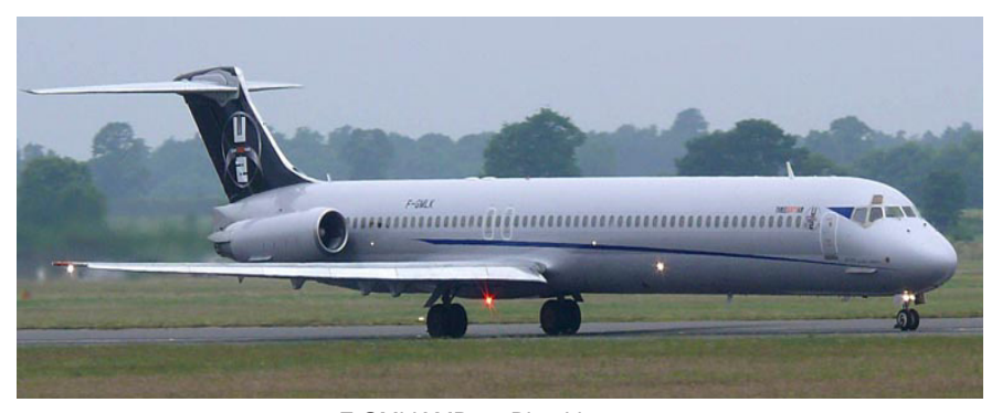
F-GMLK MD-83 Blue Line Painted in special scheme for use by U2 on European tour Doncaster 26/06/09, operating a pilgrimage flight to Lourdes