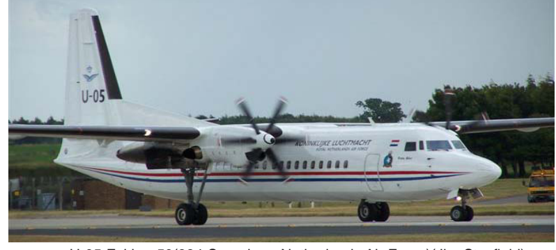
U-05 Fokker 50(334 Squadron, Netherlands Air Force)(Jim Stanfield)