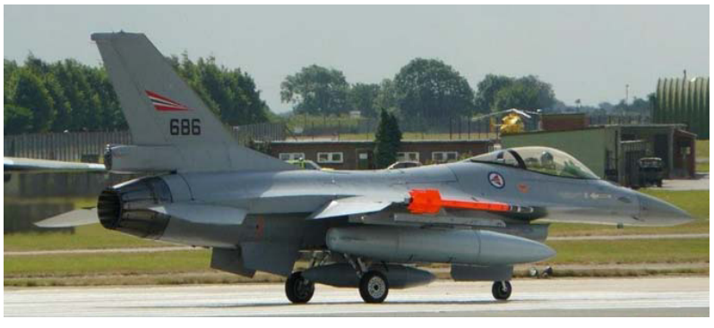
686 F-16AM FIGHTING FALCON(331 Skv, Norwegian Air Force)(David Senior)