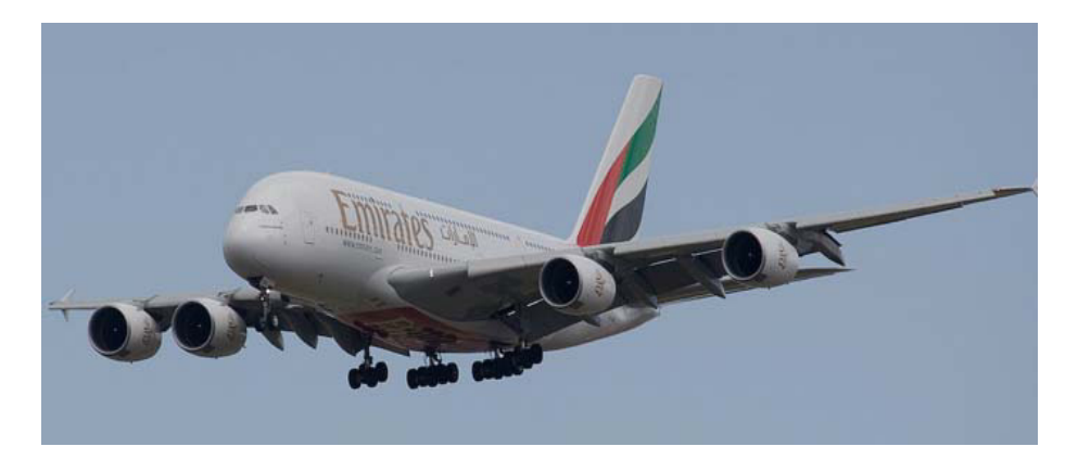
A6-EDD Airbus A.380 of Emirates landing at Heathrow 10/07/09