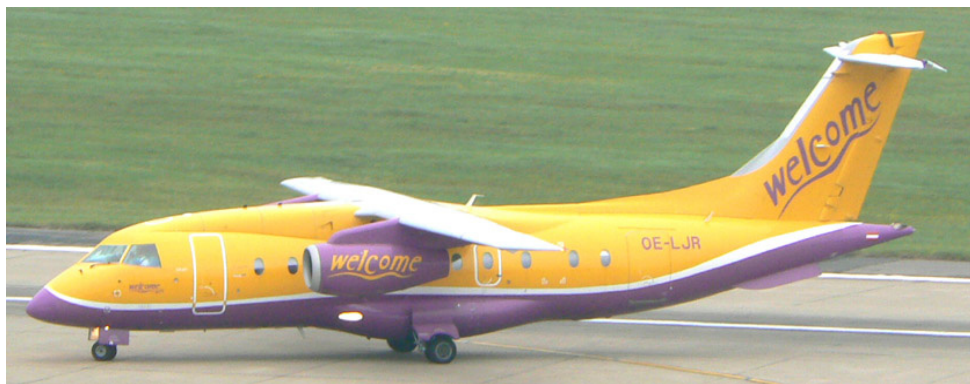
OE-LJR("Aurora") Dornier 328 Jet of Welcome Air, operating an ambulance flight, 4/6

MILITARY:- Islander ZH537 (Ascot 7991), f/t Waddington(2155/2222) again for fuel while on local patrol.