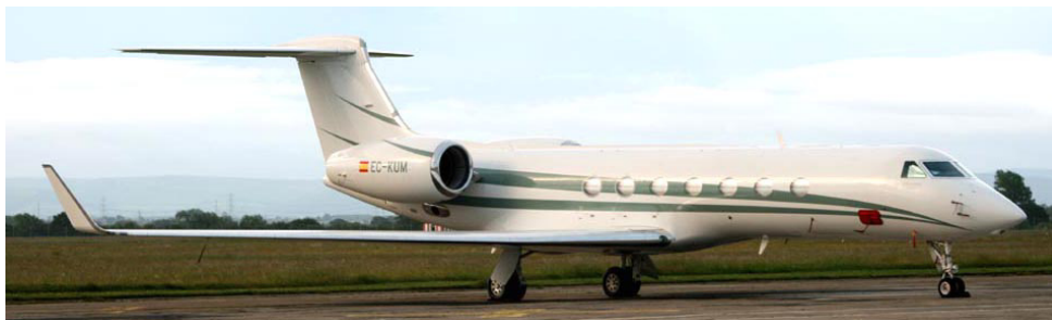
Operated by TAG Espana, Global Express EC-KUM visited Teesside on 21/6

23/6 YU-BZM Citation XLS(Air Pink), N352CM PA-46 Malibu, XR808 VC-10(Tartan 45, ILS) PH-LCG Falcon 900B(Solid Air 678), G-BYHG Dornier 328(Eastflight 65L) 25/6 CS-DXR Citation XL(Fraction 219D), G-LCYF Embraer 190(Flyer 24N) 26/6 EC-LIO Hawker 400XP(Flying Olive 472), CS-DMY Hawker 400XP(Fraction 7TN) 27/6 N711EG Gulfstream 4, G-GHPG Citation Bravo(Marshall 03C), G-NIME T.206H 28/6 OY-NPF Metroliner(Norflying 112), G-KKEV DASH-8-400(Jersey 29T, Training) 29/6 G-CDLT Hawker 1000(Gama 614), G-HPY Lear Jet 45, EI-GJL Dauphin 30/6 N9105C Cessna 182T, G-CGUZ Citationjet 2(Gama 896)