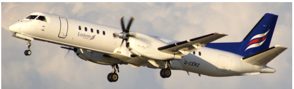
G-CERZ SAAB 2000, Eastern Airways. Leeds/Bradford International(Paul Whincup)