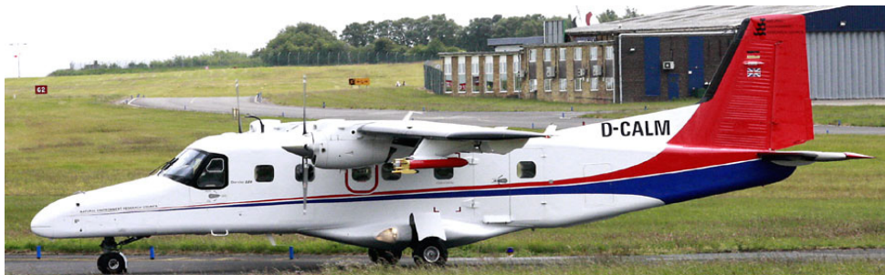
Dornier 228 D-CALM owned by DLR Flugbetrieb taxiing for take off, 17/6

GENERAL AVIATION:- Cessna T.303 G-DOLY from Biggin Hill(1039) to Hawarden(1238). Cirrus SR.22 N40GD from Sherburn(1043) to Andrewsfield(1043), return 1646/1732. PA-28 Warrior G-BGPH from Biggin Hill(1236) to Sutton Bank(1539). King Air 200 G-BYCP (Lonex 86CP) from Biggin Hill(1521), n/s to Edinburgh(1435).