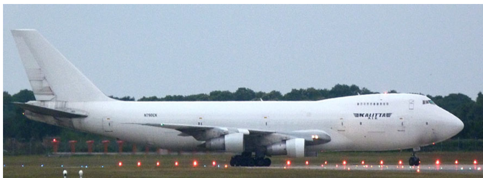
Colourless Boeing 747 N790CK of Kalitta Airways at Doncaster, 20/6

Fadmoor:- Resident PA-32 N116KY was badly damaged in an incident on 1/7 while landing at the Gatwick Air Museum strip at Charlwood, having departed from Rufforth. The aircraft overshot the strip and collided with a vehicle, believed to be an HGV, before hitting one of the display aircraft, ripping a section of the wing off. Three people were injured.