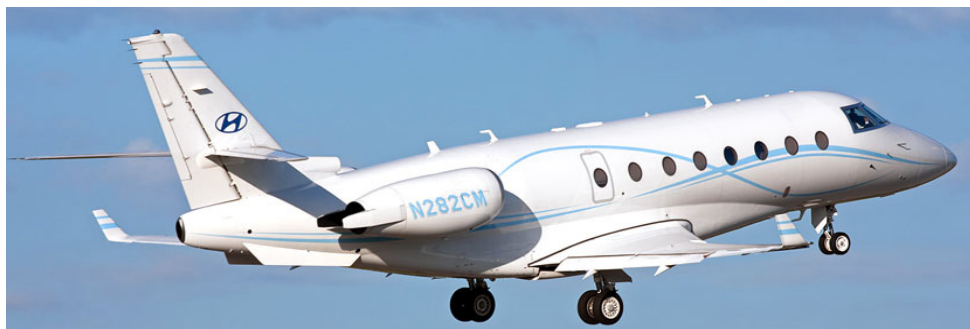
IAI Galaxy N282CM departing Runway 14 for Spain on 26/6(Robert Burke)

GENERAL AVIATION:- King Air 200 G-IMEA from Scampton(1242) to Sion(1317). TB.20 Tobago G-IGGL f/t White Waltham(1311/1234), n/s. PA-31 Chieftain N5LL arrived from Tollerton(1802) and is a temporary resident to be operated by Jet2 while their example G-IFIT is on maintenance.