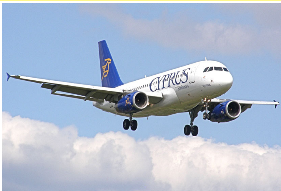
5B-DCN Airbus A.319, Cyprus Airways Manchester International Airport, 20/06/11 Alan Sinfield