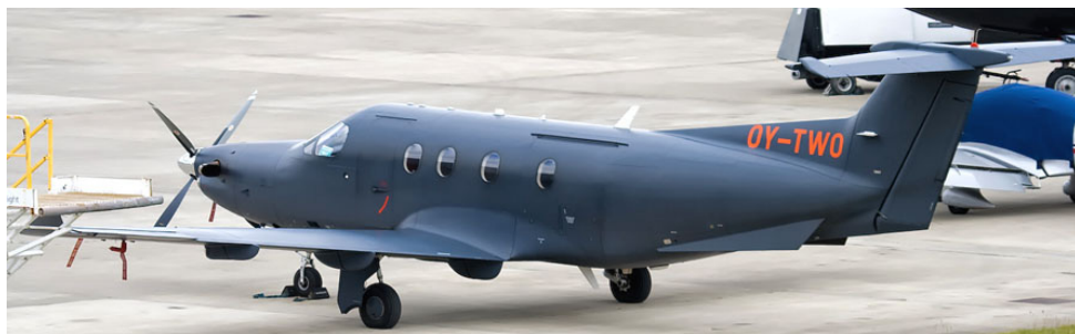
Wearing a rather stark colour scheme, PC-12 OY-TWO visited on 15/6(Martyn Gill)