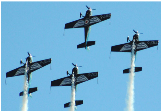
Also performing at the Scarborough Armed Forces Day were the Blades Formation Team with their Extra 300s

York(Murton):- Former resident Gazelle G-DMSS/XW858 has been sold to new owners in Haverhill and re-registered G-ONNE. Flying locally on the evening of 2.7 and the early morning of 3.7 was G-CCWE LBL.330A Hot Air Balloon.