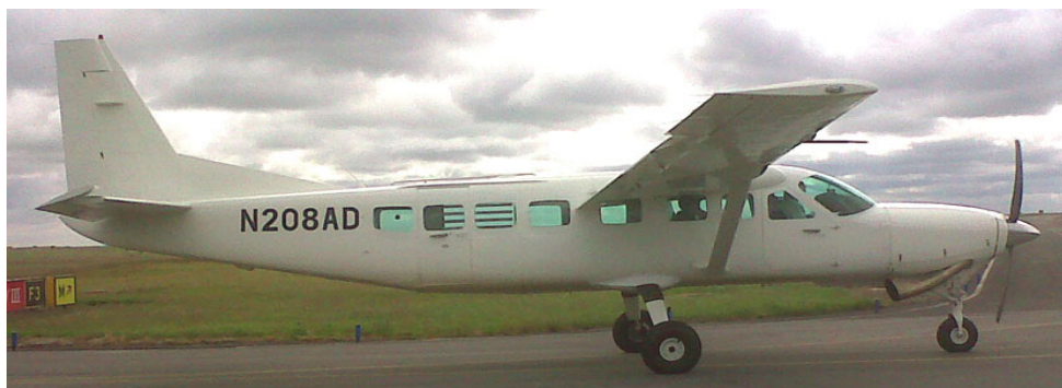
Cessna 208B Caravan N208AD used for para-dropping on 23/6 and 24/6(Steve Lord)

GENERAL AVIATION:- Twin Squirrel G-ORDH from Nun Monkton(0911) to Bagby(0913). King Air 200 G-FRYI (Lonex 53FR) from Stapleford(1119) to Biggin Hill(1308). PA-31 Chieftain G-PZAZ (Air Med 036) from Inverness(1407) to Oxford(1704). Beech A.36 D-ECHE from Southend(1847), n/s to Augsburg(0746).