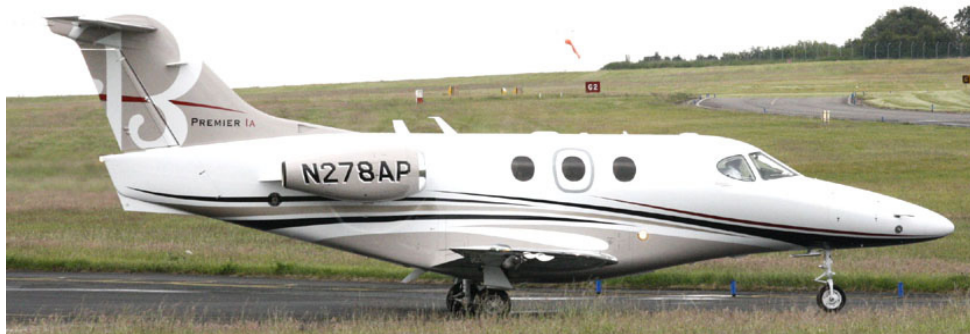
Premier 1 N278AP of Hansengroup Aviation, taxiing to Multiflight, 23/6

GENERAL AVIATION:- Cessna 208B Caravan N208AF from Peterborough/Sibson(1414) to Blackpool(1532), after parachute drop at Headingley before Yorkshire's 20/20 match. Agusta A.109A G-DWAL from Skipton(1711) to Middleham(1742). King Air 200 G-CEGP (Cega 708) from Ronaldsway(2002) to Bournemouth(2210).