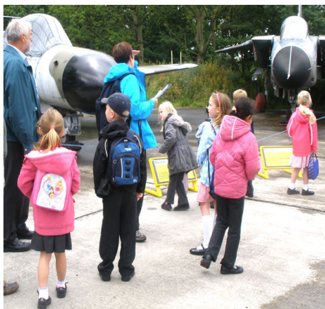
Your editor(left photo) pointing out the complexities of a Dart Herald, while The Chairman(right photo) contemplates why a Tornado has "a pointed nose"!!