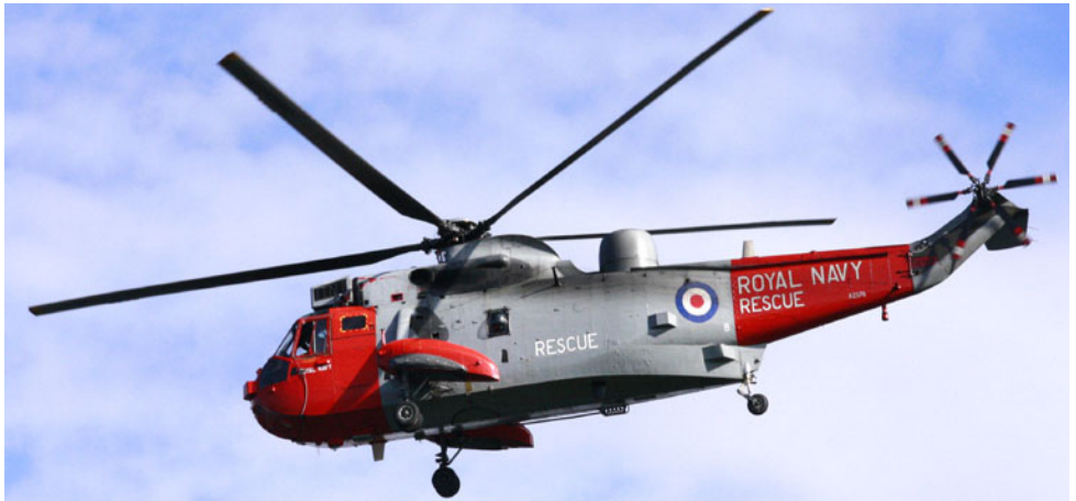
XZ578 Sea King, Royal Navy/Rescue. Isle of Skye, 05/07/11(Mike Storey)