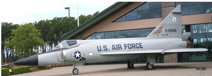
56-1368 F-102A Delta Dagger