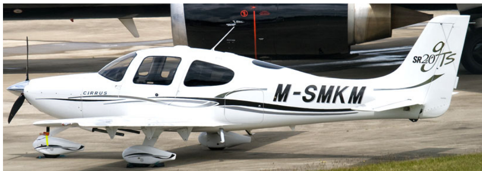
Cirrus SR.22 M-SMKM arrived on 13/6 and parked on Multiflight/East until 17/6

GENERAL AVIATION:- Having been with Multiflight Engineering since last month Cessna 182T N5020A departed to Troyes, France at 1008. R.44 G-MAYB f/t South Milford, near Sherburn(1030/1155). Cessna 182T G-SEHK arrived from Coventry at 1227 and is a new resident, living in the Multiflight/West hangar. SR.22 N40GD from Sherburn(1230) to Fairoaks(1339). King Air 90GT G-MOSJ (Enzo 601P) from Liverpool(1258) to Prestwick(1341). Cirrus SR.22 M-SMKM f/t Jersey(1302/1021), n/s on Multiflight/East until 17/6.