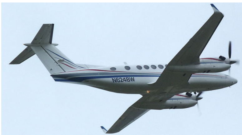
King Air 350 N624BW(ex F-GTEM) on delivery to the USA on 28/6(Clive Featherstone)

Gamston:- Delete G-BKBN TB.10 which has moved to Sandtoft, and G-MOLL PA-32 which departed following sale and is now re-registered G-MCPR. The only non residents noted during a look over the fence on 1.7 were G-BNTP 172N, G-BRPV 152 from Eastern Air at Sturgate, G-CEGP Beech 200 and OE-FHI DA.42NG (42.N009).