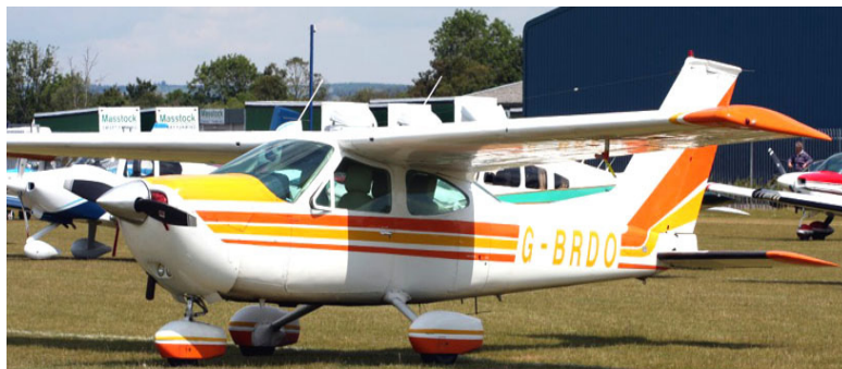
The mount for the trip Cessna 177 G-BRDO owned by Colin Granton