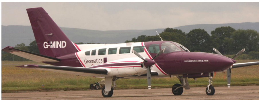
Cessna 404 G-MIND of Reconnaissance Adventures from Coventry, at Teesside 18/6

Sutton Bank:- Visiting the Gliding Club on 8/6 was AA-5B Tiger G-BGPH from Biggin Hill. On 4/7 Rolladen-Schneider LS-18W Glider G-LSCP crashed shortly after departure leaving the pilot trapped for over 90 minutes in the wreckage with serious leg injuries. Noted at Competition Enterprise on 2.7 were tugs G-AXED PA-25 f Pocklington, G-BETM PA-25, G-BFRY PA-25 and G-BJIV PA-18-150, whilst competitors were D-0606 Ka.6E (4346), D-9474 H.205 (20), G-BXSH DG.800B, G-BZYG DG.505MB, G-CFDE Ventus bT, G-CFNT DG.600, G-CFVN Centair 101A, G-CFXM Ventus bT, G-CHBV Nimbus 2B, G-CHXT LS4-a, G-CJEM Duo Discus, G-CJFR Ventus cT, G-CJFU ASW19B, G-CJGZ H.201B, G-CJHM Discus b, G-CJHZ ASW20, G-CJJP Duo Discus, G-CJSL Ventus cT, G-CKJC Nimbus 3T, G-CKKK LAK-17A, G-CKND DG.1000T, G-CKPO Duo Discus XT, G-CKSM Duo Discus XLT, G-DCHT ASW15, G-DCJR Cirrus, G-DCRH Standard Cirrus, G-DCTR T.59D, G-DDVY Cirrus, G-DEDM DG.200, G-DKFU Ventus 2cxT, G-KHCC Ventus bT, G-KKAM ASW22BLE, G-KOFM DG.600/18M, G-LSCP LS6-18W, G-OJNE Nimbus 3T, G-TRBO ASW28-18E, G-VNTS Ventus bT, G-XIXX DG.300, (BFY)/BGA.945 T.21B. Other gliders noted were G-CHEF DG.500, G-CHVR Discus b, G-CJVZ ASK21, G-CKJH DG.303, G-CKLN LS4-a, G-CKRN Astir CS, G-EEBM Astir CS77 plus G-OSUT SF.25C.