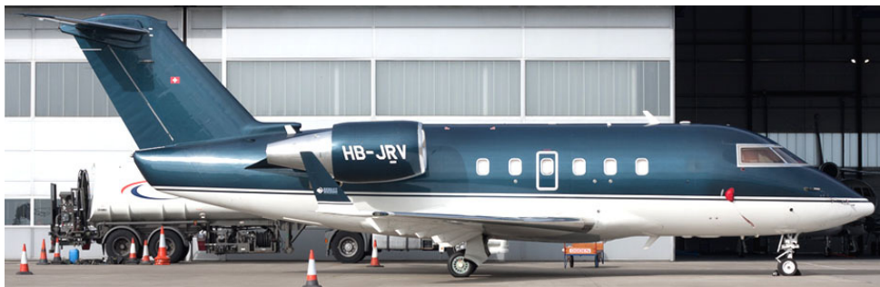
Challenger 604 HB-JRV parked on Multiflight/East apron, 1/6(Robert Burke)

GENERAL AVIATION:- Dauphin G-NHAA (Helimed 63) returned home to Teesside(1009) following maintenance. Cessna F.172H G-BMCI from Turweston(1234) to Edinburgh(1604). Cessna 152 G-BXTB from Newcastle(1244) to Teesside(1330). Cheyenne 3 G-GZRP (Helimed 064) f/t Oxford(1653/1741).