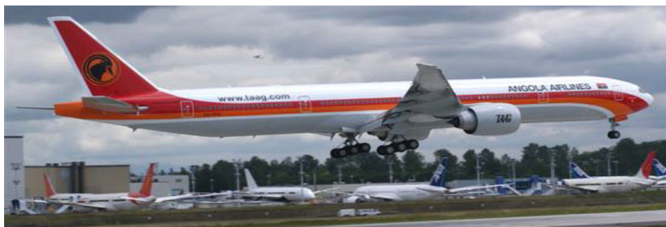
Boeing 777 D2-TEG of TAG Angola landing at Boeing Field following a test flight

Next day after a trip up the Space Needle, we were taken on the Boeing tour and saw 747,777 and 787s under construction. Without artificial aids, logging is difficult but I managed a few and once outside the fence got a good landing shot of a TAG Angola 777 whilst being shouted at to get back on the coach as we were ready to leave.