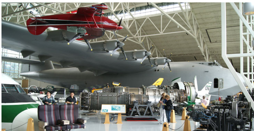
NX37602 The Spruce Goose