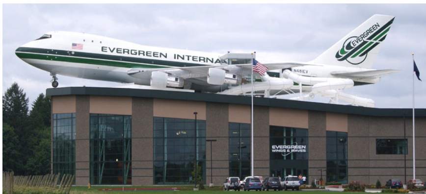
Boeing 747/200 N481EV sitting on top of the Museum roof

To say that we went for a coach trip, I wasn't disappointed in my "spotting" successes.