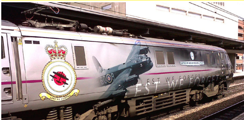
Loco 91-110 at Leeds Station on 23/7

AND NOW..... FOR SOMETHING COMPLETELY DIFFERENT!