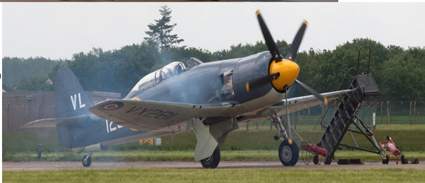
G-RNHF/ VX281 Sea Fury T20 involved in a taxiing incident, when it struck a set of steps.