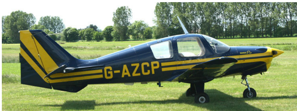
Beagle Pup G-AZCP, with an owner from Thirsk, is based at Full Sutton

D-EGCC DR253; G-ASAU MS.880B Rallye; G-AVYL PA-28-180D; G-AXJX PA-28-140BG-AYCT R/Cessna F172H; G-AZCP Beagle pup(); G-BAEU R/Cessna F150L; G-BAPP Evans VP-1G-BATV PA-28-180F; G-BAZS R/Cessna F150L; G-BDWX Jodel D120A; G-BFIG R/Cessna F172K; G-BGYH PA-28-161; G-BIEY PA-28-151; G-BJOT Jodel D117; G-BKTZ Slingsby T.67M; G-BOOE GA7 Cougar; G-BPEM Cessna 150K; G-BPUU Cessna 140; G-BRBA PA-28-161; G-BVST Jodel D150; G-BWVB Pietenpol A'camper; G-BWZA Europa; G-CBOR R/Cessna F172N; G-CCKN HN700 Menestral; G-CDMX PA-28-161; G-CEZK Stolp SA750; G-COLH PA-28-140; G-COMB PA-30-160B; G-CONL TB.10 Tobago; G-EIWT R/Cessna FR182; G-FLKY Cessna 172S; G-FLYA Mooney M.20J/201; G-GUMS Cessna 182P; G-ICAS Pitts S-2B; G-MZFU Thruster T600; G-OACI MS.893E; G-ZEBY PA-28-140F