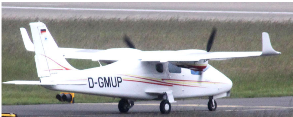
Type first visit, Tecnam P.2006T D-GMUP taxiing for take off, 30/6

GENERAL AVIATION:- King Air 200 G-CGAW (Orchid 605) from Tiree(1011) to Northolt(1102).