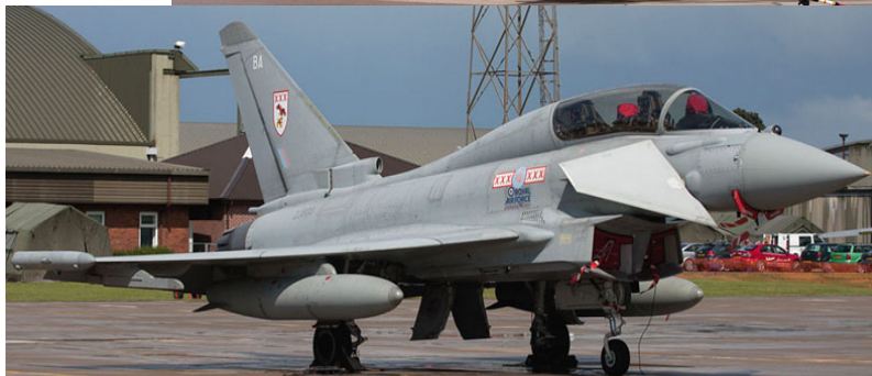
ZJ803 Typhoon Royal Air Force