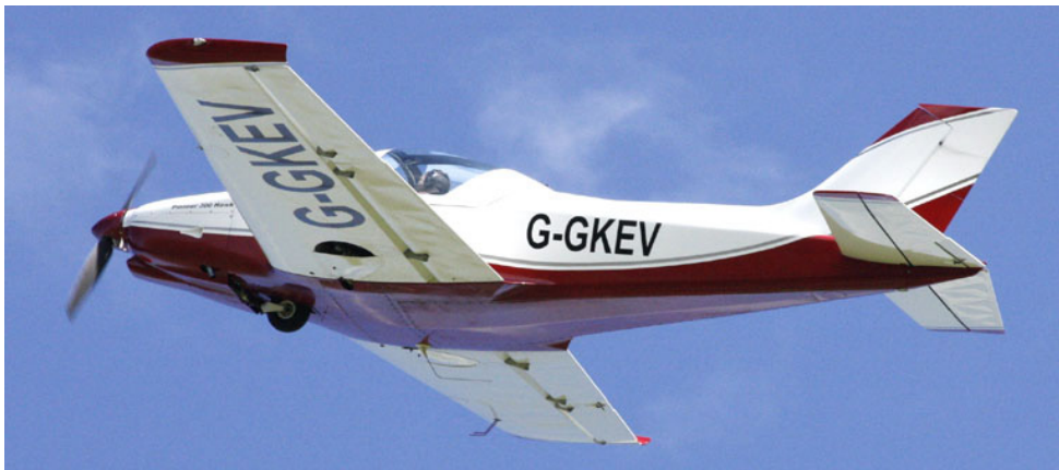
Pioneer 300 Hawk G-GKEV, based at North Coates, is seen here departing the airfield