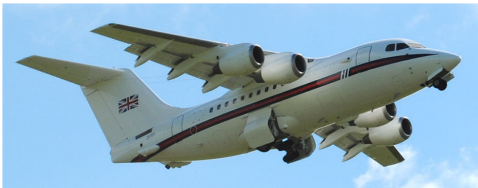
ZE701 BAe.146 CC2, Waddington Air Show, 30/06/12(Steve Lord)