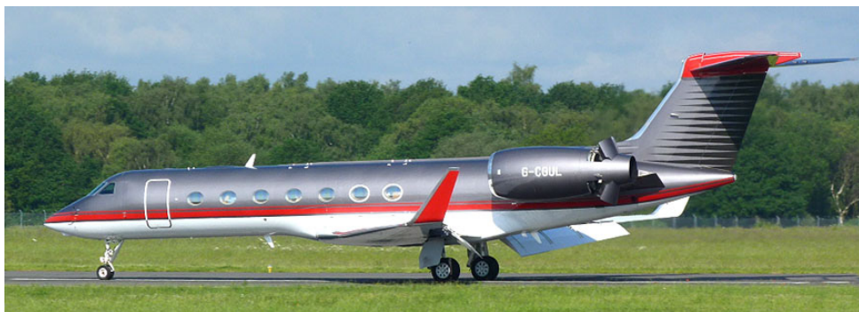
Pictured by Clive Featherstone landing at Doncaster, Gulfstream 5 G-CGUL of Gama A/V

PC-12 M-FWIN(1st, first visit); Ximango G-MOAN(1 st ); EC-130 PH-ECZ(2 ND late evening fuel stop enroute to Ireland); S.76 G-CGIW(5 TH , "BHL 93A", training); Be.90 M-TSRI(6 th , Ambassador 906B); PA-34 HB-LEU(9 th ); C.404 G-FIFA(9 TH , Endurance 408, training); Jet Ranger G-CHGL(10 th ); C.441 EI-DMG(14 th , n/s); PA-46T OK-NTG(15 th ); S.76 G-CDFV(15 th , BHL 97R, training); C.404 G-TASK(20 th , Endurance 404, training); 25 th TB.20 G-CDDA(25 th Oxford 29, training); A.109 EI-MSG(28 th ); S.76 G-CGRU(29 th , BHL 90X, training).