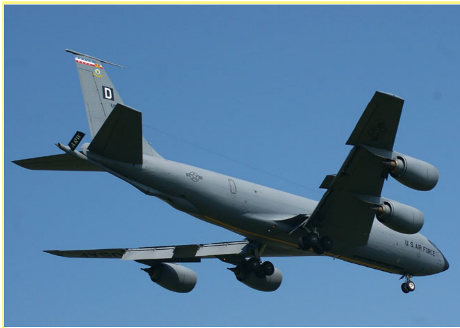
61-0306 Boeing KC-135R, USAF RAF Leuchars, 28/06/12