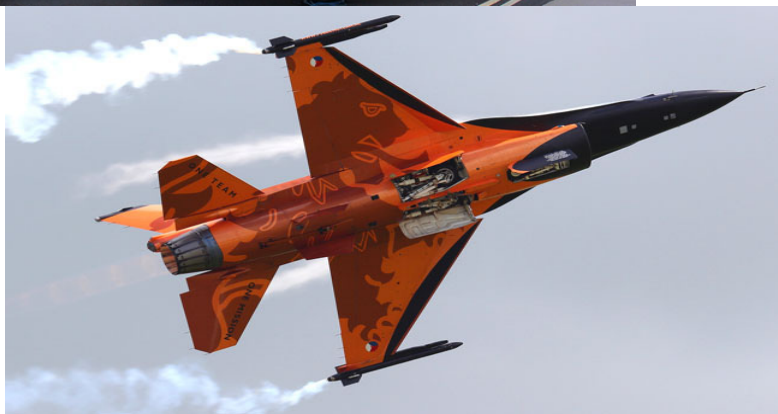
J-015 F-16AM Royal Netherlnds Air Force