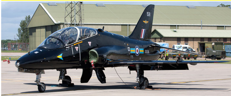
Hawk T.1 XX158 Royal Air Force