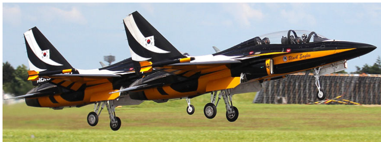
Two of the T-50 Golden Eagles of the Korean Air Force aerobatic team, The Black Eagles

A few of the highlights from the spectacular show captured by Kieron/dasf.