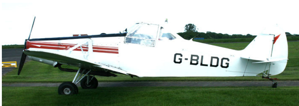
Glider tug PA-25 G-BLDG showing signs of a substantial fuselage repair, at Rufforth

G-BXCJ Campbell Cricket; G-CDBE Montgomerie B.8M; G-CEHN RotorSport MT-03; G-CEOX RotorSport MT-03; G-CFCG? RotorSport MT-03; G-CFCL RotorSport MT-03; G-CFKA RotorSport MT-03; G-CGSD Magni M16; G-CGTK Magni M24; G-CGVK RotorSport Calidus; G-CGZE RotorSport MTO; G-GRYN RotorSport Calidus; G-IROS RotorSport Calidus; G-MWUI AMF Chevron; G-PILZ RotorSport MT-03; G-YPDN RotorSport MT-03; G-YROA RotorSport MTO G-YROK RotorSport;