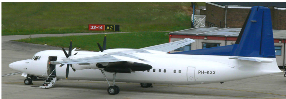
Denim Air Fokker 50 PH-KXX operated the Knock flight on behalf of Flybe on 10/6

GENERAL AVIATION:- PA-28 Warrior G-BOJI f/t Blackbushe(1701/1105), n/s to 10/7.