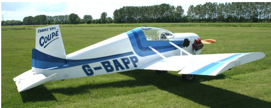
Evans VP.1 Coupe G-BAPP is based at Full Sutton with an owner in Harrogate

G-ALUC DH.82A Tiger Moth; G-ANON DH.82A Tiger Moth; G-ASAZ Hiller UH-12E; G-BBJX Cessna F150; G-BBNJ R/Cessna F150L; G-BIOW Slingsby T.67A; G-BODE PA-28-161; G-BWEU R/Cessna F152; G-BWZG ROBIN R.2160; G-CGRL Robinson R44; G-GDAV Robinson R44' G-JRME JODEL D140; G-OACF Robin DR.400/180; G-OTVI Robinson R44; G-SACR PA-28-161' G-SACS PA-28-161; G-SACY Aero AT-3 R100; G-STER B.206B JetRanger; G-UANO DHC-1 Chipmunk.