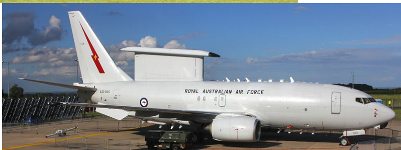
A30-005 Boeing 737AEW Wedgetail Australian Air Force