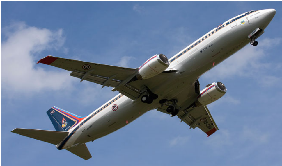
Thai Air Force Boeing 737/400 HS-CMV overshooting on runway 14, 20/6

MILITARY:- Tutor G-CGKB (Cranwell 91) f/t Cranwell(1323/1514).