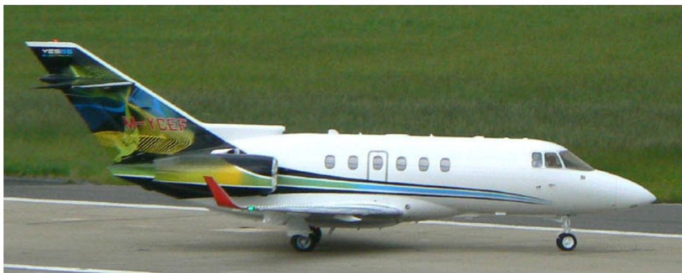
Colourful Hawker 800XP M-YCEF seen here taxiing to Multiflight/East visted twice in June

MILITARY:- Tucano ZF139 (LOP 45) ILS and overshoot(1529), f/t Linton.