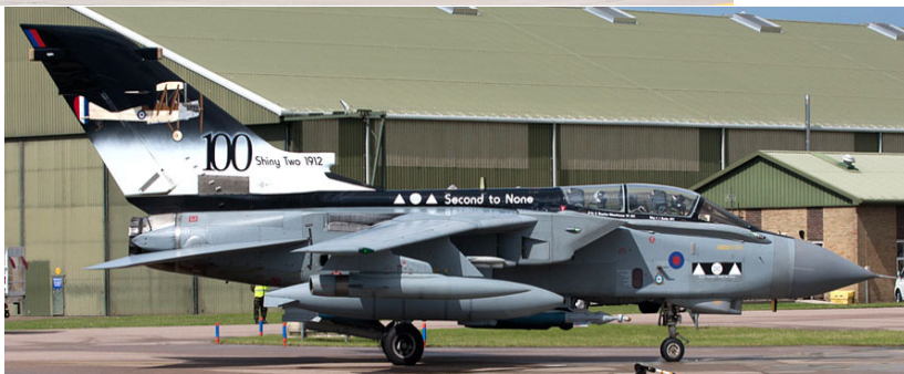
ZA398 Tornado GR4 Royal Air Force