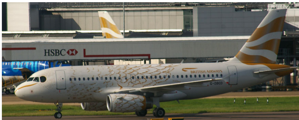
Soon the become a familair sight at LBIA, the former bmi Airbus A.319 are being painted in British Airways "Dove " scheme.