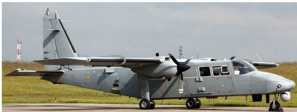
One of two Defenders visiting on 28/6, ZG997 parked at Multiflight/East

MILITARY:- Bell 412 Griffin ZJ708/K (Shawbury 97) f/t Shawbury(1132/1234). Thai Air Force Boeing 737/400 HS-CMV/11-111 (VM 904) carried out an ILS and overshoot at 1339, f/t Farnborough. BN.2T Islander ZH536 (Ascot 7948) called in for fuel while on patrol in the local area, f/t Waddington(2038/2110).