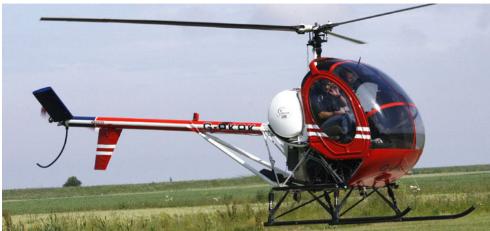
Based at Louth, Lincs Schweizer 269 G-PKPK, paid a visit