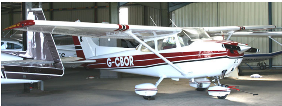
Formerly at Barton, Cessna F.172N G-CBOR now lives at Full Sutton owned by Vetsonic