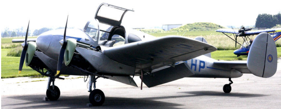
Long time resident at North Coates, Gemini G-AKHP is now back in the air after repairs.