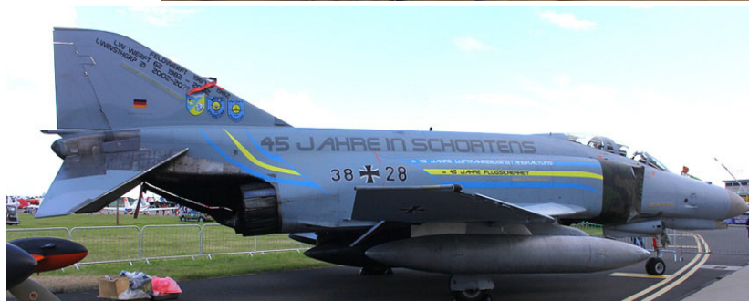
38+28 F-4 Phantom West German Air Force