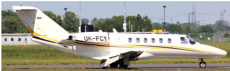
Citationjet 2 OK-FCY of Aeropartner arriving for maintenance on 4/6