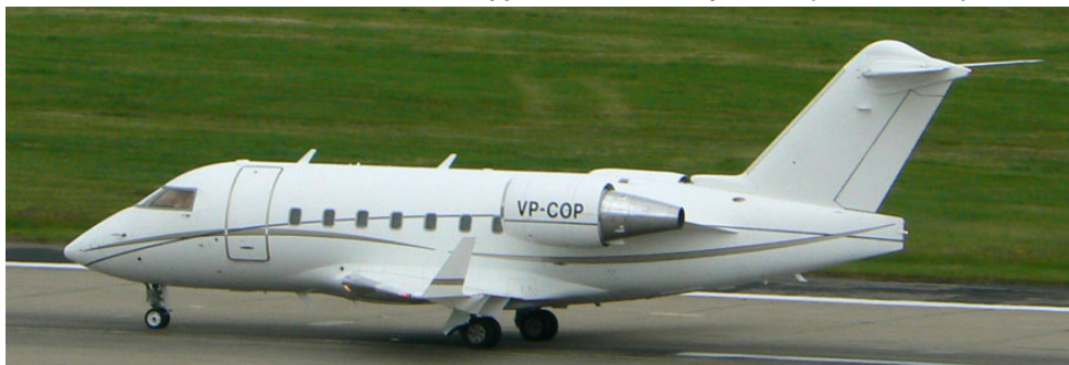
Challenger 604 VP-COP of Close Air arriving from Kiev on 20/6