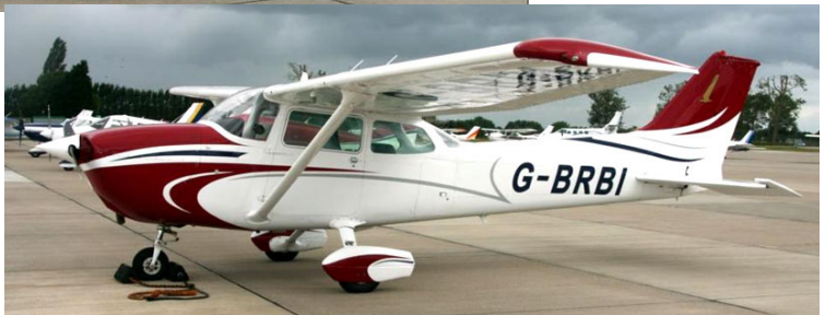
G-BRBI Cessna 172N