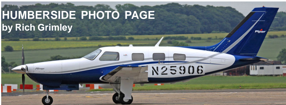
PA-46T Malibu Mirage N25906 parked up on 21/6, was on delivery from the USA to Poland