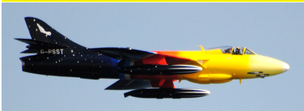
G-PSST Hunter Mk.58A performing at Sunderland Air Show, 27/07/13(Steve Lord)