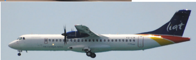
V2-LIA ATR.72 of LIAT Caribbean passes through on delivery