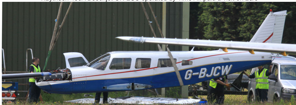
Following its minor accident, PA-32 Saratoga G-BJCW is seen being loaded onto a wagon on 24/6