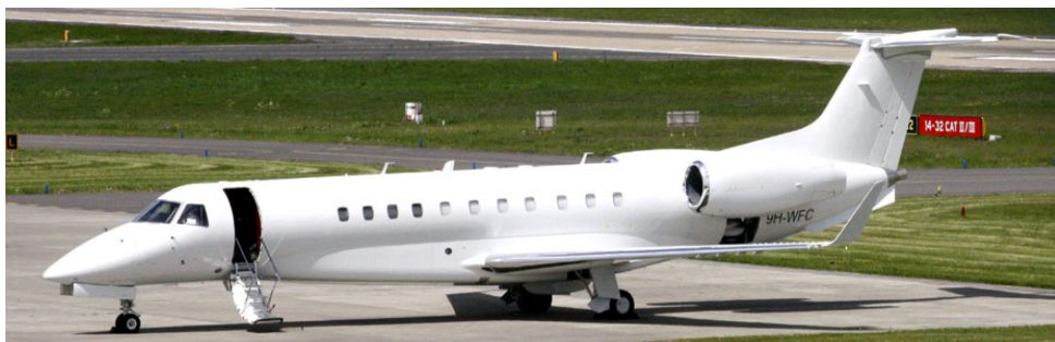
Legacy 9H-WFC operated an inbound charter from Mikonos,Greece on 1/6(Mike Storey)