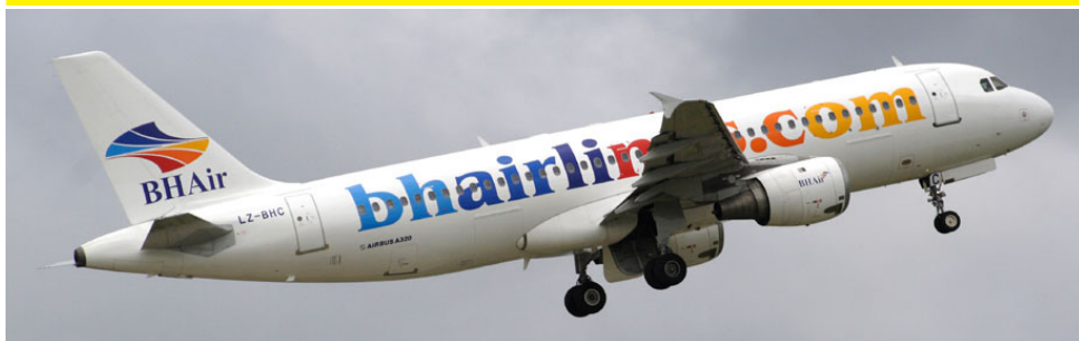
LZ-BHC Airbus A.320, BH Air departing LBIA on 15/06/13(Paul Whincup)