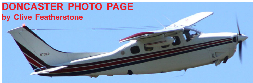
Europe based Cessna P.210N N731XB seen departing on 4/6