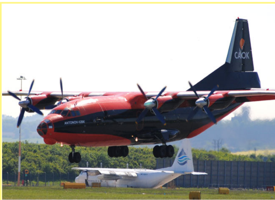
UR-CKL Antonov AN-12BK of CAVOK landing at East Midlands, 06/06/13 Steve Lord