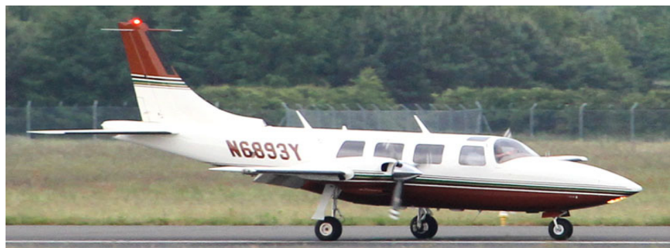
Operated by Aerostar Inc, PA-60 Aerostar N6893Y is seen arriving on 16/6