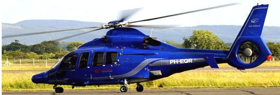
Dauphin PH-EQR of HeliHolland based in early July, operating into the North Sea