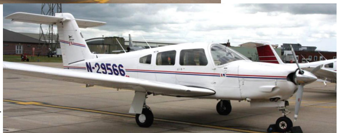
N29566 PA-28 Arrow RT