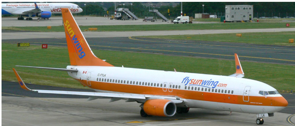
Sunwing 737/800 C-FTLK, operating for Thomson, taxiing for departure on Runway 14

Based:- Sunwing Boeing 737/800 C-FLZR (formerly G-FDZR) operated by Thomson 1/6-4/6, C-FYUH operated by Thomson 4/6-18/6, 20/6(positioned in on 9025). The aircraft was found to have engine problems and needed a replacement, which was fitted by Monarch Engineering under a "tent" on the Multiflight/East apron. The aircraft resumed operations on 25/6(departed on 3250). Thomson's own 737/800 G-TAWR substituted, based from 11/6 (arriving on 3251)-14/6 (positioning out to Manchester on 9019P). C-FYLC operated by Thomson based from 18/6 (arriving on 3251)-20/6 (positioned out on 9027 to Dublin), C-FTLK 25/6(arrived on 3251)-30/6.