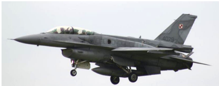
4079 F-16D Falcon 2Elt 3SLT Polish Air Force