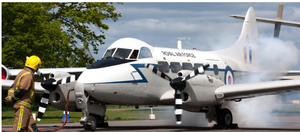
A rather smokey engine start-up for Devon VP967(G-KOOL) at Elvington, Yorkshire Air Museum on 3/6(Robert Burke)