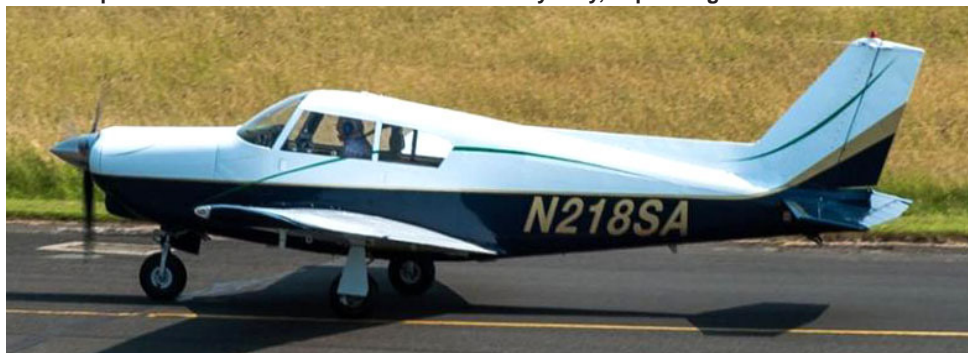
Fadmoor based PA-24 Comanche N218SA arriving for a visit on 5/7