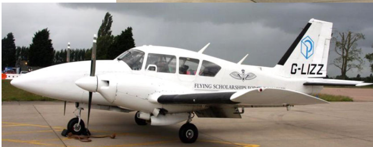
G-LIZZ PA-23 Aztec E