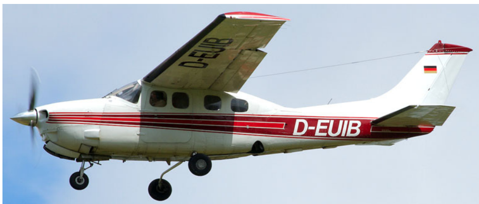
Cessna P.210N D-EUIB on final approach for Runway 32, 1/6(David Blaker)