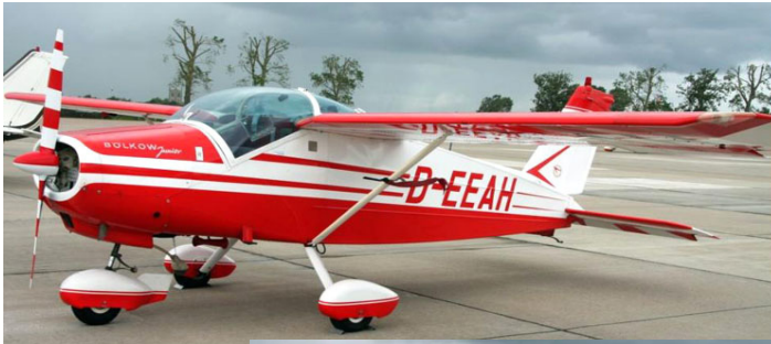
D-EEAH Bollow Junior

Typhoon FGR.4:- ZJ910/BV; ZK306/BT; ZK328/BS; ZK344/BQ; ZJ927(41 Sqn)