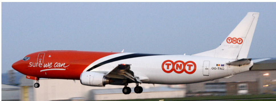
OO-TNO Boeing 737/400F of Air Contractors/TNT landing East Midlands