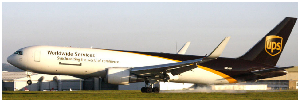
N334UP Boeing 767/300F of UPS, touching down at East Midlands