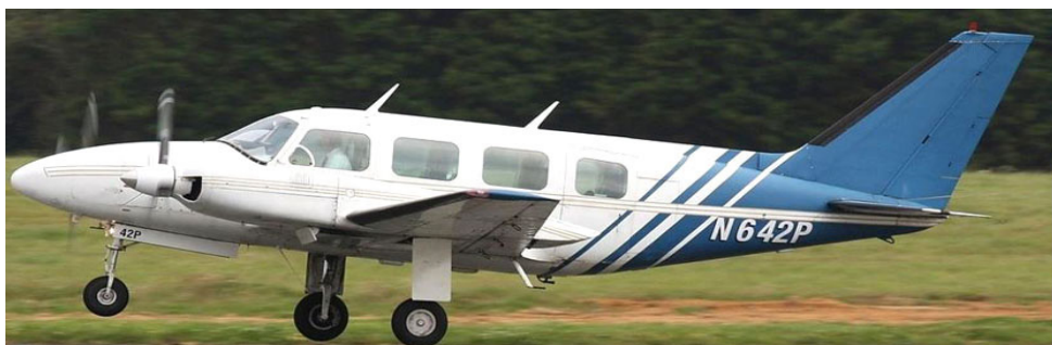
Northern Ireland based PA-31 Chieftain N642P paid a visit to LBIA on 3/6