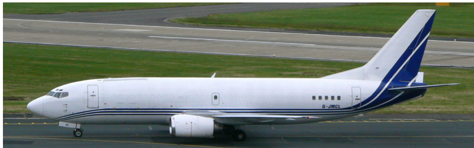
Atlantic Airlines Boeing 737/300F operated a horse charter to and from Dublin

Heathrow (1342/1343, “20C/21X”) – 2/6 G-EUOI, 3/6 G-EUPE, 4/6 G-EUPR, 5/6 G-EUOH, 6/6 G-EUPR, 7/6 G-EUPJ, 9/6 G-EUPW, 10/6 G-EUPE, 11/6 G-EUOI, 12/6 G-EUPY, 13/6 G-EUOB, 14/6 G-EUPT, 16/6 G-EUPO, 17/6 G-EUPB, 18/6 G-EUPW, 19/6 G-EUPJ, 20/6 G-EUOC, 21/6 G-EUPB, 23/6 G-EUOF, 24/6 G-EUPY, 25/6 G-EUPX, 26/6 G-EUOD, 27/6 G-EUOF, 28/6 G-EUOB, 30/6 G-EUPU.