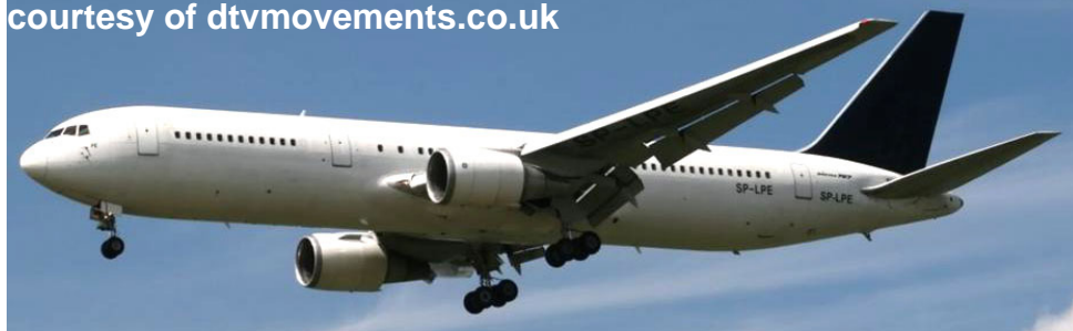
Boeing 767/300 SP-LPE of LOT arriving for parting out by Sycamore Aviation on 17/6