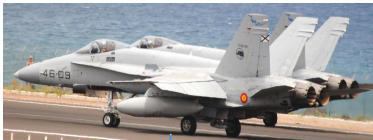
Pair of Spanish Air Force Hornets prepare for take off

Great holiday, weather, beer and of course aircraft