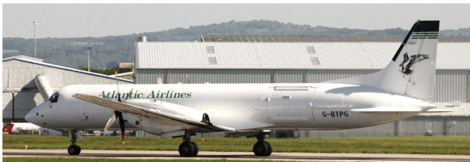
G-BTPG BAe. ATP of Atlantic Airline taxiing to dispersal at East Midlands