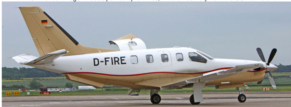
Based at Augsburg TBM-700 D-FIRE is seen shortly after arrival on 17/6