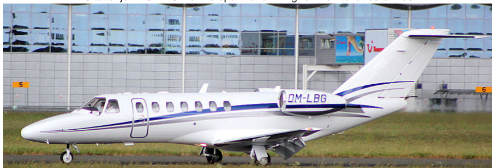
First Slovenian registered aircraft to visit DSA, Citationjet 3 OM-LBG of Opera Jet arrived 13/6