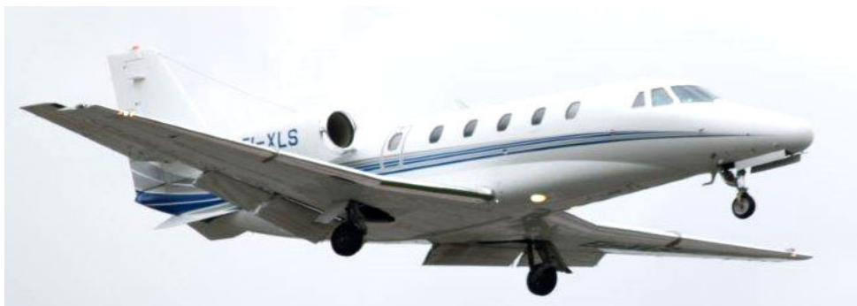
Citation XLS EI-XLS of Airlink Airways inbound from Nice, 14/6(David Senior)