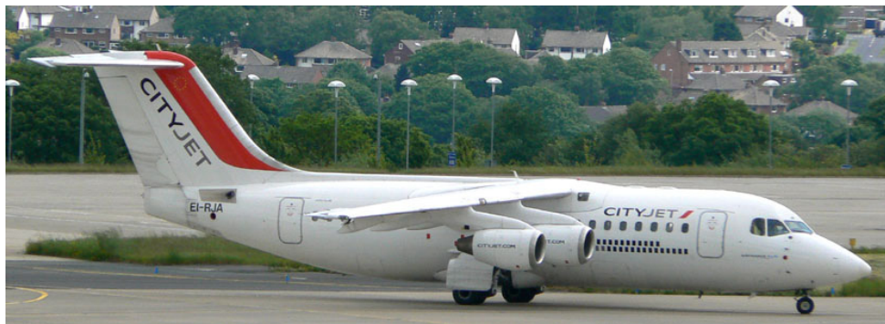
City Jet RJ-85 EI-RJA taxiing for departure on a charter flight to Lyon on 11/6

Islamabad (775/776, “775/776”) – 1/6 AP-BEQ, 5/6 AP-BEG, 8/6 AP-BDZ, 12/6 AP-BEQ, 15/6 AP-BEC, 19/6 AP-BEG, 22/6 AP-BEQ, 26/6 AP-BEG, 29/6 AP-BEC.