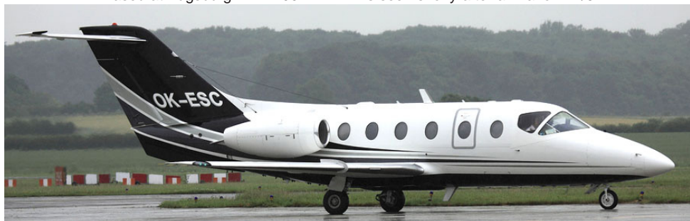
Raytheon 400A Beechjet OK-ESC operated by Time Air paid a visit on 28/6