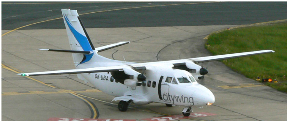
City Wings operated f/t IOM for the TT Races, above LET 410 OK-UBA taxiing onto stand

Ronaldsway:- 1/6 G-LNKS, 2/6 OK-UBA(Let410), 3/6 G-LNKS, 4/6 G-LNKS, 5/6 G-LNKS, 6/6 G-LNKS, 7/6 G-LNKS, 8/6 G-LNKS, 9/6 OK-ASA(Let410, Brighton City Airways colours).