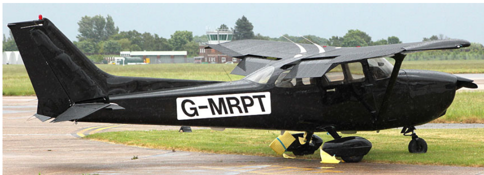
New Gamston resident Cessna 172S G-MRPT at Doncaster following its respray into this very inspiring scheme!(Clive Featherstone)

NETHERTHORPE:- A visit on the morning of 29.6 allowed a full check of the hangars to be made. There only appeared to be one addition G-BSUD Luscombe 8A with all the rest known to us. Parked outside Dukeries Aviation Hangar for maintenance were G-AYRT F.172K from Brighton, G-PARI 172RG from Tatenhill, G-PPFS FRA.150L resident unmarked (still carrying G-AZJY in the cockpit), N101UK M.20K (25-0631) f Sandtoft minus engine, and N2299L Beech F.33A (CE-677). Visiting between 10.20 – 11 05hrs were G-BYBD F.172H f Sandtoft t Brighton, G-MRPT 172S f Gamston in an all black colour scheme and G-SURG PA-30 tied down and with the grass starting to grow under it, so not moved for a while. A further visit 21.7 found G-BSUD Luscombe 8A still here and confirmed as a new resident as is G-NUTA Christen Eagle II which only arrived the previous day. G-PARI and N101UK were still present joined by G-BYBD F.172H from Brighton on annual and G-BBKJ F.150L resident minus engine and nose wheel. Visiting between 11.45 – 13.50hrs were G-AIBW J/1N f&t Brighton, G-BABD FRA.150L, G-BRNC 150M f Sandtoft and G-NPKJ RV.6 f&t Sturgate. Resident G-KWIC Quik force landed in a field near Workop on 24.11.12 due to fog while on a local flight from here. The heavy landing caused damage to the pod, front wheel, propeller and wing leading edge and it was cancelled as temporarily withdrawn from use on 14.2.