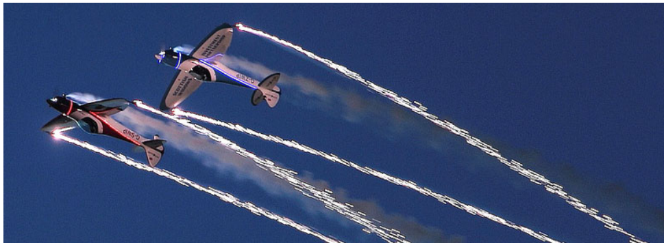
The "Scottish Widows"(Silence Twisters G-SWIP/G-ZWIP) performing thier spectacular night-time display at the "Wings and Wheels Show" at Wickenby, 15/6(Kieron/dsaf)

YORK:- York Armed Forces Day on 30.6 had a flypast from three Hawks operating out of Teesside, they were XX198/CG, XX246/95-Y and XX339/CK. They also passed over Brighton several times.