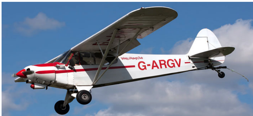
Wolds Gliding Club PA-18 SuperCub tug G-ARGV pictured during the recent Air Yorkshire Gliding Evening at Pocklington on 3/6

RUFFORTH/WEST:- In Bob McLeans workshop on 12.7 were G-DDUY DG.100 and G-DEJD T.65D, whilst visiting were G-BOIY 172N from Brighton and D-EEWU DA.40D (D4.210) which had arrived 9.7 and departed today. SE-UJO AMT.200S departed back to Sweden on 1.7 following repair. Noted visiting 15.7 was G-BRBX PA-28, whilst on 26.7 F-GFXF DR.400/120 (1753) was present.