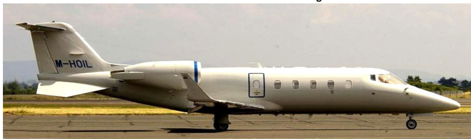
Lear Jet 60 M-HOIL(ex G-HOIL) of Begal Air parked on the arpon, 19/7