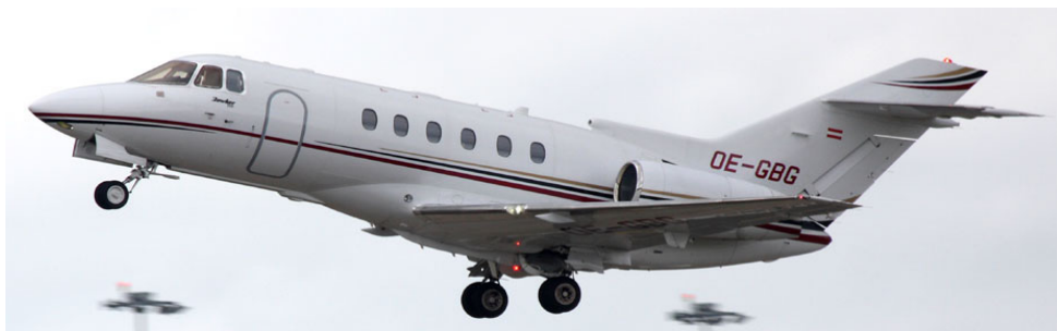
Hawker 800XP OE-GBG of M-Jet departing for Moscow, 23/6(Paul Whincup)