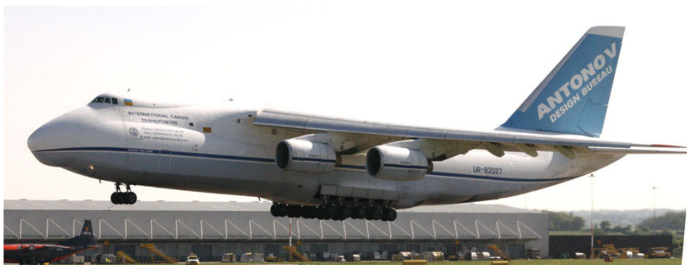
UR-82027 Antonov AN-124 of the Antonov Design Bureau landing at EMA