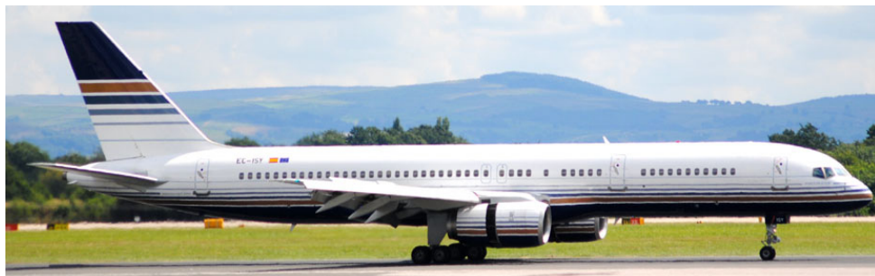
Jet2 has leased Boeing 757 EC-ISY from Privilege Style for the Summer season The aircraft will be based at Manchester, where it was pictured by Steve Lord

From Belfast International it will offer the only direct services to Prague and Rome and to Gran Canaria and Zante.