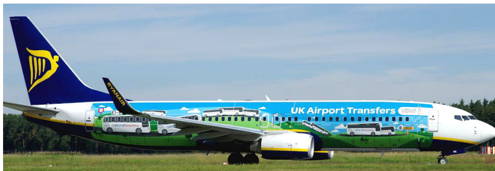
Ryanair 737/800 EI-EMK has been adorned with advertising for National Coaches

ENDANGERED birds smuggled inside suitcases and thousands of cigarettes hidden in waistcoats were seizures made by Customs officials at Leeds-Bradford Airport. Nine grey Francolin birds were discovered inside suitcases at the Yeadon airport, as passengers on flights from Islamabad made two attempts to smuggle them. Grey Francolin birds are found in drier parts of South Asia. In another case, two male passengers flying from Lithuania were stopped at the airport when officials were suspicious of their bulky and ill-fitting jackets. Subsequently, it was discovered the men were carrying 30,000 cigarettes, including thousands concealed in specially adapted waistcoats. Both incidents took place in May 2013. Images were released as part of a national scheme to warn potential smugglers that Border Force officials have the skill to catch them out. During 2012/13, Border Force exceeded its targets for the seizure and detection of Class A drugs.