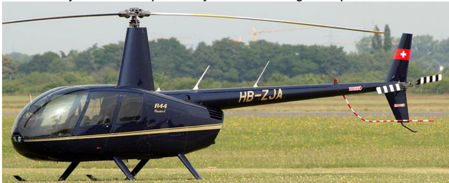
R.44 HB-ZJA, owned by Marc Giradelli, called in for an overnight stay, 15/6