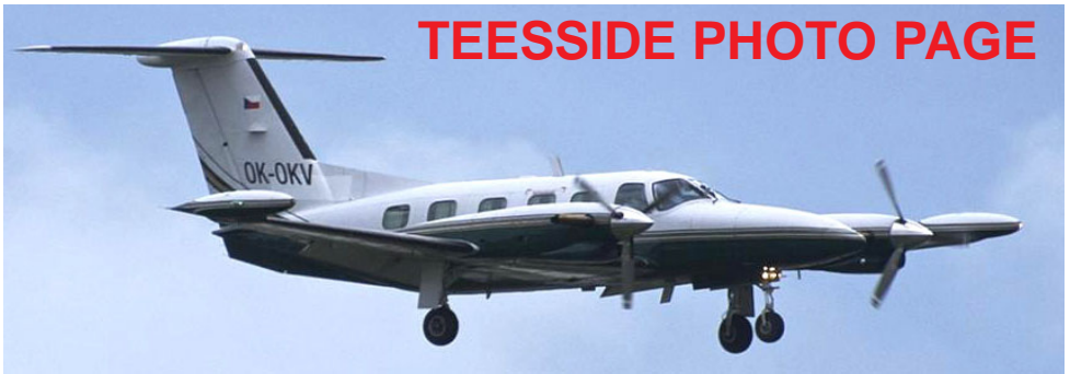
PA-42 Cheyenne 3 OK-OKV of L-Consult sra, arrived on an ambulance flight, 13/6