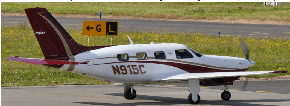
Based at Elstree, owned by Anfield Inc, Malibu N915C visited on 23/6(Rod Hudson)