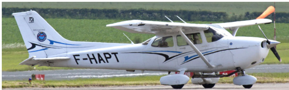
Cessna 172S F-HAPT based at St Cyr, France called in on 11/6 heading for Scotland