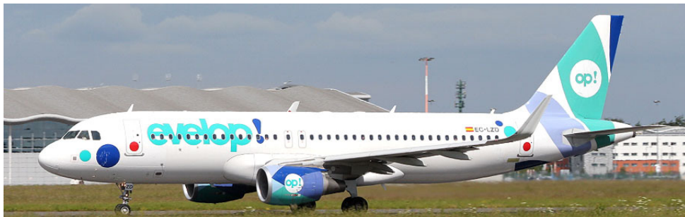
Airbus A.320 of Evelop arriving on 13/8. Aircraft visited previously as CS-TRM of Orbest