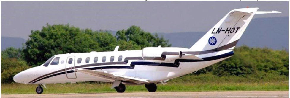
Citationjet 3 LN-HOT operated by Helitrans taxiing for departure on 23/6