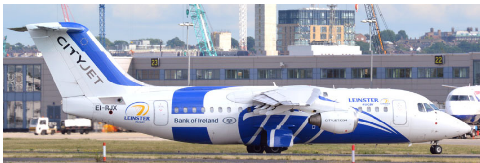
RJ-85 EI-RJX of City Jet, painted in the colours of Leinster Rugby Club

A couple of shots taken by Anrew Barker on a recent visit to London City(LCY).