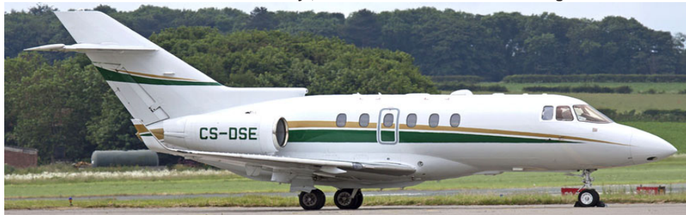
Hawker 800XP CS-DSE(ex N204XP), a new addition to the Netjets fleet, visited on 18/6