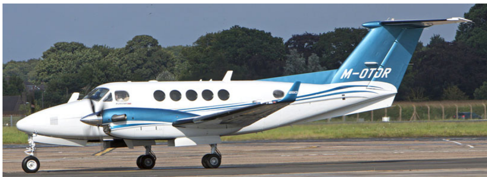
Gamston-based King Air 200 M-OTOR, replaces King Air 90 with same reg(R Grimley)

HORBURY:- R.44 G-CCNY was noted visiting a private site here on 22/7, f/t Sherburn.