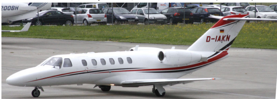
Dortmund based Citationjet 2 D-IAKN of Starwings parked at Mutlflight/East 10/6