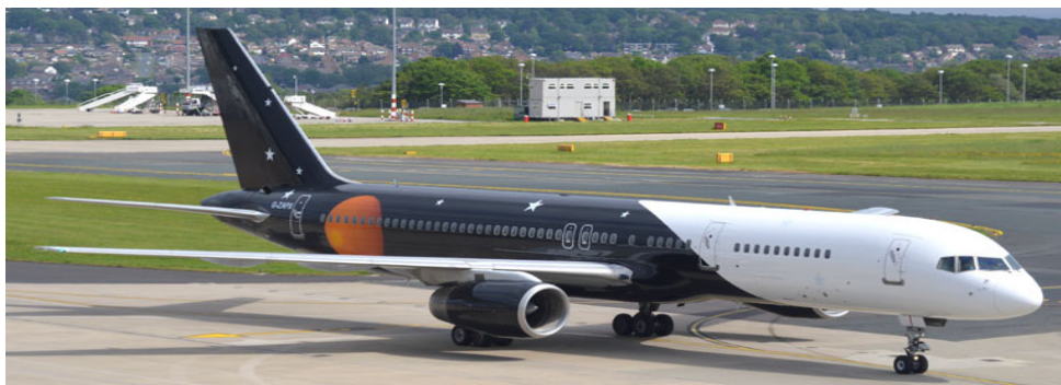
Boeing 757 G-ZAPX of Titan was used by Jet2 early in the month, seen above taxiing in