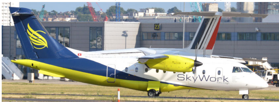
Dornier 328 HB-AES of Sky Work Airlines