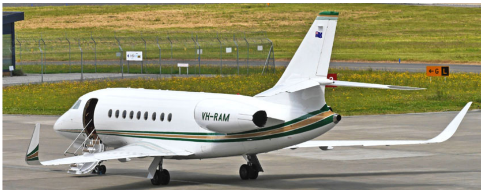
Based in New South Wales, Falcon 2000EX VH-RAM of Ramsey Air Services, 21/6