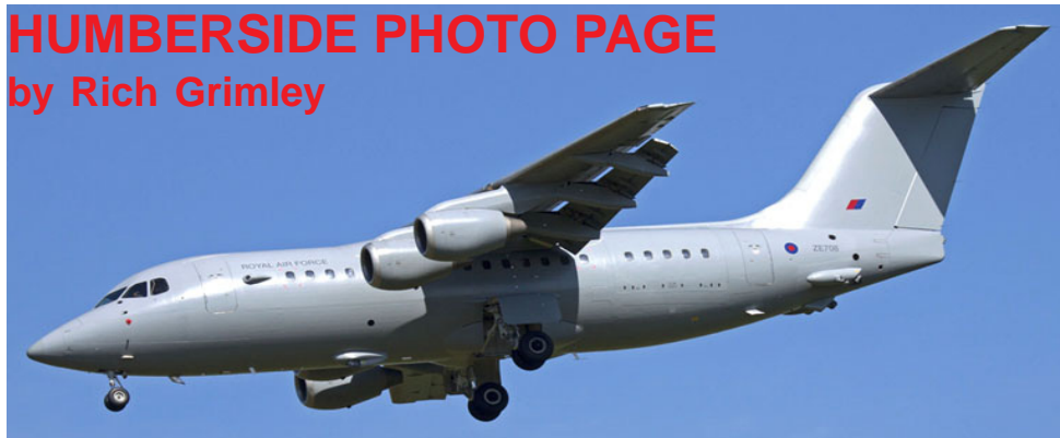
BAe.146 C3 ZE708(ex OO-TAY) of 32(TR) Squadron, crew training on 12/6.