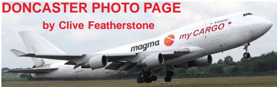
Boeing 747/400 TC-ACH of ACT Cargo departing to Tripoli on 18/6