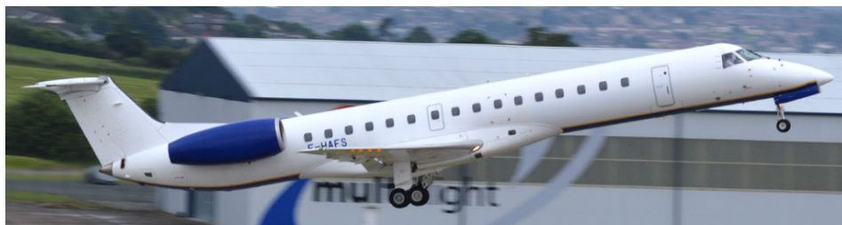
EMB145 F-HAFS of Enhance Aero departing to Munster on 28/6

On 28/6 EMB.145 F-HAFS arrived from Perpignan carrying the Catalan Dragons Rugby team, before positioning out to Munster. The following day EMB.145 F-HELA positioned in from Basel/Mulhouse to operate the return charter to Perpignan.