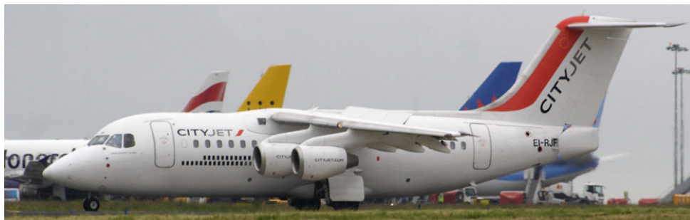
RJ-85 EI-RJF of City Jet operated a charter from Belfast on 15/6

Additional flights:-12/6 PH-EZB(9955) positioned out to Amsterdam.