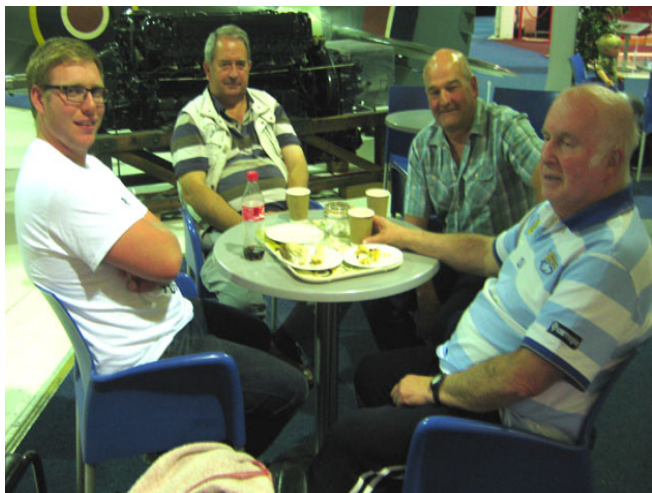
Members take a breather at The Museum

Was I upset with myself——— definitely, because I still "....." talk about it!