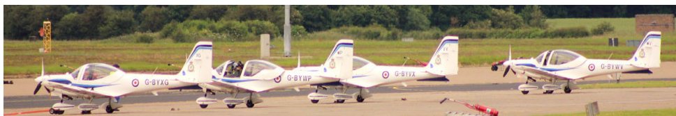
Tutors G-BYXG/G-BYWP/G-BYXA/G-BYWV operating at Linton on 25/6

19/6 M-OTOP King Air 90, G-TWOP Citationjet 2(Clifton 10) 20/6 CS-DXI Citation XL(Fraction 3WP), ZZ416 Shadow(ILS), G-YEOM PA-31(Yeoman 1) 21/6 N767CM Beech A.36(training), G-MFLB Robin HR.200, G-COLH PA-28 22/6 CS-DUG Hawker 800XP(Fraction 694M), G-LIZI PA-28, M-YBLS Pilatus PC-12 23/6 M-ICRO Citationjet 3(Eastflight 8A), G-BNME C.152, G-LNCT Explorer(Helimed 29) 24/6 G-LBSB King Air 350(training), G-CEWN DA.42 Twin Star(training) 26/6 PH-PBA DC-3(n/s then local flights), M-INOR Hawker 800XP(n/s) 27/6 D-COKE Lear Jet 35(Red Angel 4728) 29/6 M-USHY Cessna 441, G-BNTD PA-28, G-FBLK Citation Mustang(Blink 3C) 30/6 N4478K Robinson R.66, OO-TLB DA-42 Twin Star