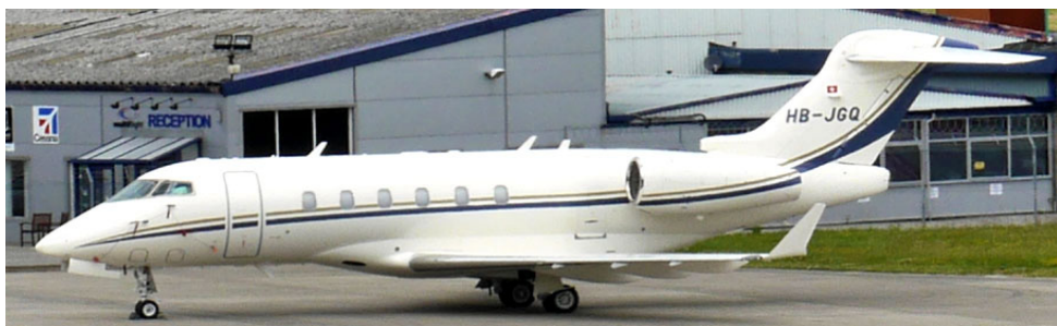
Challenger 300 HB-JGQ of Premium Jet parked on Multiflight/East, 21/6(Rod Hudson)