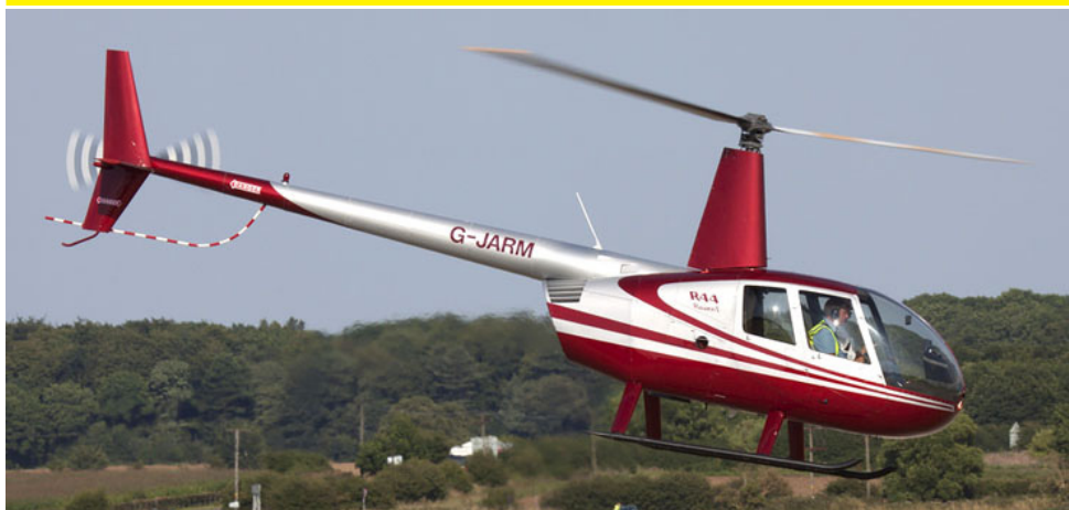
Robinson R.44 G-JARM departing Humberside 03/08/14(Rich Grimley)