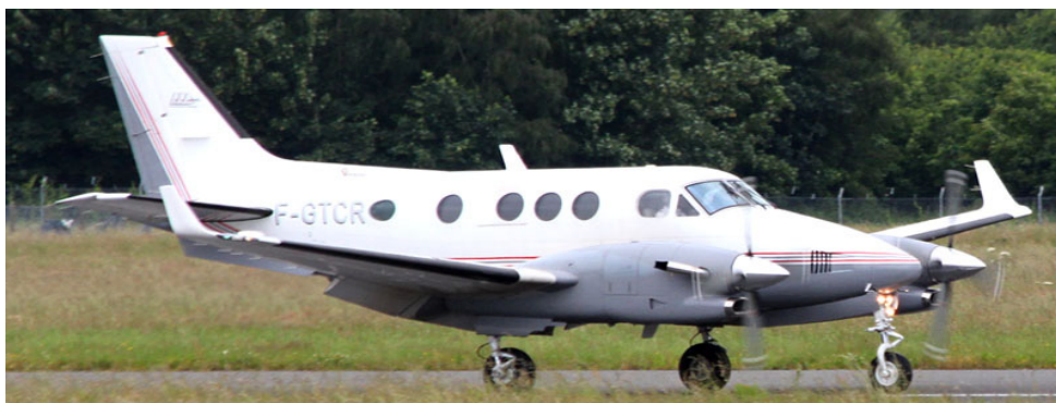
King Air 90 F-GTCR of Air Atlantique Assistance, arrived on an Ambulance Flight, 18/6