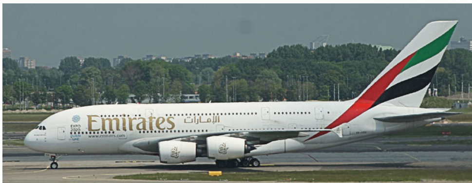
Airbus A.380 A6-EED of Emirates, Amsterdam 19/05/14(Alan Sinfield)