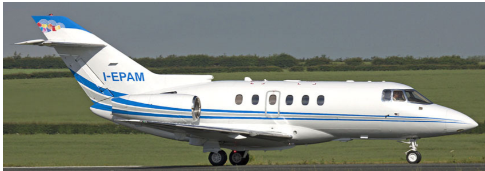
Hawker 750XP I-EPAM of Eurofly Services SpA, taxiing onto the apron, 9/6