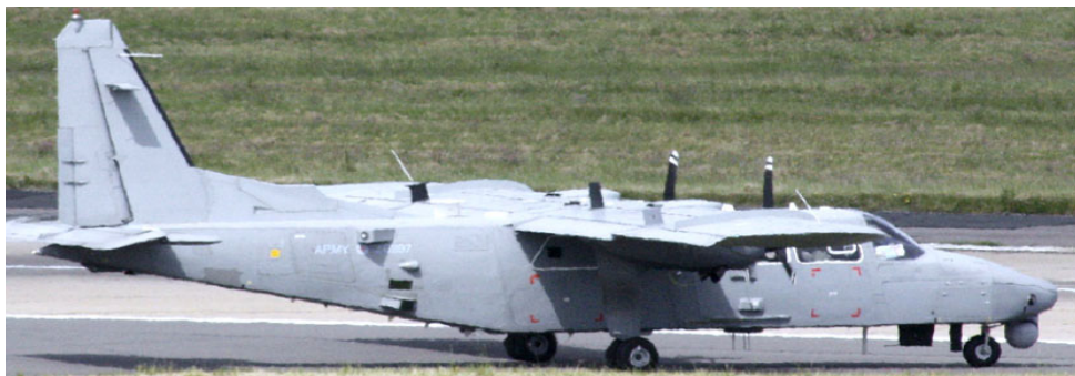
Army Air Corps Defender ZG997 arrived from its Belfast base, 16/6(Mike Storey)