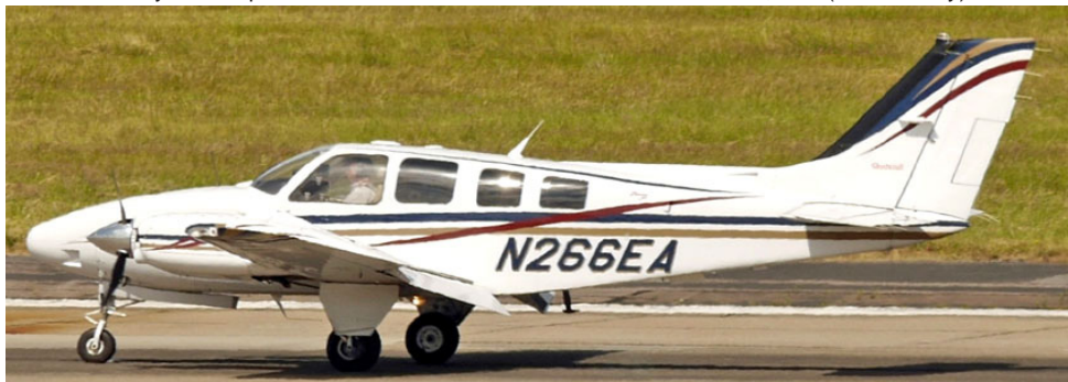
Fairoaks based Raytheon 58 Baron N266EA taxiing onto Multflight/East, 23/6