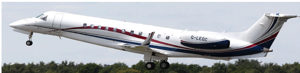
EMB.135BJ Legacy G-LEGC of London Executive Aviation, crew training on 12/6