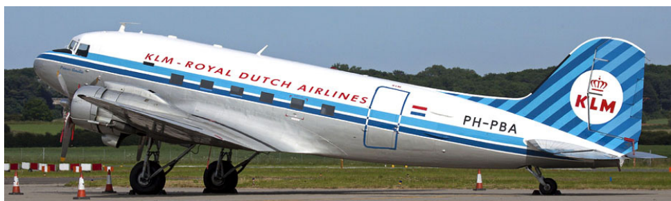
DC-3C PH-PBA of the Dutch Dakota Association visited several airports in late June including Aberdeen, Teesside and Humberside