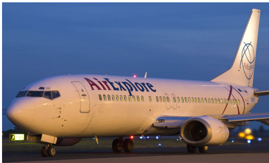
Boeing 737/300 OM-CEX leased by Ryanair, taxiing for departure on 17/6

Based aircraft:-G-TAWO(1/6-21/6), G-TAWH(21/6-30/6).