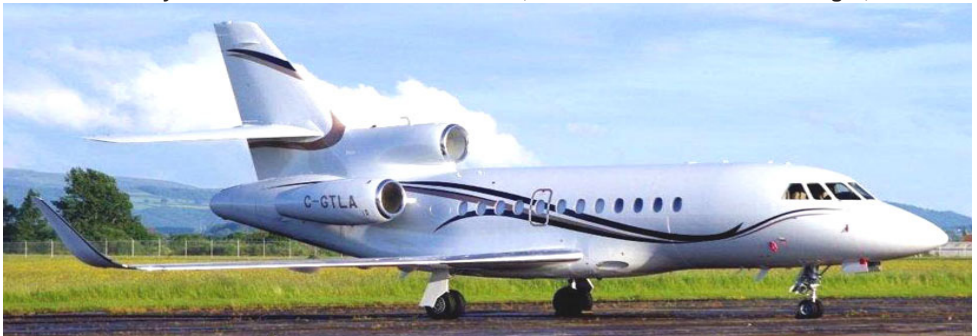
Falcon 900EX C-GTLA of Tidnish Holdings Ltd arrived on 7/6 for a few days stay