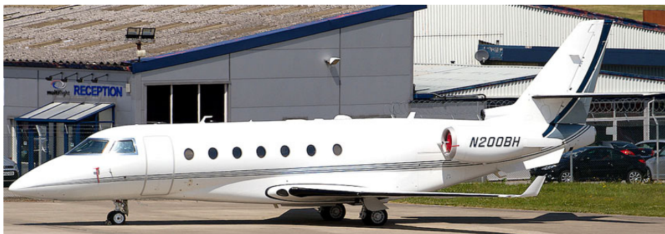
Denver based IAI Galaxy N200BH spent several days on Multiflight/East in mid-June