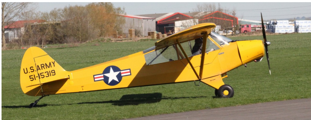
51-15319 (G-FUZZ) PA18 Super Cub 25/03