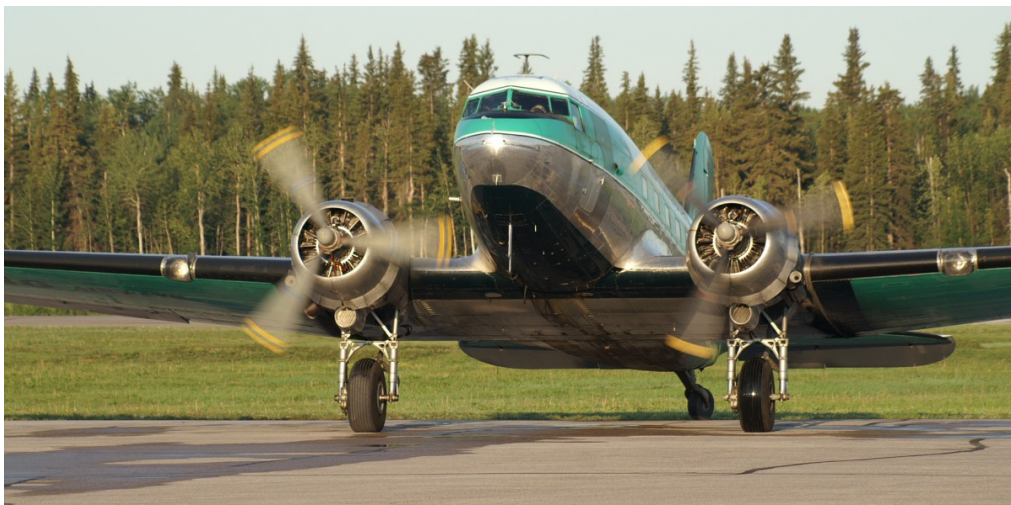
C-FLFR arrives at Hay River with morning freight flight