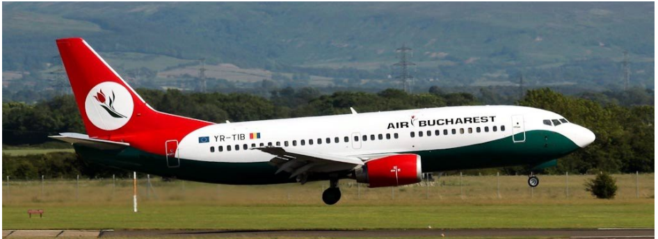
YR-TIB Boeing 737-3L9 Air Bucharest 17/06

PA-31 Navajo f ? c/t 2 Excel Aviation, G-DEIA Ce560XL Citation XLS+ f Jersey t Blackpool Jaymax Jersey / Bookajet