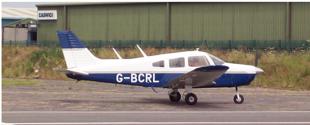
G-BCRL PA-28 20/06