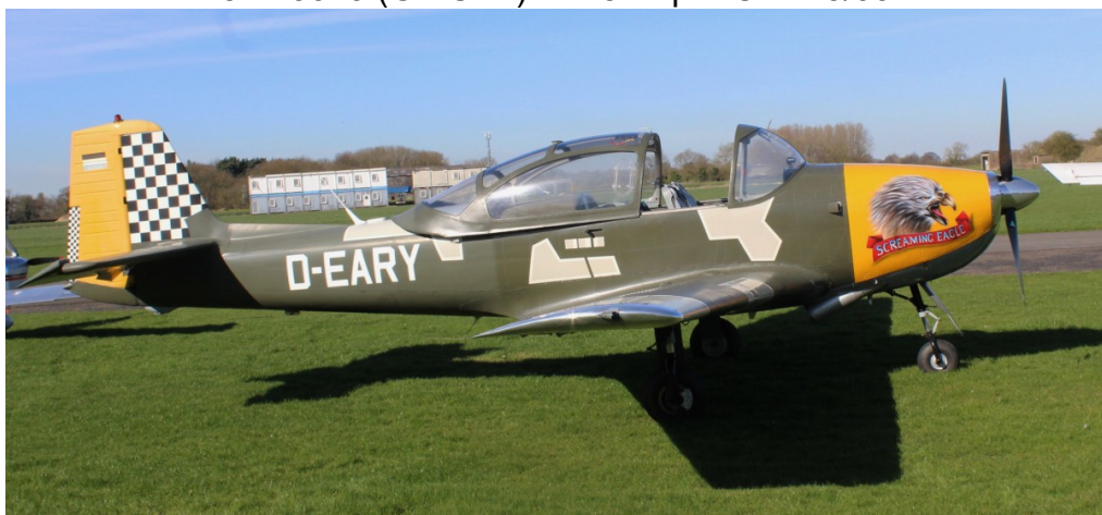
D-EARY Focke Wulf Piaggio P149 25/03