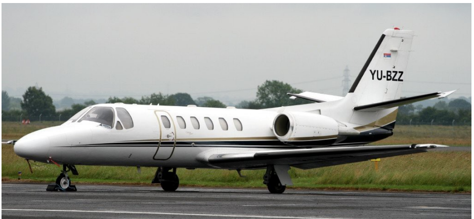
YU-BZZ Ce550 Citation Bravo 30/06