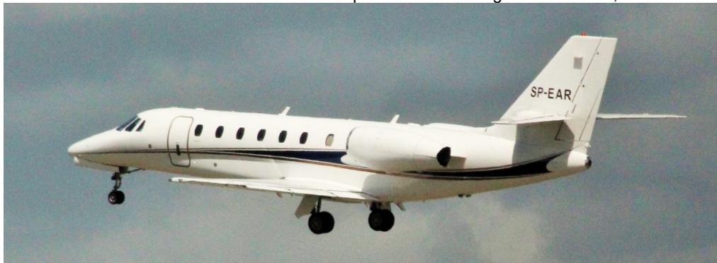
SP-EAR Cessna 680 Sovereign 15/06 Mike Storey

12:03 to Catania, Cessna 560 Excel G-RSXP arr 15:51 from Toulon n/s. Cessna 560 Excel CS-DXP arr 16:09 from Inverness as NJE748G dep 17:15 to Le Bourget as NJE034T,