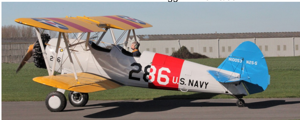
N10053 Boeing Stearman Kaydet 25/03