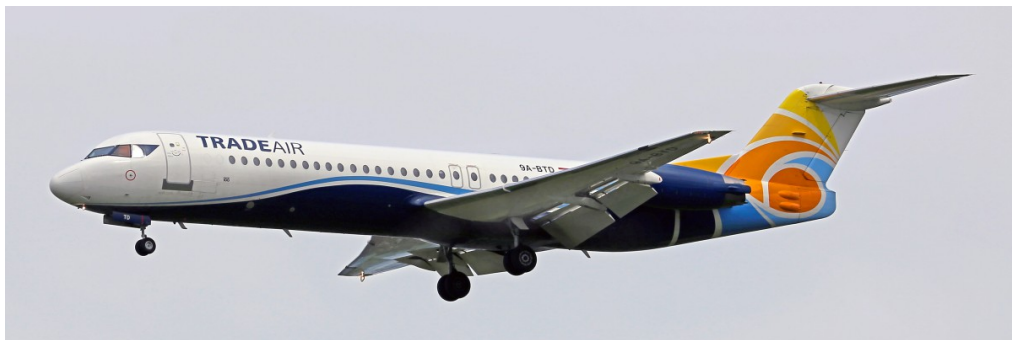
9A-BTD Fokker Trade Air 24/06 Paul Whincup

24/6 9A-BTD(242/9204) operated in from Amsterdam/positioned out to Zagreb.