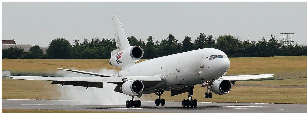
C-GKFD DC-10-30 KF Aerospace 26/06