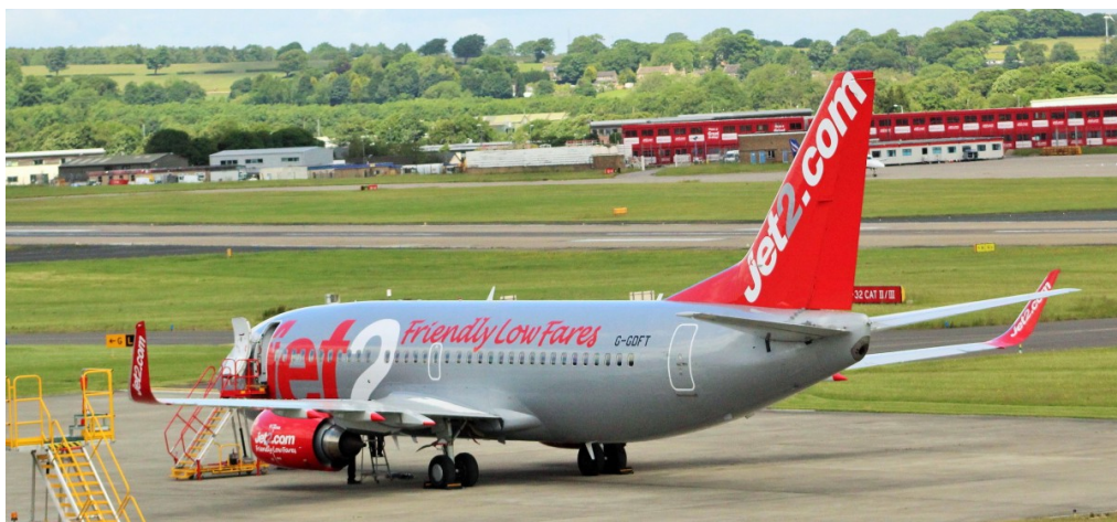
G-GDFT Boeing 737-36Q Jet2.com 15/06