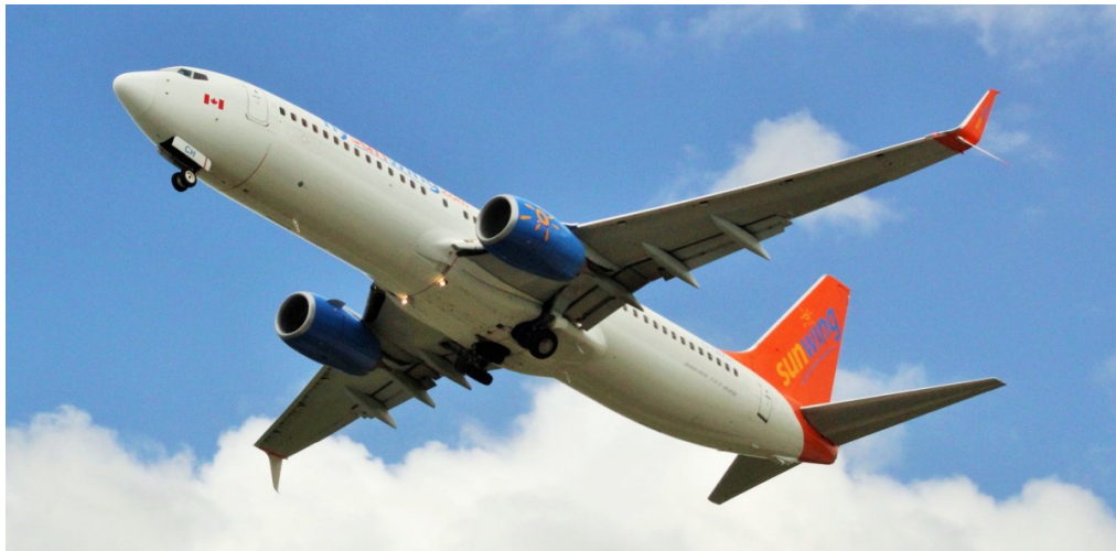
C-GNCH Boeing 737-800 Sunwing 15/06 Mike Storey

Pilatus PC-12 G-KARE arr 07:49 from Biggin Hill dep 10:21 to Goodwood, Cessna 560 Excel CS-XTV arr 15:22 from Newquay, Cessna 560 Excel CS-DXH arr 18:08 from Malaga as NJE693N.