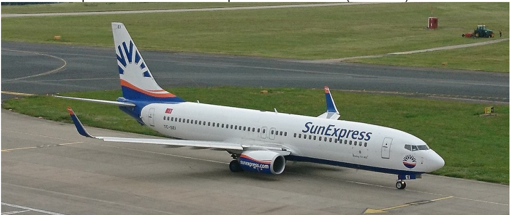
TC-SEI Boeing 737 Sun Express 21/06 Nigel Berry

21/6 TC-SEE operated in from Beirut then positioned out to Izmir(6311/6311).