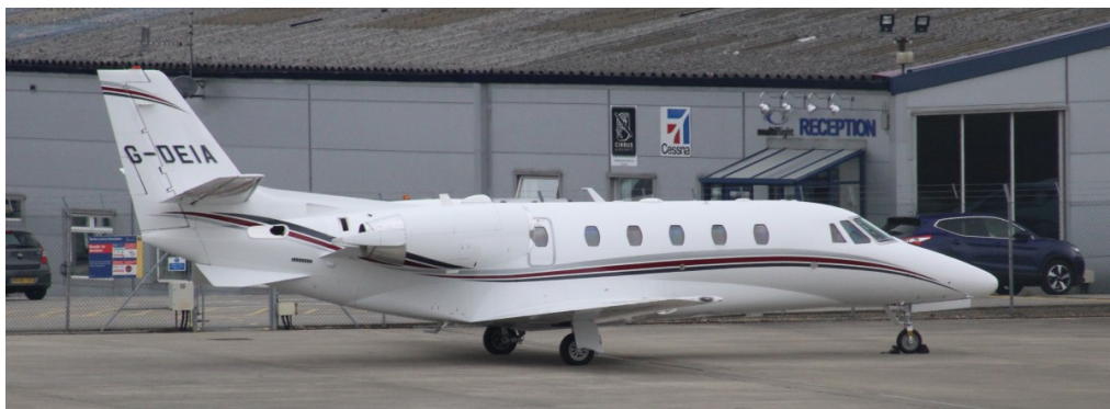
G-DEIA Cessna 560 Excel 20/06 Mike Storey

Phenom 300 D-CJKE arr 05:11 from Munster dep 05:51 to Cannes, beech C90 GT M-TSRI arr 07:41 from Hawarden dep 09:07 to Sligo (ire), Piaggio P180 Avanti M-ONTE arr 09:10 from