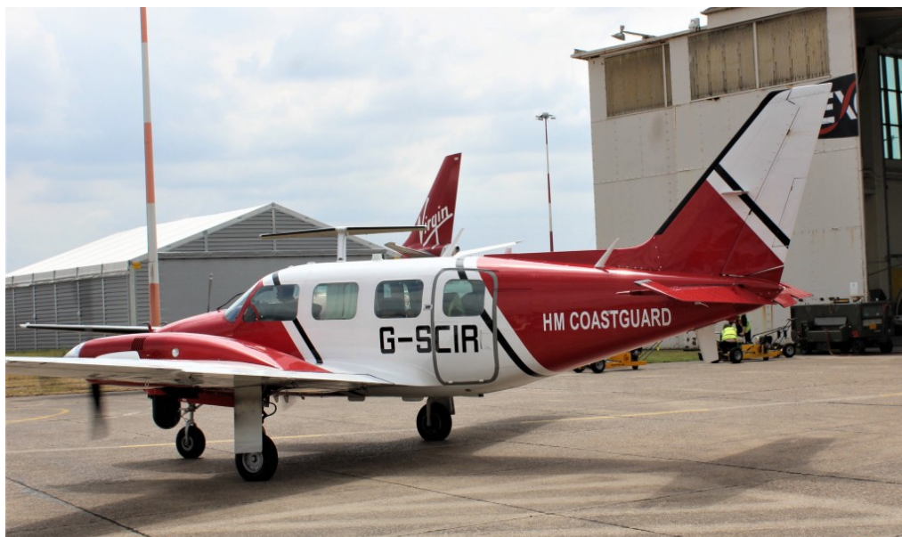
G-SCIR Piper PA31 Navajo 2 09/06 Mike Storey