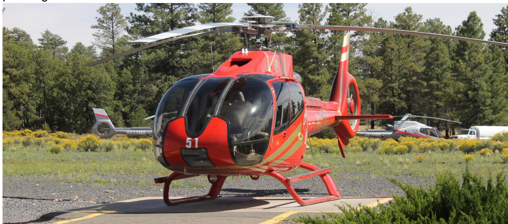
N151GC Eurocopter 130

Following retirement, our first truly Long Haul holiday was the west coast of the USA, taking in California, Arizona and Nevada, flying with Thomas Cook to and from Los Angeles. The flight was around 12 Hours, but to be honest it's more enjoyable than a 4 hour flight to the Canaries on a Airbus A320 or Boeing 737-800. Whilst at the Grand Canyon, we took our first ever flight in a Helicopter. I had never fancied going in a Helicopter at all, but again I was pleasantly surprised how smooth and enjoyable it was. For the record the registration was N151GC a Eurocopter 130. I have since found out that this helicopter was involved in an accident 10 months later when the Oil filter was left off and it resulted in two minor injuries to the passengers!