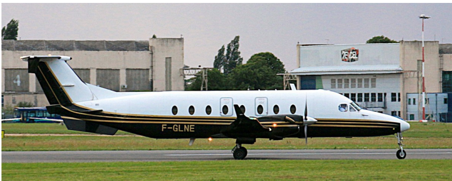
F-GLNE Beech 1900D Twin Jet 27/09

29th UK67002 Boeing 767-300ER Uzbekistan Cargo Airlines (F) 30th TF-AMU Boeing 747-400 Air Atlanta Icelandic Astral Aviation (F) 30th TF-AAL Boeing 747-400 Air Atlanta Icelandic. Medical PPE (F) 30th G-WUKH Airbus A-321 Wizz Air UK. Dep. from storage 30th G-WUKI Airbus A-321 Wizz Air UK. Dep. from storage 30th G-WUKJ Airbus A-321 Wizz Air UK. Dep. from storage. All Wizz Air now departed 30th G-TAWF Boeing 737-800 TUI Dep. from storage.