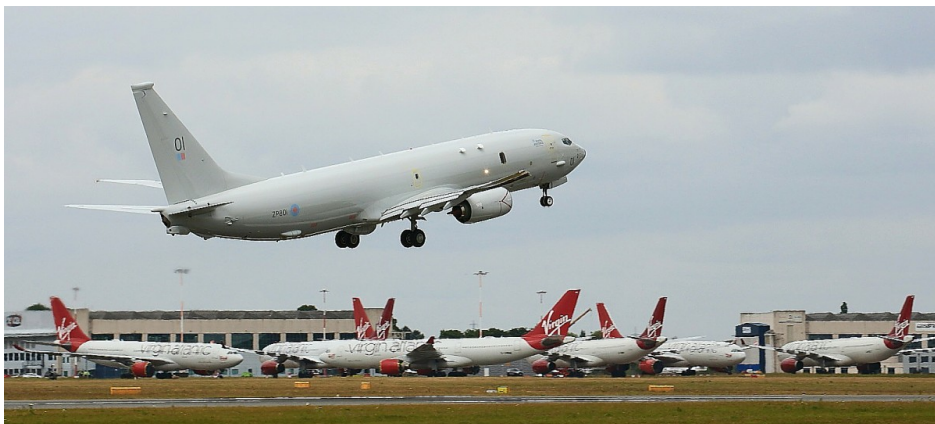
ZP801 P-8A Poseidon 08/06