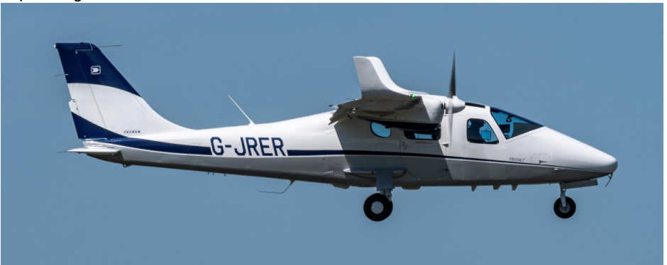
G-JRER Tecnam P2006T 25/06