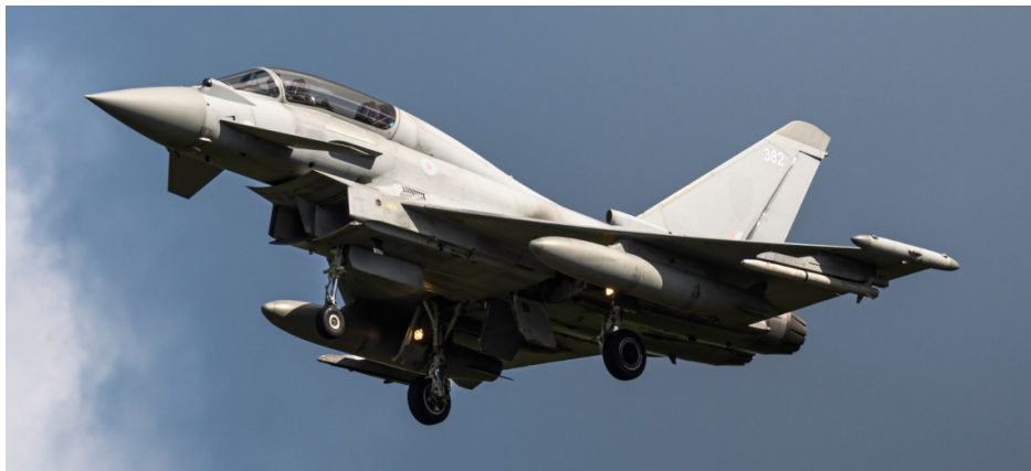
ZK382/382 Eurofighter Typhoon T3 05/06

05/06 ZK382/382 Eurofighter Typhoon T3 f Coningsby o/s RAF - 29 Sqdn, ZK428/428 Eurofighter Typhoon FGR.4 f Coningsby o/s RAF - 29 Sqdn, G-SNJS Ce560XL Citation Excel XLS+ f/t Jersey Gama Aviation, G-VBCA Cirrus SR22 f Wombledon c/t