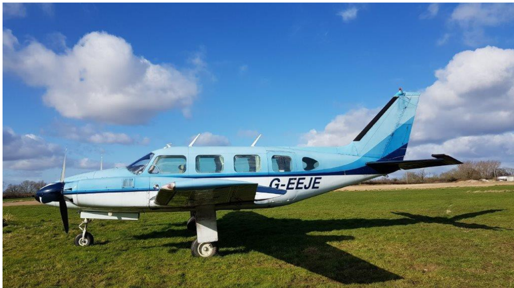
G-EEJE PA-31 Navajo