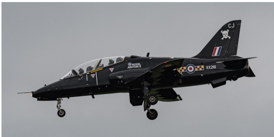
XX261/CJ Hawk T1A 09/06

09/06 ZM333 EMB500 Phenom 100 f Cranwell o/s RAF - 45 Sqdn, XX261/CJ Hawk T1A f Leeming o/s RAF - 100 Sqdn, G-SCTR Piper PA31-310 Navajo f/t Doncaster Sheffield 2Excel Aviation, G-SNJS Ce560XL Citation Excel XLS+ f/t Jersey Gama Aviation