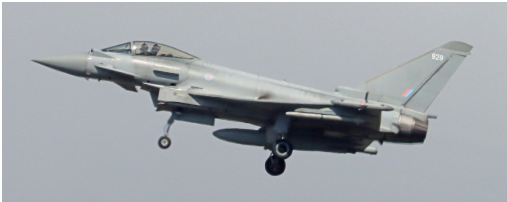
ZJ929 Eurofighter Typhoon 04/06 Paul Whincup

Cessna 525 CJ1 M-OLLY arr 09:01 from Memmingem-allgau n/stop. Eurofighter Typhoon ZJ929 noisy overshoot at 15:22.