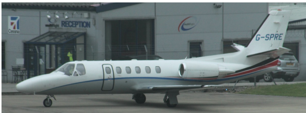
G-SPRE Cessna 550 Citation Bravo 17/06 Ian Gratton