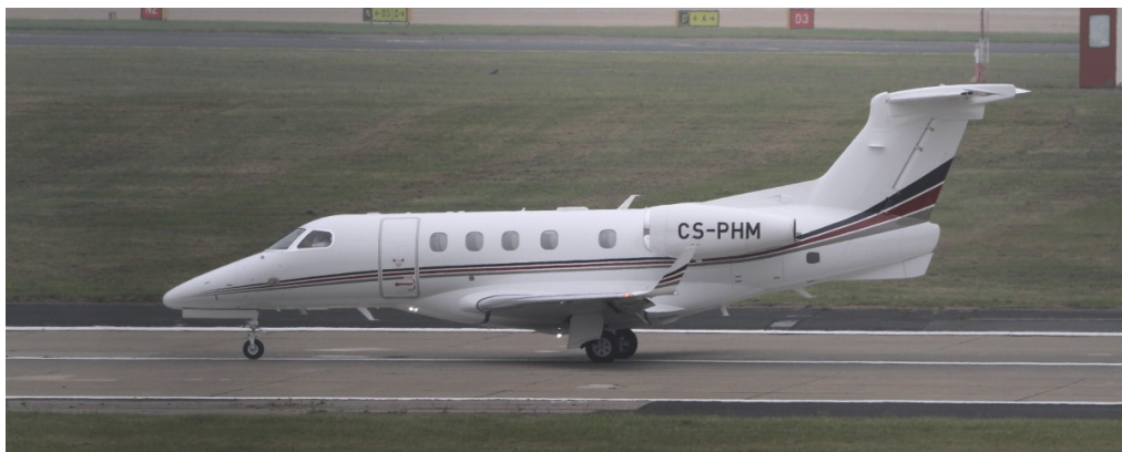
CS-PHM Phenom 300 17/06 Ian Gratton