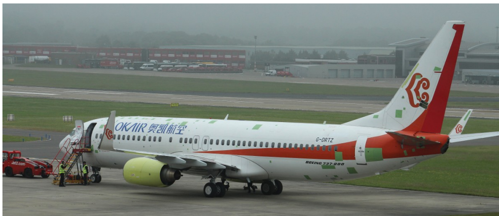
Ian Gratton 17/06

Three photographs of the same aircraft G-DRTZ Boeing 737-800 Jet2.com