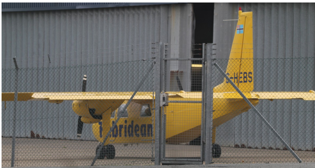
G-HEBS BN-2B Islander 17/06 Ian Gratton