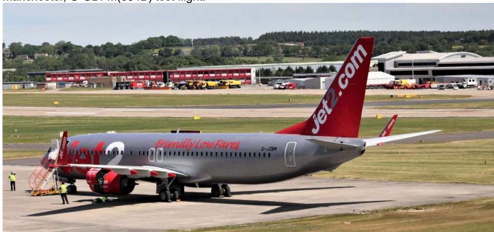
G-JZBM Boeing 737-800 Jet2.com 02/06 Mike Storey

2/6 G-GDFK(051B) test flight, 3/6 G-JZBM(055B) positioned out to Stansted, G-GDFR(051B) positioned in from Stansted, G-JZHV(059B), 4/6 G-GDFU(051B) positioned in from Stansted, 5/6 G-GDFV(055B) positioned out to Belfast, G-GDFG(053B) positioned in from Belfast, 11/6 G-JZJH(053B) positioned out to Newcastle, G-JZBD(051B) positioned in from Newcastle, 12/6 G-JZHC(051B) positioned out to Newcastle, G-DRTB(053B) positioned in from Newcastle, 16/6 G-JZHV(055B) test flight, G-GDFR(99SG) test flight, G-GDFU(052B) positioned out to East Midlands, G-JZHE(054B) positioned in from East Midlands, 22/6 G-GDFR(052B) positioned out to Birmingham, G-DRTR(053B) positioned in from Birmingham, 24/6 G-DRTZ9057B) test flight, 25/6 G-DRTB(6YF) positioned out to Glasgow, G-GDFN(902B) test flight, G-JZBC(66EG) positioned in from Glasgow, G-GDFO(77V) test flight, 26/6 G-JZHE(051B) positioned out to Edinburgh, G-GDFB(1TD) positioned out to Lasham, G-DRTZ(058B) test flight, G-DRTA(052B) positioned in from Edinburgh, G-DRTZ(044E) positioned out to East Midlands, 29/6 G-JZHV(7LL) test flight, 30/6 G-GDFT(052B) test flight, G-LSAJ(051B) positioned out to Manchester, G-GDFM(054B) test flight.