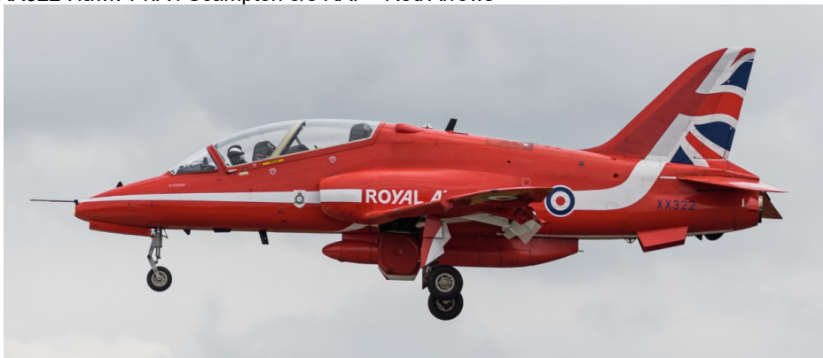
XX322 Hawk T1.A 08/06

08/06 XX322 Hawk T1.A f Scampton o/s RAF - Red Arrows