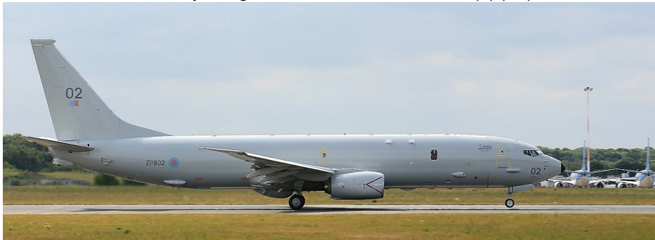
ZP802 P-8A Poseidon 08/06