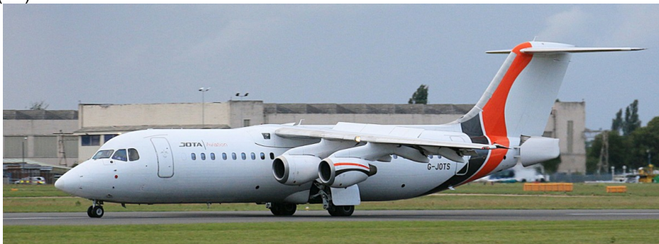
G-JOTS BAe-Avro RJ-100 Jota Aviation 27/06

23rd TF-AMU Boeing 747-400 Air Atlanta Icelandic Astral Aviation (F) 23rd UR-CSX Boeing 767-300ER Ukrainian Wings (Kam Air) (Pax/F) 24th TF-AMN Boeing 747-400 Air Atlanta Icelandic Magma Aviation (F) 24th G-VRAY Airbus A-330-300 Virgin Atlantic Dep. from storage 24th VP-BCV Boeing 747-400 Silkway West Airlines (F) 25th TF-AAL Boeing 747-400 Air Atlanta Icelandic. Medical PPE (F) Dep. 26th 26th G-VLUV Airbus A-330-300 Virgin Atlantic Dep. from storage 26th VQ-BGP Boeing 777-300 Royal Flight. medical PPE. (Pax/F) 27th UK67002 Boeing 767-300ER Uzbekistan Cargo Airlines (F) 27th TF-AMI Boeing 747-400 Air Atlanta Icelandic Magma Aviation (F) 27th TF-AAL Boeing 747-400 Air Atlanta Icelandic. Medical PPE (F) Dep. 29th 27th G-JOTS BAe-Avro RJ-100 Jota Aviation. Brought Arsenal FC for match v Sheff Utd. (FV)