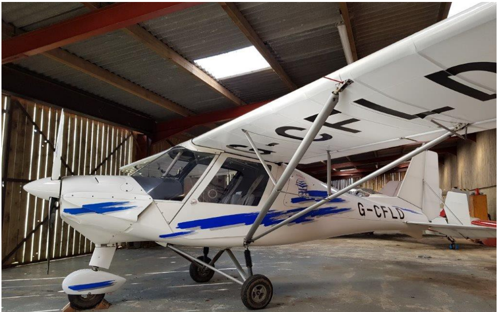
G-CFLD Ikarus C42 FB80