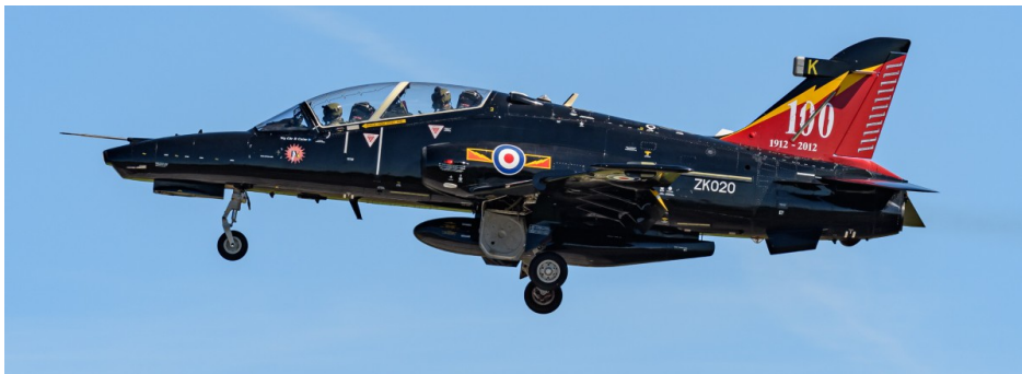
ZK020/K Hawk T2 01/06

01/06 ZK020/K Hawk T2 f Valley o/s RAF- 4 FTS (4 Sqdn)