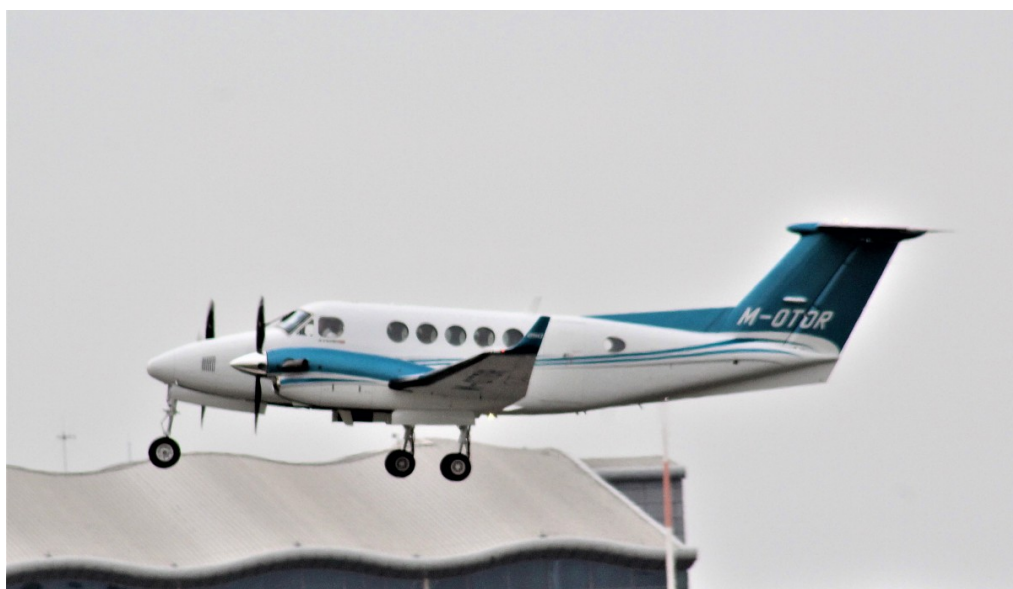
M-OTOR beech 200 Super Kingair 09/06 Mike Storey