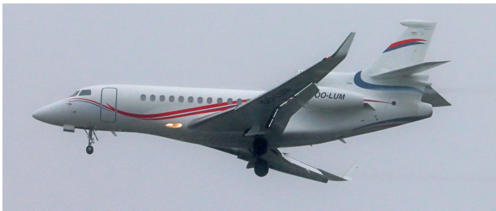
OO-LUM Falcon 7X 03/06 Paul Whincup

Belgian Air Force Falcon 7X OO-LUM arr 10:14 fr Brussels dep 10:39 to Shannon, Cessna 525A CJ2 G-TWOP arr 11:14 fr Toulouse n/stop, Cessna 525 CJ1 F-HAJD arr 12:34 from Angouleme-Cognac dep 13:29 to Marseille,