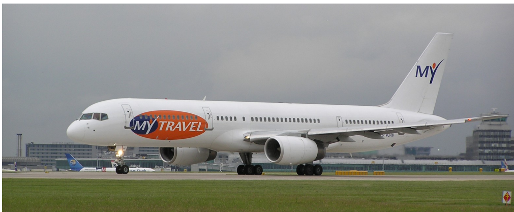
G-WJAN Boeing 757

Airtours changed to MyTravel in 2002 and our first MyTravel flight was in July 2002 to/from Larnaca in Cyprus on Boeing 757's (G-MCEA and G-WJAN) which at that time were the workhouse of the MyTravel fleet and was our longest flight to that date with a child..