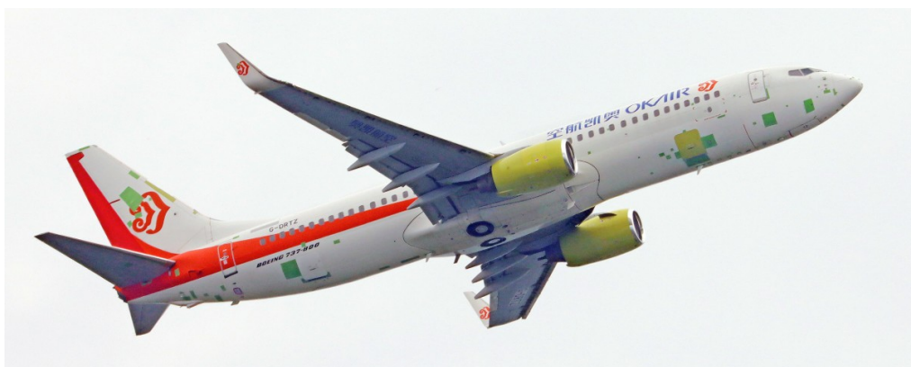
Paul Whincup 26/06 To East Midlands for painting