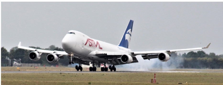
TF-AMU Boeing 747-400 Air Atlanta Icelandic Astral Aviation 09/06