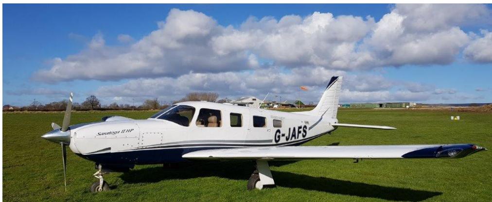
G-JAFS PA-32R Saratoga II

G-BSPE/46 F172P Skyhawk NFD 16-11-2018 G-CENO WT9 Dynamic G-HOLA PA-28 Turbo Dakota G-PAWS AA-5A Cheetah NFD 24-1-2020 , mtce N246FA Cirrus SR-20