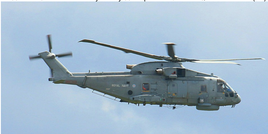
ZH837 EH-101 Merlin HM2 Royal Navy 802 Sqdn 27/09

(FV) First Visit. (T) Training. (H) Helicopter. (F) Freighter. (M) Maintenance/Textron.