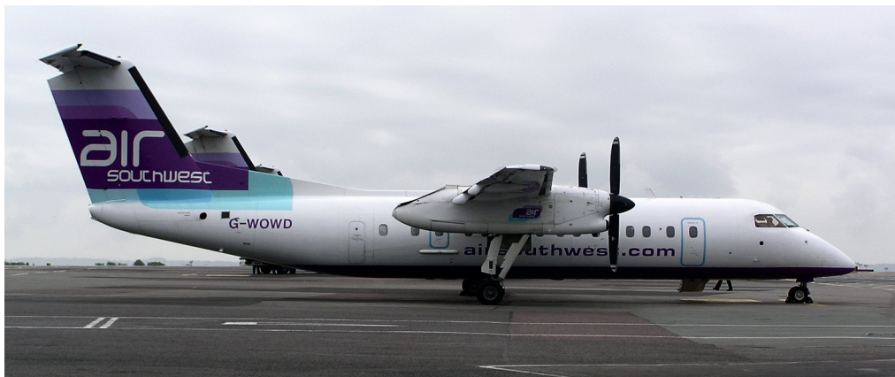
G-WOWD Dash 8-300