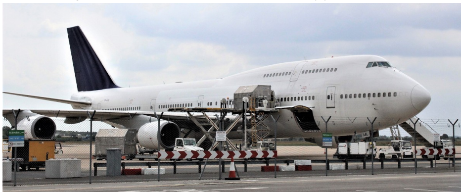
TF-AAL Boeing 747-400 Air Atlanta Icelandic 09/06