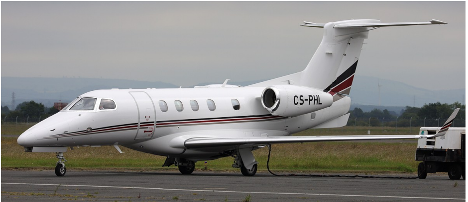
CS-PHL Embraer EMB-505 Phenom 300 18/06

18/06 CS-PHL Embraer EMB-505 Phenom 300 f Dublin t Geneva NetJets Europe, 2-COOK Piper PA46-500TP Meridian f Retford Gamston t Lugano