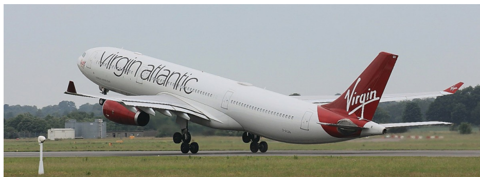
G-VLUV Airbus A-330-300 Virgin Atlantic 26/06