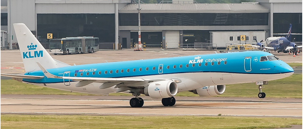
PH-EZW Embraer 190 KLM 09/06 Stewart Robertshaw

Amsterdam (1541/1542, "1541/1542"):-2/6 PH-EXI, 3/6 PH-EXI, 4/6 PH-EXT, 5/6 PH-EZW, 6/6 PH-EXG, 7/6 PH-EZW, 9/6 PH-EXX, 11/6 PH-EXJ, 13/6 PH-EXG, 14/6 PH-EXH, 15/6 PH-EXH, 16/6 PH-EXK, 17/6 PH-EXK, 18/6 PH-EXJ, 19/6 PH-EZM, 20/6 PH-EXI, 22/6 PH-EXM, 24/6 PH-EXG, 25/6 PH-EXG, 26/6 PH-EXI, 27/6 PH-EXT, 28/6 PH-EZK, 29/6 PH-EXW, 30/6 PH-EZM.