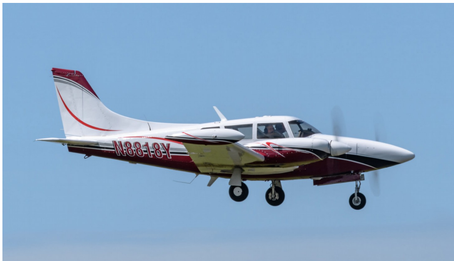
N8818Y Piper PA-30 28/06

28/06 N8818Y Piper PA-30 Twin Comanche f Kirkwall n/s,