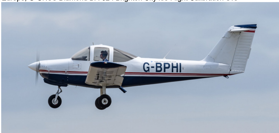
G-BPHI Piper PA-38 Tomahawk 29/06

30/06 N842VV Cirrus SR22T f/t Birmingham, 2-NGUT Diamond DA62 f/t Oxford TwinStar4Hire Ltd, CS-PHH Embraer Phenom 300 f Brescia Avignon Provence NetJets Europe, G-GNSS Diamond DA-62 f Brighton City n/s Flight Calibration Svs