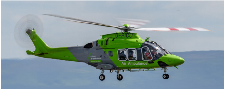
G-PICU Leonardo AW169 12/06