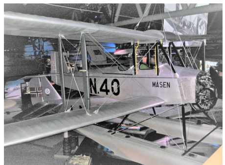
Replica of a ISK Saaski 2. A Finnish design but the first aeroplane to fly the length of Norway.

P.S. BTW while in the region we did see the aurora borealis one night, but were underwhelmed. However, the snow was superb.