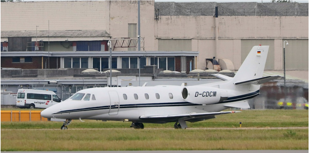
D-CDCM Citation 560XLS Air Hamburg 26/06

(FV) First Visit. (T) Training. (H) Helicopter. (F) Freighter.