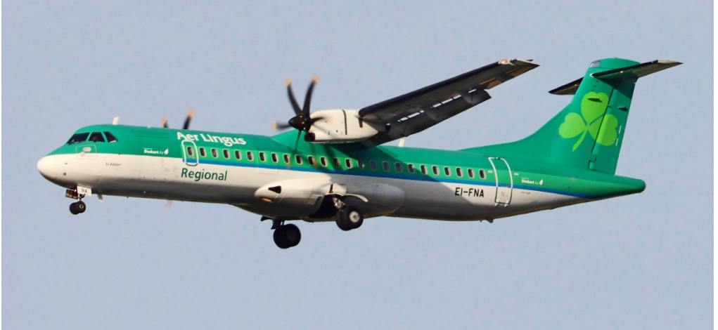
EI-FNA ATR 72 Stobart Air (Last FLight into LBA) 11/06 Paul Whincup

Belfast (3678/3679, “3678/3679”, Sun):-1/6 EI-FSK, 2/6 EI-FSL, 3/6 EI-FMJ, 4/6 EI-FMJ, 6/6 EI-FSK, 7/6 EI-FSL, 8/6 EI-FMJ, 9/6 EI-FMJ, 10/6 EI-FNA, 11/6 EI-FNA.