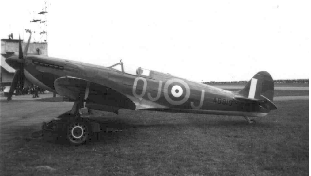
1958 AB910 Spritfire QJ-J