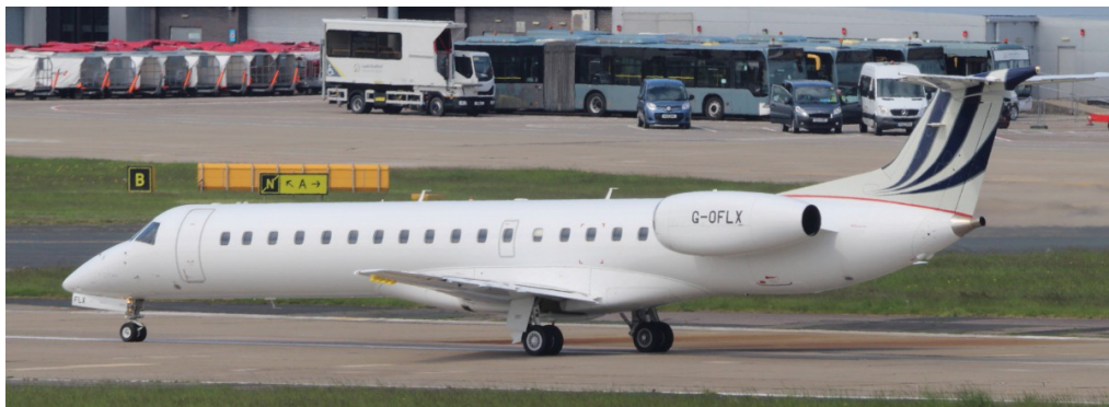
G-OFLX Embraer 145 BAE Systems 02/06

Pilatus PC XII G-KARE arr 08:07 fr Exeter dep 08:36 to Elstree ret LBA at 10:33 fr Exeter n/stop, Phenom 300 D-CMXM dep 09:03 to Faro, Embraer 145LR G-OFLX f/t Farnborough (09:12/15:18), Pilatus PC XII G-PKHA to/fr Bern (11:04/17:16), PA-28R Cherokee Arrow G-AZSF arr 11:47 fr Doncaster n/stop, PA-31T Cheyenne PH-SVX dep 12:57 to Teuge, Cessna 750 Citation X N950M dep 15:09 to Bangor (USA), Legacy 500 G-HARG arr 15:41 fr Malaga dep 16:41 to Southend, R/C F406 Caravan G-MAFA arr 15:45 fr Cranfield n/stop, Vessna 525C CJ4 D-CEFE arr 17:54 fr Malaga dep 18:32 to Stuttgart,