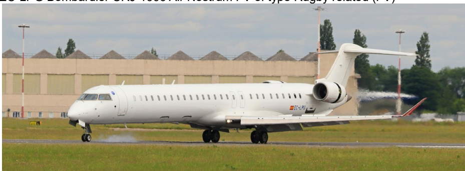
EC-LPG Bombardier CRJ-1000 Air Nostrum 13/06