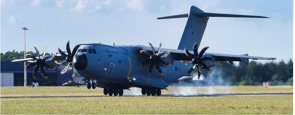
ZM411 Airbus A400M-180 16/06 Michael Hanks