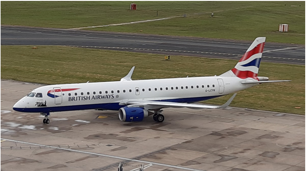
G-LYCN Embraer 195SR British Airways 14/06 Nigel Berry