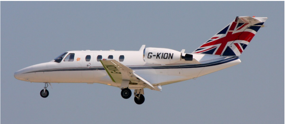
G-KION Ce525 CitationJet CJ1 02/06

02/06 G-GULY Beech C90B King Air f/t Dunkeswell, G-KION Ce525 CitationJet CJ1 n/s t Newquay Bookajet, G-APFV Piper PA-23-160 Apache f Private Site n/s, G-BOCU Piper PA-34 Seneca III f Sherburn in Elmet c/t Advanced Aircraft Lease