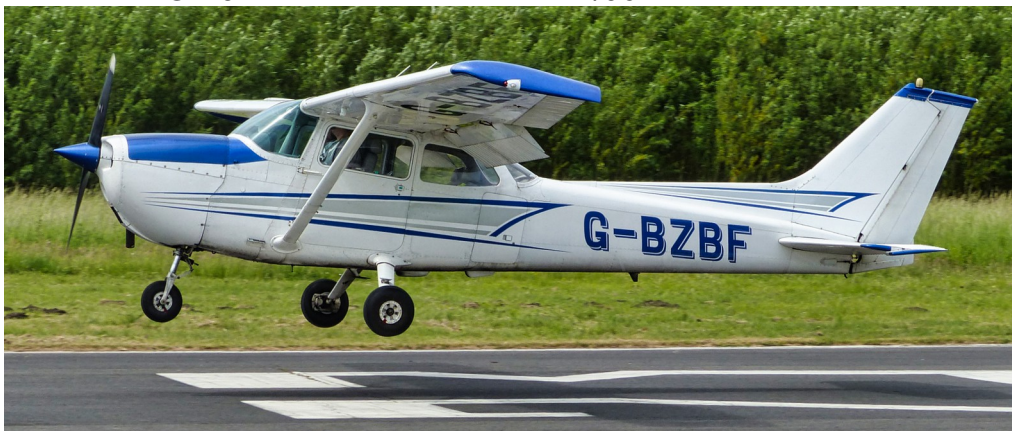
G-BZBF Cessna 172 19/06