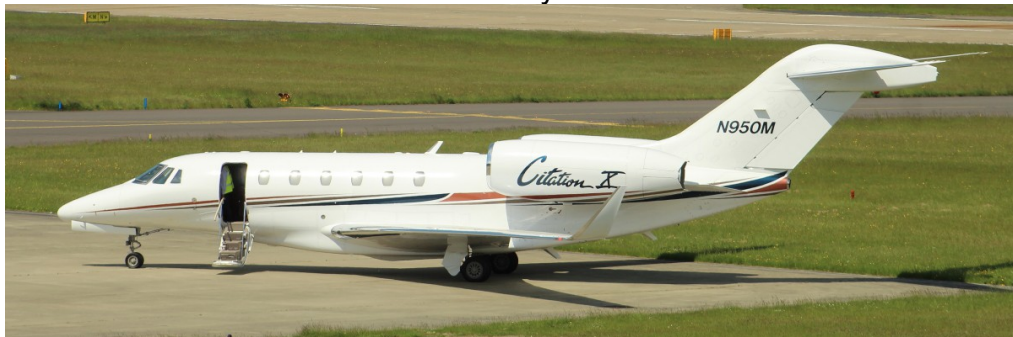
N950M Citation 750 Acorn Stairlifts 02/06 Ian Gratton