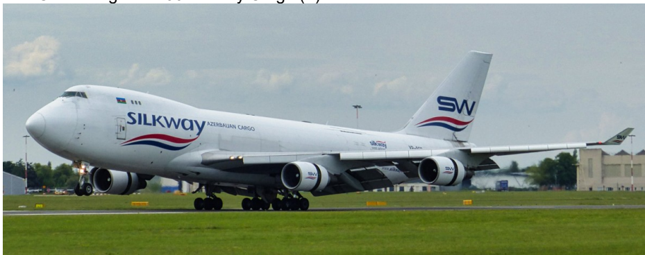
VP-BCR Boeing 747-400 Silkway Cargo 07/06