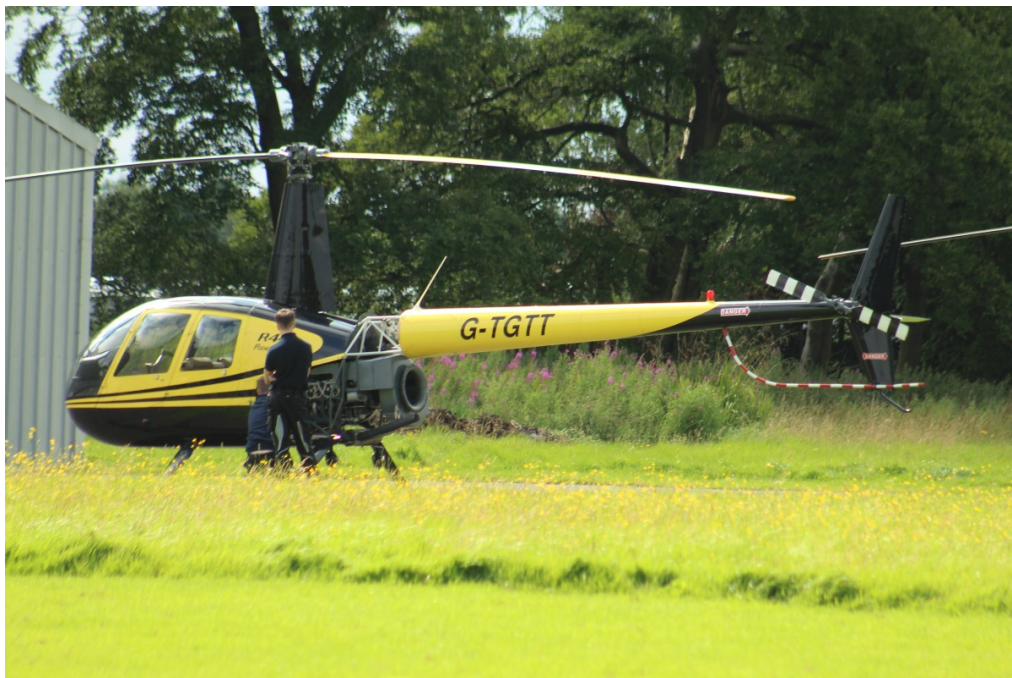
G-TGTT Robinson R44