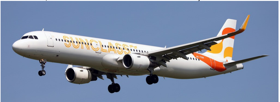
OY-TCH Airbus A321-211 01/06

01/06 G-EZDH Airbus A319-111 f/t London Gatwick EasyJet (Crew Training), G-TXTV Agusta A109E Power f Private Site t Redhill Arena Aviation, OY-TCH Airbus A321-211 f Graz n/s Sunclass Airlines (bringing the Austrian football team for a Euro 2020 warm-up), G-JAAM Diamond DA62 arrived 31/05 t Blackpool Fly Private Ltd, EI-DHY Boeing 737-8AS f/t Palma de Mallorca Ryanair (make their return after an 11-year gap!), G-KION Ce525 CitationJet CJ1 f Southend n/s Bookajet, G-UKCS Piper PA-31 Turbo Navajo f/t Doncaster Sheffield 2Excel Aviation, G-BAEO Cessna 172 Skyhawk f/t Leeds Bradford Hields Aviation, G-JAAM Diamond DA62 f East Midlands n/s Fly Private Ltd