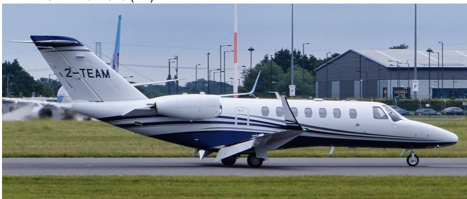
2-TEAM CitationJet 525 28/06 Michael Hanks