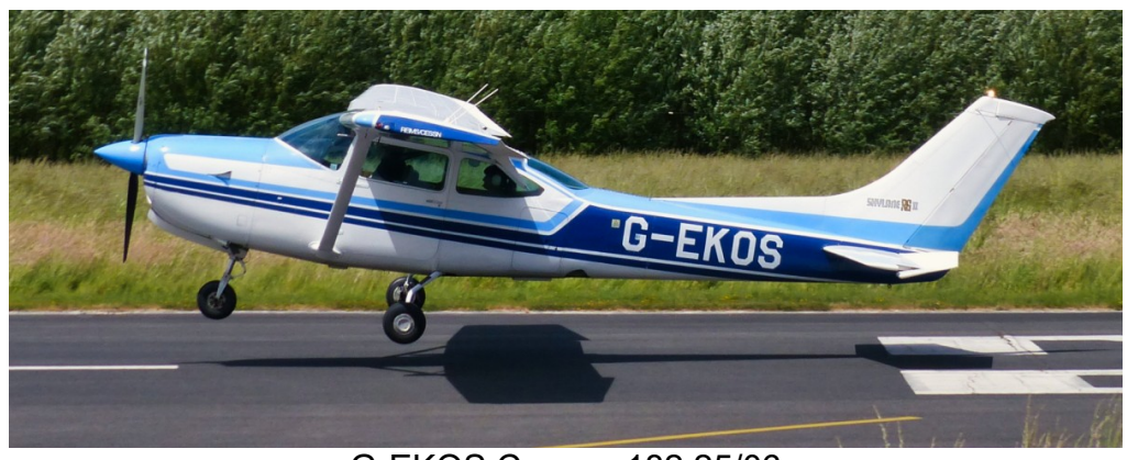
G-EKOS Cessna 182 25/06