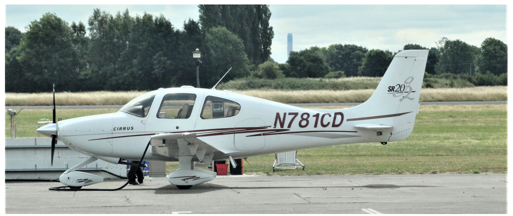
N781C Cirrus SR20