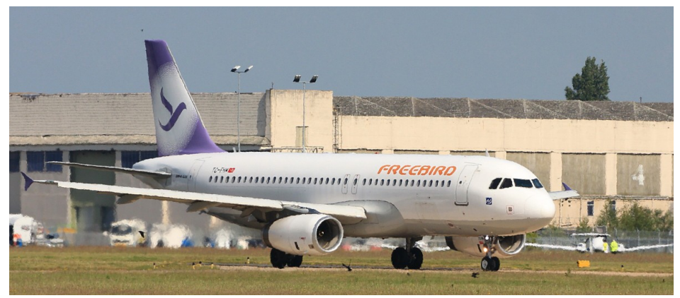
TC-FHM Airbus A-320 Freebird 02/06