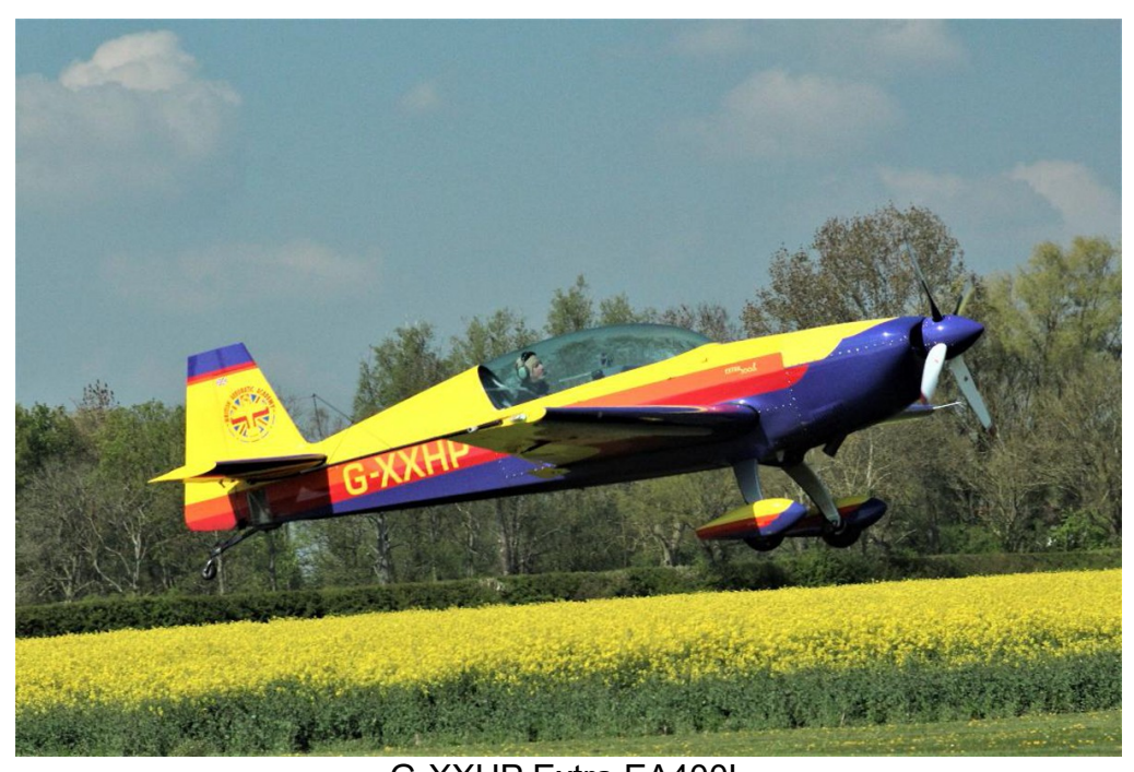
G-XXHP Extra EA400L