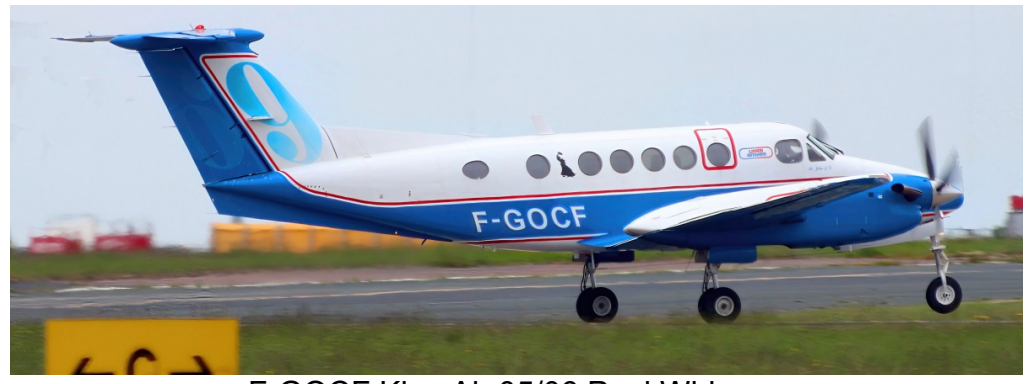
F-GOCF King Air 05/06 Paul Whincup

Phenom 300 CS-PHA arr 08:12 dep 09:35, Cessna 525A CJ2 G-TWOP arr 09:08 dep 09:53, Cessna 550 Bravo YU-SXX dep 13:25, Cessna 525A CJ2 D-IJOA dep 14:08, Cessna 210 Centurion G-TOTN arr 15:59 n/stop, Learjet 60 D-CITA arr 19:26 dep 19:57.