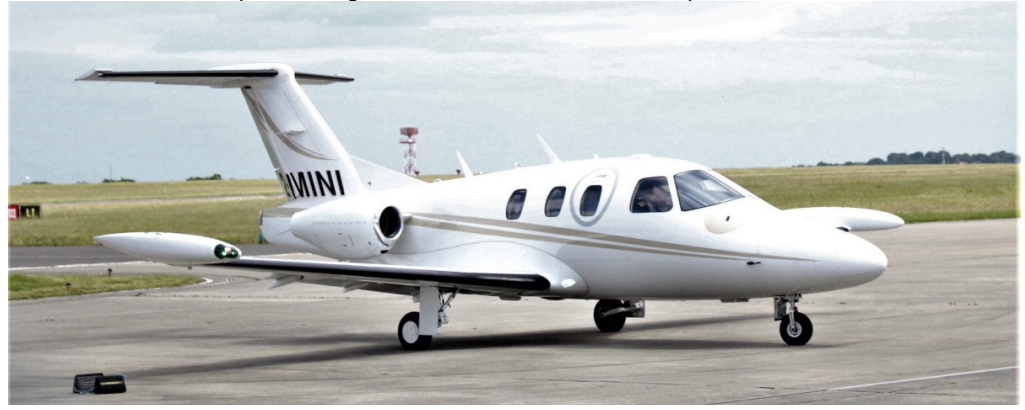
2-MINI Eclipse 500 12/06 Mike Storey

Legacy 650 D-AIRG dep 08:31, Eclipse Ea500 2-MINI arr 13:16 dep 13:57, Phenom 300 <u>CS-PHS</u> arr 17:22 n/stop, Cessna 560 Excel 9H-XOB arr 17:27 m/stop, Beech 350 Kingair F-HMUT arr 17:40 n/stop. Challenger 604 D-AFAD arr 22:09 n/stop.