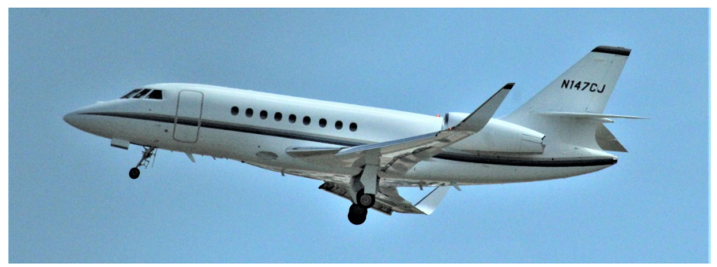
N147CJ Falcon 2000EX 21/06 Mike Storey

14:38 dep 16:06, Hawker 850XP <u>G-IMGP</u> arr 15:30 dep 16:02. Cessna 525C CJ4 G-JNRE arr 18:02 dep 18:44