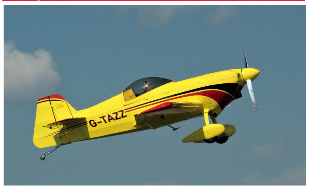
G-TAZZ Rihn DR107 One Design