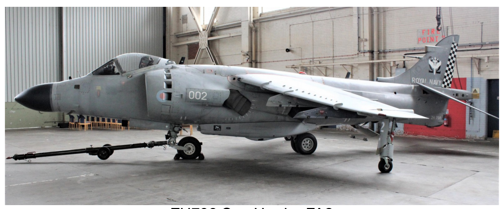
ZH798 Sea Harrier FA2