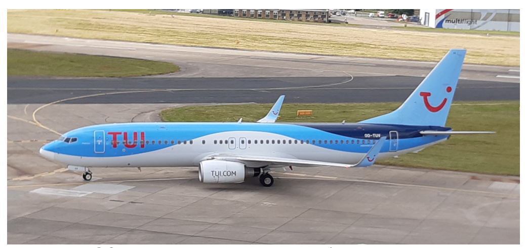
OO-TUV Boeing 737-800 TUI 30/06 Nigel Berry

Jetairfly(JAF/TB, "Beauty") :-30/6 OO-TUV(960F/9610/9611/961F) positioned in from Ostend, operated charter to/from Barcelona, then positioned back to Ostend.