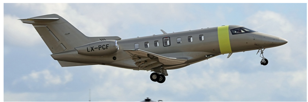
LX-PCF PC24 Jetfly 26/06 Paul Whincup

Eclipse EA500 2-MINI dep 08:47, Pilatus PC XII LX-PCF dep 09:09, Cessna 560 Excel D-CSMC arr 11:54 dep 13:36, Challenger 350 CS-CHJ arr 13:50 dep 15:45, Falcon 2000DX LX-SAB arr 17:02 dep 18:14, Phenom 300 CS-PHH arr 18:58 n/stop. Cessna 680 Latitude N690QS arr 21:39 n/stop