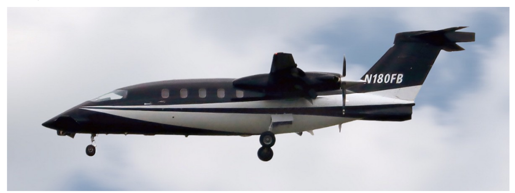
N180FP Piaggio 180 06/06 Paul Whincup

Cessna 525B CJ3 2-TEAM arr 08:04 dep 09:43, Cessna 525A CJ2 G-JNRE arr 09:14 dep 14:14, Cessna 680 Latitude CS-LTJ dep 10:58, Piaggio P180 Avanti N180FB arr 11:00 dep 12:42, Robinson R44 Raven G-WEAT arr 11:24 dep 12:15, learjet 35A D-CEXP arr 14:07 dep 14:51,