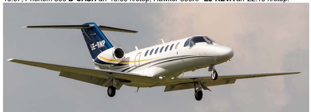
SE-RNP Citation CJ3-EFS Flt Svs 23/06 Stewart Robertshaw

Phenom 300 CS-PHB dep 07:32, Diamond Da62 M-ARKS arr 09:22 dep 10:05, PA-46 Malibu N60JM arr 13:58 n/stop, Cessna 182 Skylane N3492F arr 14:45 dep 15:45, Cessna 525B CJ3 SE-RNP arr 15:24 n/stop, Phenom 100 ZM337 ILS approach at 15:43, Cirrus Sr22 N19DW dep 16:07, Phenom 300 D-CASH arr 18:09 n/stop, Hawker 800XP EJ-REVA arr 22:19 n/stop.