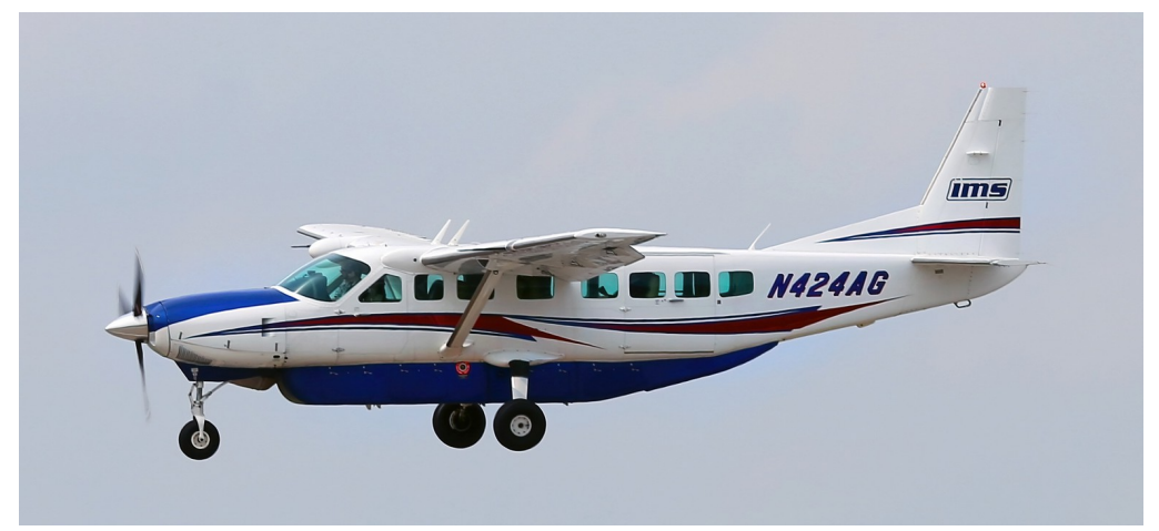
N424AG Cessna 208 24/06 Paul Whincup

13:29 dep 14:18, Cessna 560 Excel CS-DXN arr 13:34 dep 16:09, Cessna 560 Excel D-CSMC arr 14:33 dep 17:13, Cessna 525A CJ2 G-JNRE arr 14:50 n/stop, Pilatus PC-24 SE-DZP arr 14:56 dep 15:57, Global Express C-GLXM arr 18:25 dep 19:05, Pilatus PC XII G-OTPL arr 18:43 dep 19:02. Cessna 525B 2-RBTS arr 20:37 n/stop