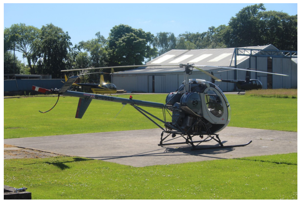
G-BXSG R22 25/06 Ian Gratton