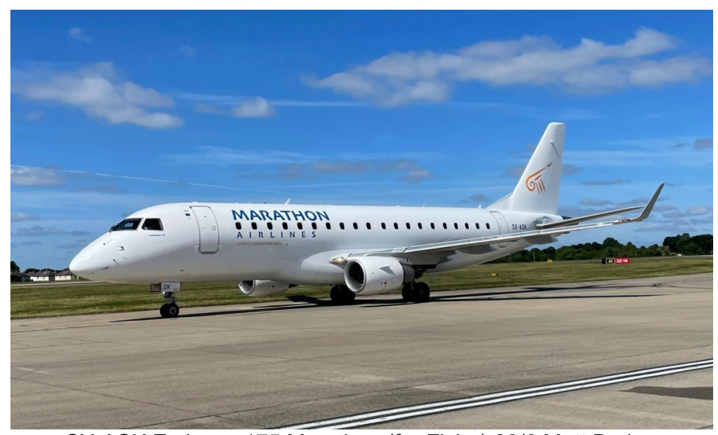
SX-ASK Embraer 175 Marathon (for Flybe) 20/6 Matt Barker

As350B Ecureuil <u>G-JOZI</u> arr 08:04 n/stop, Cessna 525A CJ2 D-IBCG arr 08:47 dep 09:58, PA-32R Saratoga G-JAFS dep 10:04, Legacy 650 D-ANXA dep 12:32, Cessna 525B CJ2 2-TEAM arr 13:54 dep 14:31, Cessna 525B CJ3 D-COKE dep 14:18, Cessna 525A CJ2 D-IAKN arr 15:31 dep 17:04, Piper Pa-46 Malibu N60JM dep 16:03, Cessna 650 VII PH-MYX arr 16:07 dep 16:46, Phenom 300 CS-PHS arr 17:30 n/stop, Hawker 800XP <u>EJ-GABJ</u> arr 18:01 n/stop, Hawker 800XP EJ-REVA arr 21:11 n/stop