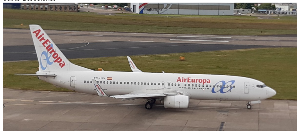
EC-LXV Boeing 737-800 Air Europa 28/06 Nigel Berry

Air Europa(AEA/UX, "Europa") :-26/6 EC-LXV(984/985) positioned in from Madrid/operated out to Barcelona.