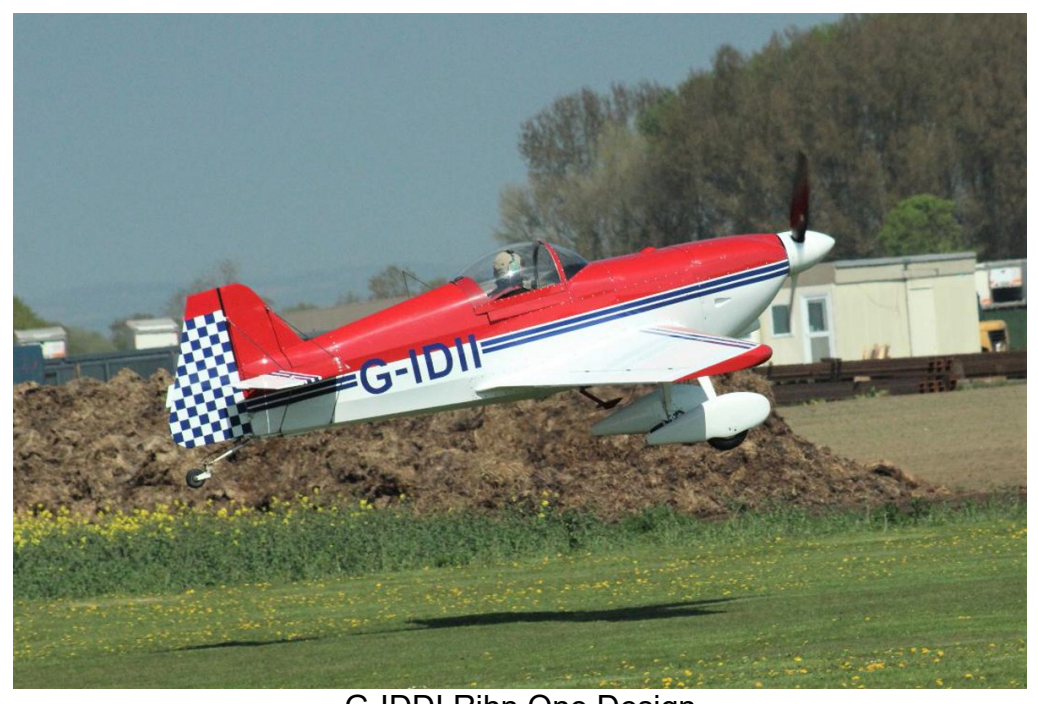
G-IDDI Rihn One Design