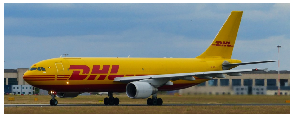
EI-OZM Airbus A-300 D.H.L. 30/06