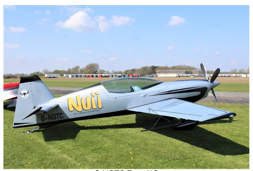
G-NGTC Extra NG