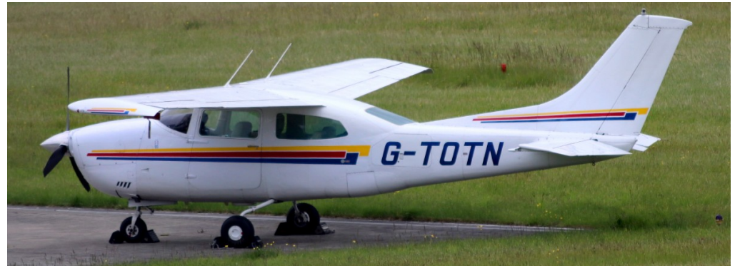
G-TOTN Cessna 210 Centurian 05/06 Paul Whincup

Hawker 400 OK-BZZ dep 07:40, Diamond Da62 M-ARKS arr 09:25 n/stop, Cessna 210 Centurion G-TOTN dep 10:02, Cessna 560 Excel 9H-XOC dep 10:46, Challenger 300 OK-RPM arr 13:34 dep 14:04, Cessna 510 Mustang OE-FDT arr 13:45 dep 15:08, Global 6000 9H-VJY arr 17:18 dep 18:34, Cessna 525 M2 SE-RVZ arr 17:55 dep 18:29, Cessna 680 Latitude CS-LTJ arr 19:23 n/stop.