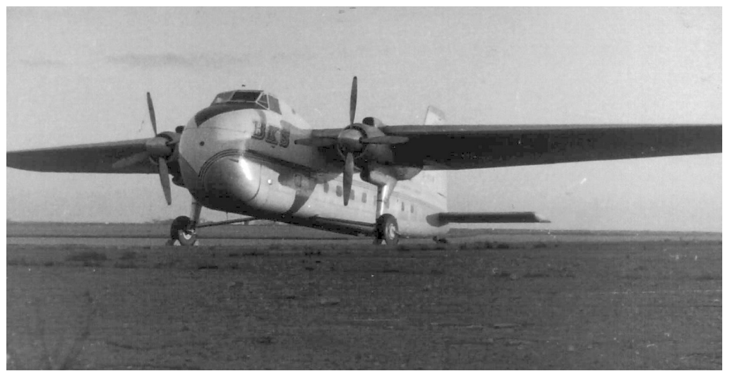
BKS Bristol Freighter

7371M de Havilland DH.112 Venom FB.1 ex WE270 RAF. This photo arrived anonymously to me by post some years ago, so photographer unknown. Taken on 7 June 1954 at what looks like the SSAFA Air Show in that year. The Venom was a single engine, single seat fighter bomber (FB). It had a short service life: delivered in 1952, went to maintenance (M) in 1954 and scrapped 1958. Behind is Gloster Metoer F.4 RA476.