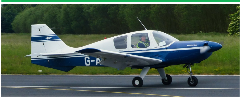
G-AWWE B121 PUP 04/06