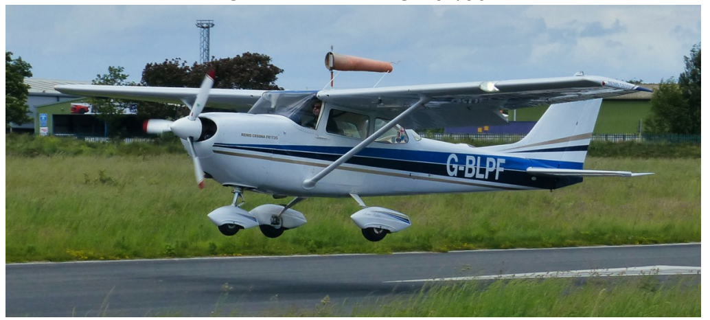
G-BLPF Cessna 172 Rocket 11/06