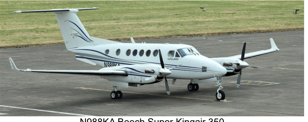
N988KA Beech Super Kingair 350