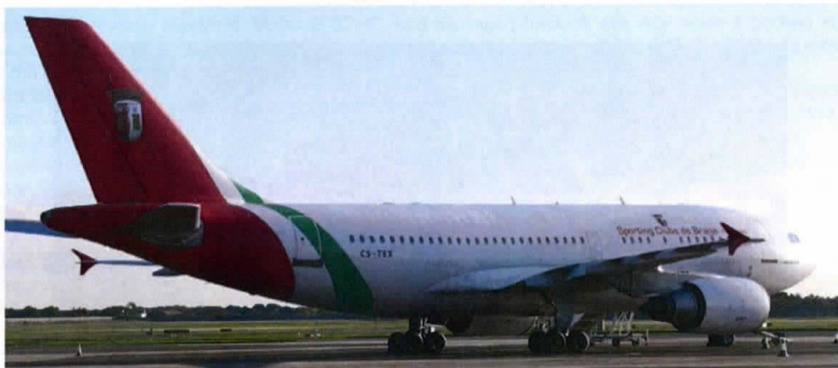
Hi-Fly Airbus A.310 CS-TEX, which is a temporary resident at Doncaster

Doncaster(Aeroventure):- In early October Cessna F.150G G-AVAA went on public display following a comprehensive restoration in the workshops. It is in fact a composite of several airframes, however the most significant is the 1967 vintage G-AVAA. On the debit side F.150H G-AWCL, Ercoupe N3188H, R.22B G-VOCE are no longer with the collection. Also leaving have been Tiger Moth NM145 and Chipmunk WB560, the latter to South Molton, Devon. New arrivals have included two Typhoon cockpit sections, whilst due to join them soon are similar sections of a Hurricane, a Tempest II, and a Tempest TT.5, possibly SN260. Also new is the cockpit section of former Royal Canadian Air Force Lancaster "976" and an unidentified Benson B.7 Autogyro. The Beagle Pup forward fuselage and cockpit section has now been identified as HB-NAV