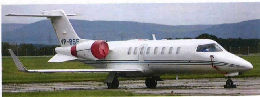
Lear Jet 45 VP-BSF which visited LBA on 14/10, pictured earlier on a visit to Teesside

GENERAL AVIATION:- Cessna T.303 Crusader G-UILT f/t Blackpool(1152/1747). DA-42 G-GFDA(Equity 02), ILS and overshoot(1751), f/t Blackpool.