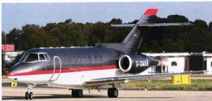
Hawker 1000 G-GMAB of Gama Aviation lining up on 14, 6/10(Robert Burke)

GENERAL AVIATION:- Cessna 441 EI-DMG from Dublin/Weston(0749) to Cardiff(1504).