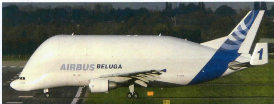
F-GSTA A.300-600ST Beluga, Airbus Industries Chester/Hawarden, 06/10/10 Andrew Barker