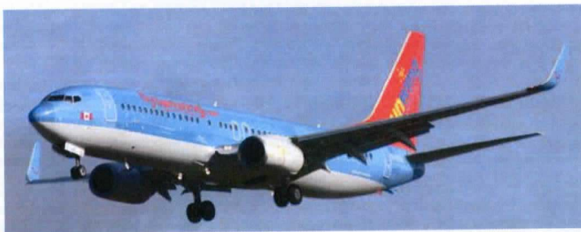
Boeing 737/800 G-FDZA landing at Toronto/Pearson 20/11

EI-DAT & EI-DAX are now parked remotely at Prestwick minus titles & logo.