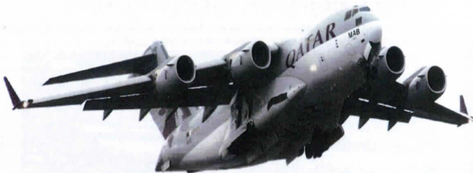
MAB C-17A Globemaster III, Qatar Air Force Manchester International, 11/11/10