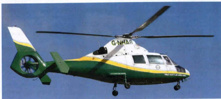
Dauphin G-NHAB, the second aircraft for The Great North Air Ambulance. This machine, formerly G-DAUF is like sister ship G-NHAA operated by Leeds-based Multiflight Aviation.

Next Year? Well, I have been converting my Tesco vouchers to Air Miles and at the moment there aren't any good deals on flights to Germany. I also contemplated going to the Dubai Air Show but that coincides with my Mother's 90 th birthday. Anybody have any suggestions (polite ones please).