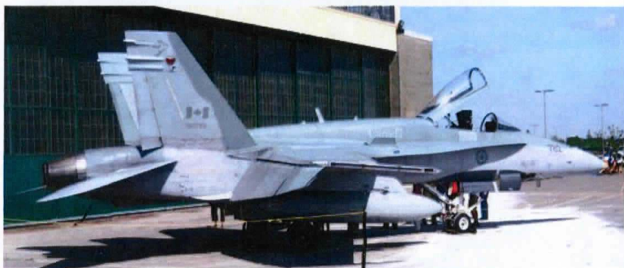
188782 F-18A Hornet, Canadian Air Force Toronto/Downsview, 29/05/10 Ian Morton