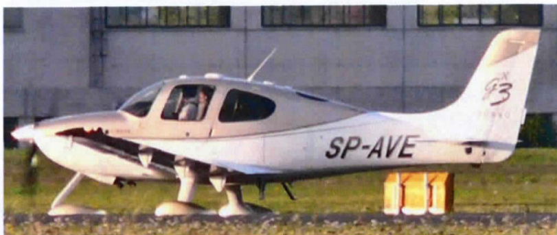
Polish registered SR-22 SP-AVE arriving at Doncaster 21/10(Clive Featherstone)

10/10 G-CPRR Citation Sovereign(Go-jet 210A), G-NTWK Twin Squirrel(Network 63) 12/10 N707EA Gulfstream 4, D-CCAA Lear 35A(Ambulance 08), G-CEMS MD-902(Helimed 98) 13/10 CS-DXO Citation XLS(Fraction 989T), G-IMEC PA-31, G-LIZA Cessna 340(Saltire 601) 14/10 N60LW Citation Bravo, G-CJDB Citationjet 2, G-GAEB Aquila AT-01 15/10 N113BP PA-46T Malibu, G-JBIZ Citation 2(Cloudbrunner 54), N380CR Citationjet 2 17/10 G-TBEA Citationjet(Exclusive Jet 557), G-OMRH Citation Bravo 18/10 PH-NDK Falcon 900B(Solid 152), G-OMBI Citationjet 3 19/10 D-CINS Lear Jet 45(Aerodienst 81M), M-ICRO Citationjet, G-BEZZ PA-31 20/10 D-CVHB Citation XL, XX244 Hawk(Cranwell 08, ILS) 21/10 SP-AVE Cirrus SR.22, N96FL Cirrus SR.22, G-JDBC PA-34(Jaydee 43W) M-PVRT Citation X, N412MW Pilatus PC-12, G-BBHF Aztec 22/10 D-CVHA Citation Sovereign, G-XXEB Sikorsky S.76C(Rainbow 1) 23/10 OO-TAK BAe.146(Quality 1484), G-PUSI Cessna 303, CS-DFS Citation XL(NJE 6XV) G-CDCX Citation X 26/10 G-ZMED Lear Jet 35A(Air Med 019) 25/11 M-MIKE Citationjet 2, N200RE King Air 90L, G-NOSE Cessna 402C(REV 402) 27/11 OE-FGL Citationjet, G-JONM PA-28, CS-DXX Citation XLS(Fraction 3BC) 28/11 EI-BUF Cessna 210M, G-SELB PA-28, ZH106 Boeing E.3A(NATO 35) 29/11 F-HAGL Beech A.36, G-URRU Challenger 601(training) 30/11 N125TM Challenger 300, G-HARK Challenger(Twinjet 5T), G-BVMA King Air 200 31/11 N69LP Aerostar, G-CEGP King Air 200(Cega 466)