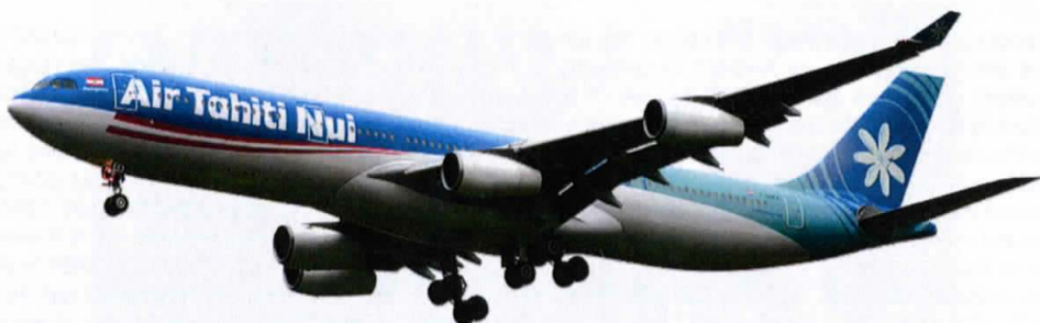
Air Tahiti Nui Airbus A.340 F-0SEA landing at Teesside

Sutton Bank:- A new resident is SZD.41A Glider G-DDFX.