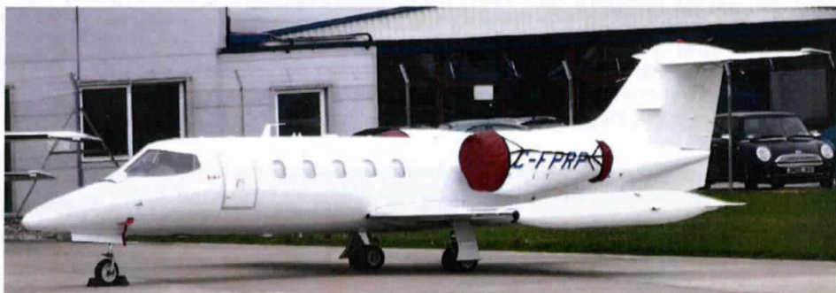
Lear Jet 35A C-FPRP of Skyservice arrived on an Ambulance flight, 14/10(Mike Storey)

Eastern:- G-MAJE(80D/81D), G-MAJJ(86D/87D). G-WOWE (29Q/19Q), G-CDEB(37X/38X). Flybe:- Based G-JEDM Gatwick x1, swapped with G-ECOR on afternoon flight. G-JECT(74H/542B, 4RG/1EP), G-ECOB(78E/6DB). G-JECS(7DE/172), G-FLBC(703N/5CK), G-FLBB(2PL/3EL). KLM:- PH-KZT(1545/6), PH-WXA(1549/50), PH-KZA(69W/54S, n/s). Manx2:- Jetstream 32 G-OAKI(Vannin 322/3). Pakistan International:- A,310 AP-BGN(775/6) f/t Islamabad(1918/2249). Ryanair:- Based EI-DYL( 41GN/64QA Dublin, 82RH/2NC Palma, 59XL/62GH Murcia). EI-EBH(2328/9 Limoges, 2454/5 Carcassonne, 7GF/6ZT to Malaga). Non-Based EI-DPI(01K/7MV Faro), EI-DCM(6XE/1JZ Gerona). EI-DCI(52AK/82QY Dublin). IT FLIGHTS:- A.320 G-SUEW, "Kestrel 29MC/24PZ" t/f Fuerteventura(0701/1618). GENERAL AVIATION:- Cessna 172S G-CBFO f/t Gamston(1032/1324). Twin Squirrel G-VONE(Premier 27) f/t Skipton(1438/1734). Long Ranger G-PTOO from Kirby Overblow(1459) to Huggate(1624). Hughes 369E G-JIVE from Wycombe Air Park(1539) to Shelf(1609). King Air 200 G-OCEG(Cega 807) from Gerona(1834) to Bournemouth(2102).