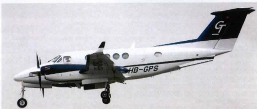
King Air 300GT operated a charter inbound to LBIA on behalf of Nestle on 20/10

MILITARY:- Tucano ZF407 (LOP 72) ILS and overshoot(1437), f/t Linton.