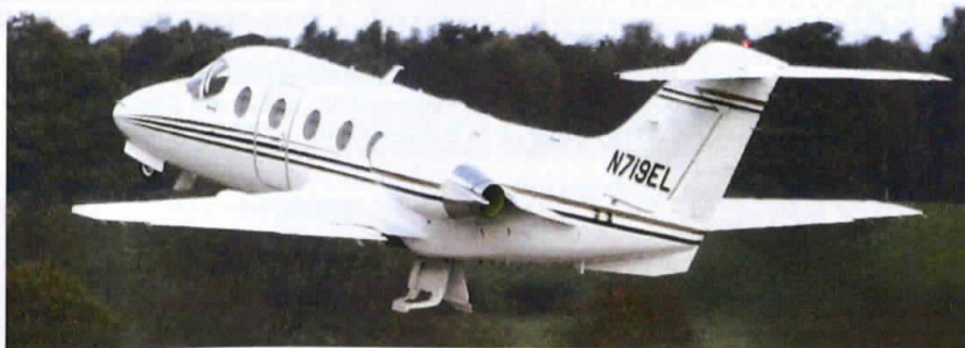
East Midlands based Hawker 400XP is a regular sight at LBIA(Mike Storey)

GENERAL AVIATION:- Baron N64VB from Sleaf(0806) to Glasgow(0846), return 1502/1521. Cessna T.303 G-MILO (Orchid 185) from Belfast International(1610) to Oxford(1702). Cessna 441 EI-DMG from Cardiff(1711) to Waterford(1741). King Air 200 G-PCOP (Gama 844) f/t Glasgow(1811/0853), n/s.