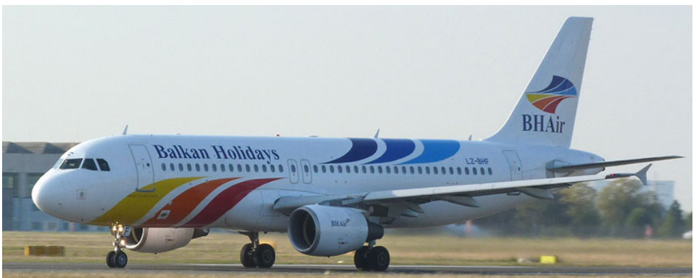
LZ-BHF Airbus A.320 of BH Air at Doncaster, 09/06/11(Clive Featherstone)