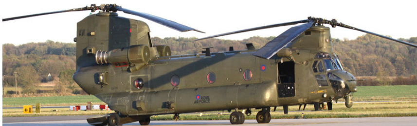
Chinook ZA720/AW dropped into Humberside for fuel on 28/10(Richard Grimley)