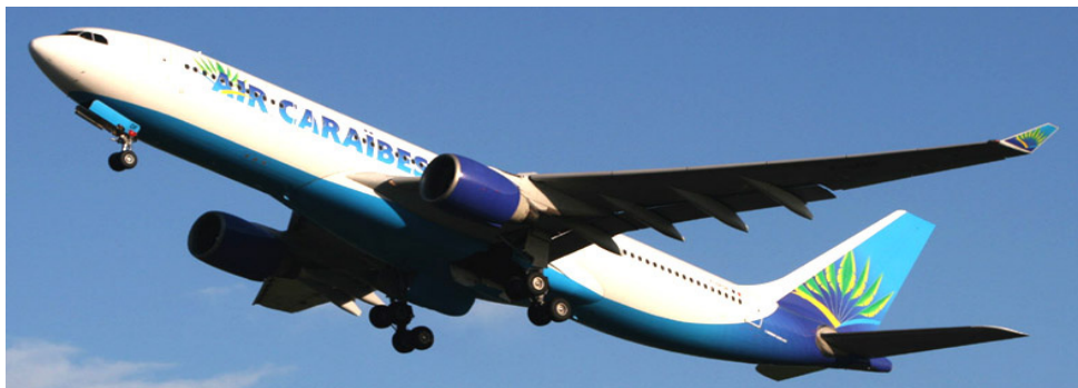
A.330 F-OFDF of Air Caraibes was used on MOD charters from Teesside during October

Sherburn:- No longer resident is G-DRIV R.44 Raven, which has departed to Blackbushe following sale, and G-XTEK R.44A which has been cancelled following sale in Russia 5.10. A quick visit for lunch on 30.10 and not much of interest noted. G-KRMA Cessna 425 was present again and with a potential change of owner showing on G-info is a possible new resident, whilst G-STER B.206B was active in the circuit and looking smart in a new colour scheme. Visiting between 12.45 and 13.45hrs. were G-AYFC D.62B f Brighton t Netherthorpe, G-BACL D.150 f&t Brighton, G-BPMB M.5.235C f&t Crosland Moor and G-FUZZ/51-15319 PA-18-95 f Gypsy Wood t Brighton.