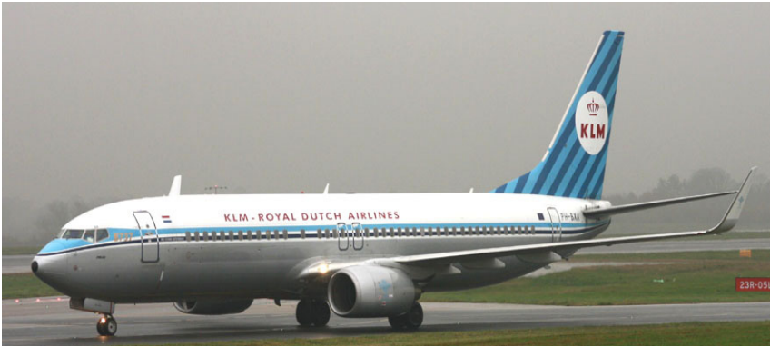
Retro 2;- KLM Boeing 737/800 PH-BXA, again by Mike Storey at Manchester