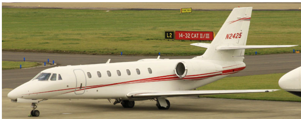
European based Citation Sovereign parked on Multiflight/east, 17/10

GENERAL AVIATION:- DA-42 Twin Star G-CEZG (White Knight 02) from Oxford(0812) to Denham(0854).