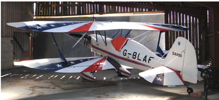
Currently resident at Bagby is Stolp SA.900 V-Star G-BLAF(Steve Lord)

Bradford(Queensbury):- Jet Art Aviation have acquired former West German Air Force F.104G Starfighter 22+57 and have reportedly refurbished it at their new base in the Selby area. Anyone know where this is and if the site at Queensbury/Raggalds Farm is still in use? The Starfighter is up for sale at £25,000 minus engine and weapons systems.