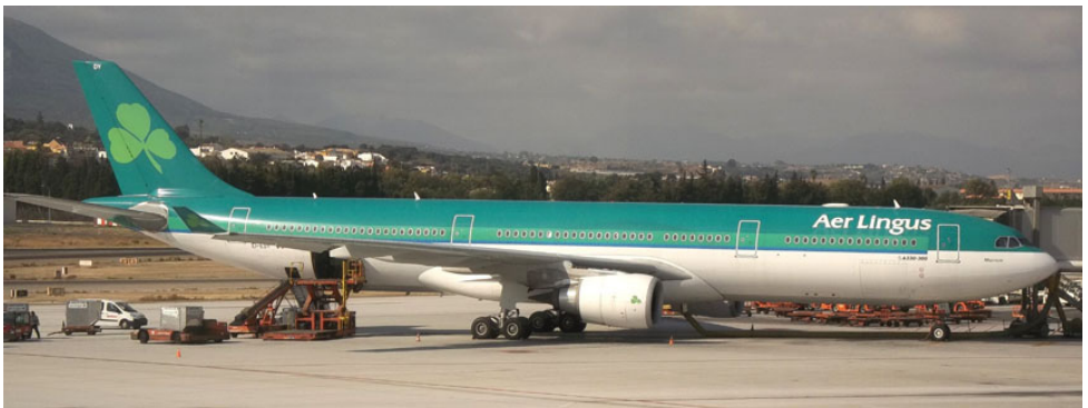
EI-EDY Airbus A.330/302 of Aer Lingus at Malaga, 18/10/11(Steve Lord)