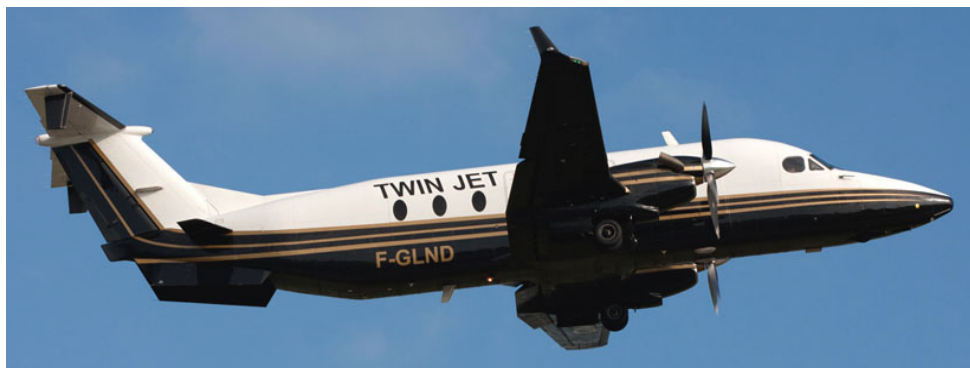
TwinJet Beech 1900D F-GLND operated a charter to Le Bourget, 15/10

MILITARY:- King Air 200 ZK454 (Cranwell 68) ILS and overshoot(1536) from Edinburgh to Cranwell.