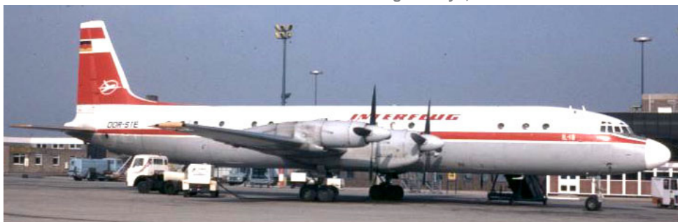
DDR-STE Ilyushin IL-18 of Interflug, 18/02/1985