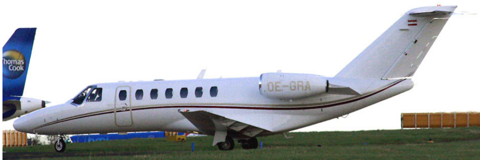
Citationjet 2 OE-GRA was on its first visit to LBIA on 19/10

EXECUTIVE JETS:- Citationjet G-TBEA (Clifton 096) from Dublin(0825) to Manchester(0843).