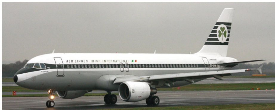
Retro 1:- Aer Lingus A.320 EI-DVM pictured recently at Manchester

Manchester has been named Best Major UK Airport for the fourth year running at the British Travel Awards in London. The awards are one of the most important in the business – because they are voted for by the public. More than 700,000 votes were cast – three times more than last year – making the awards the biggest of their kind in Britain. The airport was praised for its use of innovative security technology, high quality shops and restaurants and good levels of passenger satisfaction. It beat off competition from other UK airports, including Heathrow and Gatwick.