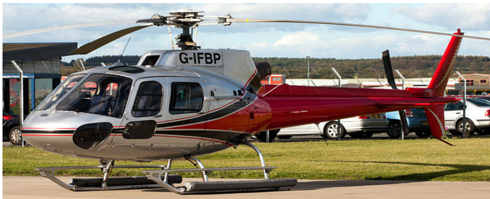
Twin Squirrel G-IFBP dropped in for fuel 7/10, while operating locally(Robert Burke)

GENERAL AVIATION:- Cougar G-BLHR (Advanced 37) f/t Sherburn(0934/1201). Dauphin G-NHAC (Helimed 58) f/t Langwathby(1429/1639) to Multiflight engineering. Twin Squirrel G-IFBP from Ripon(1520) to Strensall(1615). Beech A.36 D-EKPD f/t Thruxton(1645/1718).