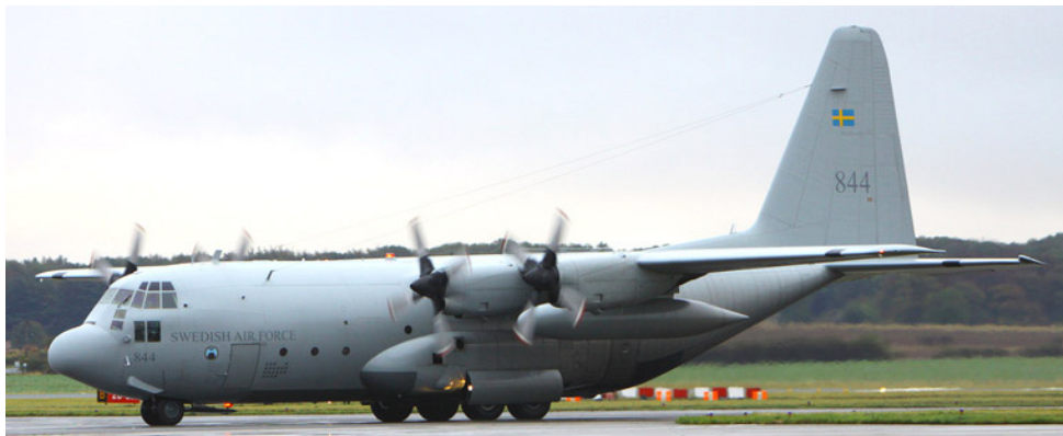
Swedish Air Force Hercules 84004 riving at Humberside,12/10

7/9 F-GPKL PA-46Y Malibu, D-IBCT Citationjet, M-USHY Cessna 441 12/9 LN-OHM Puma, VP-CRB Lear Jet 60, EC-IXL Metroliner(OVA 612) 14/9 M-ICRO Citationjet 2 16/9 G-YPRS Citation Bravo 18/9 G-PERB AW.139 19/9 EC-JCU Metroliner(OVA 612), VP-CRB Lear Jet 60, G-GDSG A.109S 20/9 HB-CCA Cessna FR.172K 24/9 G-BMCW Puma 25/9 N7423V Mooney M.20J 29/9 N550M Gulfstream 5 30/9 ZJ707 Bell 412(Shawbury 151) 2/10 SP-HAA Boeing 737/300(Torline 874) 5/10 D-ISIX King Air 90, D-IBCT Citationjet, G-ORTH King Air 90 7/10 N442HM Gulfstream 4 8/10 G-KLNW Hawker 400XP(Saxon 51D) 9/10 N124TF Gulfstream 4, TF-FIG 757(Ice Air 775), ZZ419 Shadow(Widget 1) 10/10 ES-LBD Boeing 737/300(Torline 812), G-OCEG King Air 200(Cega 895) 13/10 VP-CRB Lear Jet 60, G-PUMO Super Puma 18/10 XZ215 Lynx(Armyair 904), ZK452 King Air 200(Cranwell 60, ILS) 22/10 G-FLBK Citation Mustang(Blink 3K), ES-LBD 737/300(Torline 862) 28/10 G-FBKC Citation Mustang(Blink 5E) 30/10 TF-FIH Boeing 757(Iceair 775) 31/10 G-PCOP King Air 200(Gama 146)