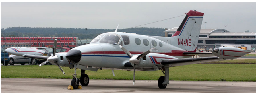
Cessna 414A("Commodore 01") parked on Multiflight/East, 14/10(Robert Burke)