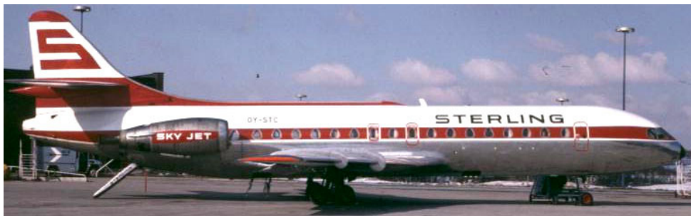
OY-STC SE.210 Caravelle of Sterling Airways, 26/02/1985