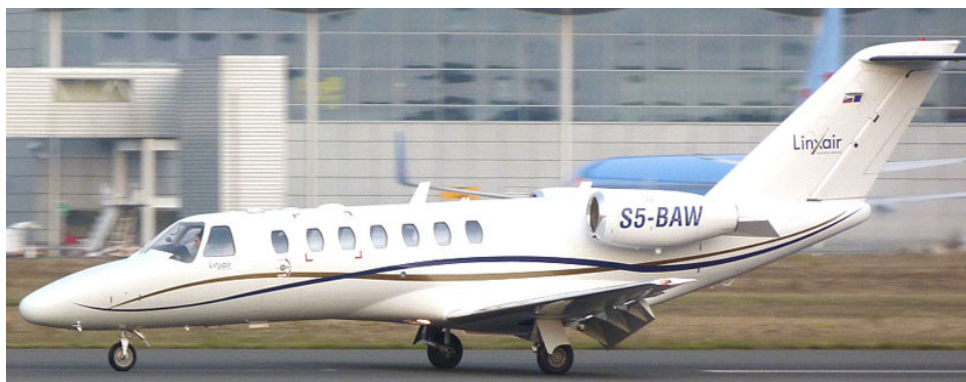
Citationjet 2 S5-BAW of Linxair, arriving for attention by Kinch Aviation(Clive Featherstone)

Of the above S5-BDG is the former M-CEXL which was a regular visitor and was painted at the airport in Linxair colours but left still as M-CEXL. Another Linxair aircraft Citationjet 2 S5-BAW arrived on 24/10 for maintenance and stayed until mid-November. Citation Bravo G-FCDB, which arrived late October, was painted up as G-EHGW on 26/10 however is still operated by Eurojet Aviation. Finally, King Air 200 PH-ATM which has been parked up for some considerable time, was air tested on 20/10 using the call-sign “Tiger 1”.