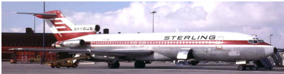
OY-SBE Boeing 727/200 of Sterling Airways, 28/02/1986

Continuing our theme of looking back to the "Good Old Days" when we had a good assortment of aircraft types and airlines visiting the airport, this month we present a selection from Andrew Barker.