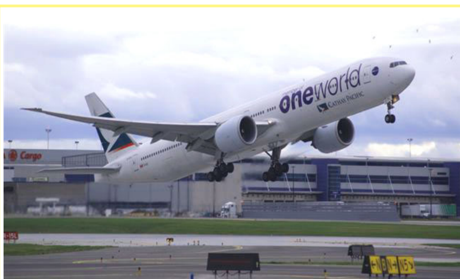
B-KPL Boeing 777/376ER, Cathay Pacific Toronto/Pearson International, 21/10/11

MERRY CHRISTMAS AND A VERY HAPPY NEW YEAR TO ALL OUR MEMBERS