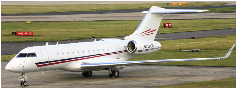
Based at Charlotte, Global Express N700GR visited Lbia twice in October

GENERAL AVIATION:- King Air 200 G-LIVY f/t Luton(0942/1754).