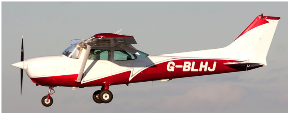
Carlisle based Cessna F.172P G-BLHJ visited Multiflight Engineering(Robert Burke)

GENERAL AVIATION:- King Air 200 G-SASC (Gama 164) f/t Glasgow(1522/1829).