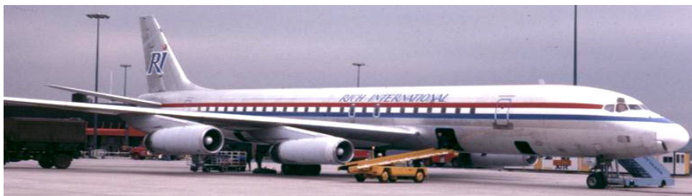
N1805 Douglas DC-8-62 of Rich International, 09/05/1985