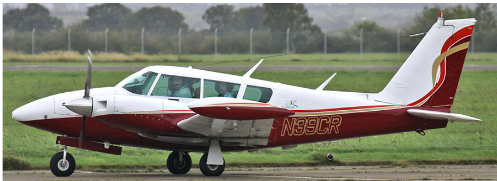
Aptly registered PA-39 Twin Comanche C/R N39CR seen arriving at Teesside, 4/10

9/10 PH-FJK Citationjet 3(Jet Netherlands 051), N96FL SR.22, D-EKNA Mooney M.20F 10/10 G-FBKA Citation Mustang(Blink 5E), ZD704 BAe.125(Ascot 1307) 11/10 G-XXEB S.76C, XX198 Hawk(Pirate 14, o/s), ZJ918 Typhoon(Gunfighter, o/s) 12/10 G-FBKC Citation Mustang(Blink 7G), G-SIRJ Citation Sovereign(Bookajet 798) 13/10 G-ZIPR Hawker 750XP(Premiair 591), G-CBBT Bulldog, G-OOEX Cirrus SR.22 14/10 OE-HDV Challenger 300(Expert 65), G-RBCA Agusta A.109A, N700GY TBM.700 15/10 G-FBKD Citation Mustang(Blink 8H), G-XAVB Citation Mustang, N200GK PA-28R 16/10 OY-CKK Citation XLS(Mermaid 22), G-EEJE PA-31, G-ZMED Lear 35(Air Med 061) 17/10 VP-BSI Gulfstream 5, G-EJRS PA-28, G-SUEZ Jet Ranger(Pipeline 81) 18/10 D-CSAL Metroliner(Bin 7B), G-OMEA Citationjet(Marshall 6B), Hawks XX258/XX346 19/10 D-INOB Citationjet(Air Bremen 31) 21/10 G-FBLK Citation Mustang(Blink 3C) 23/10 N999EH Falcon 900(n/s), N400YY Extra 400(n/s) 24/10 G-CGMC Embraer 135(Eastflight 1848), ZF239 Tucano(LOP 69, overshoot) 26/10 G-HPPY Lear Jet 45, ZF205 Tucano(LOP 98, overshoot) 27/10 G-WOWA Dash 8(Eastflight 32X, LBA div), G-CGEI Citation Bravo, G-CFVO Be.200 29/10 OH-WIA Citation Sovereign, CS-DHR Citation Bravo(Fraction 7GZ)