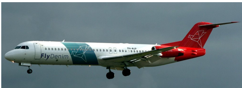
PH-MJP Fokker 100