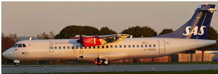
G-FBXA 'Sigsten Viking' ATR72-600 Flybe/SAS David Blaker

Birmingham, 17/10 G-FBXB(5027T/5028T) ATR72 test flight from/to Birmingham, G-FBXA(517T/518T) ATR72 test flight from Southend/to Birmingham, G-FBXB(529T/530T) ATR72 test flight from Birmingham/to Southampton, G-FBXA(519T/520T) ATR72 test flight from Birmingham/to Southampton, 19/10 G-FBXA(517T/518T) ATR72 test flight from Birmingham/to Southampton, 20/10 G-FBXA(542T/543T) ATR72 test flight from/to East Midlands, 21/10 G-FBXA(542T/543T) ATR72 test flight from/to East Midlands, 22/10 G-FBXB(517T/518T) ATR72 test flight from Edinburgh/to Newcastle then (519T/520T) from Newcastle/to Stockholm.