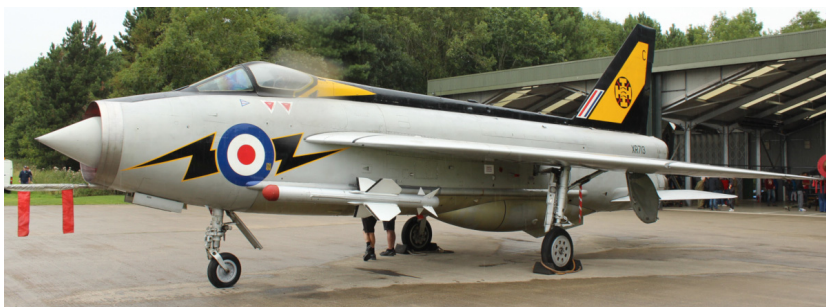
XR713 Lightning F.3