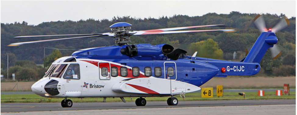
14th October 2015 G-CIJC Sikorsky S-92

ALL Photographs courtesy of Rich Grimley Photography unless stated otherwise