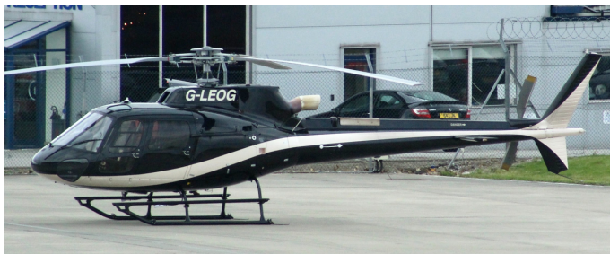
G-LEOG AS350B Mike Storey 23/10/2015

Cessna 172N Skyhawk G-GYAV arr 08:39 fr Liverpool for maintenance, Beech 300 ZZ504 2 overshoots at 09:37 ('ish) c/s vantage54, Tucano ZF264 overshoot 12:10 as LOP41, Beech E90 Kingair G-ORTH f/t Biggin Hill (12:22/15:19),