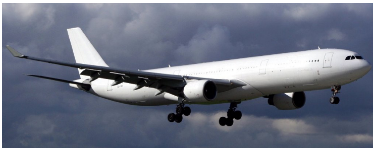
CS-TRI Airbus A330 Hifly