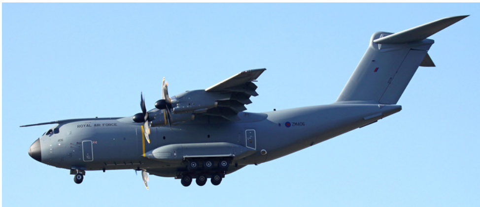
26th October 2015 ZM406 Airbus A400M