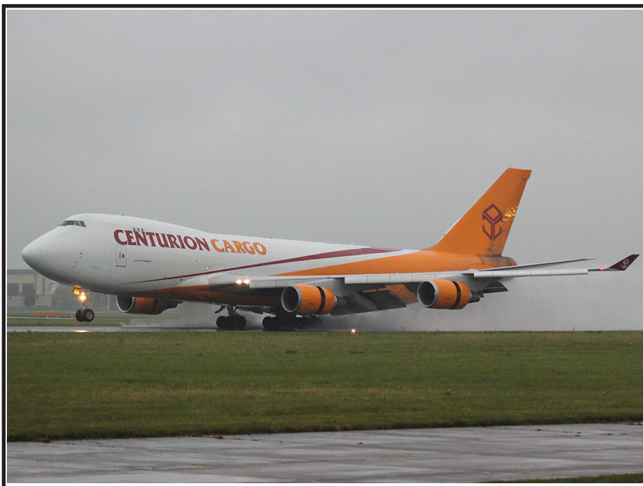
N904AR Centurion Cargo Doncaster 30 October 2015 Clive Featherstone