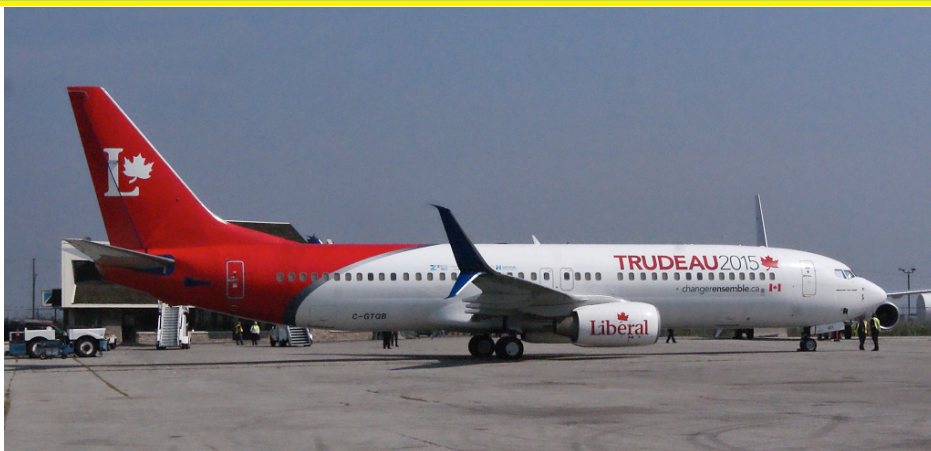
C-GTQB Air Transat (Special scheme) 737-800 Toronto 07/09/2015 (Ian Morton)