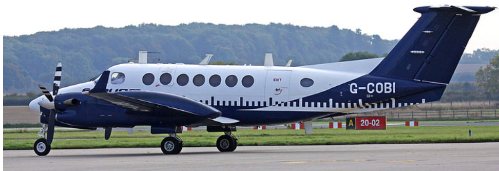
9th October 2015 G-COBI King Air 200