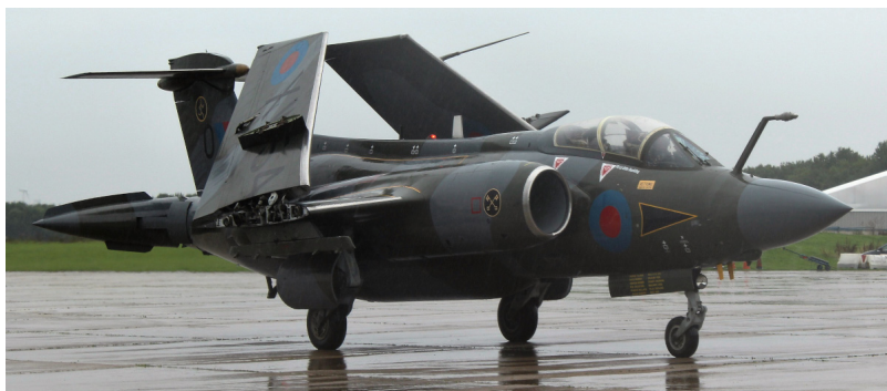
XW544 Buccaneer S.2B