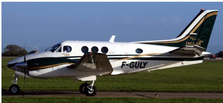
F-GULY Beech C90B King Air