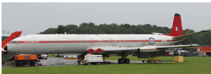
XR235 DH106 Comet 4C