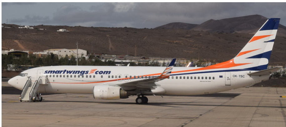
OK-TSC Smartwings Boeing 737-800 Lanzarote 8/10/2015 (Mike Payne)