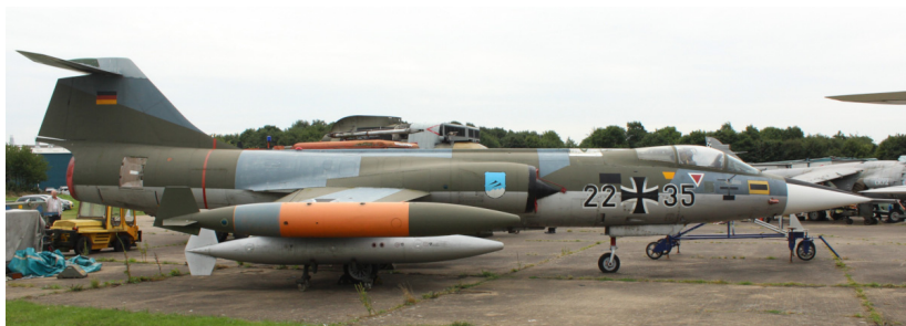
22+35 Lockheed F104G