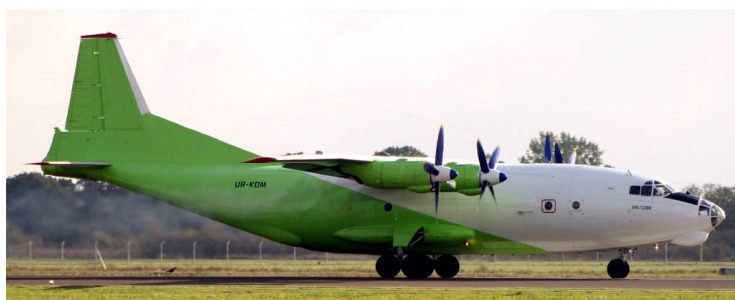
UR-KDM Antonov AN-12BK Covok Air