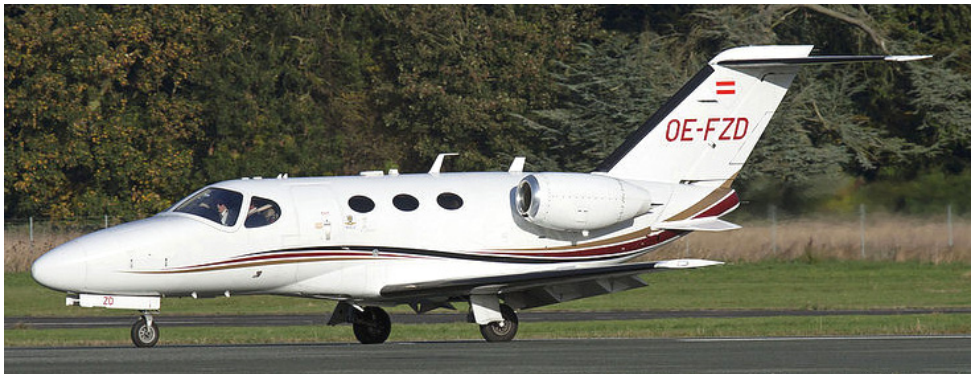
22nd October 2015 OE-FZD Citation Mustang