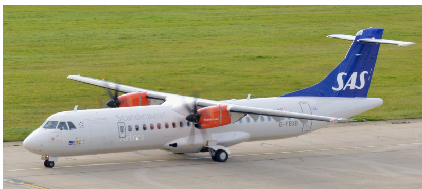
G-FBXB ATR72-600 Flybe/SAS