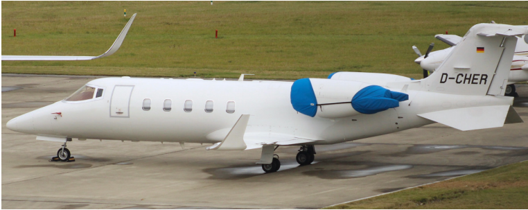
D-CHER Learjet 60

Elstree (11:18/15:14), Beech 200 Super Kingair G-BVMA arr 15:47 fr Cardiff n/s, Global 6000 ZS-TDF arr 16:37 fr Farnborough n/s.