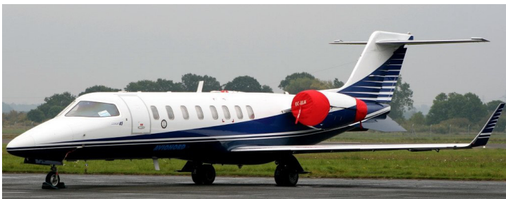
I-AVND Learjet 45