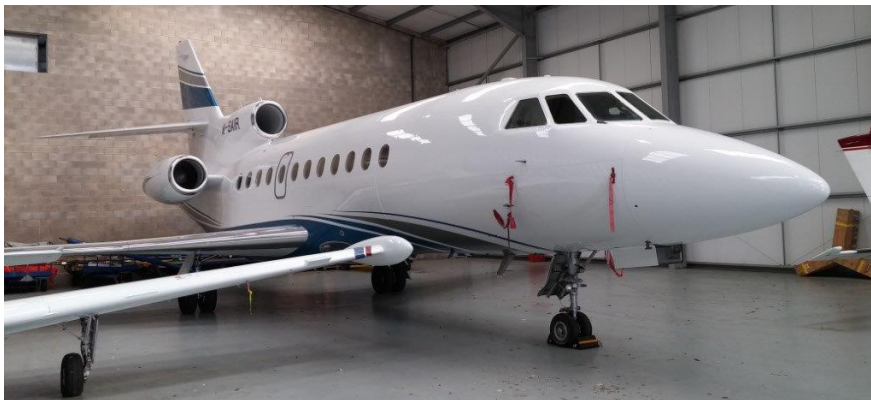
M-SAIR Falcon 900B

G-BJMR Cessna 310R G-TRJB Beech A36 Bonanza M-SAIR Falcon 900B