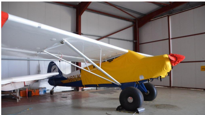
N60UK Aviat A-1C Husky

WP901/B Chipmunk T10 really G-BWNT G-BUIR Avid Speedwing Mk4 minus starboard wing ! G-CBDP Mainair Blade 912 G-CDRH Thruster T600N G-CGLM Rotorsport UK MTOSport G-CGNX ditto G-CGXR Vans RV-9A G-CGY Y Savannah VG Jabiru G-CHLD Rotorsport UK MTOSport G-JONL CZAW Sportcruiser G-TUCK Vans RV-8 G-WINH EV-97 TeamEurostar UK G-YADA Ikarus C42 G-YROH Rotorsport UK MTOSport N60UK Aviat A-1C Husky