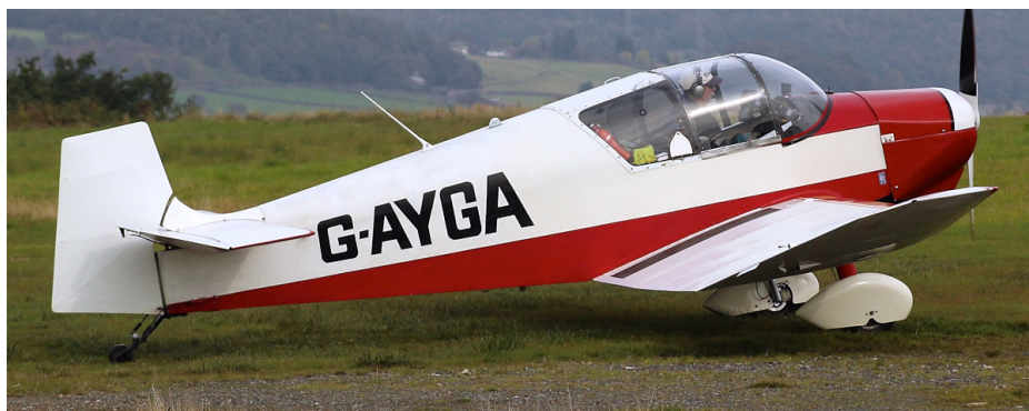
G-AYGA JODEL -D117 Oxenhope 10/10/15 (Mike Storey)