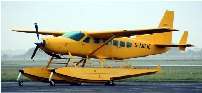
G-MDJE Cessna 206 Amphibian