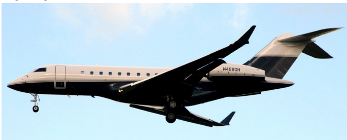
N468GH BD-700 Global 500

22/10 F-GULY Beech C90B King Air f/t Exeter, G-PJDS Citation 550 Bravo f/t Gloucestershire, ZF287 Tucano T1 f Linton O/S RAF - 1 FTS, N468GH BD-700 Global 5000 f Brussels t Paris Le Bourget, D-CGRC Learjet 35A f Corfu t Nunish Jet Executive, ZF269/ZF374 Tucano T1 f/t Linton RAF - 1 FTS, G-LAWX Sikorsky S-92A f Local Site t ? Starspeed, G-ULFS Gulfstream G650 f Shannon t Bristol Dyson, ZF407 Tucano T1 f Linton O/S RAF - 1 FTS, CS-DXT Citation 560 XLS f Palma N/S Netjets Europe, LZ-FLL Antonov AN-26B f Ostend t Birmingham Bright Flight