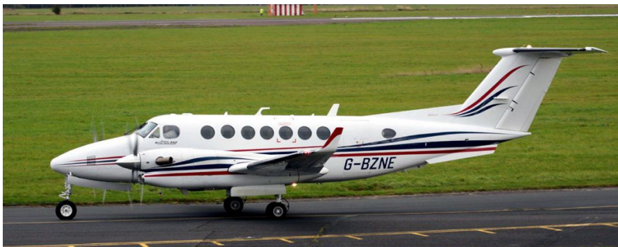
G-BZNE Beech 350 Super King Air 27/10