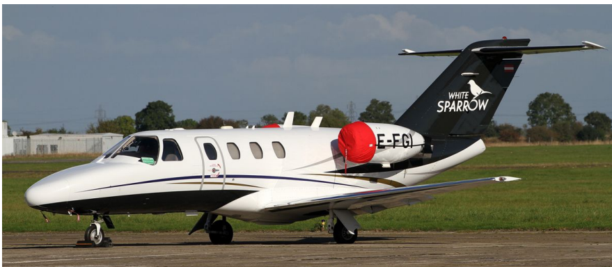
OE-FGI Citation 525 CJ1 09/10