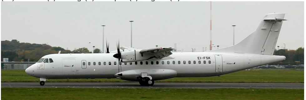
EI-FSK ATR72 Stobart 30/10

(FV) First Visit. (T) Training. (H) Helicopter. (F) Freighter. (M) Maintenance