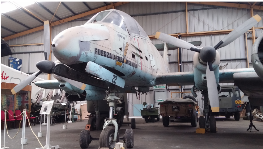
A-522/22 FMA Pucara