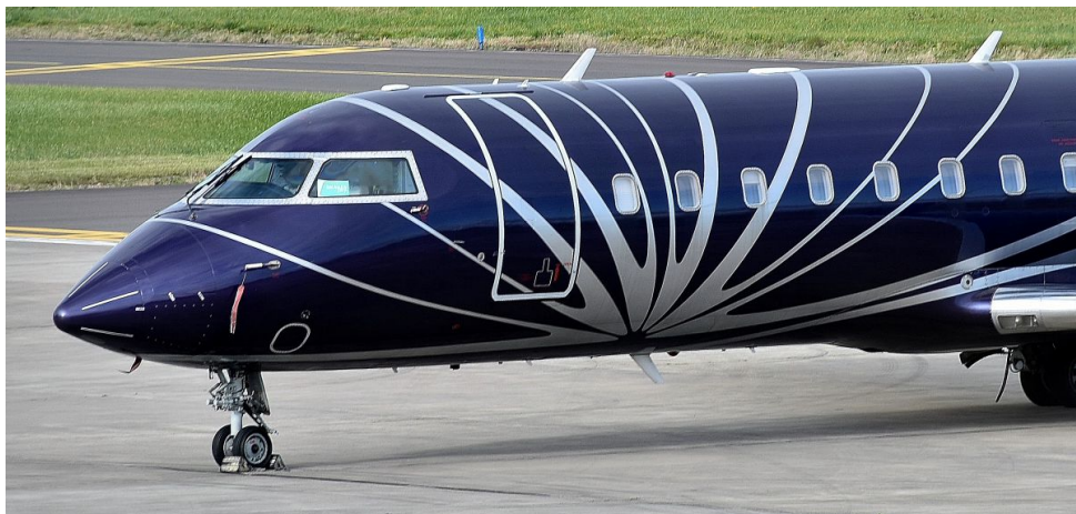
LY-VTA CRJ-200ER 21/10 Rod Hudson

Learjet 45 LX-LAA dep 08:16 to Luxembourg, Gulfstream 4SP N620JH arr 16:52 from Barcelona n/s, Canadair RJ200 LY-VTA dep 17:51 to Vnukovo.