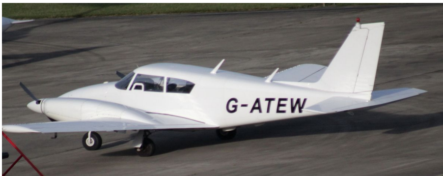
G-ATEW Piper Twin Comanche 160 31/10/16 Rod Hudson

Czech Air Force CASA C295M reported as '455' f/t Kbely (10:37/11:45), Piper PA-30 Twin Comanche G-ATEW arr 11:33 from Newcastle n/s, Cessna 172 Hawk G-BPWR arr 16:42 from Haverfordwest n/s, Cessna 560 Excel D-CTTT arr 16:54 from Munich dep 18:16 to Zurich.