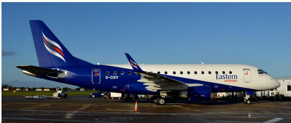
G-CIXV Embraer E170 Eastern Airways 23/10