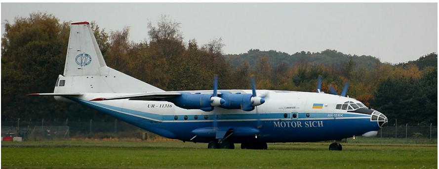
UR-11316 AN-12 Motor Sich 30/10