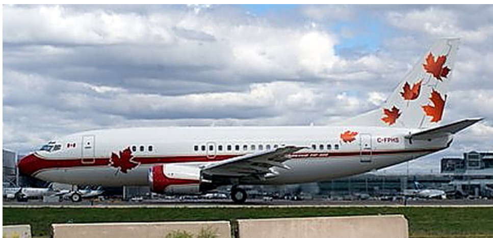
C-FPHS Boeing 737-53A Pacific Sky Aviation 01/09