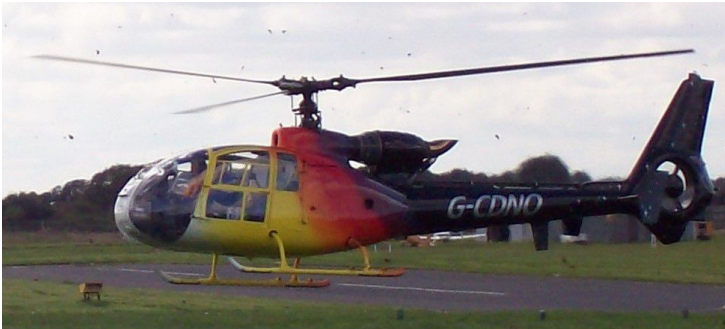
G-CDNO from/to Kirton 02/10

1/10 G-CCSR EV-97A f/t Netherthorpe 2/10 G-BJZN T.67A f/t Brighton, G-CGXL DR400/180 f/t Wickenby, G-AWJE T.66 f/t Brighton, G-BRPY PA-15 f/t Brighton, G-CIFC TB200 f Wickenby t Sturgate, G-ATWA DR1050 f/t Tollerton, G-FBRN PA-28 f/t Tollerton, G-EISG A36 f/t Sherburn, G-CDNO Gazelle AH.1 f/t Kirton near Boston