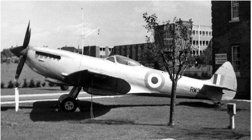
RW388 Spitfire XVI RAF Andover

and two Scimitars logged on the airfield together with unrecorded Sea Herons and Sea Devons. (Military Flying ceased in 1988 and HMS Daedulus closed in 1996 but the airfield continues to host civil operations). Up the road the Royal Naval Air Yard at Fleetlands yielded two Wessex and on to Portsmouth where F-BLEX was our second Nord 1101 of the day along with 13 light aircraft. (In 1967 2 Channel Airways HS.748s skidded off the grass runway on the same day putting paid to future commercial flights. The airfield finally closed in 1973). Off one island and on to another found us at Thorney Island where 22 squadron Whirlwind XP346 was on duty and the resident 242 OCU (Operational Conversion Unit) displayed Argosy XP413 and Hastings C.1s TG510 'N', TG517 'S', TG536 'T' and TG571 'G', and the wreck of TG610. The airfield occupied all of the island except for a yacht club and slipway accessible by a public road which gave a convenient view of the resident aircraft. (The airfield closed in 1976, in 1980 Vietnamese refugees were housed here and the Royal Artillery took over in 1982).