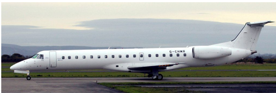
G-CHMR Embraer ERJ-145 MP 29/10 & 30/10