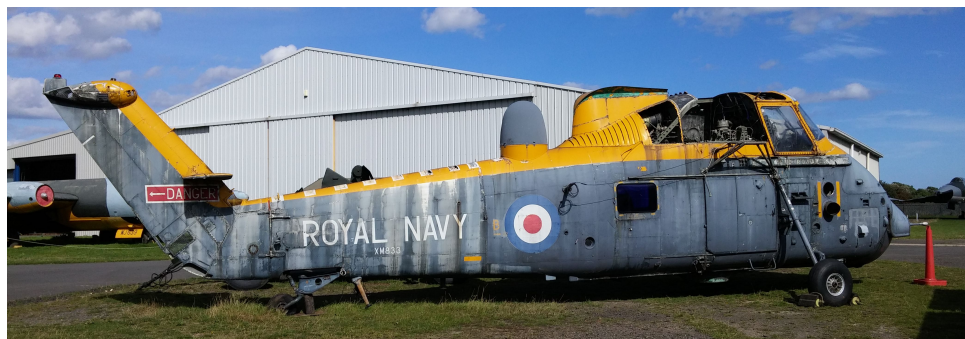
XS922 Wessex HAS3

open cockpit visits minus rotors , open store really ZF594 fuselage only with her recently primed wings , tail and control surfaces alongside the main hangar