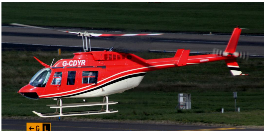
G-CDYR Bell 206L-3 LongRanger 06/10 Mike Storey

Cessna 560 Excel N75TP dep 07:47 to Guernsey arr back 16:38 and dep again to Oxford at 16:53, Cessna 510 Mustang G-FBKE dep 09:25 to Luton, Grob G115 Tutor G-BYXM f/t Cranwell c/s Cranwell 39, Piper PA-28 Cherokee G-BOKA arr 11:06 from Fairoaks n/s, Mooney M20 N400MW dep 12:45 to Mannheim, Aero Commander 114 G-OECM arr 12:48 from Newcastle dep 14:01 to Carlisle, Beech C90 Kingair M-KING dep 13:00 to Guernsey, Cessna 182 N182K dep 13:28, Eclipse EA500 D-INDY arr 17:24 from Copenhagen-Roskilde n/s,