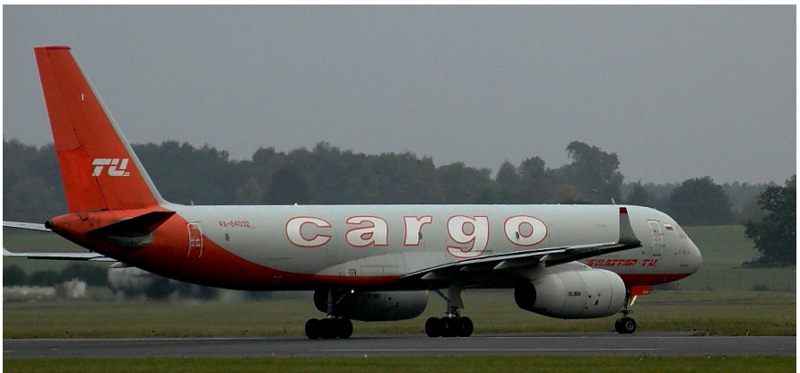
RA54032 TU-204 Aviastar Cargo 16/10