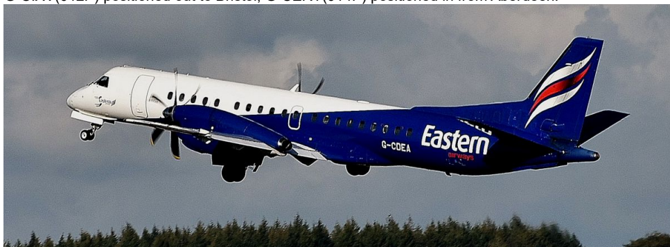
G-CDEA Saab 2000 Eastern Airways 21/10 Rod Hudson

Additional flights:-4/10 G-CIXW(12W) positioned in from Humberside, G-CIEC(032P) positioned out to Norwich, 7/10 G-CDEA(054P) positioned in from Southampton, 14/10 G-CHMR(056P) positioned out to Humberside, 17/10 G-MAJL(011P) positioned out to Durham, G-MAJU(012P) positioned in from Aberdeen, 22/10 G-CIXV(9684) arrived from Avignon, 23/10 G-CIXV(684P) positioned out to Humberside, 24/10 G-MAJA(969P/963P) positioned out to Humberside/in from Bristol, 25/10 G-CERY(949P/491P) positioned out to Newcastle/in from Humberside, 26/10 G-CIXV(033P) positioned in from London City, G-CERY(942P) positioned out to Bournemouth, 27/10 G-CDKB(044P) positioned in from Newcastle, G-MAJY(61L) arrived from Aberdeen, G-MAJA(011P) positioned out to Aberdeen, G-CIXV(012P) positioned out to Bristol, G-CERY(014P) positioned in from Aberdeen.