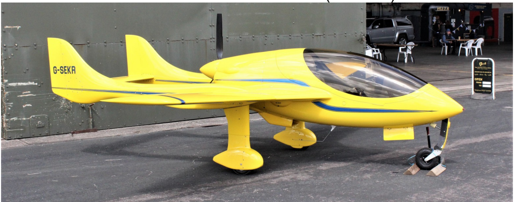
G-SEKR-ISA 180 SEEKER