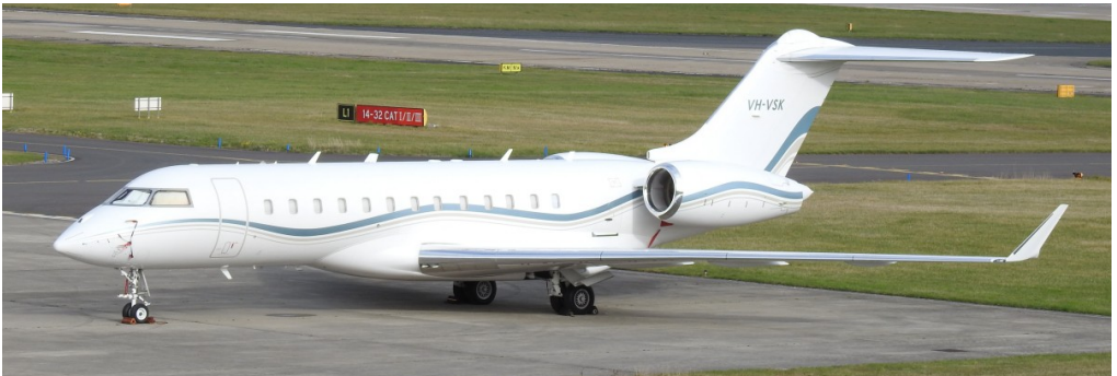
VH-VSK Global Express 19/10 Execujet