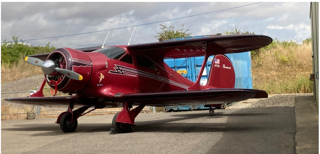
N17GL Beech Staggerwing