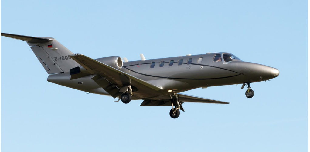
D-IQQQ Cessna 525A CJ2 31/10 Stewart Robertshaw

Cessna 525A CJ2 D-IQQQ ( csn 525A-196) arr 09:38 dep 10:16, Pilatus PC XII F-HJFP arr 10:14 dep 10:43, Cessna 560 Excel D-CEFO arr 10:53 n/stop, Falcon 2000EX CS-DLF arr 12:38 dep 13:52, Phenom 100 ZM336 ILS approach at 14:31.