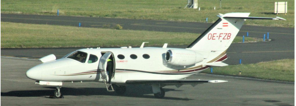
OE-FZB Cessna 510 Mustang 18/10 Mike Storey

Challenger 850 9H-ILB dep 08:18, Cessna 510 Mustang OE-FZB arr 09:28 dep 10:43, EMB Phenom 100 ZM335 ILS approach at 09:34, Global Express VH-VSK arr 14:00 n/stop, Learjet 45 9H-BCP dep 15:22, Cessna 680 Latitude CS-LTS arr 15:45 dep 16:36, Challenger CL605 C-FNVT arr 17:17 dep 18:14, EMB550 Legacy 500 G-HARG arr 17:24 n/stop,