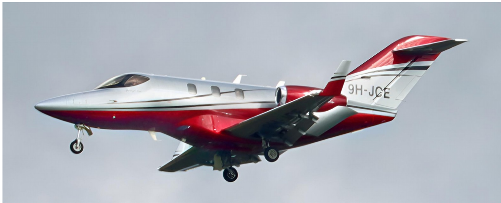
9H-JCE Hondajet 06/10 Paul Whincup

Beech 200 Kingair G-JASS dep 06:57, Cessna 525A CJ2 OE-FGB dep 09:10, Global Express N394WJ arr 13:13 n/stop, Pilatus PC XII G-MDSI arr 14:45 dep 17:10,