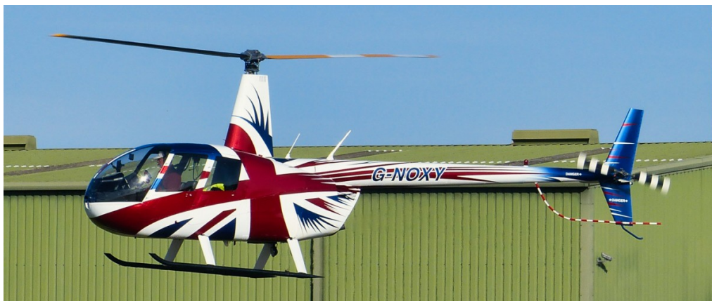
G-NOXY Robinson R44 22/10