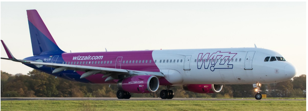
HA-LXG Airbus A321 Wizz Air 31/10