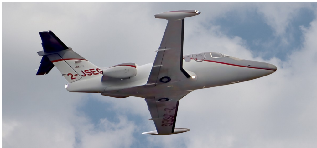
2-JSEG Eclipse EA500 04/10 Paul Whincup

Cessna 525A CJ2 OE-FGB arr 09:14 n/stop, Eclipse EA500 2-JSEG dep 14:13, R/C F406 Caravan G-MAFA dep 14:58,