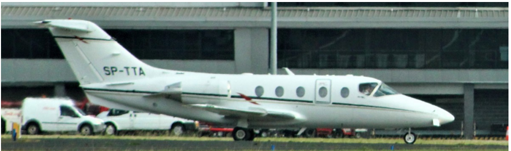
SP-TTA Hawker 400XP 11/10 Mike Storey

Beech 200GT/250 Kingair G-NICB arr 08:29 dep 10:39, Global Express C-GLXM arr 08:44 dep 09:10. PA-18-161 Warrior G-KART arr 10:06 n/stop, EMB Phenom 100 ZM333 ILS approach at 11:17, PA28-181 Archer G-IBEA arr 11:20 dep 15:29, Hawker 400XP SP-TTA arr 11:24 dep 12:02, R/C F406 Caravan G-MAFB dep 12:26 ret at 13:17 n/stop, Hawker 400XP SP-EAK arr 13:33 dep 15:12, Socata TBM950 N11MA dep 15:16, Cessna 525 CJ1 SP-DLV arr 22:09 n/stop.