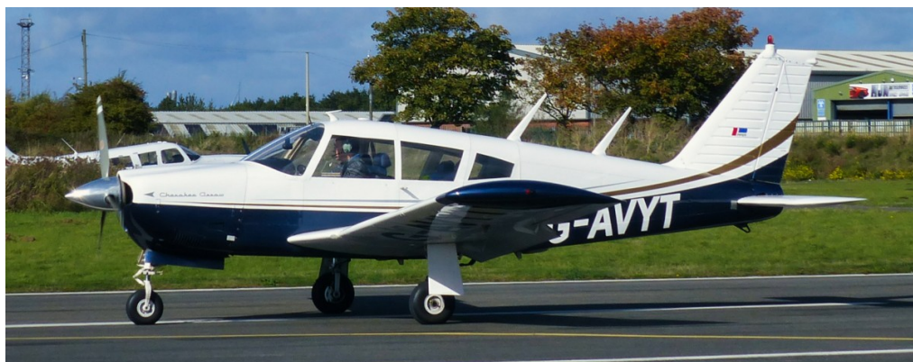
G-AVYT PA28 Cherokee 09/10