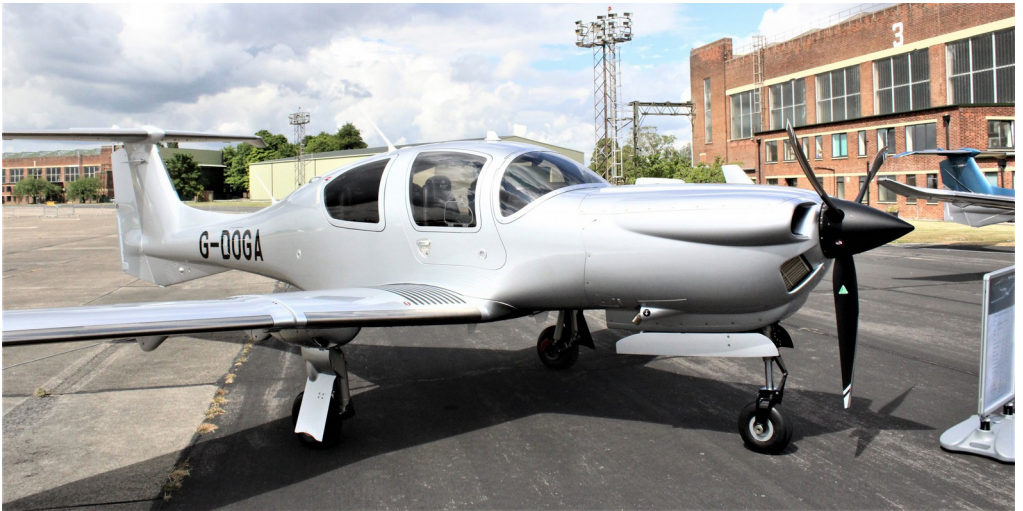
G-DOGA DIAMOND DA50C