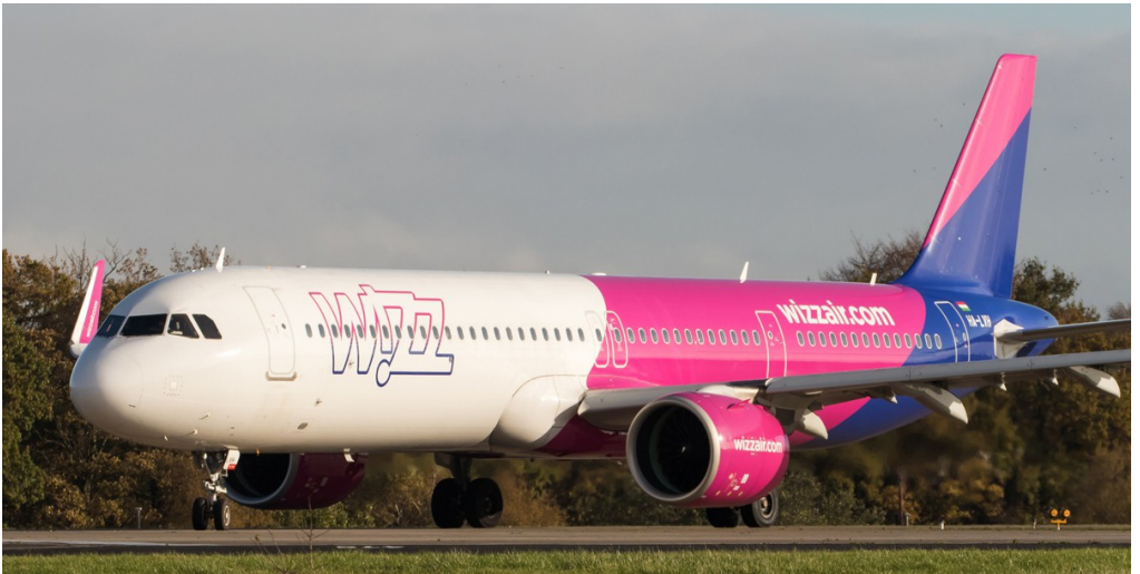
HA-LVH Airbus A321 Wizz Air 31/10