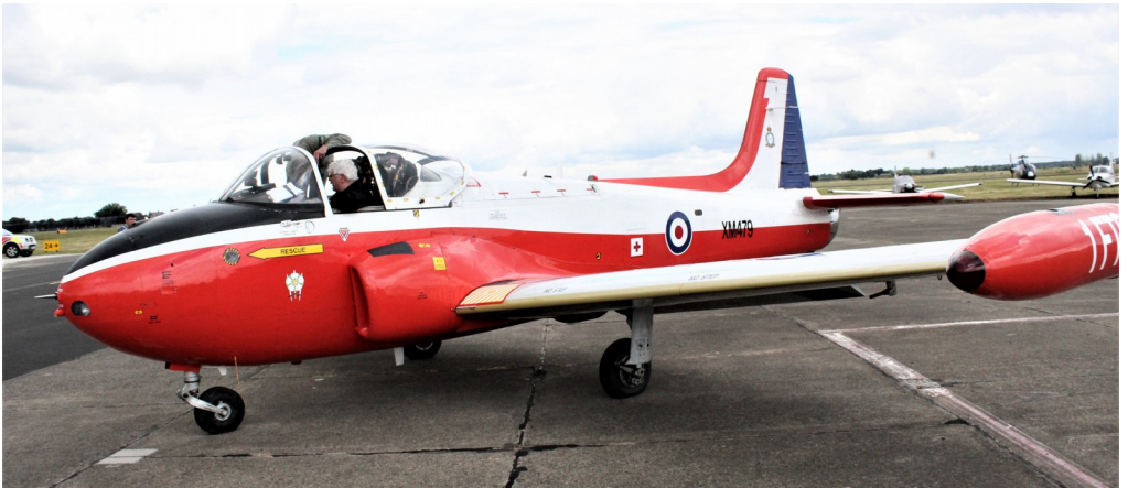
XM479- JET PROVOST T3A(G-BVEZ)