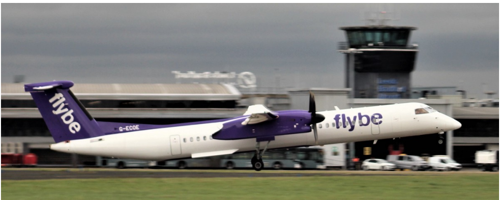
G-ECOE Dash 8 Q400 Flybe 04/10 Mike Storey

Other flights:- 4/10 G-ECOE(041P) positioned out to Heathrow, 7/10 G-FLBA(43P) positioned in from Birmingham, 9/10 G-EXTB(8981) operated in from Birmingham, 13/10 G-EXTB(6CP) positioned out to Amsterdam.