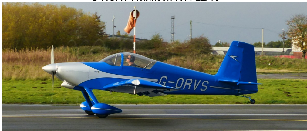
G-OVRS Vans RV9 29/10