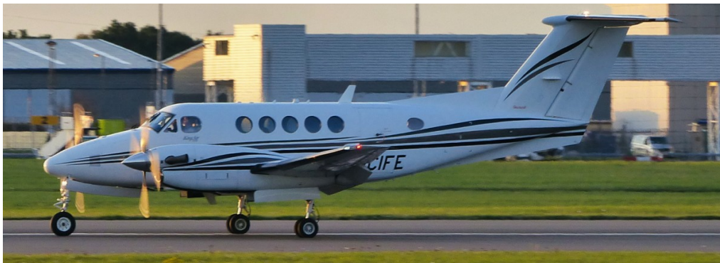
G-CIFE King Air 2Excel 28/10