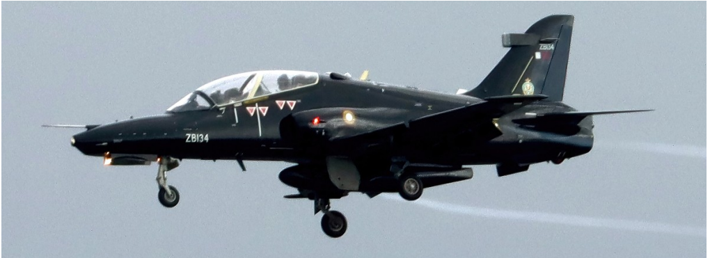
ZB134 BAE Hawk MK166 06/10 Paul Whincup