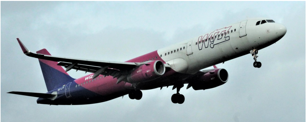
HA-LTF Airbus A321 Wizz Air 31/10 Mike Storey