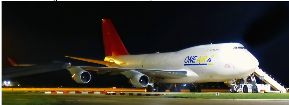
G-UNET Boeing 747-400 07/10