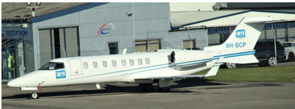
9H-BCP Learjet 45 18/10 Mike Storey

Pilatus PC XII LX-FLG (csn 1912) arr 07:40 dep 08:28, Cessna 680 Latitude CS-LTQ arr 09:54 dep 12:38, Hondajet 9H-JCE arr 10:31 dep 10:59, Gulfstream G550 N613LF arr 11:14 dep 17:54, Learjet 75 G-ZNTJ arr 11:29 dep 18:06, Eclipse Ea500 2-DAVE arr 11:33 dep 12:35, EMB Phenom 300 CS-PHG arr 11:39 dep 13:08, Beech 200GT Kingair G-REXB (csn BY-427) arr 11:56 dep 12:29, Learjet 45 G-SOVV arr 12:30 dep 17:33, Gulfstream G200 M-GZOO dep 13:05, Cessna 560 Excel D-CAWO arr 13:35 dep 14:18, Cessna 560 Excel CS-DXZ arr 15:36 dep 17:43, Eurocopter Ec135 p2 G-TVHB arr 18:10 dep 19:14.