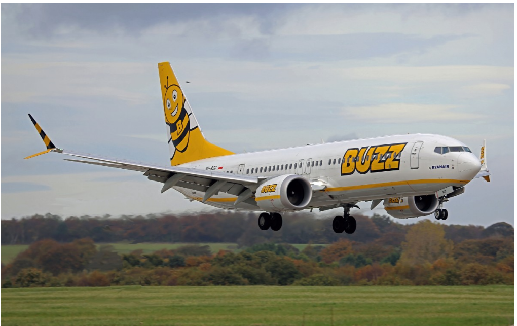
SP-RZC Boeing 737-8200 MAX Buzz/Ryanair 31/10