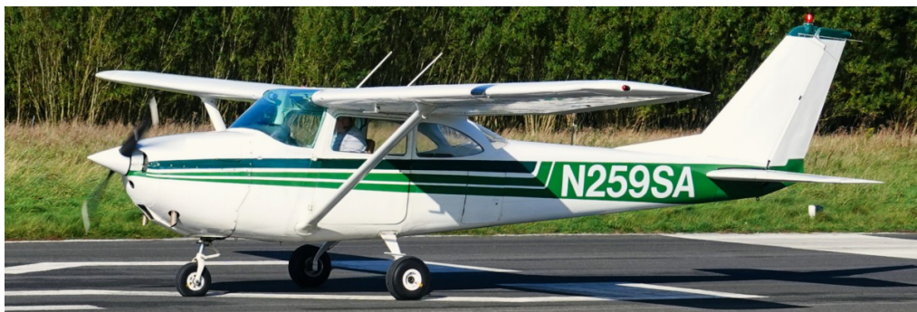
N259SA Cessna 172 14/10