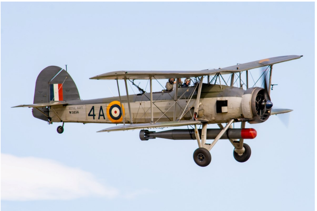
W5856 Fairey Swordfish Mk1 - Navy Wings