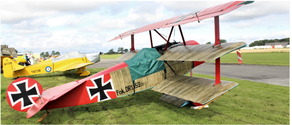
G-BVGZ-FOKKER DR1-TRI PLANE