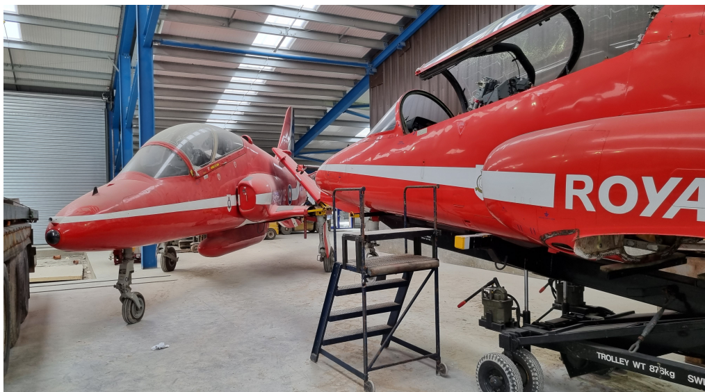
Hawk XX306 alongside FSM XX227 also ex-Scampton at Agility store , Leyburn , 19 April 2023