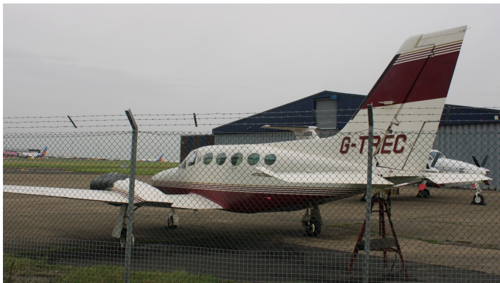
G-TREC Cessna 421 (stored) 08/10 Ian Gratton