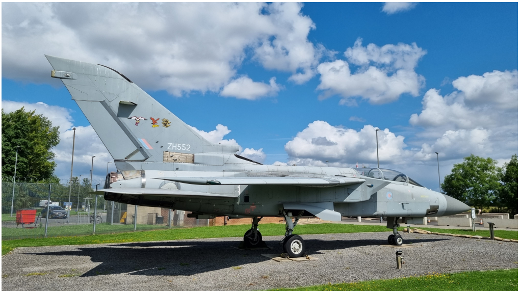
ZH552 Tornado F3