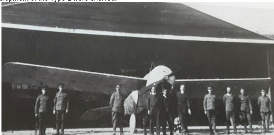
The Blackburn Type 1 after being commandeered for war service outside the seaplane hangar at Scalby Mills on 26 Sept(GS Leslie)

The Great War intervened, the proposed race abandoned and all the aircraft were commandeered to be evaluated for use by the Royal Navy, if found to be suitable they would be pressed into service. The Type L was deemed to be useful in the war effort, it was fitted with a light machine gun and flown back to Scalby Mills to be used for coastal reconnaissance. Unfortunately the aircraft came to grief early in 1915 when, flying in poor visibility, the biplane's floats caught the edge of the cliffs at Speeton. At the time it was being flown by Rowland Ding from Scarborough to Killingholme. The pilot was unharmed but only the engine could be saved and it was returned to Leeds to be reconditioned. Proposals made late in 1914 for a larger development of the Type L were shelved.