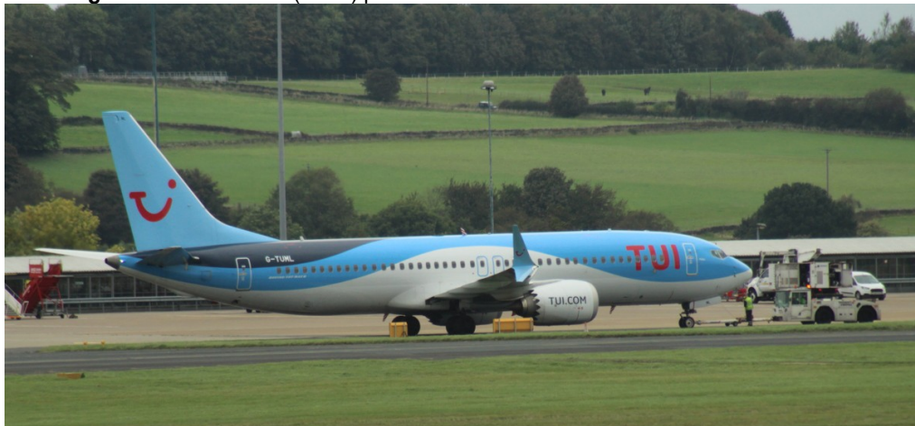
G-TUML Boeing 737-800 MAX 05/10 Ian Gratton

Other flights :-31/10 G-TAWD(958P) positioned out to Warsaw.