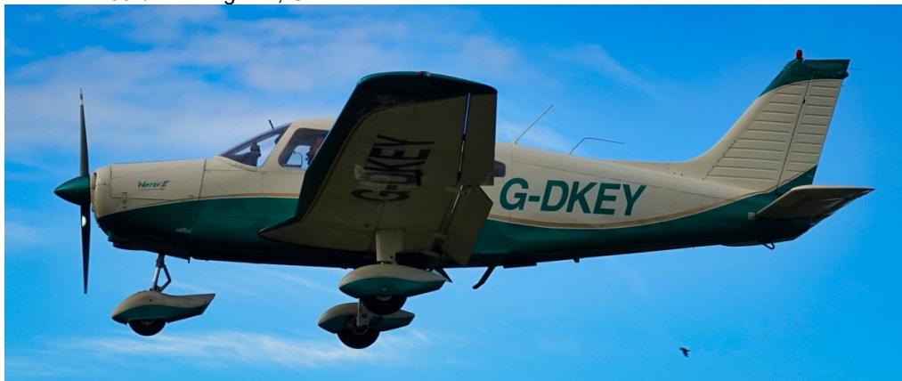
G-DKEY PA-28 Cherokee 14/10

22/10 G-CEKK Sky Ranger Swift f/t Humberside, G-BPRY PA-28 f/t East Midlands, G-CCTI EV-97 f/t Leicester, G-BSDH DR.400 f/t Sywell, G-TSGJ PA-28 f/t Fishburn, G-CFAR MT-03 f/t Nottingham, G-BWNI PA-24.