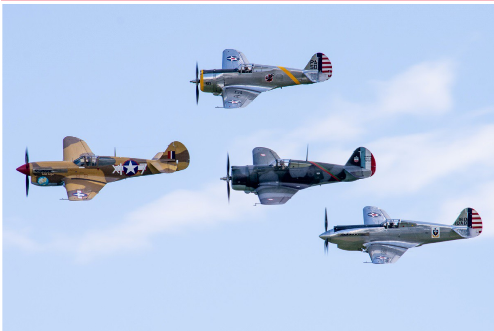
Curtiss Hawk Quartet - The Fighter Collection