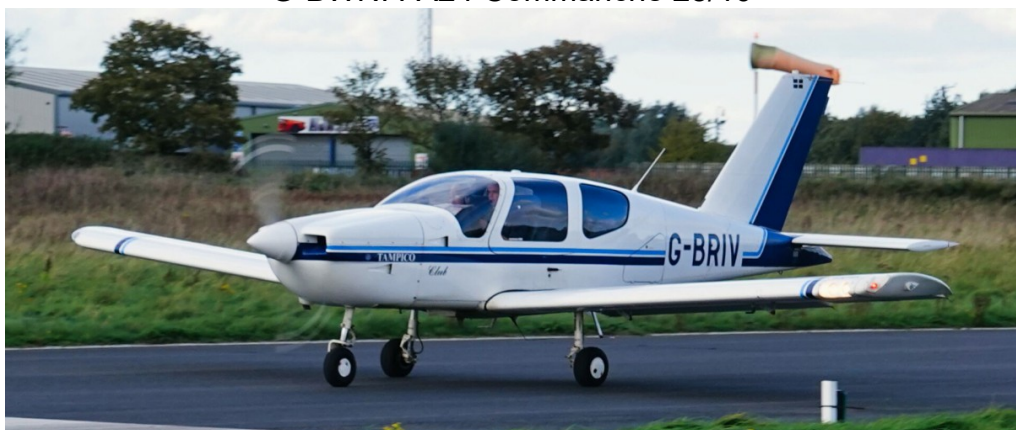
G-BRIV Tampico Club 14/10