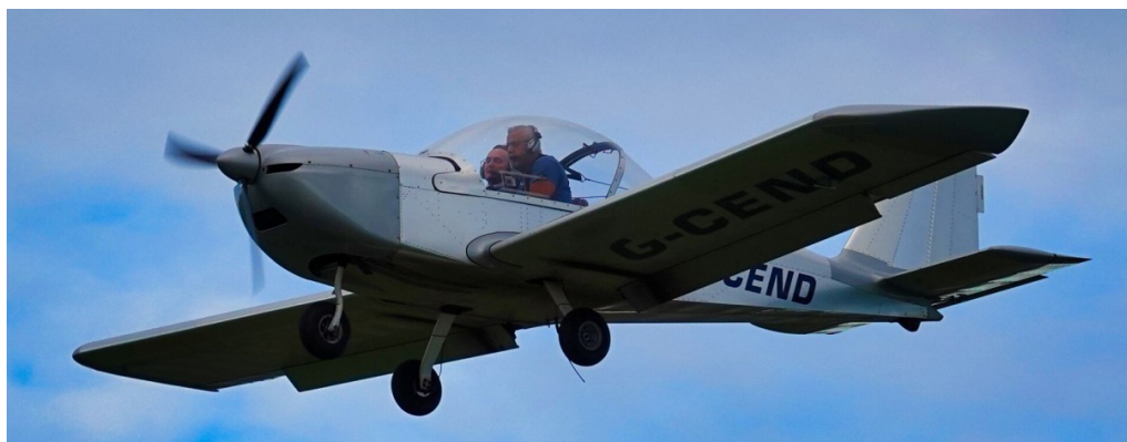
G-CEND EV-97 Eurostar 14/10