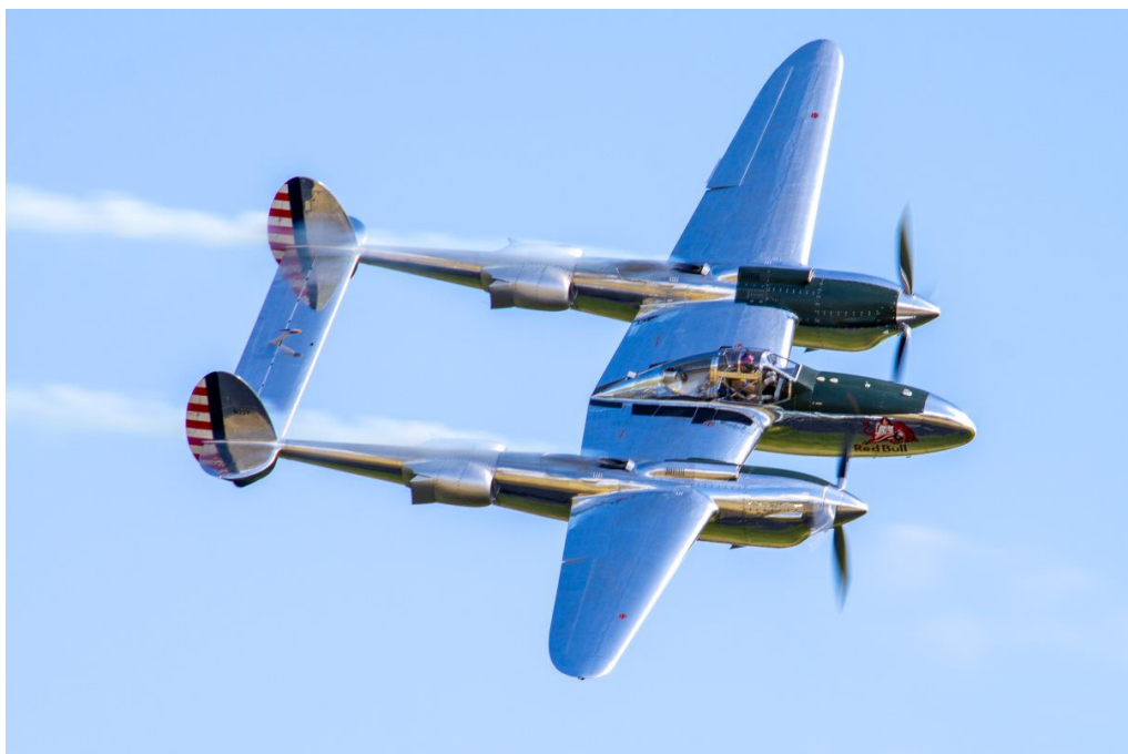
N25Y Lockheed P-38L - The Flying Bulls