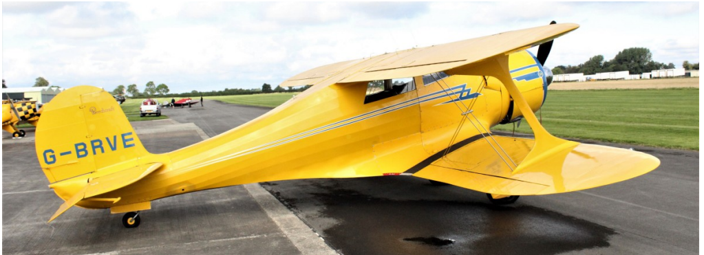
G-BRVE Beech D175