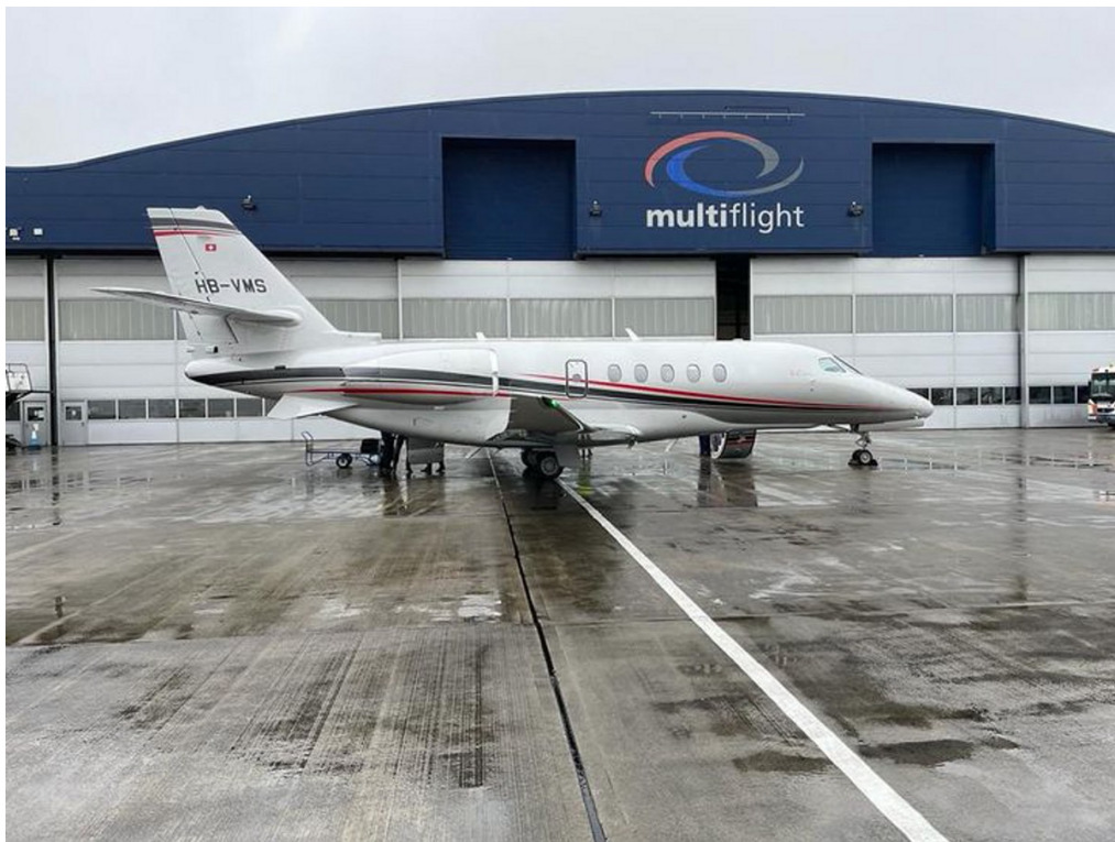
HB-VMS Cessna 680A Latitude 30/10 Multiflight

Challenger 350 9H-VCX arr 13:55 fr Malaga n/stop, Eclipse Ea500 2-CAZZ deo 14:06 to Schonefeld, Cessna 525 CJ1 G-POYA arr 16:17 fr Deauville dep 16:51 to Farnborough, Learjet 60 D-CPMU arr 17:05 fr Corfu n/stop, Diamond Da42 G-CTCE ILS approach at 17:27 fr Gamston, Saab 2000 ES-NSH arr 19:51 fr Billund dep 20:43 to Humberside.