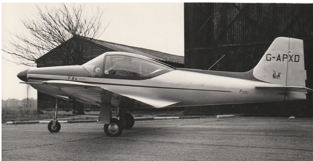
G-APXD Falco F8L Srs 1 Yeadon early 1961 parked close to the Yorkshire Aeroplane Clubhouse. It is an Italian designed two seater made of spruce and plywood. It is one of ten built by Aviamilano/Aeromere. Owned by J L Shaw of Bradford.