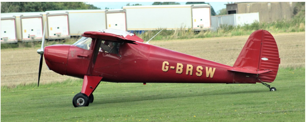
G-ATCN Luton Minor