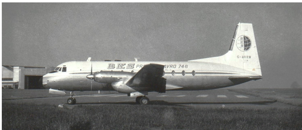
G-ARRW Avro 748 Srs1/106 of BKS Air Transport. Seen here in May, 1963 leaving R.28 stop-end after landing. Entered service with BKS on a lease from Avro/Hawker Siddeley on 27 April, 1963. It served on several routes out of Yeadon including principally Heathrow. Sold to Skyways Coach Air in March, 1967 and served with several operators before being w/o in Nepal after a crash in November, 1997. It was a lovely aeroplane to fly on.