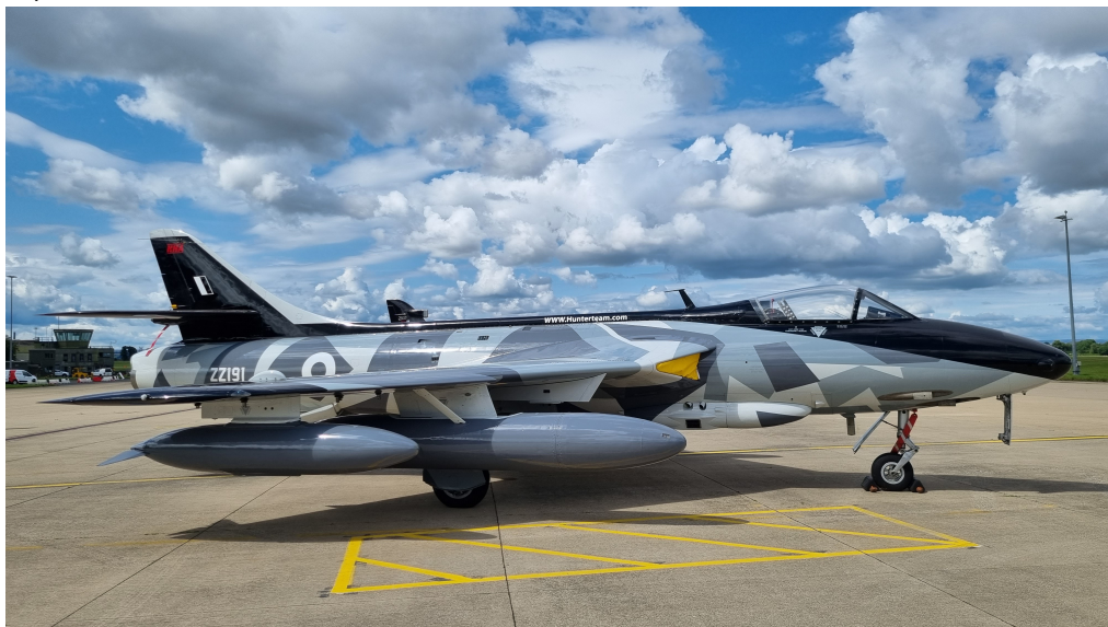
Hunter F58 ZZ191

The aircraft were lined up on the former 100 Squadron pan but these finest military aircraft were quite compact and to add photographic insult to injury bright yellow safety barriers had been placed around the Hawk which rendered photography pointless although these were later removed but movement around the pan was quite restrictive with the Station media comms team shepherding people around but lacking the skills of a good sheepdog handler meaning views into Hangar 4 and the two Hawk T1's could easily be had as were opportunities to view and photograph the other three Qatari Hawks on the flightline , two of which flew while we were there so a bonus in that respect . Sadly the potential of a Chinook participating failed to appear as they were on nights , the Tutors buzzed around the circuit and two F-15's were clearly heard and occasionally glimpsed above and through cloud as they circled nearby Dishforth and Topcliffe .