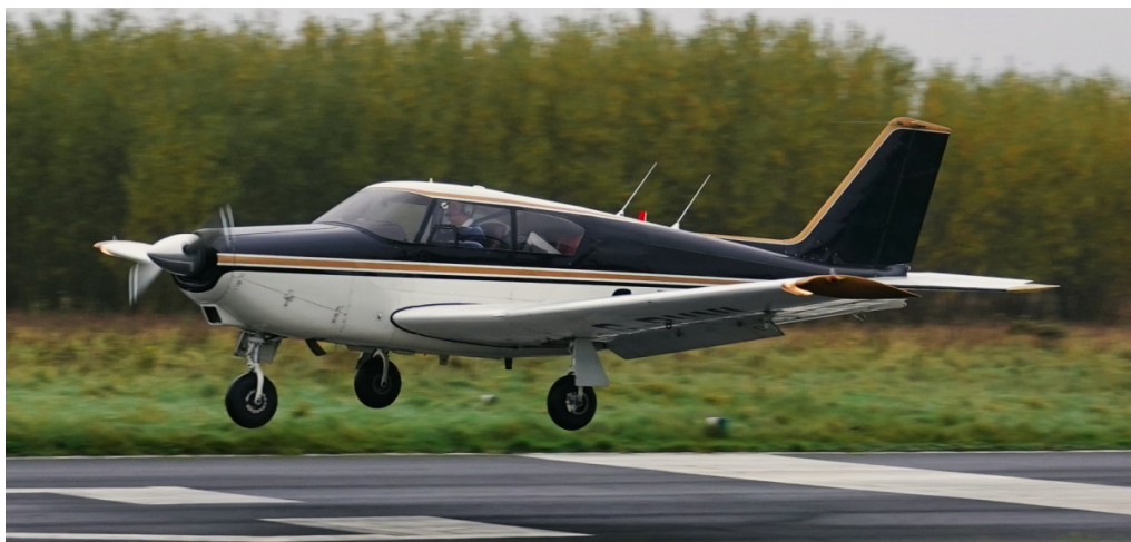
G-BWNI PA24 Commanche 28/10