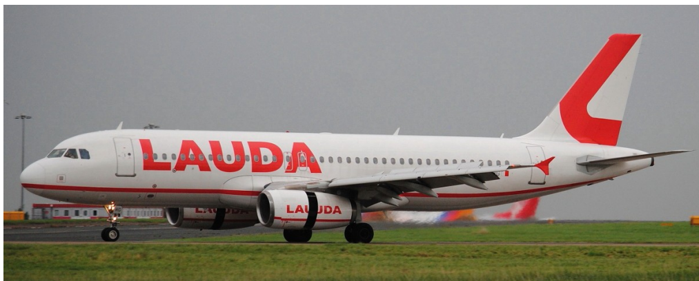
9H-LMG Airbus A320 Lauda/Ryanair 10/10 Dave Wooler

Krakow (2333/2332, "8BA/96YF", Wed/Fri):-4/10 SP-RKU, 6/10 SP-RZH, 11/10 SP-RZK, 13/10 SP-RZG, 20/10 SP-RZM(positioned in from Manchester as FR333), 25/10 SP-RZC, 27/10 SP-