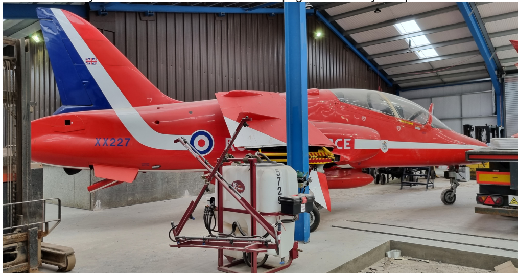
Hawk FSM XX227 at Agility store , Leyburn , 19 April 2023

Photos of Exelby Services are from their Facebook page and the Leyburn photos are mine .