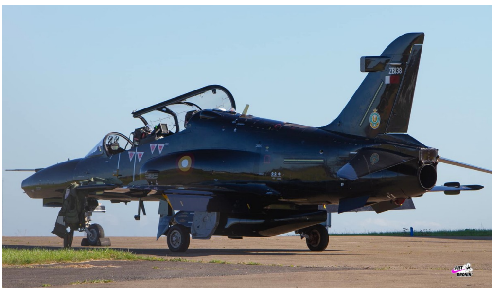
ZB138 BAE Hawk MK156 Qatari AF 12/10