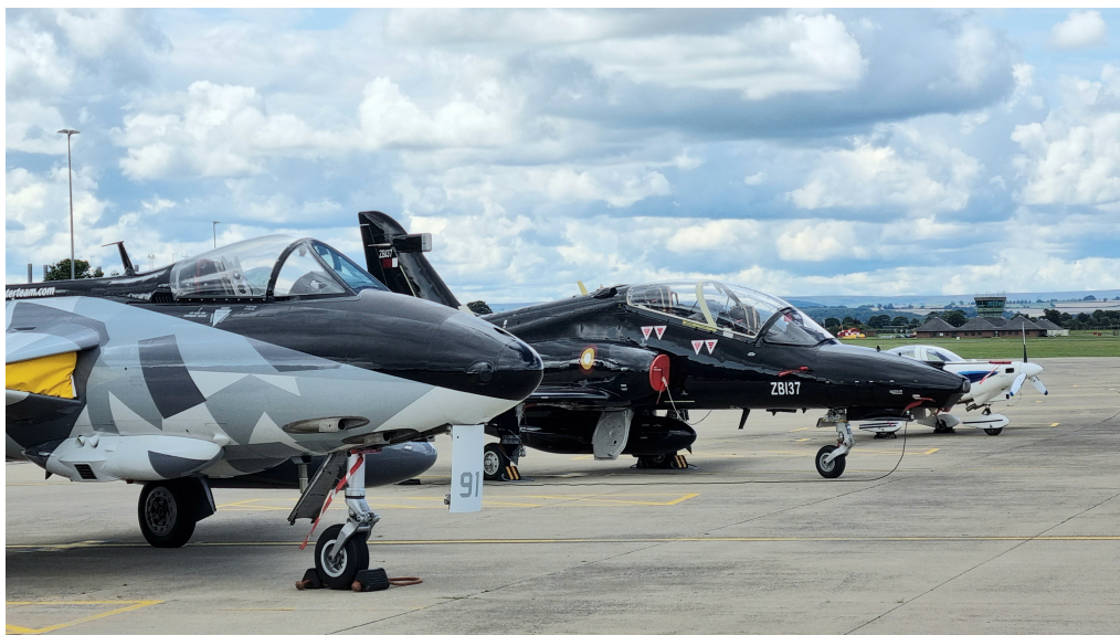
The Winner by a Nose