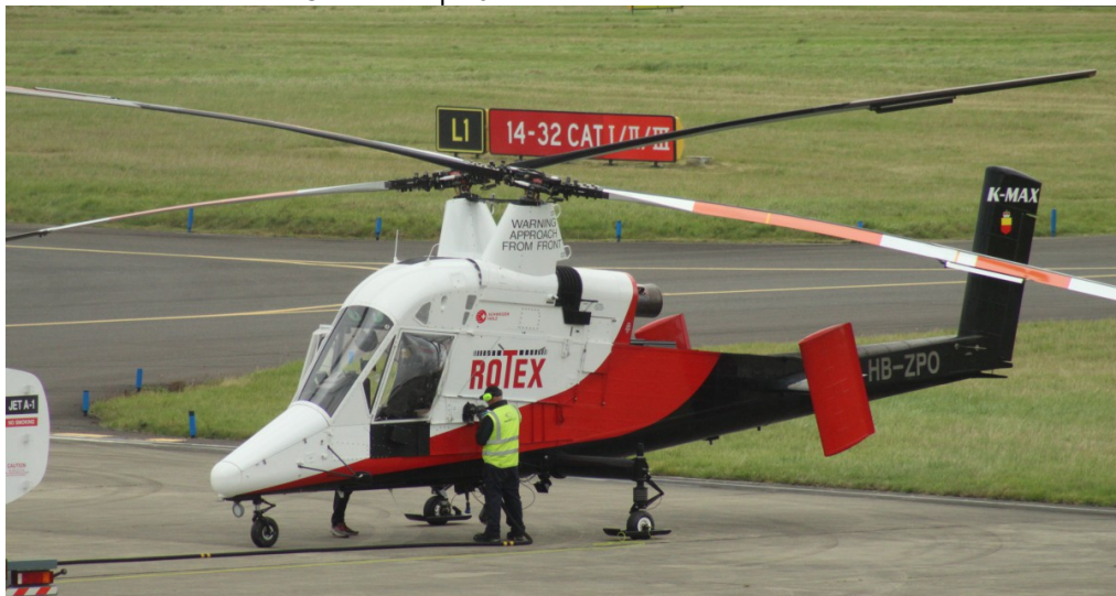
HB-ZPO Kaman K1200 K-Max 05/10 Ian Gratton

Cessna 680 Sovereign SE-RFL dep 07:55 to Oxford, Cessna 560 Excel G-NJAA arr 12:45 fr Southampton dep 13:33 to Prestwick, Challenger CL604 N69DT arr 15:46 fr Biggin Hill n/stop, Fairchild Sa227 Metro III OY-NPD dep 19:47 to Billund.