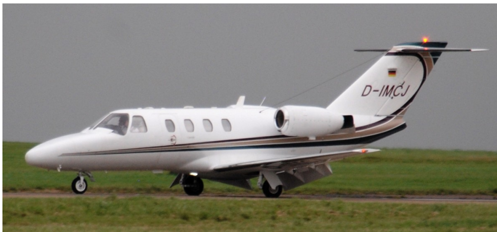
D-IMCJ Cessna 525 CJ1 10/10 Dave Wooler