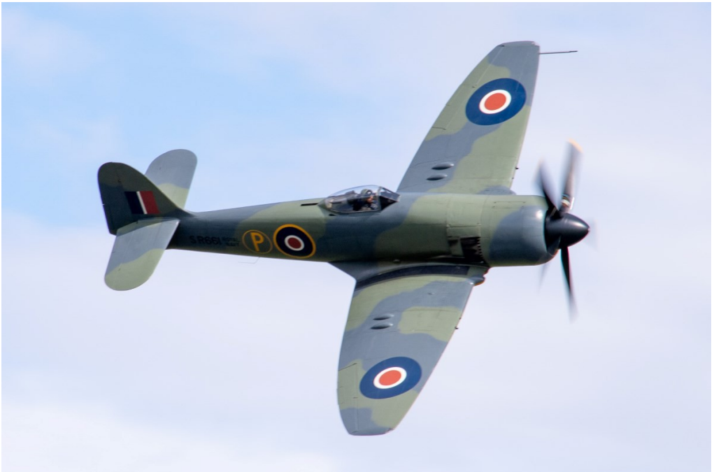
G-CBEL Hawker Sea Fury FB11 - Fighter Aviation Engineering