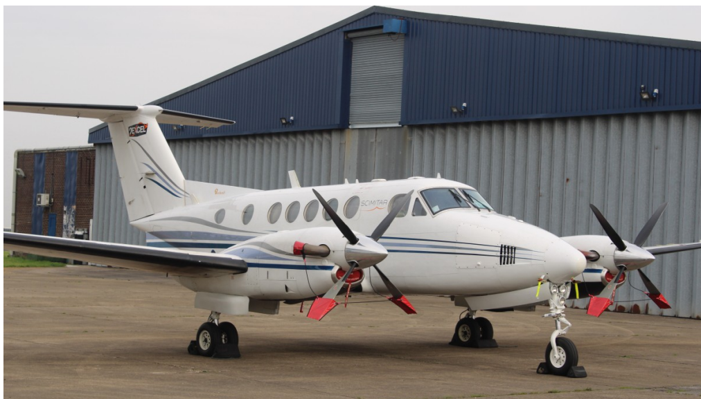
G-IMEA Beech 200 Kingair 08/10 Ian Gratton