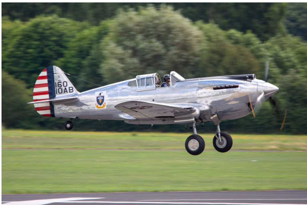
G-CIIO Curtiss P-40C Warhawk The Fighter Collection