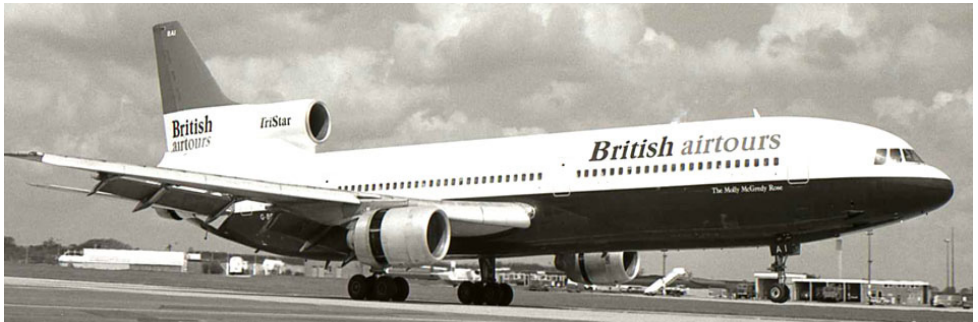
The first landing of Tristar British Airtours G-BBAI which was much more successful than it's second!