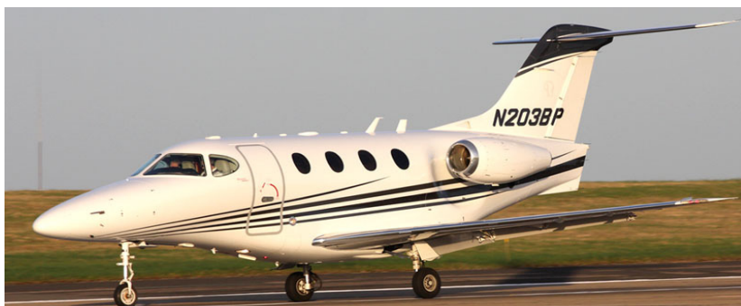
A very active resident at LBIA is Premier 1 N203BP.