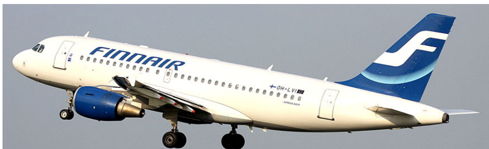
Finnair Airbus A.319 OH-LVI diverted to LBIA due to snow at Manchester on 16/12

MILITARY:- French Navy Falcon 10, 101F-YTDA (French Navy 55A2) carried out an ILS and overshoot(1453) while routing from Copenhagen to its home base of Landivisiau in Brittany. King Air 200 ZK459 (Cranwell 14) ILS and overshoot(1532), f/t Cranwell.