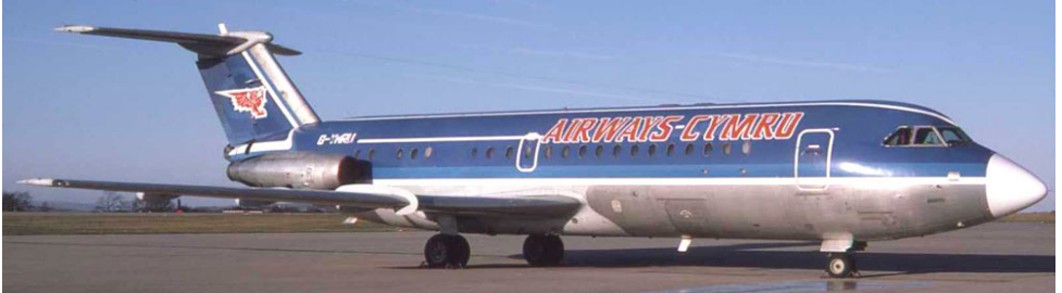
BAC 1-11-200 G-YMRU of Airways Cymru(Air Wales) parked nose in on stand 2

This month we present some colour and black and white classic airline shots from LBA.