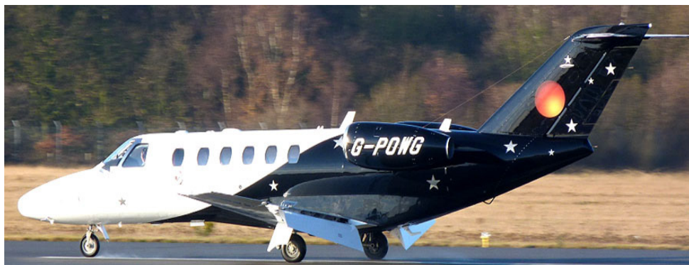
Citationjet G-POWG of Titan Airways arriving for attention at Kinch(Clive Featherstone)

DONCASTER AEROVENTURE:- The Tempest V cockpit section which recently arrived here is reported as SN280, and the Valletta T.3 nose section as from WJ476.