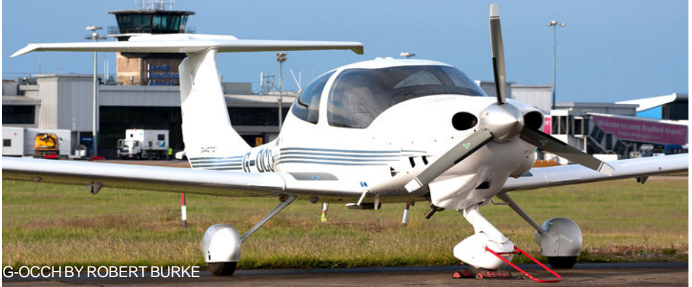
G-OCCH