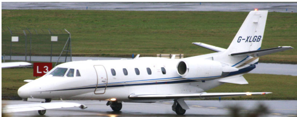
Owned by Tosh Air, Citation XL G-XLGB visited on 4/12 and 6/12

EXECUTIVE JETS;- Citation XL G-XLGB (Lonex 36LB) from Alicante(2130), n/s to Aberdeen(1409).