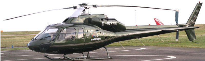
Twin Squirrel G-WENA is operated by Multiflight Aviation