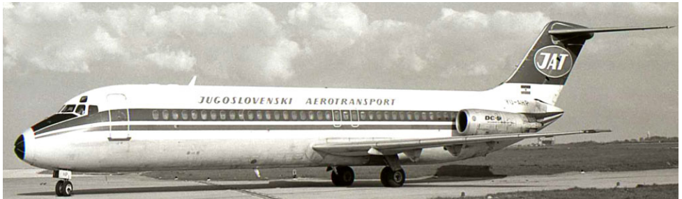
Regular Sunday afternoon visitors were JAT DC-9-30s, this example YU-AHP taxiing onto the apron