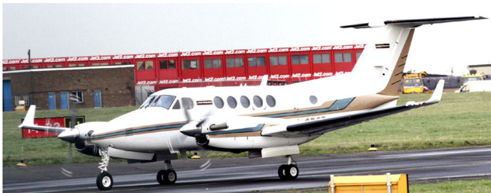
King Air 200 M-SPOR taxiing out for take off on Runway 14, 1/12

Both Yorkshire Air Ambulance Explorers(G-CEMS/G-SASH) operated flights during the day.