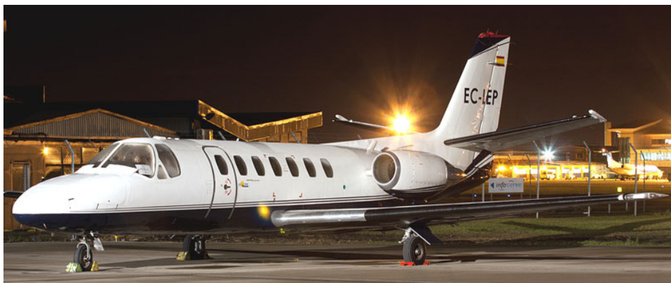
Citation V EC-LEP spent 2 nights on Multiflight/East early in the month(Robert Burke)