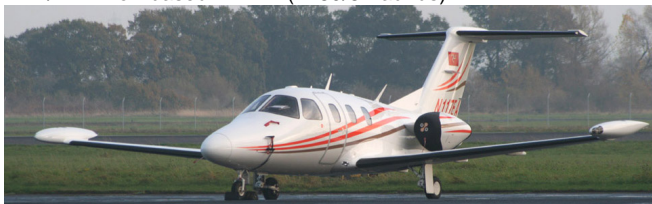
Pictured here at Teesside Eclipse Jet N117EA was a visitor to LBIA on 2/12

Ryanair:- EI-DPI(1NK/94NZ Dublin, 2PT/5ER Krakow). EI-EMJ(7TP/7UG Arrecife). Spare EI-DHA/EI-EBX/DLT. Non-based EI-DYN(2489/8 Kaunas).