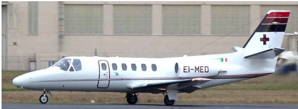
Citation Bravo EI-MED heading home to Irealnd after attention from Kinch(Clive Featherstone)

EAGLESCLIFFE:- Visiting the hotel here on 12/10 was Loughborough based Twin Squirrel N766AM.