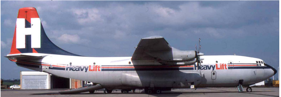
Shorts Belfast G-BEPS of Heavylift parked outside the fire station awaiting its freight