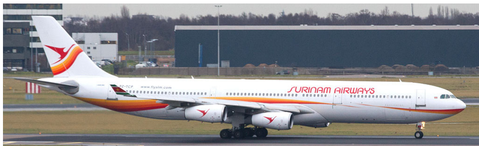
Taken recently at Amsterdam, Surinam Airways A.340 PZ-TCP