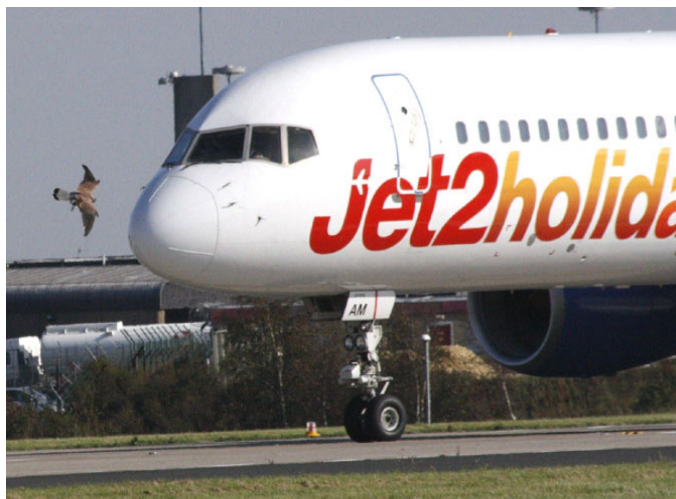
Close encounter between Jet2 Boieng 757 G-LSAM and a kestrel at LBIA