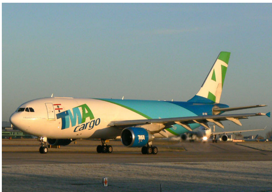
OD-TMA Airbus A.300F4-622R Trans Mediterranean Airways Manchester, 14/01/12