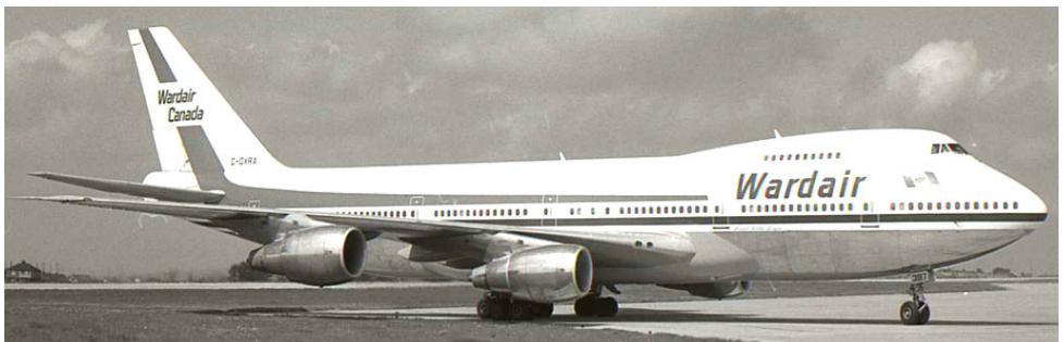
Boeing 747-200 C-GXRA taxiing onto stand on arrival from Toronto via Birmingham