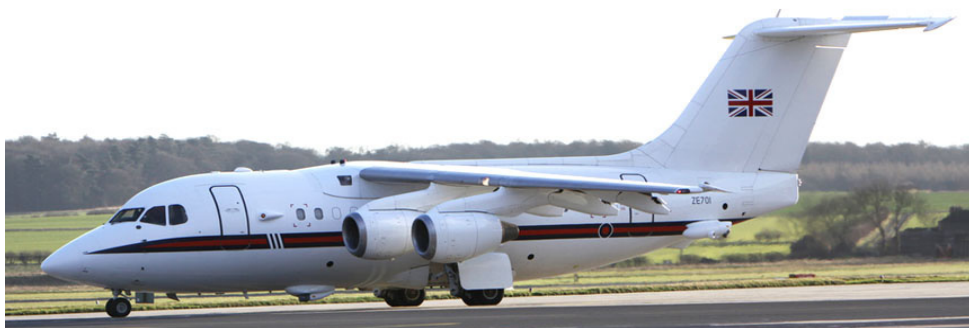
BAe.146 CC2 ZE701 OF 32(R) Squadron taxiing onto stand at Humberside

operating at Spadeadam were ZJ174, ZJ175, ZJ202, ZJ210, ZJ211 and ZJ220 all Apache AH.1. Other visitors:- 1/12 Tornado GR.4s ZA398/ZE116 (Chieftain 1/2); 5/12 ZE395 BAe.125 (Northolt 35, training); 10/12 G-FPLD King Air 200 (Calibrator 484), 11/12 ZE700 BAe.146 (Ascot 1519). On 5/12 USAF C.17A 06-6162 (Reach 808) was clearly visible overhead at 1515, heading West.