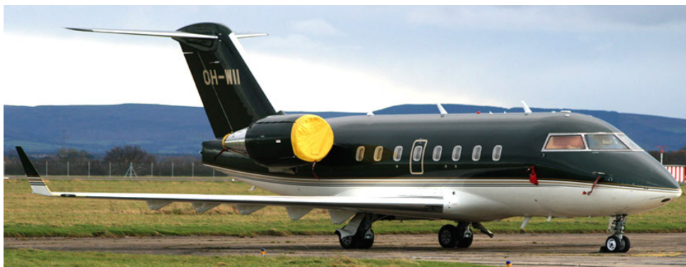
Challenger 604 OH-WII of Jetflite parked on the ramp at Teesside, 10/10

9/12 OH-WII Challenger 604(Jetflite 30), G-DFTL PA-46T, N352CM PA-46T, M-ARTY PC-12 10/12 D-EKNA Mooney M.20F, G-XAVB Citation Mustang(Beauport 501) 11/12 G-OZBM Airbus A.321(Monarch 741P), G-LIVY King Air 200(n/s) 12/12 I-TOPX Hawker 400XP(n/s), N766AM Twin Squirrel, XX184(Pirate 18, overshoot) 13/12 D-CEFA Citationjet 4(Everflight 444), G-CEGP King Air 200(Cega 886) 14/12 ZH886 Hercules(Ascot 123, training), XX329 Hawk(Pirate 08, overshoot) 15/12 ZZ504 Shadow(Vulcan 01, training), HB-VMU Citation XL(Jet Aviation 402) 16/12 G-SIRS Citation XL(Lonex 99RS), G-FBKD Citation Mustang(Blink 8H) 17/12 D-CEFD Citationjet 3(Everflight 333), G-FBKA Citation Mustang(Blink 5E) 20/12 G-CELB Boeing 737/300(Channex 300T), training with G-CELI(Channex 32LI) 21/12 LX-LAA Lear Jet 45(Lion King 7 Ambulance) 23/12 G-CEGR King Air 200(Cega 636) 28/12 G-SUET Long Ranger(Pipeline 81) 31/12 G-LEAA Citation Mustang(Lonex 88AA)