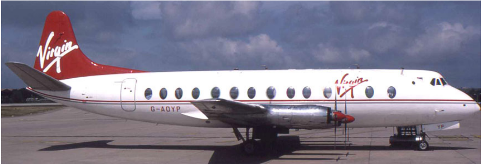
Viscount 800 G-AOYP on lease to Virgin from British Air Ferries