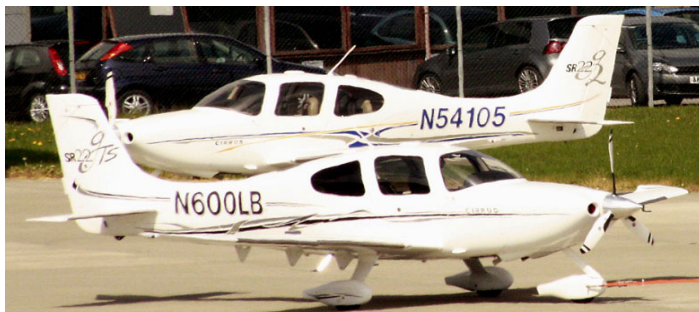
Two of the five examples of Cirrus SR.22 aircraft based at LBIA, N600LB and N54105 (Mike)

The few remains of the former Aer Lingus Shorts 360 live on the fire practice ground, which is situated on the Eastern side of the airfield, near Scotland Lane. Multiflight also operate three Dauphins(G-NHAA/B/C) on behalf of the Great North Air Ambulance, however these are based at various points in the Northeast and Cumbria. They do visit LBIA regularly for maintenance. The entire fleet of Jet2.com is nominally based at LBIA but most are stationed at their other bases around the country. This summer it is expected that 8 Boeing 737/300s and 3 Boeing 757s will be based at LBIA. Finally, Ryanair have a base at LBIA with currently 4 Boeing 737/800s, this will reduce to 3 of the type in summer.