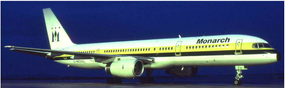
The first Boeing 757 to land at LBA, G-MOND of Monarch visited before the runway extension