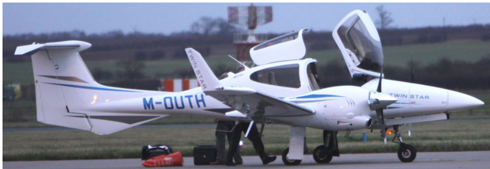
An evening arrival, DA.42 Twin Star M-OUTH is a recent addition to the Manx Register