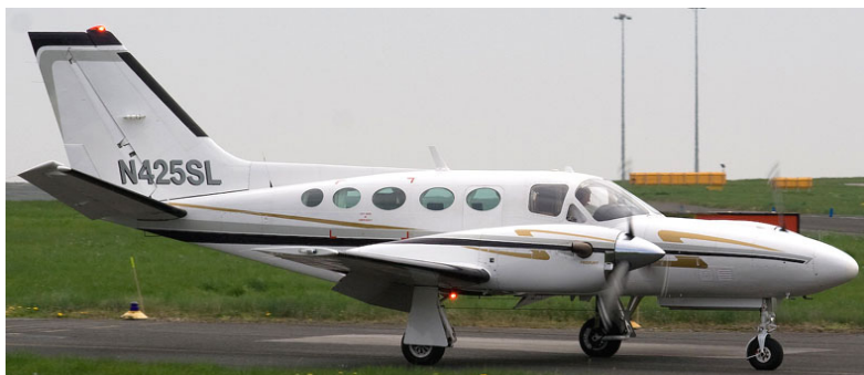
Cessna 425 Conquest N425SL has been based at LBIA for some time