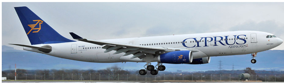
A.330 5B-DBT arriving at Teeside for the removal of seats before returning to the lessor

TEESSIDE(Durham Tees Valley) Info and movements courtesy of dtymovments.co.uk