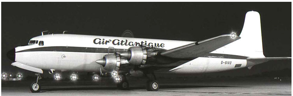
All fired up a ready to go, Air Atlantic DC-6B G-SIXC make a fine study under the floodlights