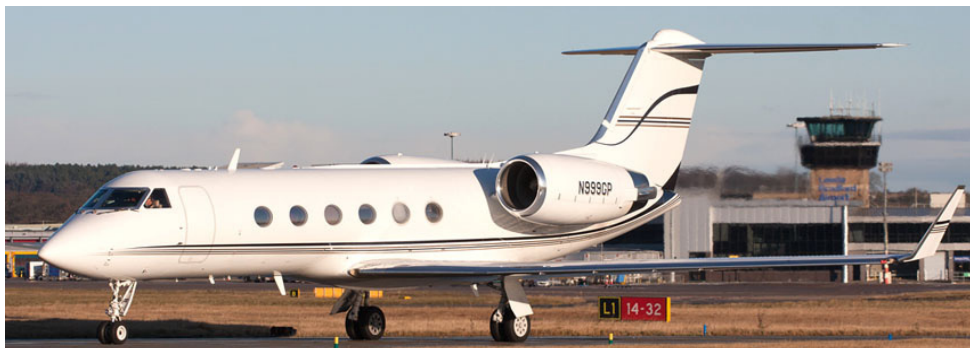
Gulfstream 550 N999GP arrived from Florida on 5/12 for a brief visit. The aircraft, which is based at Las Vegas was on its first visit to LBIA.(Robert Burke)