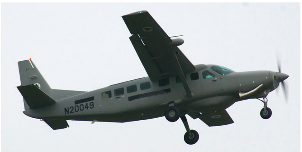
N20049 Cessna 208B on delivery to Afghanistan Air Force, Prestwick 19/10/12(Chris Glover)