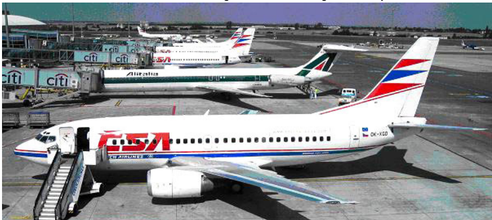
The time of B737 being a major type in fleet is gone; Prague Ruzyně viewing terrace – OK-XGD