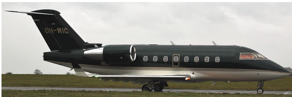
Operated by Jet Flite of Finland, Challenger 604 OH-WIC arriving at Teesside on 14/12

SUTTON BANK:- New resident with the Yorkshire Gliding Club is G-CGBK G.102 ex. Saltby. From the residents delete G-DEGD ASW17S exported last July to Germany as D-1217.