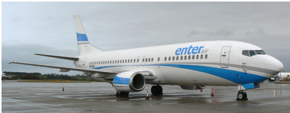
Enter Air Boeing 737/400 SP-ENI parked on the apron prior to operating a Lapland flight

In addition the company will lease a Boeing 737/800 from Travel Service of the Czech Republic to be based at LBIA, plus a Boeing 757/200 from Titan Airways to be based at Manchester. The company are also going to base one 737/300 in Alicante for the summer.