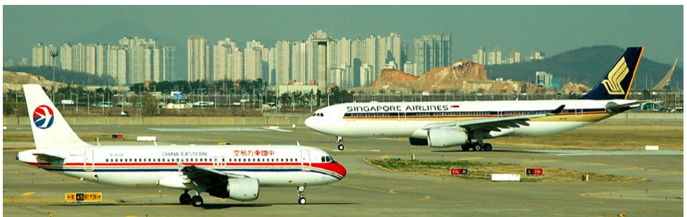
B-2338 Airbus A.320 of China Eastern, Soeul/Incheon International, 17/03/12