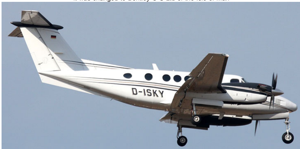
King Air 200 D-ISKY of Air Hamburg was on its first visit to LBIA when it arrived on 6/12