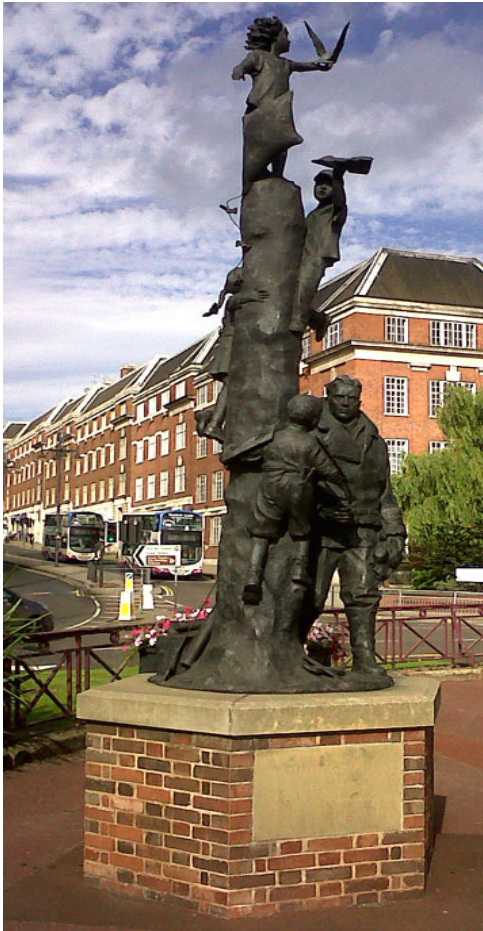
The monument at the bottom of Eastgate, Leeds