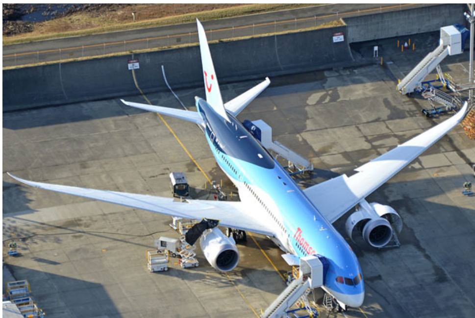
The first Boeing 787 Dreamliner for Thomson Airways G-TUIA at Boeing Field.

Titan A/W . The A320 destined for the carrier is EI-TAG (2791) of TACA. It was ferried from Washington Dulles to Shannon on 30/1 & will enter service as G-POWI in the spring.