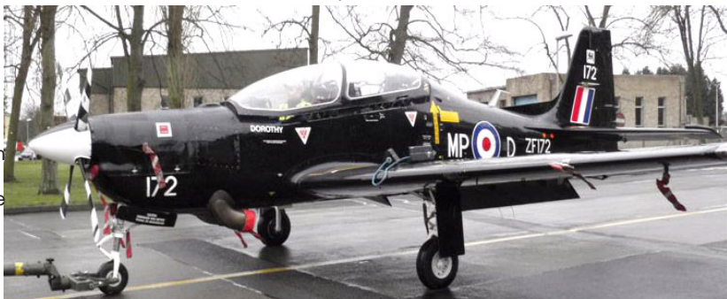
ZF172/MP-D "Dorothy" Tucano T1 of 72 Squadron based at Linton-on-Ouse