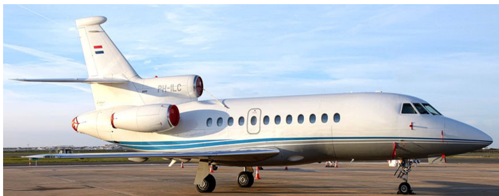
Falcon 50 PH-ILC was an early arrival from Sharjah, UAE on 15/12 The aircraft, operated by European Jet Management was on its first visit.