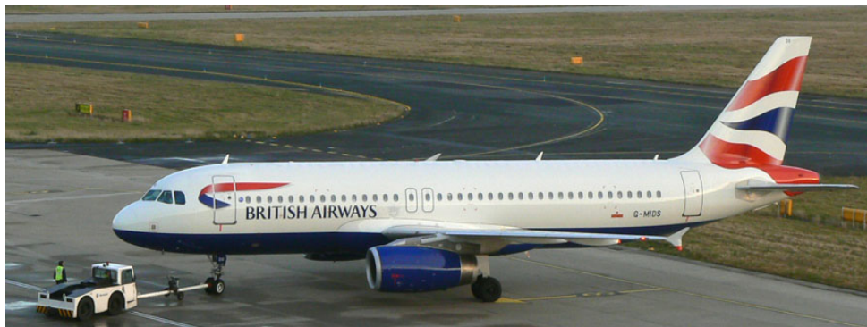
British Airways are using the odd Airbus A.320 instead of the usual A.319. Here A.320 G-MIDS, a former British Midland example is seen being pushed back off Stand 8 in readiness for departure back to Heathrow.