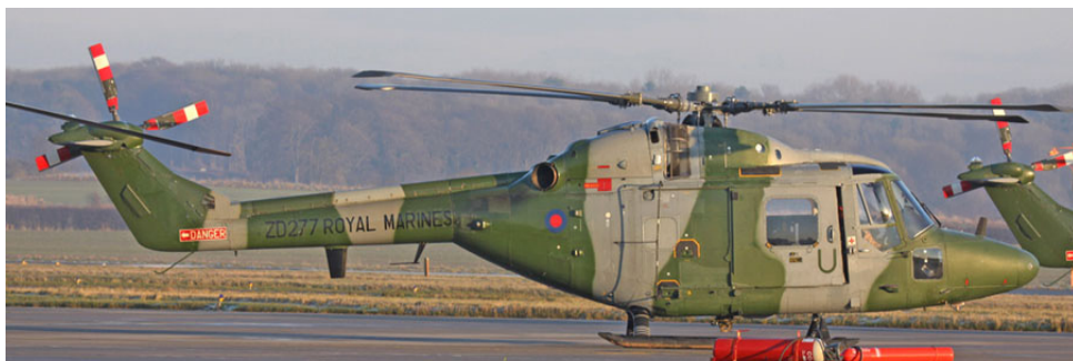
Royal Marines Lynx ZD277 pictured on a visit to Humberside, 13/12

10/12 CS-DXO Citation XL(Fraction 622E), G-EMHC A.109E(Costock 5), G-CEYU Dauphin 12/12 CS-DXP Citation XL(Fraction 076L) 13/12 Lynx XZ678(Ripsaw 1), ZD280(Ripsaw 2), ZD277(Ripsaw 3) 17/12 OY-LAF PA-34 Seneca(n/s) 21/12 M-ROWL Falcon 2000EAsy 29/12 CS-DKC Gulfstream 5(Fraction 787W, to Barbados)