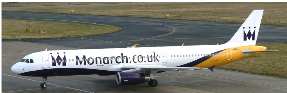
Airbus A.321 G-OZBT of Monarch taxiing onto stand following its arrival from Grenoble

Grenoble (7567/7532) – 15/12 G-OZBT, 22/12 G-OZBT, 27/12 G-OZBT, 29/12 G-OZBT.