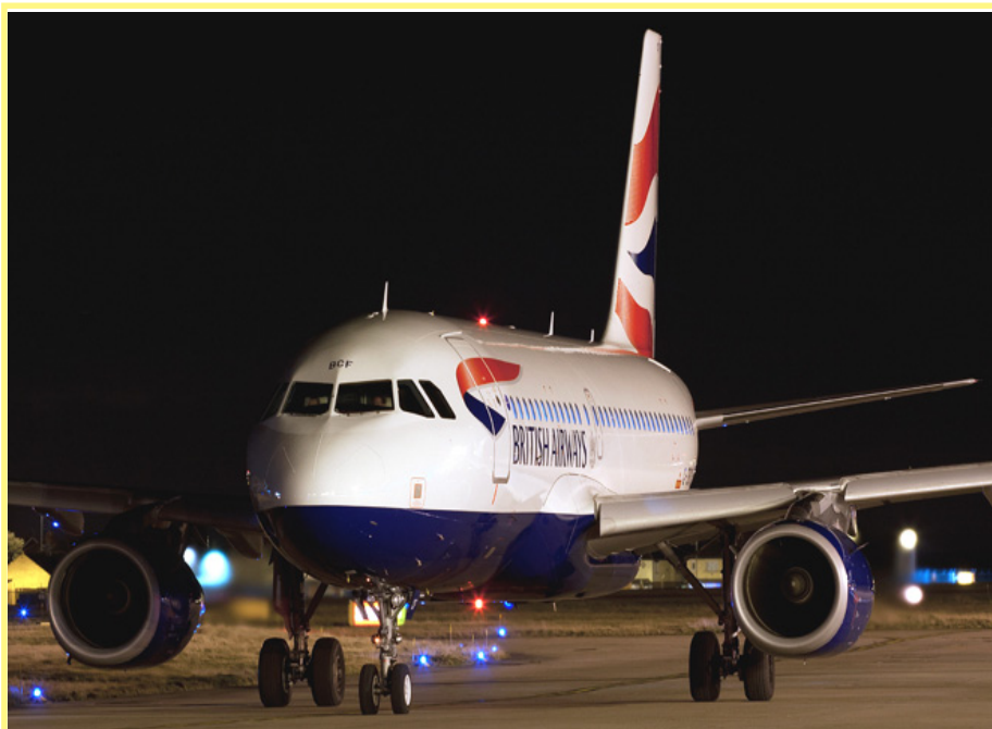
G-DBCF Airbus A.319 of British Airways Taxiing for departure at LBIA, 09/12/12 Robert Burke