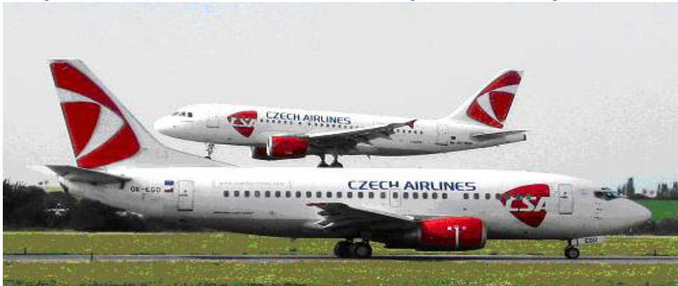
16.8.2009; OK-EGO taxiing for take off at Prague, Runway 24

The 13 January 2013 was the very last day the B737 has flown in Czech airlines colour scheme. My last flight on B737 was on 28 December 2012 to Geneva, flight OK0596/0597, registration OK-XGE.