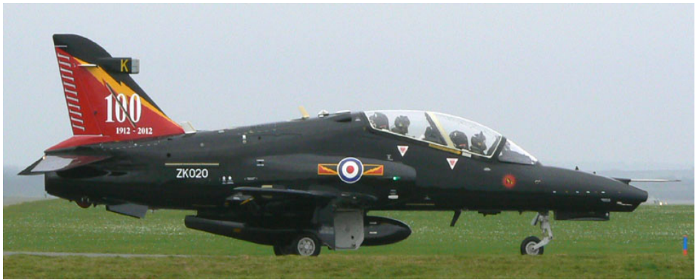
ZK020 Hawk T1 in special scheme, RAF Valley 07/01/13(Andrew Barker)