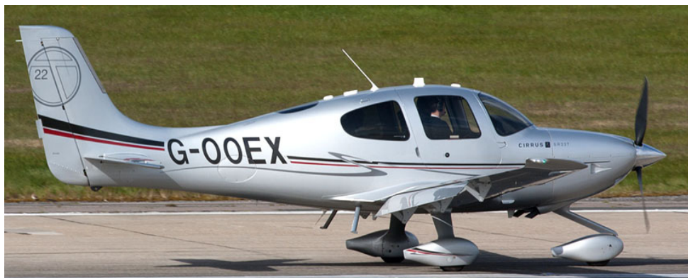
Cirrus SR.22T G-OOEX visited on 12/12, f/t its base at Peterborough(Robert Burke)