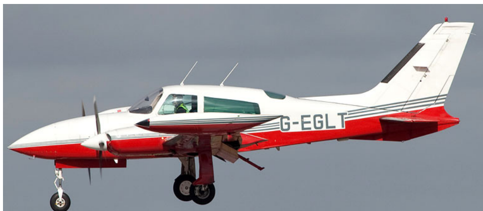
East Midlands based Cessna 310R G-EGLT paid a visit to LBIA on 27/12. This aircraft had first visited some 30 years ago when operated by Air Atlantique of Jersey as G-BHTV.