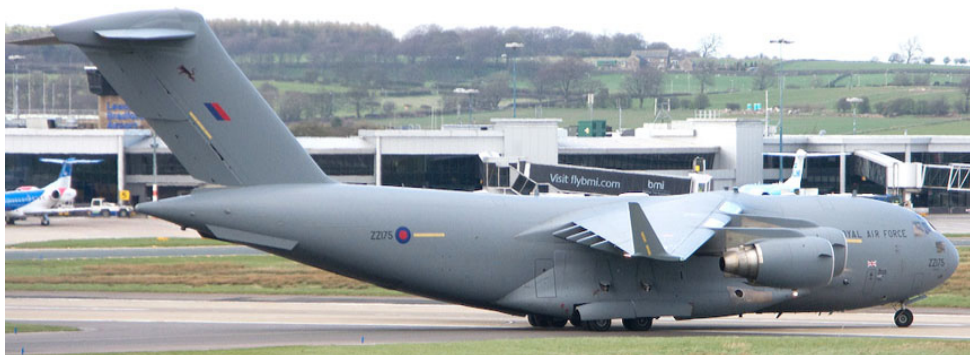
ZZ175 C-17A Globemaster C1 of 99 Squadron, based at Brize Norton