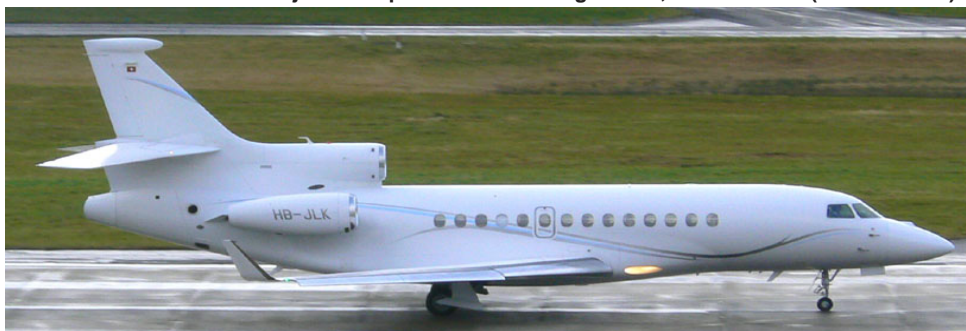
Falcon 7X HB-JLK taxiing for departure back home to Geneva on 18/12 after a night stop