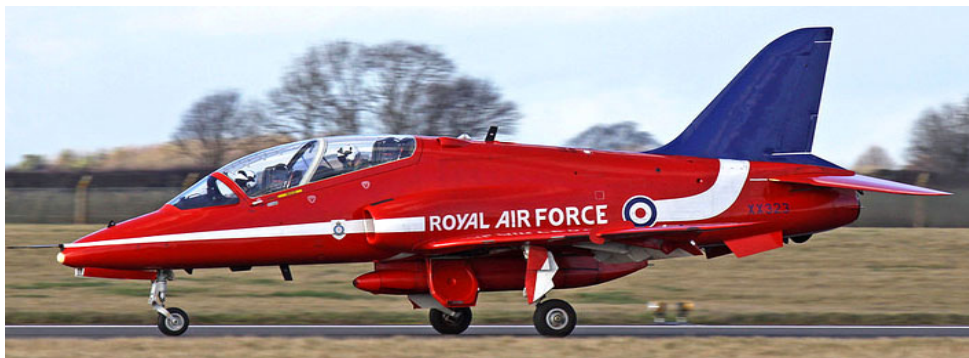
Red Arrows Hawk XR323 taxiing in following practice at Scampton, 4/2

WICKENBY:- G-CHDS Rans S.6 has recently arrived from Riby for flight testing and another new resident is G-CGDH Europa XS. From the Residents delete I-SKIP/RA3350K Su.26MZ (03-05) which is now sold in Hungary as HA-MSJ. A visit 3.10 noted new resident G-BTTY Kitfox, whilst G-BAPB DHC.1, G-VARG Varga 2150A and G-YAKA Yak 50 were all present to be given new C of A's following periods of inactivity. G-BAPB expired 31.5.98 and G-VARG expired 22.9.08 with both now renewed, whilst G-YAKA from Louth expired 1.10.08 and was dismantled and being worked on. Resident G-MWTP Shadow Srs.CD was damaged beyond economic repair on a strip at Grange Farm, East Barkwith on 12.7.