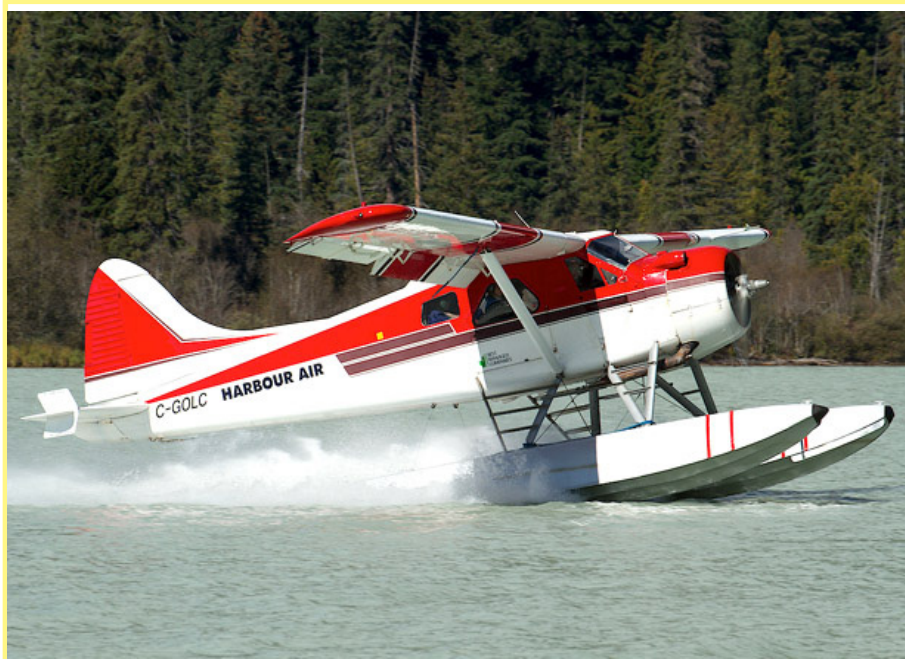
C-GOLC DHC-2 Beaver, Harbour Air Green Lake, Whistler, British Columbia, 25/09/13