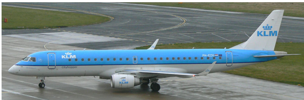
KLM Embraer 190 PH-EZV, making its first visit to LBIA, taxiing onto stand, 12/12

13/12 G-GDFB positioned in from East Midlands(043A) 14/12 G-CELZ positioned in from Newcastle(034E), G-GDFN positioned out to Manchester(041A) 15/12 G-CELJ positioned in from Chambery(042A) 16/12 G-CELZ positioned out to Newcastle(035E) 18/12 G-CELE positioned in from Dusseldorf(041A), G-CELJ positioned out to Manchester(051H), G-CELZ positioned in from Newcastle(031E), G-CELU positioned out to East Midlands(062J) 20/12 G-CELK positioned out to Alicante(043A), G-LSAB positioned in from Gatwick(109C), G-LSAN positioned in from Gatwick(148C) 21/12 G-GDFV test flight(053B), G-GDFO positioned in from Norwich(052K) 22/12 G-LSAI positioned out to/in from Manchester(041A/043A) 24/12 G-LSAK positioned in from Tenerife(041A) 27/12 G-GDFB positioned out to East Midlands(049A), G-CELU positioned in from East Midlands(032E) 28/12 G-CELA positioned in from Edinburgh(031E), G-GDFN positioned in from Manchester(032E) 30/12 G-CELA positioned out to Edinburgh(032E), G-CELD positioned out to East Midlands(031E).