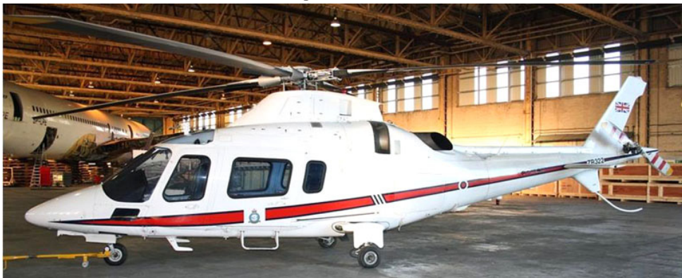
Northolt based Agusta A.108E ZR322 sheltering in the hangar ON 5/12