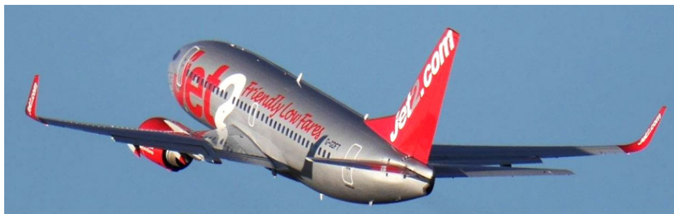
Boeing 737/300 G-GDFT became the first Jet2 737/300 in the silver scheme to sport winglets, when they were fitted to the aircraft at Norwich in December (Rod Hudson)

Its six months today until the Tour de France starts in Yorkshire and Leeds Bradford airport says its expecting it will boost their passenger numbers. 2013 was a record breaker for Leeds Bradford which saw 3.3 million passengers fly through the airport - an increase of 11 percent on the previous year. The last 12 months have seen Yorkshire's airport expand to serve over 70 domestic and international destinations alongside the introduction of important new airlines such as British Airways, Monarch and Thomson Airways. Leeds Bradford Airport say that 2014 will build upon a successful year following the recent announcement of new service from March to Copenhagen. Tony Hallwood Aviation Development and Marketing Director said: "2013 has been a truly remarkable year for Leeds Bradford Airport as we expanded our services offering more domestic and international destinations than ever before." Our achievements were also recognised by the Airport Operators Association, who in November awarded Leeds Bradford the title of Best Airport under 6million passengers.* "As Yorkshire's international gateway we have a clear ambition to deliver a wider range of airlines and routes for our local business and leisure passengers alongside encouraging an increase in the number of inbound visitors who can fly directly into Leeds Bradford. "LBA look forward to welcoming new Yorkshire travellers to the airport in 2014."