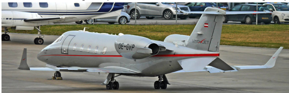
Lear Jet 60 OE-GVP of Vista Jet parked on Multiflight/East, 6/12