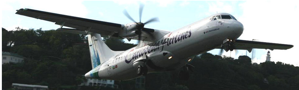
9Y-TTC ATR-72-600 of Caribbean Airlines