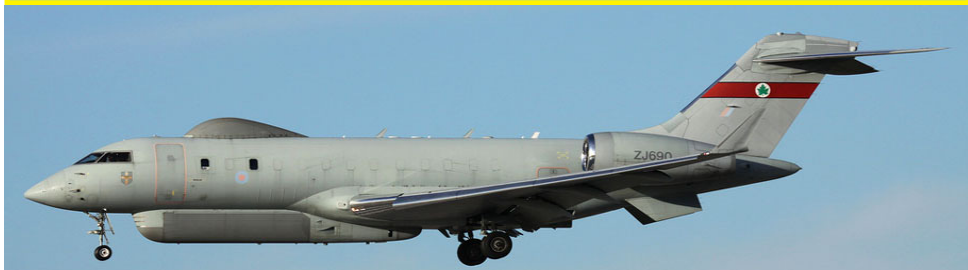
ZJ690 Sentinel R1, RAF, landing at Waddington, 08/01/14