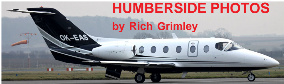
Beechjet 400A OK-EAS operated by Time Air visited twice during December 2013