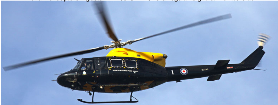
Shawbury based Bell 412 Griffin ZJ235, crew training at Humberside on 10/12