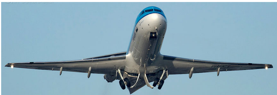
PH-JCT Fokker 70, KLM, departing Runway 14, LBIA on 16/01/14(David Blaker)