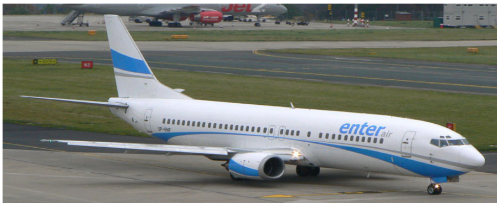
Enterair Boeing 737/400 SP-ENF taxiing for departure on a Lapland Charter, 2/12

Geneva (7346/5) -14/12 G-EZDM, 15/12 G-EZDE, 20/12 G-EZBV, 21/12 G-EZFB, 22/12 G-EZDU, 23/12 G-EZBJ, 26/12 G-EZBJ, 27/12 G-EZBJ, 28/12 G-EZDV, 29/12 G-EZDU, 30/12 G-EZFM.