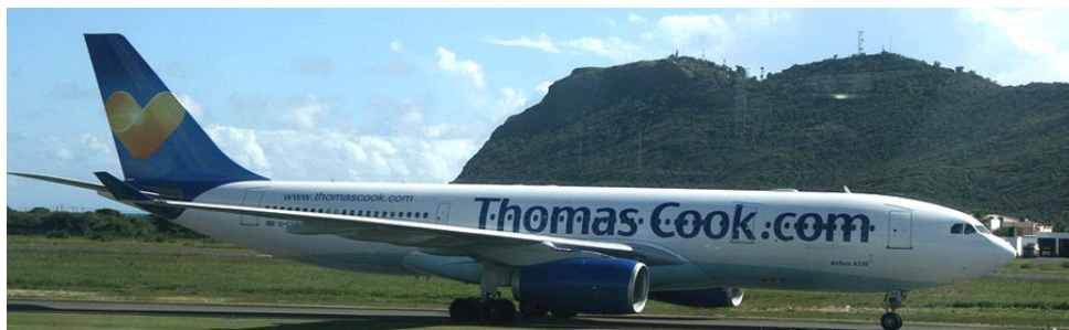
G-CHTZ Airbus A.330-234 of Thomas Cook(formerly G-WWBM of British Midland)