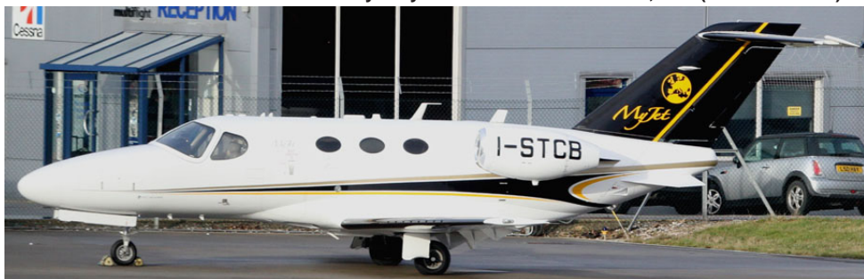
Citation Mustang I-STCB of Sur Aviation/MyJet on Multiflight/East, 20/12