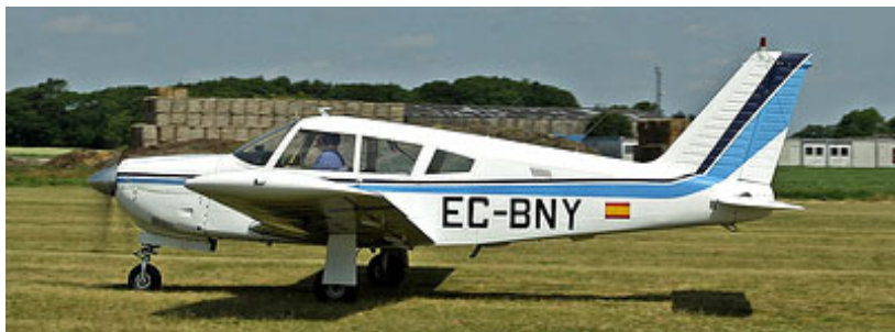
Beverley based PA-28R Arrow EC-BNY is a regular sight at Brighton

No changes here with HA-PPC SE.3130 (1500) still parked outside inactive.