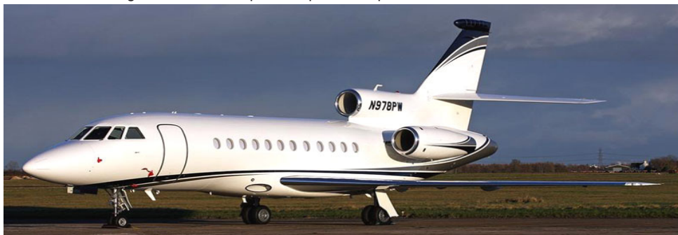
Falcon 900EX N978PW based in Delaware, parked on the apron in early December