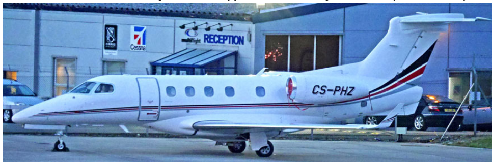
Phenom 2 CS-PHZ of Netjets was parked on Multiflight/East, 6/12 to 11/12(Rod Hudson)