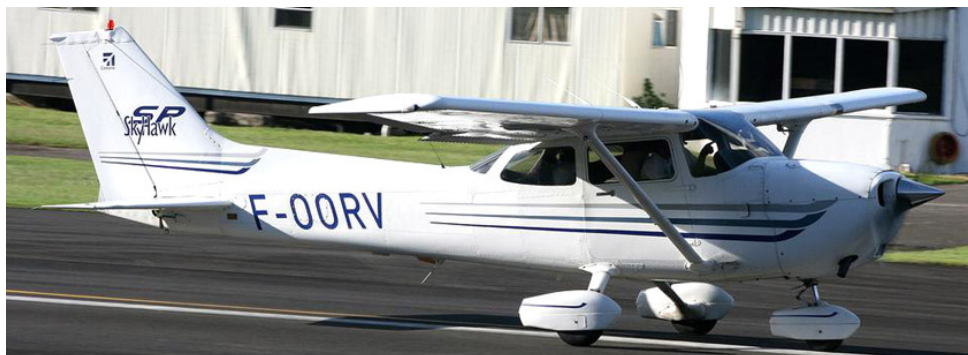
F-00RV Cessna 172S Skyhawk SP