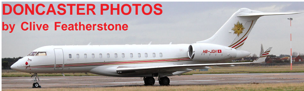
Owned by Lerco AG and operated by Comlux Aviation Global Express HB-JGH, 16/12