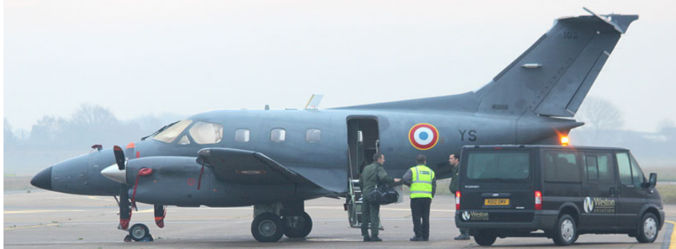
French Air Force Xingu 102/YS arrived as a diversion due fog at Waddington on 11/12