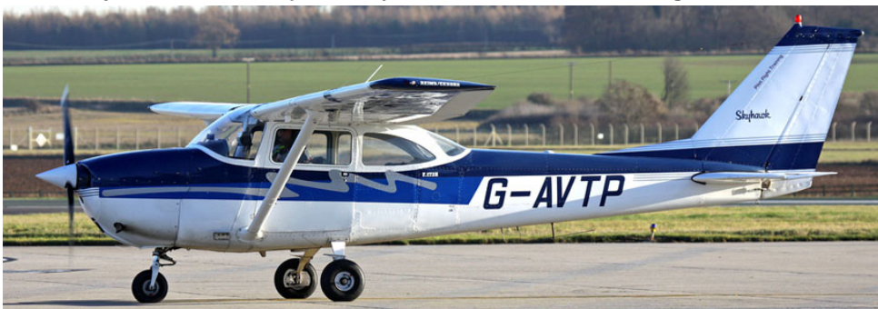
1967 vintage Cessna F.172H G-AVTP, based at Nottingham, taxiing for departure 7/12