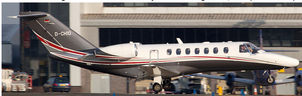
Touching down on a flight from Biggin Hill on 10/12, Citationjet 3 D-CHIO(David Blaker)