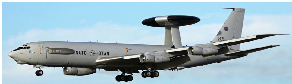
NATO Boeing E.3A LX-N90466 on finals to Waddington, 8/1(Rich Grimley)