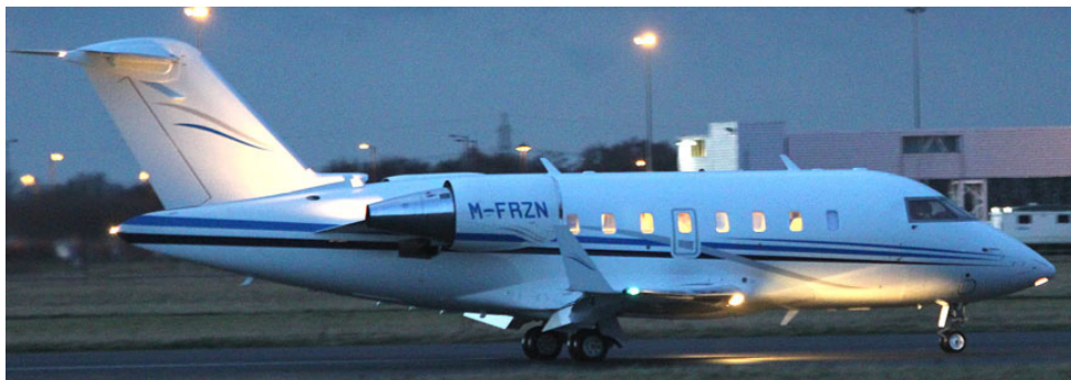
A late arrival on 30/12 was Challenger 605 M-FRZN, owned by Iceland Foods