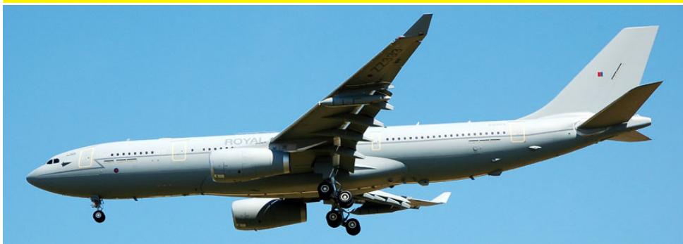
ZZ333 Airbus A.330MRTT Voyager, RAF, landing at Prague/Ruzyne, 17/08/13(Martin Zapletal)