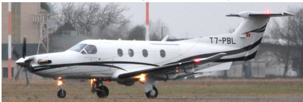
San Marino registered Pilatus PC-12 T7-PBL arriving on an extremely wet runway, 30/12