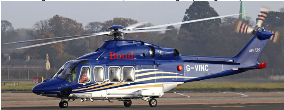
Bond Helicopters Agusta AW.139 G-VINC is a regular sight at Humberside