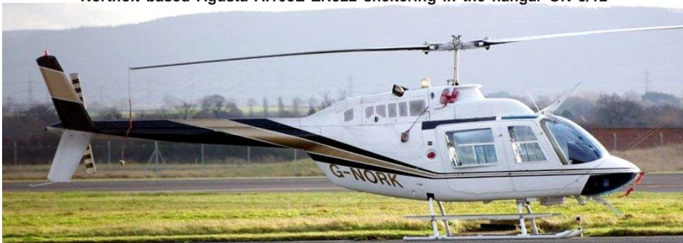
Jet Ranger G-NORK was parked up on the apron over Christmas and New Year