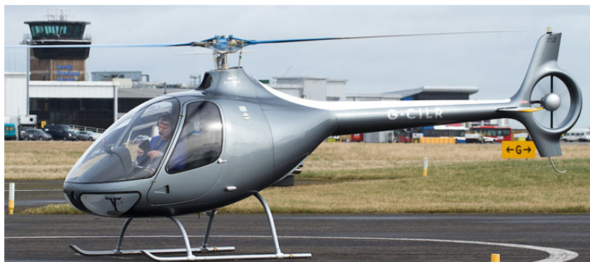
G-CILR Guimbal Cabri G2 delivered to Multi- flight flying school on 20/02/15