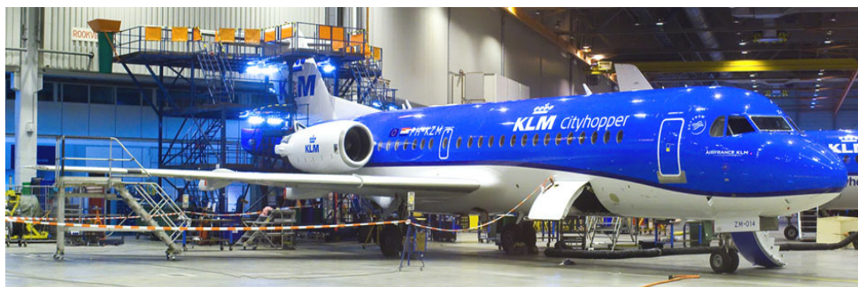
PH-KZM Fokker 70 of KLM, one of the first to be re-painted in the new revised colour scheme

SAS have announced plans to acquire a 100% shareholding in Danish regional carrier Cimber. SAS plans to operate Cimber's fleet of 12 CRJ-900s from Copenhagen. Cimber's early decision to retire its one ATR-72 and 8 CRJ 200's will still go ahead. The deal, worth $3.3 million, is due to be completed by April.