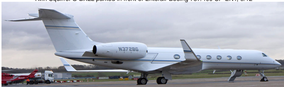
Operated by Contrail Aviation of Philadelphia, Gulfstream 550 N372BG visited on 2/12