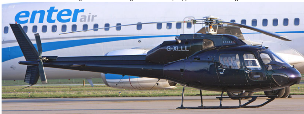
Twin Squirrel G-BXLL parked in front of Enterair Boeing 737/400 SP-ENT, 9/12