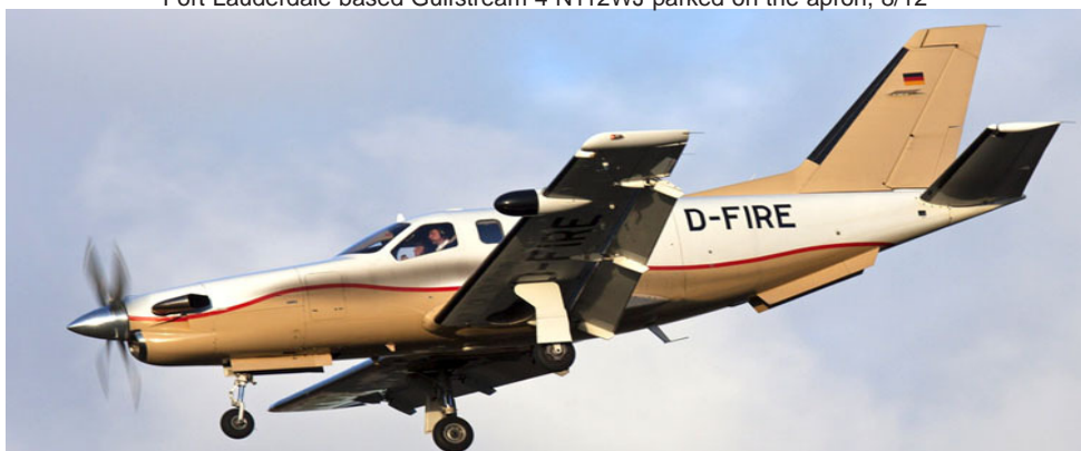
Malibu Mirage D-FIRE making a rather steep approach for landing on 3/12