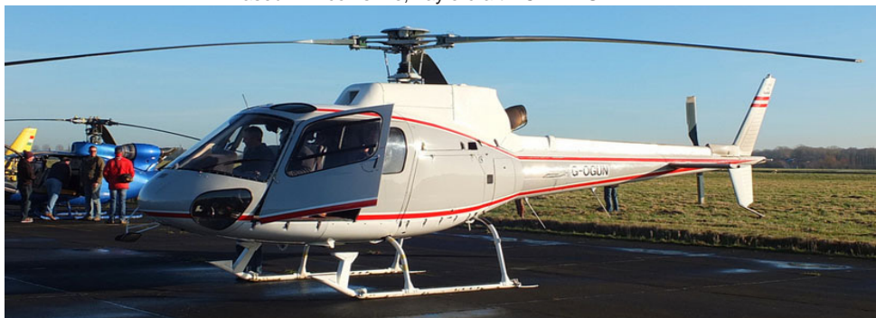
Twin Squirrel G-OGUN is based at Huigate, east of York