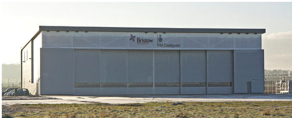
The new HM Coastguard facility at Humberside Airport is now complete and the first inmate is Sikorsky S-92 G-MCGE operated by Bristows (Rich Grimley)