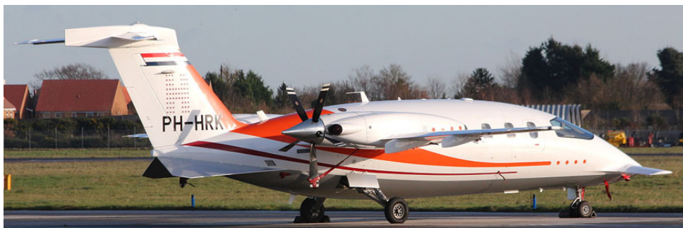
Avanti PH-HRK of Jet Netherlands basking in the Doncaster sunshine, 12/12