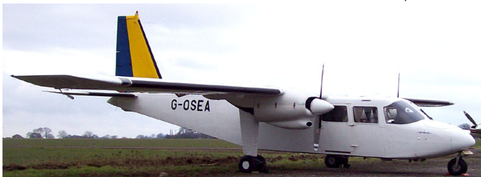
Pictured at Sturgate in early 2015, Islander G-OSEA is based at Crosland Moor(Pete Hobson)