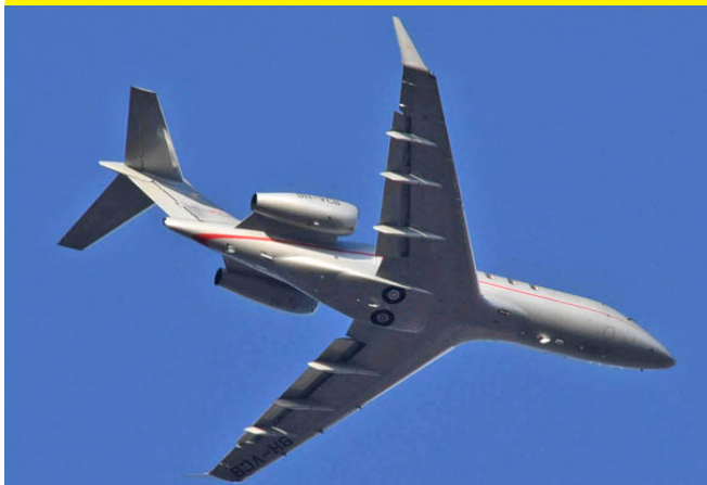
Challenger 604 9H-VCB operated by Vista Jet/Malta carried out numerous visual circuits while crew training on 15/12 (Rod Hudson)