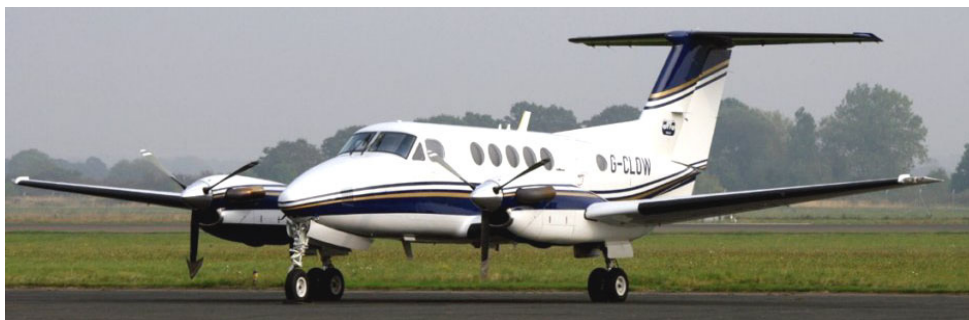
IAS Aviation of Teesside leased in King Air 200 G-CLOW in Mid-December