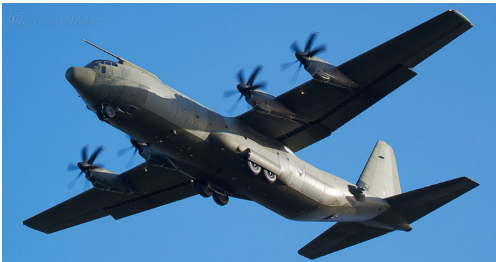
RAF Hercules C5 ZH885 crew training at LBIA on 6/12