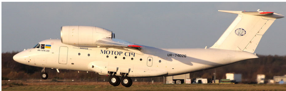
AN-74 UR-74026 of Motor Sich Airlines departing on a freight charter, 10/12