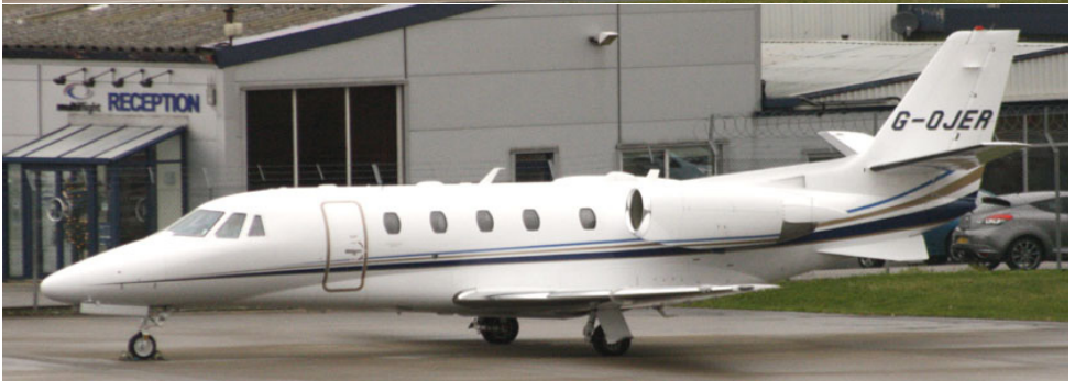
The latest addition to the Aviation Beauport fleet Citation XL G-OJER is becoming a regular sight at LBIA(Mike Storey)