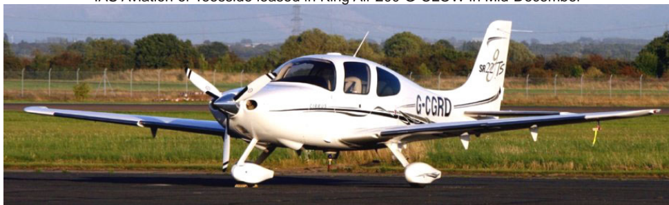
Cirrus SR.22 G-CGRD visited Teesside on 2/12 and is based at Southampton