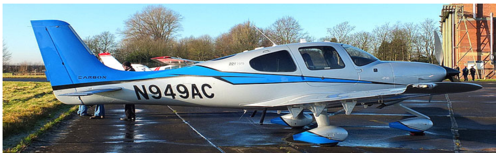
Cirrus SR.22 N949AC, believed to be based at Blackpool