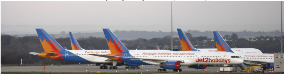
Just some of the Jet2 fleet currently parked up at LBIA(Mike Storey)