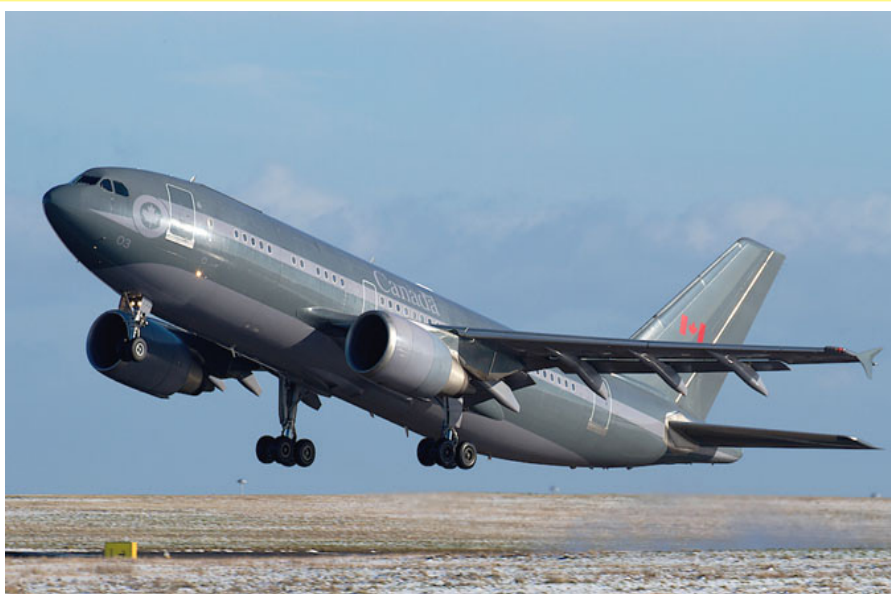
CC-150 Polaris 15003 of the Canadian Air Force departing LBIA David Blaker