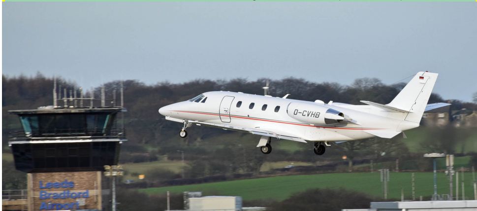
Citation XL D-CVHB operated by Viessmann Werke departing LBIA, 1/11(Rod Hudson)