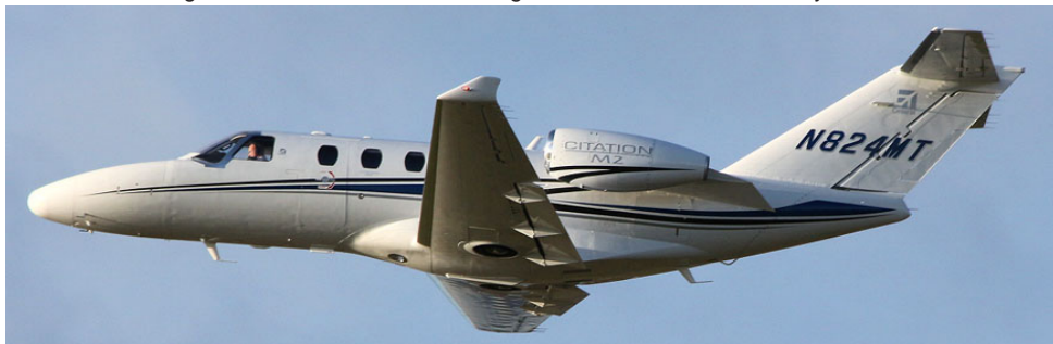
Citationjet M2 N824MT is the demonstrator for this new type with a completely modified wings, 3/12 The aircraft also visited Church Fenton(Leeds/East Airport) and LBA in early 2015