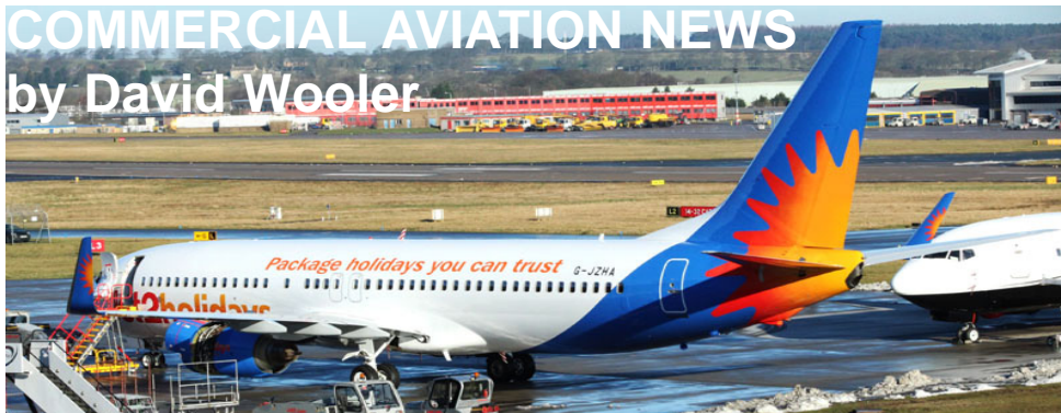
G-JZHA, latest 737/800 to join the Jet2 fleet, parked on Multiflight/East(Mike Storey)