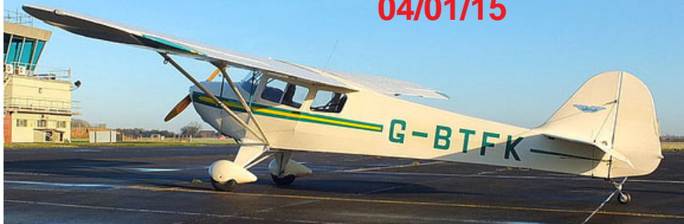
Based in Lincolnshire, Taylorcraft BC-12D G-BTFK