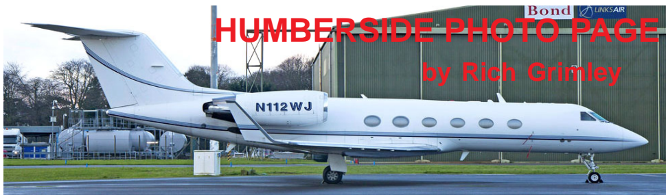
Fort Lauderdale based Gulfstream 4 N112WJ parked on the apron, 8/12