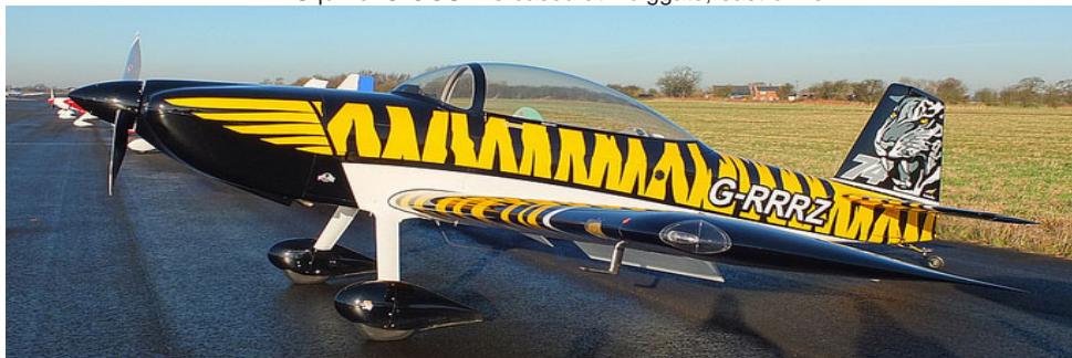
Vans RV-6 G-RRRZ crossed over the Penines from its base at Barton