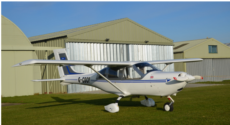
G-CDCP Jabiru J400