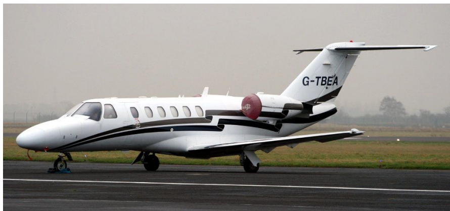
G-TBEA Citation 525A CJ2 20/12