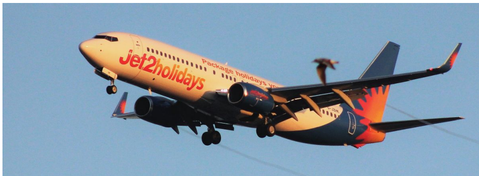
G-JZHK Boeing 737 Jet2Holidays 30/12 Jim Stanfield