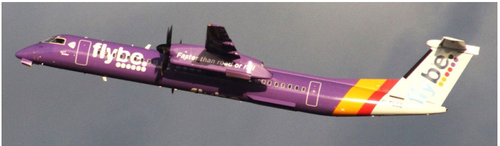
G-FLBE Dash8-Q400 FlyBe 21/12Rod Hudson

Flybe use Dash-8-400Q aircraft to operate flights from and to Belfast City .