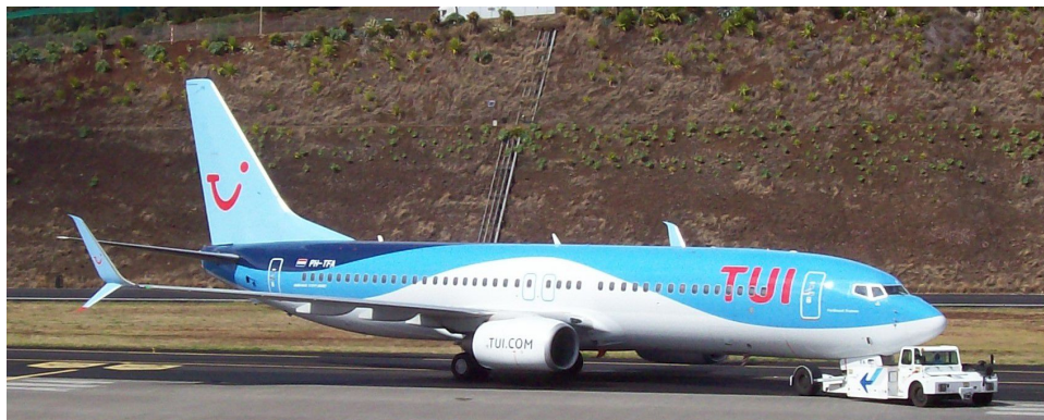
PH-TFA 737-8 TUI 27/10

CS-AIC PA-28, CS-DCH PA-28, CS-TRD DHC8 SATA, CS-TTF A.319 TAP D-ABCA A.321 Air Berlin, D-ABCF A.321 Air Berlin, D-AIAE A.321 Condor, D-AICK A.320 Condor, D-AICL A.320 Air Berlin F-GZHB 737-8 Transavia G-EZTC A.320 Easy-Jet OE-LBN A.320 Austrian Airlines OH-JTZ 737 Jet Time PH-TFA 737-8 TUI