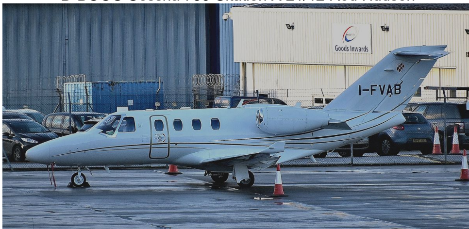
I-FVAB Cessna 525 CitationJet M2 21/12 Rod Hudson