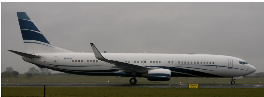
VP-CEC Boeing 737-9HW(ER) BBJ3 12/12