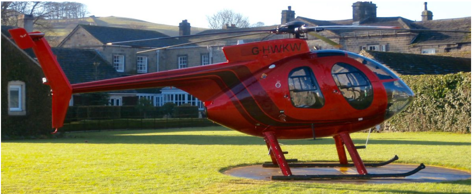
G-HWKW Hughes 369 Flitwick Helicopters