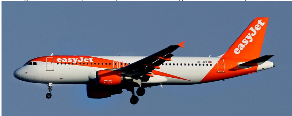
HB-JZR Airbus A320-214 Easyjet 26/12 Paul Whincup

Other flights:-17/12 G-EZIM(41QV/9019) arrived from Geneva, positioned out to Liverpool.