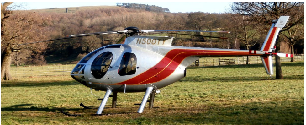
N500TY Hughes 369 Eastern Atlantic Helicopters Inc