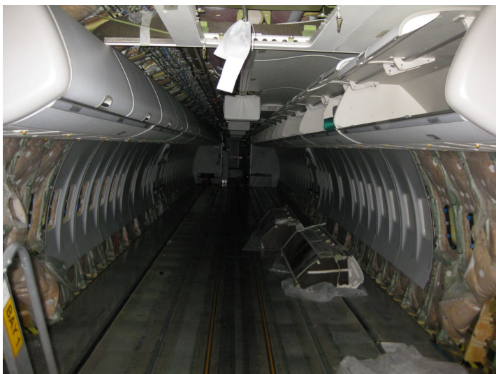
D-ABOJ Boeing 757-300