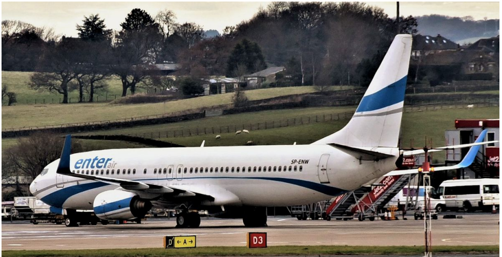
SP-ENW Boeing 737-86J EnterAir 01/12 Rod Hudson

Flybe use Dash-8-400Q aircraft to operate flights from and to Belfast City .