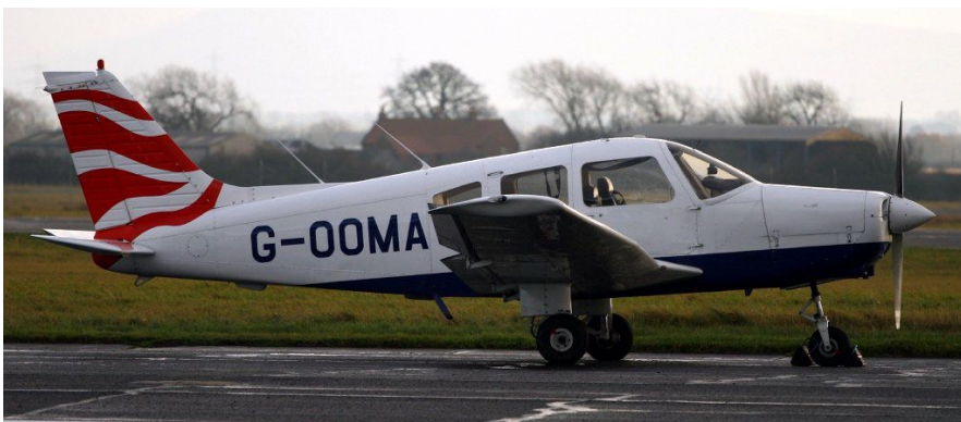
G-OOMA Piper PA-28 Warrior II 07/12