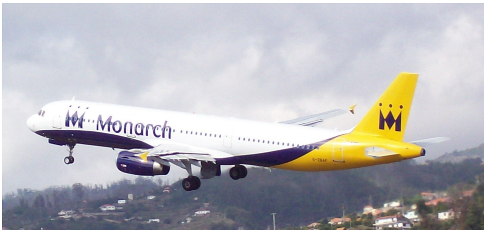
G-ZBAF A.321 Monarch Airlines 30/10

CS-DVQ JS32 Aero Vip,CS-TRD DHC8 SATA ,CS-TTN A.319 TAP, CS-TTV A.319 TAP G-BYAW 757 Thomson Airways ,G-EZTT A.320 Easy-Jet ,G-MIDT A.320 BA G-OZBF A.321 Monarch Airlines, G-TAWL 737-8 Thomson Airways, G-TAWR 737-8 Thomson Airways,G-TAWS 737-8 Thomson Airways G-ZBAS A.320 Monarch Airlines,OY-TCD A.321 Thomas Cook PH-HSF 737-8 Transavia