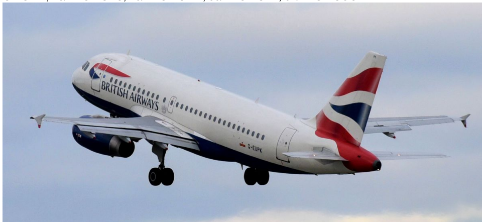
G-EUPK Airbus A319 British Airways 01/12

Heathrow (1346/1347, "20D/21V"):-1/12 G-EUPT, 2/12 G-EUPO, 3/12 G-EUPC, 4/12 G-EUPT, 5/12 G-EUPM, 6/12 G-EUOC, 7/12 G-EUPF, 8/12 G-EUOI, 9/12 G-EUPC, 10/12 G-EUPJ, 11/12 G-EUPH, 12/12 G-EUOB, 13/12 G-EUOC, 14/12 G-EUPX, 15/12 G-EUPA, 17/12 G-EUOG, 19/12 G-EUOH, 20/12 G-EUPD, 21/12 G-EUPZ, 22/12 G-EUOI, 23/12 G-EUPT, 24/12 G-EUPM, 26/12 G-EUPT, 27/12 G-EUPW, 28/12 G-EUPC, 29/12 G-EUPW, 30/12 G-EUPZ, 31/12 G-EUOC.