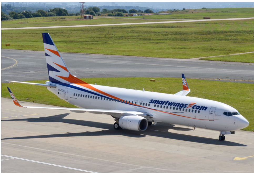
OK-TSH Boeing 737-800 Smartwings LBA 19 July 2016