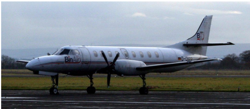
D-CKPP SA-227DC Metro 23 02/12