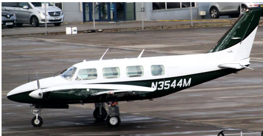
N3544M Piper PA31 NAVAJO 01/12 Rod Hudson

Eurocopter AS365 G-OLNT arr 10:10 and dep 14:21, Eurocopter AS365 G-MFLT arr 11:07 from Le Touquet (on delivery?) new resident, Cessna 560 XLS CS-DXZ dep 11:50 to Farnborough as NJE449B, Piper PA-31 Navajo N3544M arr 12:31 dep 15:00, Gulfstream 650 N102BG arr 12:36 from Manchester n/s. Phenom 300 CS-PHA arr 17:56 from Le Bourget as NJE653P n/s.