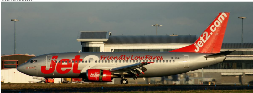
G-CELF Boeing 737-300 Jet2.com 30/12 Ian Gratton

Charter flights plus positioning flights will be detailed in this section:-1/12 G-JZHA(300T) test flight, G-JZHD(051H) test flight, 2/12 G-JZHO(PVT737) delivered from Boeing Field, G-GDFB(033E) positioned out to Belfast, 3/12 G-GDFT(063J/064J) positioned out to/in from East Midlands, G-LSAG(031E) positioned out to Manchester, G-JZHG(041A) positioned in from East Midlands, 8/12 G-CELK(031R) position out to Newcastle, G-JZHD(051B) test flight, 9/12 G-GDFX(031E) position out to East Midlands, 10/12 G-JZHD(051B) test flight, 11/12 G-CELP(035E) positioned in from Edinburgh, 12/12 G-CELK(033E) positioned in from Newcastle, G-JZHD(051B) test flight, 14/12 G-CELP(033E) positioned out, G-LSAE(061J) positioned in from Newcastle, G-GDFH(031E) positioned in from Newcastle, 15/12 G-LSAA(031E) positioned out to Manchester, G-JZHO(072W) positioned in from Manchester, 18/12 G-GDFY(632P) positioned out to La Rochelle, 18/12 G-GDFT(073W) positioned in from Manchester, 23/12 G-GDFG(034E) positioned out to Belfast, G-LSAD(032E) positioned in from Manchester, G-GDFL(033E) positioned out to East Midlands, 24/12 G-CELY(033E) positioned in from Edinburgh, 28/12 G-CELY(033E) positioned out to Edinburgh, 29/12 G-LSAD(300T) test flight to Newquay G-CELE(052K) positioned in from Norwich, 30/12 G-LSAH(061J) positioned in from Manchester.