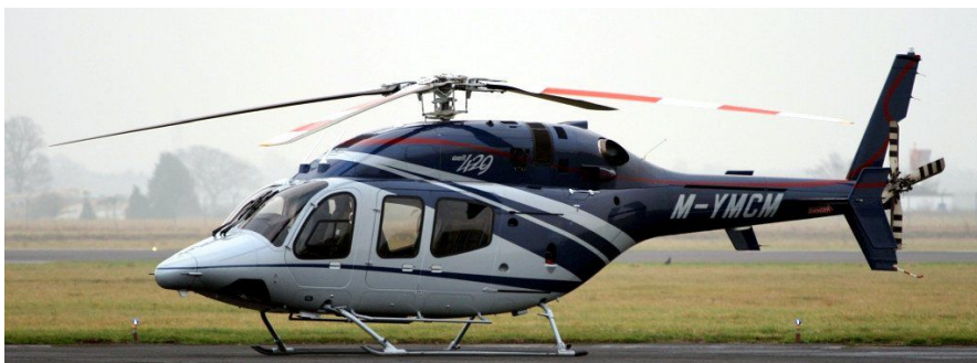
M-YMCM Bell 429 Global Ranger 20/12