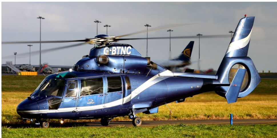
G-BTNC QAS.365ND Dauphin 2 04/12 Paul Whincup

Piper PA-23 Aztec G-BBHF f/t IOM (12:24/12:55).