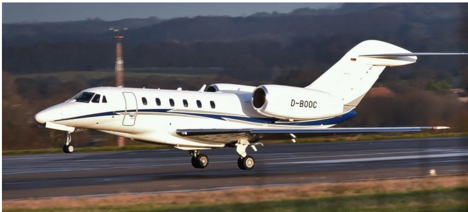
D-BOOC Cessna 750 Citation X 21/12 Rod Hudson

Phenom 300 CS-PHD dep 09:42 to Staverton as NJE901C, Very new Cessna 525 Citationjet M2 I-FVAB (csn 916) f/t Treviso (10:43/17:41), Cessna 750 X D-BOOC arr 15:03 from Rovaniemi n/s, Cessna 680 Sovereign PH-CTR arr 18:34 from Bordeaux n/s.