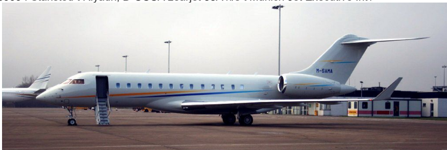
M-SAMA BD-700 Global 6000 12/12