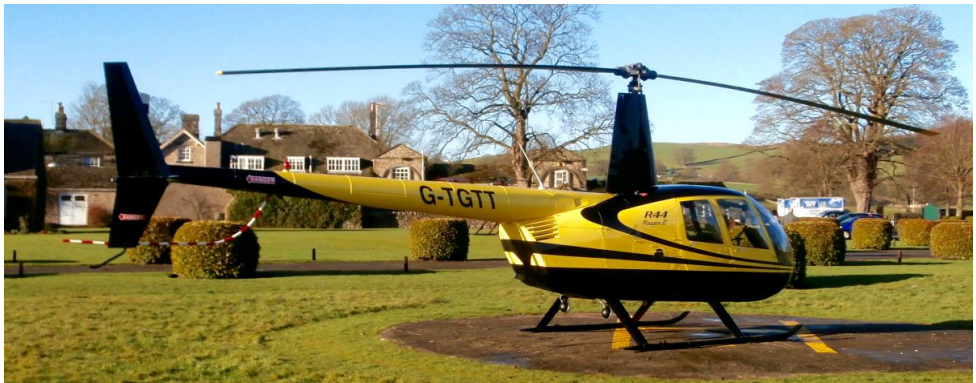
G-TGTT R.44 Smart People Ltd