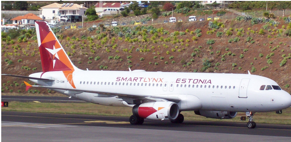
ES-SAM A.320 Smartlynx 30/10

CS-TNJ A.320 TAP,CS-TNP A.320 TAP/Staralliance,CS-TTI A.319 TAP D-ATUF 737-8 TUI ES-SAM A.320 Smartlynx F-GZHC 737-8 Transavia G-EZFK A.319 Easy-Jet , G-OZBX A.320 Monarch Airlines, G-ZBAF A.321 Monarch Airlines