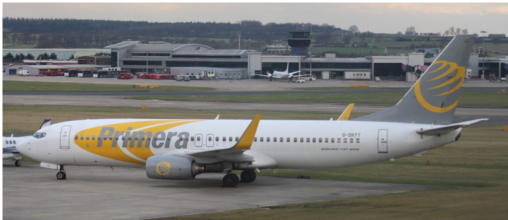
G-DRTT Boeing 737 Jet2.com Primera livery 13/12 Ian Gratton