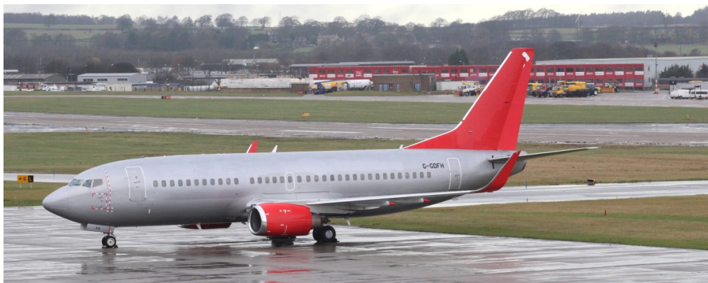
G-GDFH Boeing 737 "Final Call" 03/12 Mike Storey

31/12 G-POWN(899Y/991) positioned in from Stansted/operated out to Akureyri.