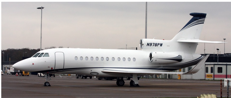
N978PW Falcon 900EX 02/12

02/12 N978PW Falcon 900EX arrived 26/11 t Morristown TAS Corp LLC, G-CCNG Mainair Flight Design CT2K f Private site n/s, G-JMBS Agusta A109S f/t Private site Castle Air