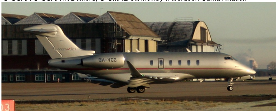
9H-VCO BD-100 Challenger 350 04/12

04/12 9H-VCO BD-100 Challenger 350 f Farnborough t Karlsruhe/Baden-Baden VistaJet, G-EZGE Airbus A319-111 f/t Liverpool EasyJet (Crew Training), G-GCVV Cirrus SR-22 f/t East Midlands, 2-COOK 2-COOK f Retford Gamston t Geneva William Cook Aviation, G-GUAR G-GUAR f/t Duxford, G-GMAE Stornoway t Aberdeen Gama Aviation