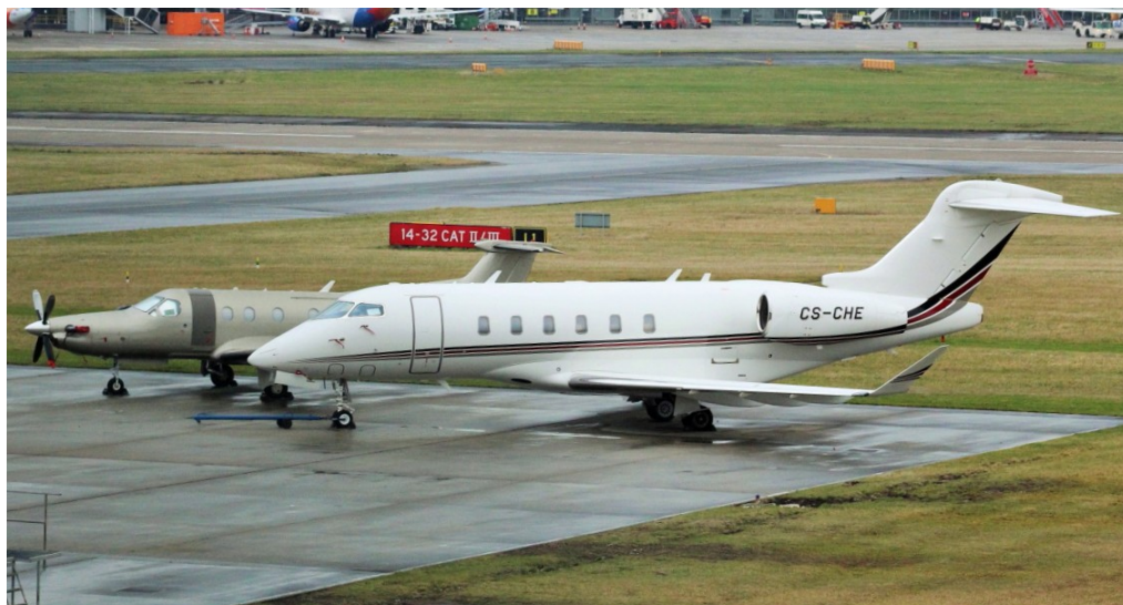
CS-CHE Challenger 350 & LX-JFV Pilatus PC-12 27/12

Beech 200 Kingair G-FLYW f/t Haverfordwest (10:50/11:38), Cessna 680 Latitude CS-LTA arr 18:10 fr Aberdeen as NJE986F n/s, Cessna 525A CJ2 D-ISJP dep 19:44 to EMA.