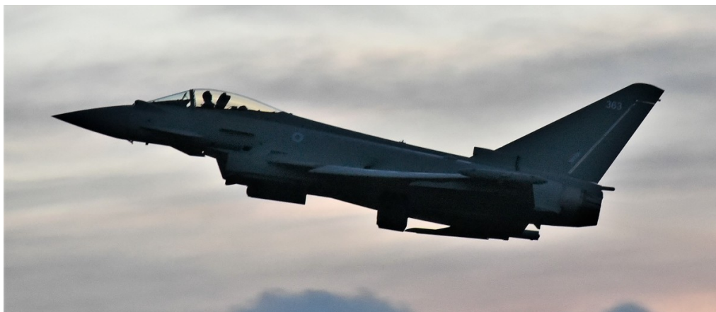
ZK363 Typhoon FGR4 12/12 Rod Hudson