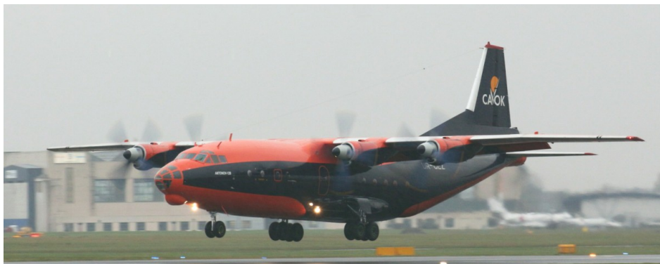
UR-CEZ Antonov AN-12B Cavok Airlines 05/12