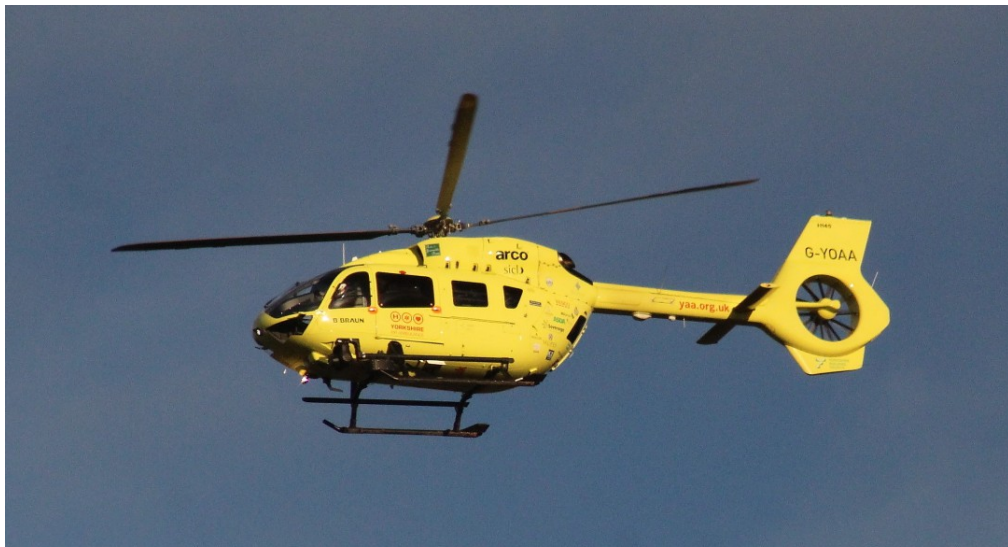
G-YOAA Airbus MBB-BK 117 D-2 20/12 Mike Storey

Phenom 100 9H-FAM arr 07:27 fr Amsterdam dep 10:05 to Oxford, Cessna 525A CJ2 9H-ALL dep 10:14 to Malaga, Challenger 350 CS-CHH arr 12:16 fr Ivalo (Finland) as NJE547N dep 13:50 to Cork as NJE061U, Airbus A400M Atlas ZM417 4*ILS approaches starting at 12:24 c/s Ascot470, Piper Pa-28 181 Warrior G-BSHP arr 13:42 fr Teesside dep 15:30 to Newcastle, Cessna 510 Mustang OE-FHA arr 17:35 fr Le Bourget n/s. Legacy 500 G-HARG arr 18:19 fr Nice dep 18:53 to Bristol.