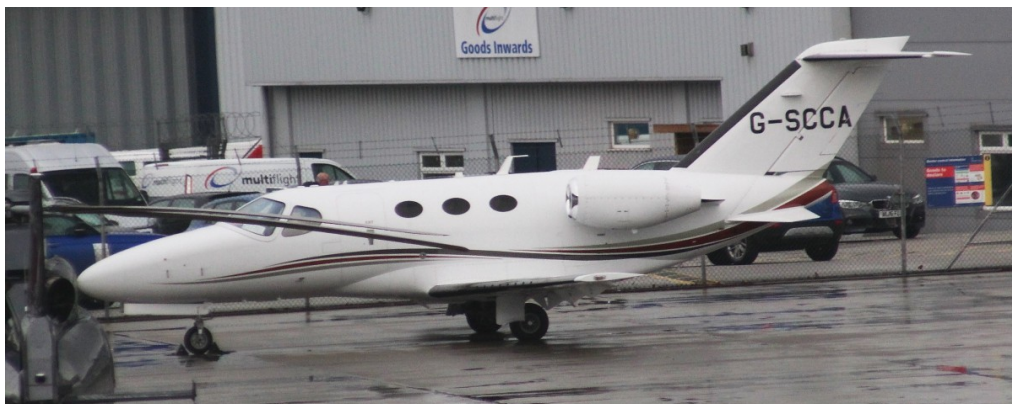
G-SCCA Cessna 510 Mustang 03/12 Mike Storey

Cessna 510 Mustang G-SCCA arr 10:37 fr Jersey as Gama478 ret at 13:22. Cessna 510 Mustang G-XAVB arr 12:16 fr Jersey as Gama176 n/s, Piper PA-28 161 Dakota G-BZLH arr 14:02 until ? Piper PA-28 140 Cherokee G-RVRT arr 14:14 fr Full Sutton dep 15:08, ret at 15:22 and dep immediately to Full Sutton, Cessna 550 Bravo G-SPRE arr 18:07 fr Eindhoven,