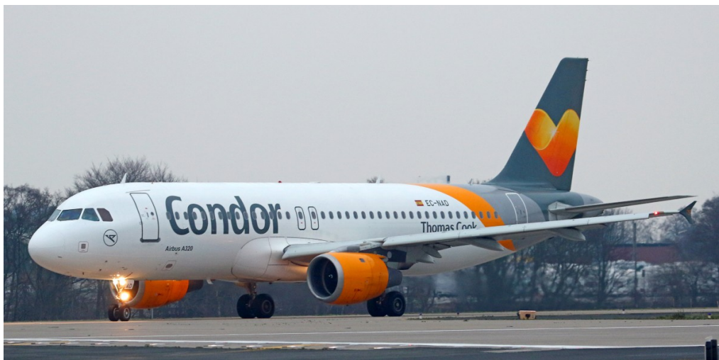
EC-NAD Airbus A320 Thomas Cook Balearics 15/12 Paul Whincup

3/12 EC-MVF(132F/1302) positioned in from Gatwick/operated out to Ivalo, 6/12 EC-MVF(87VS/130) operated in from Ivalo/positioned out to Aberdeen, 14/12 EC-NAD(4890) positioned in from Newcastle, 15/12 EC-NAD(1302) operated out to Ivalo, 18/12 EC-MTJ(87VS/130) operated in from Ivalo/positioned out to Manchester, 19/12 EC-MTJ(132F/1302) positioned in from Edinburgh/operated out to Ivalo, 22/12 EC-MVG(87VS/130) operated in from Ivalo/positioned out to Birmingham.