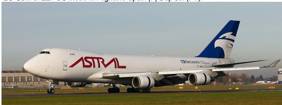
TF-AMU Boeing 747-400 Air Atlanta Astral Aviation Livery 04/12