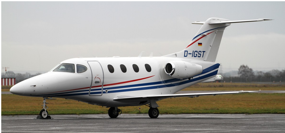
D-IGST Raytheon 390 Premier IA 21/12