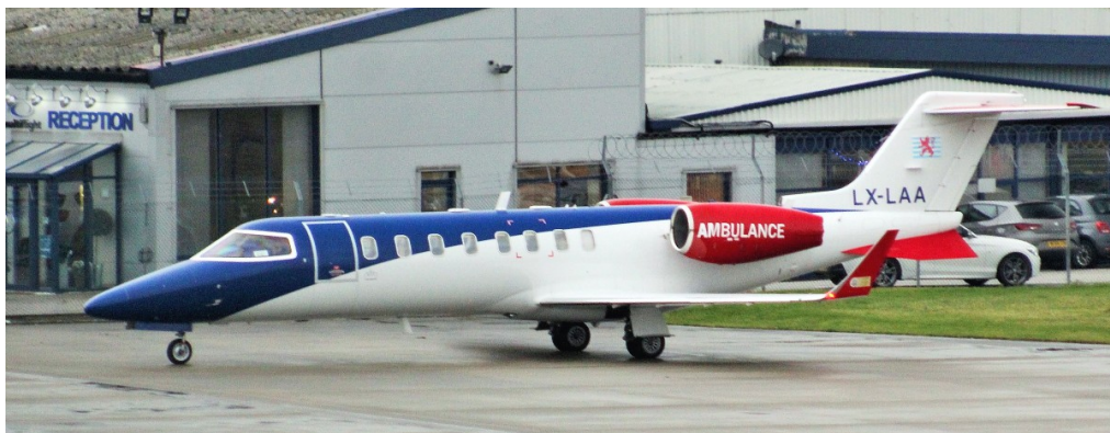
LX-LAA Learjet 45 06/12

Learjet 45 LX-LAA dep 14:10 to Luxembourg, Cessna 560XLS CS-DQB arr 14:29 fr Dublin as NJE940Q n/s, Agusta A109E G-WOFM arr 18:32 fr Battersea dep 18:54.