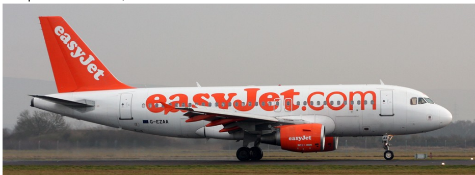
G-EZAA Airbus A319-111 19/12