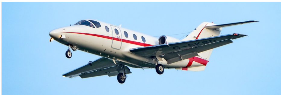
G-SKBD Raytheon Nextant 400XTi