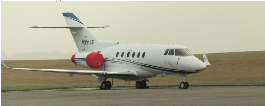
N321JF Hawker 850XP 02/12 Mike Storey

Phenom 300 2-EMBR arr 08:48 n/stop, Hawker 850XP N321JF arr 12:46 until 6 th , Aerospatiale AS365 G-OAHL arr 13:40 dep 14:03, Diamond Da-62 G-JAAM dep 17:45, Pilatus PC XII F-HJFP arr 18:54 n/stop