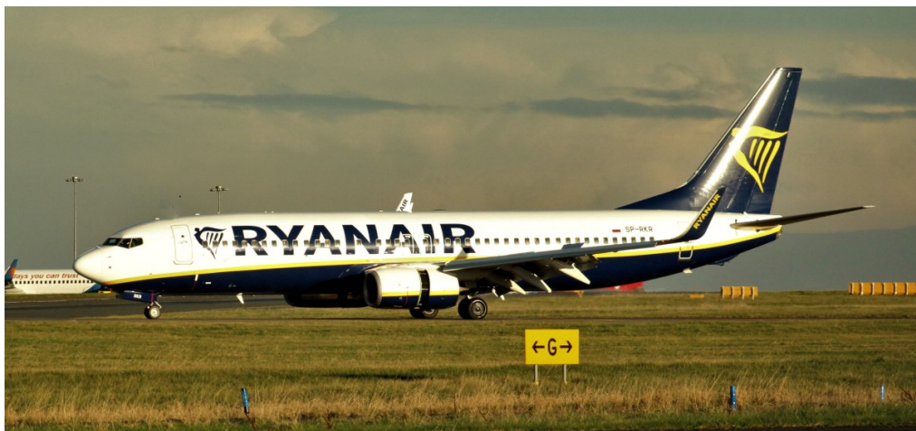
SP-RKR Boeing 737-800 Ryanair 09/12 Mike Storey

Other flights :-7/12 EI-DLD(80P/9079) positioned in from Birmingham then operated out to Alicante, 10/12 EI-DHH(62SY/1) operated in from Alicante, then positioned out to Alicante, 14/12 EI-EMB(6455/157) operated in from Malaga, departed to Dublin, 18/12 EI-EMB(80P/5292) positioned in from Liverpool/depanded to Dublin, 27/12 SP-RSC(30/3286) positioned in from Newcastle then operated out to Gdansk.