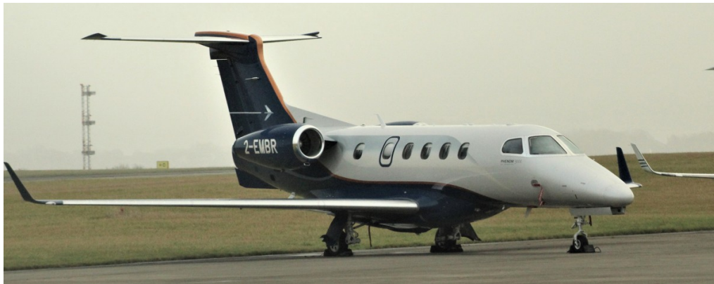
2-EMBR Phenom 300 02/12 Mike Storey

Pilatus PC XII F-HJFP dep 07:52, Cirrus SR22 G-ISLR arr 11:26 dep 13:48, Phenom 300 2-EMBR dep 16:53, Gulfstream G280 N221GA arr 19:15 until 5 th ,