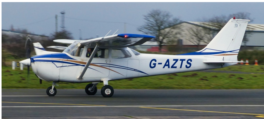
G-AZTS Cessna F172L 10/12