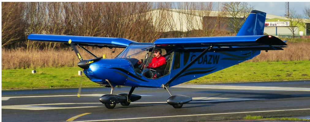
G-DAZW Zenair Cruiser 03/12