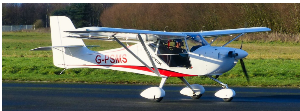
G-PSMS Aeropro Eurofox 03/12