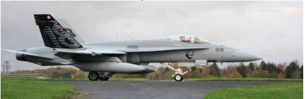
F/A-18C J-5018 (Panthers-18 Sqd) Swiss Air Force taxi-ing for take-off past Crash Gate 8.