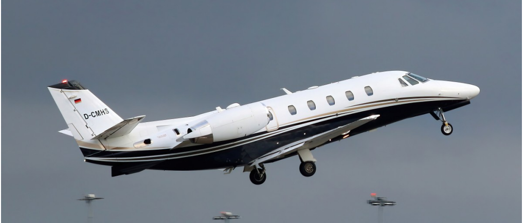
D-CMHS Cessna 560XL Citation XLS+ 04/12 Paul Whincup

Cessna 560XL Citation XLS+ D-CMHS arr 09:39 dep 11:38, Cessna 525 CJ1 G-POYA arr 13:09 dep 13:37, Cessna 525B CJ3 D-CHAT arr 14:59 until 7 th , Cessna 560 Excel CS-DXP dep 16:59, Cessna 680 Sovereign OK-OSK ( csn 680-150) arr 17:49 n/stop,