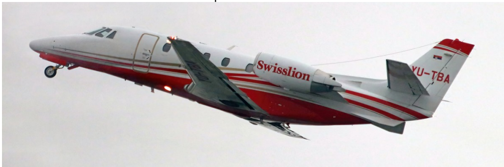
YU-TBA Cessna 560 Excel 10/12 Paul Whincup

Cessna 560 Excel YU-TBA arr 08:15 dep 08:54