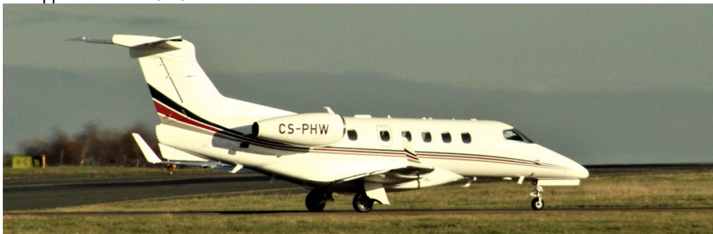
Phenom 300 CS-PHW 09/12 Mike Storey

Phenom 300 D-CBBS dep 10:03, Global 6000 9H-VJU dep 10:13, Phenom 300 CS-PHW arr 12:39 dep 14:15, Pilatus PC-24 D-CMHS arr 15:07 dep 16:13, Airbus A400M Atlas ZM407 3 x ILS approaches at 15:28.