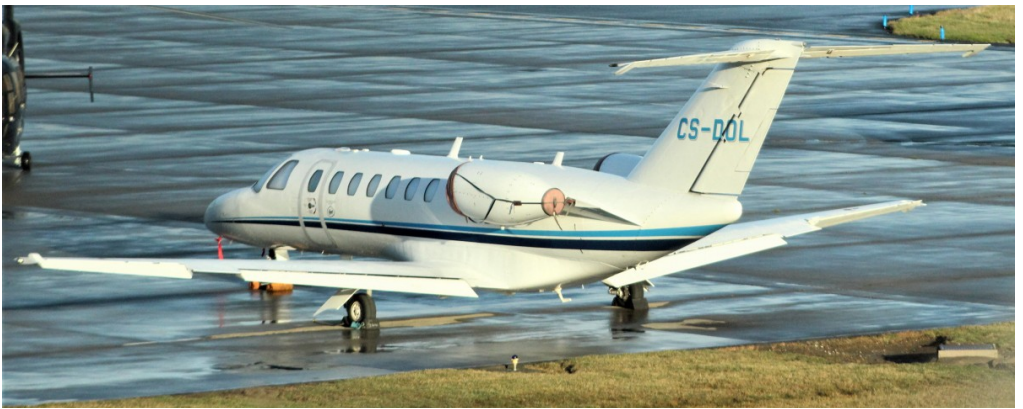
CS-DOL Cessna 525B CJ3 20/12