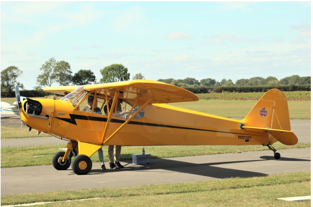
N92107 Piper Cub-JC3C-65 Mike Storey