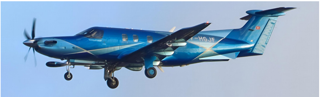
F-HGJF Pilatus PC XII 29/12 Paul Whincup

Phenom 300 D-CAGA dep 09:15, Cessna 560 Excel OK-CAA dep 10:09, Gulfstream G450 N7RX 10:51, Pilatus PC XII F-HGJF arr 10:56 dep 12:01, PA-46-600 Malibu LN-ECM dep 11:27