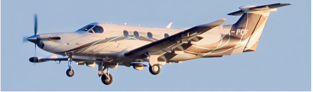
OK-PCF Pilatus PC XII 26/12 Paul Whincup

Pilatus PC XII PH-SFH (csn 2112) arr 09:35 dep 11:34, Cessna 525 CJ1 G-KION arr 09:44 dep 10:47, Pilatus PC XII OK-PCF arr 09:53 dep 11:58, Cessna 560 Excel D-CDCM arr 16:47 dep 17:33, phenom 300 D-CSCE arr 16:59 n/stop, EMB-550 Legacy 500 G-HARG arr 18:44n/stop.