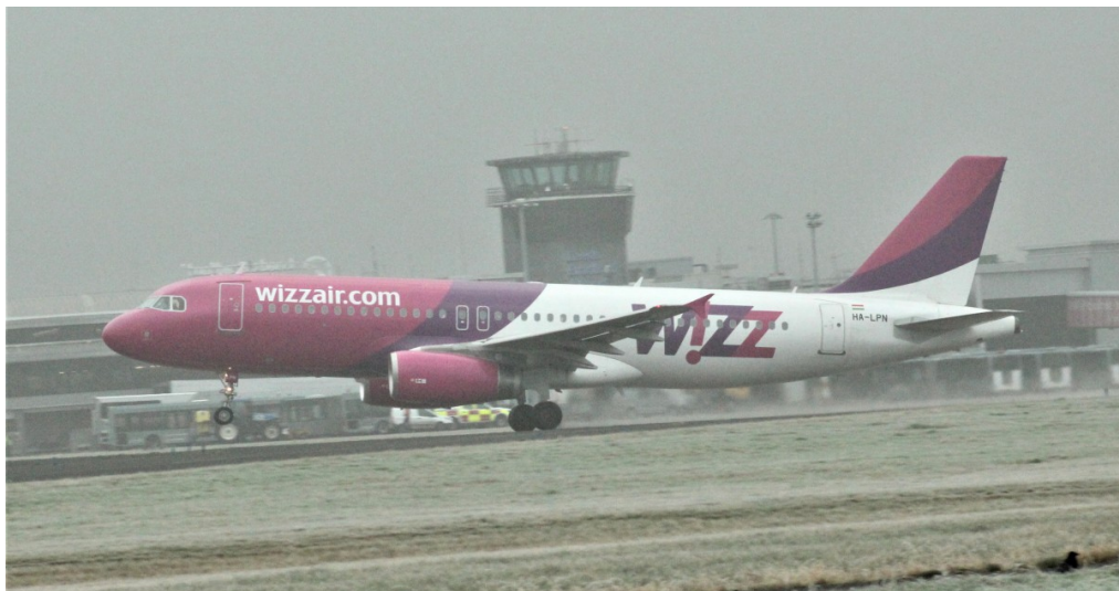
HA-LPN Airbus A310 Wizz Air 12/12 Mike Storey

Wroclaw (1815/1816, "4676/9737", Sun/Wed):-2/12 HA-LXG, 5/12 HA-LXM, 9/12 HA-LXG, 12/12 HA-LTC, 16/12 HA-LXG, 19/12 HA-LTC, 23/12 HA-LXP, 26/12 HA-LTC, 30/12 HA-LTB.