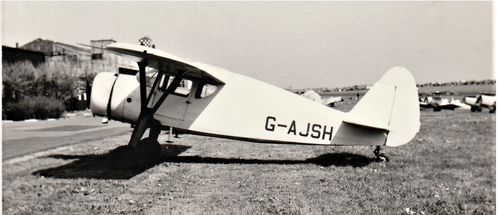
G-AJSH F.24W-41 Argus II. The Argus was a four seater built by the US company Fairchild and used during W.W. II by the RAF and the Air Transport Auxiliary. The photo is undated. First registered in 1947, it is seen here at Yeadon during what looks like an air show. Looking at the a/c history would suggest maybe 1956. The a/c was written off in March 1958 at Fair Oaks.