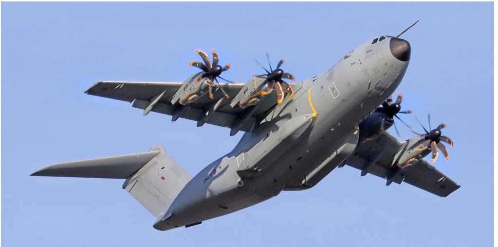
ZM409 Airbus A400M Atlas 20/12 Paul Whincup