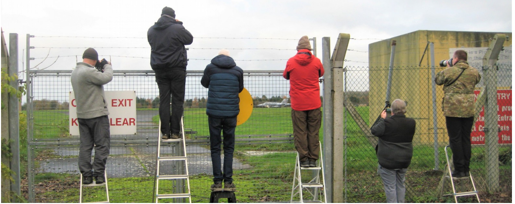
Anorak, long-lens, radar app, scanner and a ladder ..... whatever next for the determined "wild spotter"?

A grey cold day at Leeming to watch the Swiss Air Force on deployment to practice their low-level mission skills. Worth the wait to experience the noise and power of these aircraft at launch. On the day the F/A-18Cs seen were: J-5001, 5003, 5005, 5012, 5013, 5016, 5018. Also seen was T751 Challenger Swiss Air Force plus some light entertainment from the University Air Squadron Grobs doing training circuits. The Leeming based Hunter "XE688" also performed. The coffee and crumpets at a local café were an unexpected delight.