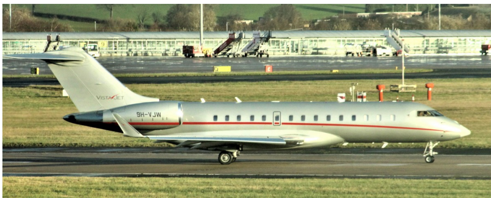
9H-VJW Global 6000 20/12 Mike Storey

Pilatus PC XII F-HPIL dep 08:14, Global 6000 9H-VJW arr 08:54 dep 10:16, PA-32R Lance N101DW dep 09:25, Learjet 35A D-CITY dep 10:03, Cessna 525B CJ3 CS-DOL dep 11:31, Airbus A400M Atlas ZM409 2 x ILS approaches at 12:15, Global Express C-GLXM dep 13:03, Phenom 300 D-CTOR dep 14:50, Cessna 525A CJ2 D-ILWP arr 14:59 dep 16:40, Global 6000 OK-GRX arr 22:14 n/stop