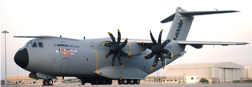
First the A.400M made its maiden flight at the EADS plant at Sevilla on 11/12

Following long delays two aircraft took to the skies for the first time in December 2009