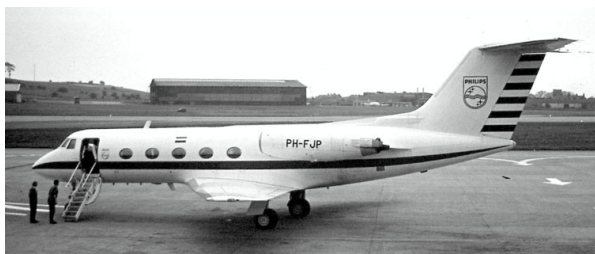
PH-FJP Grumman Gulfstream 2 c/n 78, operated by Philips Electrical and parked stand 4, new apron.