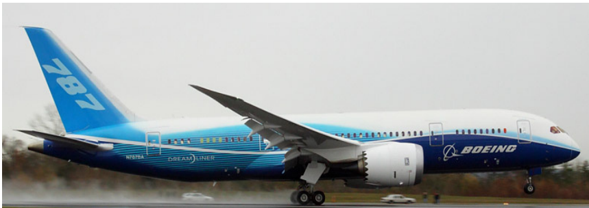
Then, on 15/12 the Boeing 787 Dreamliner was airbourne from Paine Field (Boeing)