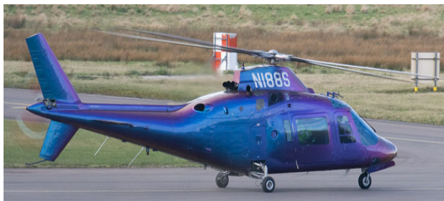
N188S Agusta A.109A JBj Aviation