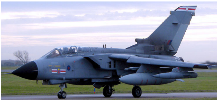
41 Squadron Tornado GR.4 taxiing at Coninsby(Mike Storey)

We spent a very pleasant 45 minutes watching the all black Dominies, Super Kingairs and Grob Tutors doing their circuits. We were treated to some close formation flying from the Tutors in groups of two's and three's. The big surprise here was an all black Jaguar taxiing out towards the main runway from the south side hangar. We both thought, this will be a treat watching this taking off right in front of us. But to no avail, it kept up its slow taxi all the way round the airfield and back to the hangars. It appears that there are approx 5-Jaguars on site which are used for engineering training only and can be viewed from further down the road, including the Raspberry ripple ones from Qinetiq.