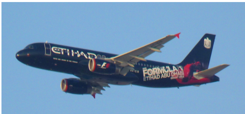
A6-EIB Airbus A.320-211 ETIHAD Flyapst at Abu Dhabi Formula 1 Grand Prix Photo by James Martin, 01/11/09