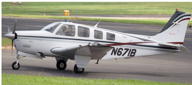
N671B Beech A.36 N671B Inc Trustee