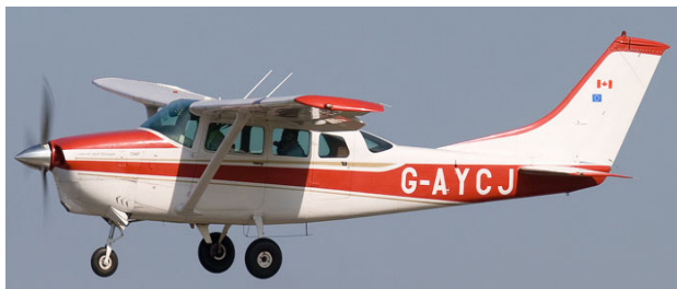
G-AYCJ Cessna TP-206D White Knuckle Airways