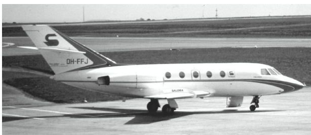
OH-FFJ Dassault Falcon 20D c/n 224, operated by Solora, parked on stand 6 on the new apron.