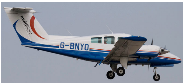
G-BNYO Be,76 Duchess Multiflight Ltd