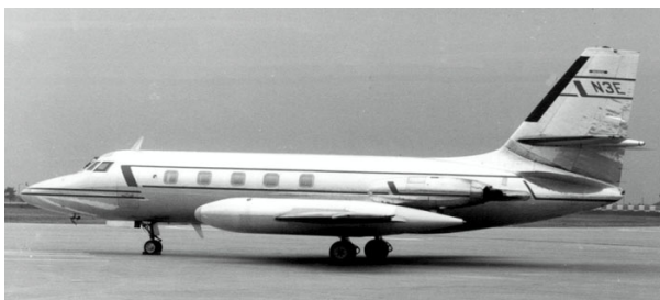
N3E Lockheed L.1329 Jetstar c/n 5029, operated by Cameron Iron Works and parked on Stand 2.