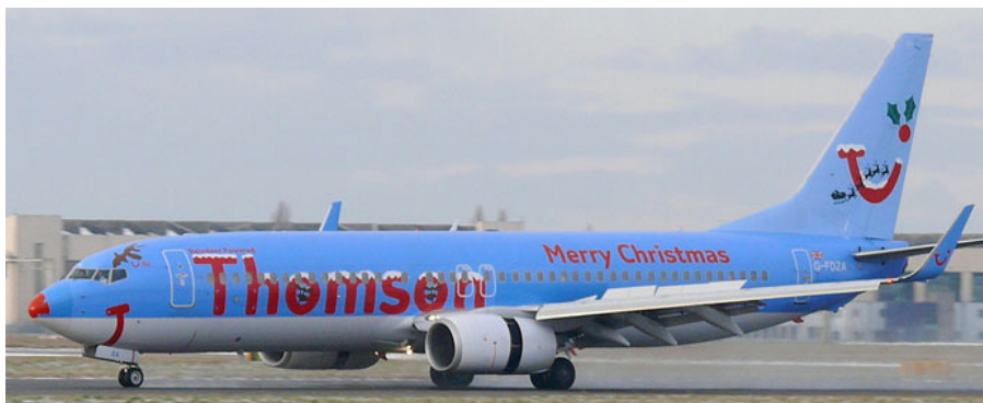
G-FDZA Boeing 737/800 of Thomson in a festive scheme pictured at Doncaster