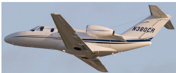
N380CR C.525 Citationjet 50 North Aviation