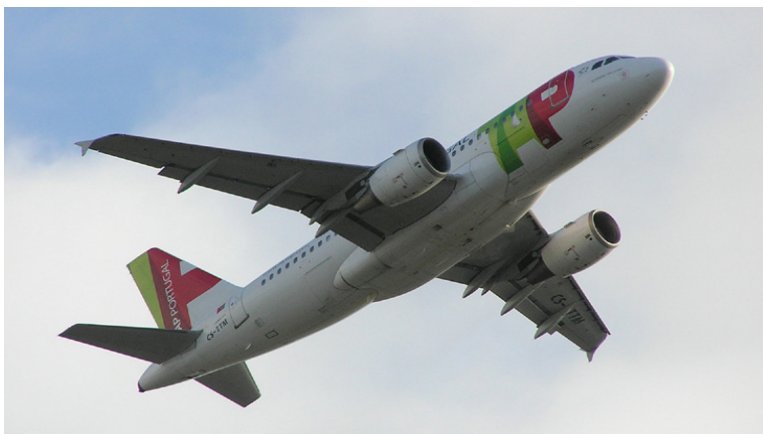
CS-TTM Airbus A.319-111 TAP Air Portugal London/Heathrow 04/11/09