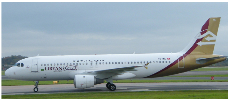
TS-INE Airbus A.320-211 Nouvelair/Lybian Airlines Manchester International 05/11/09