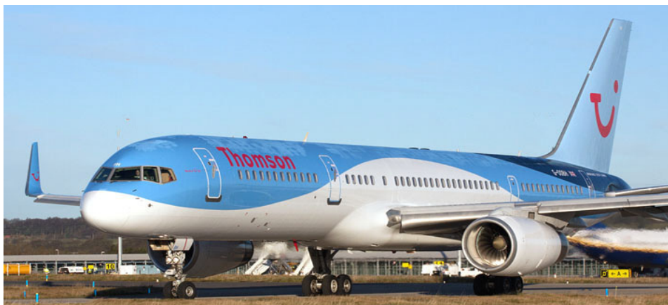
Thomson 757 G-OOBH, which arrived on 30/11, was the first visit by an aircraft in the company's new "Dreamliner" colour scheme

Positioning flights/Extra flights:- 1/11 EI-EPE(024P) from Stansted, 9/11 EI-EKO(23P) to Paphos, 25/11 EI-DYO(13P) from Cork, .