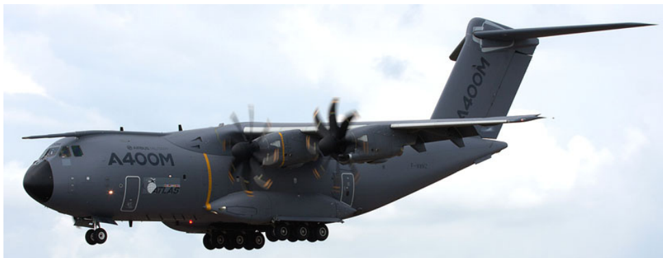
The Airbus A.400M demonstrator F-WWMZ paid a visit to Cranwell on 22/11 while on a training sortie from its base at Toulouse.

WICKENBY:- Wickenby Wings and Wheels 2013 takes place on Father's Day weekend, 15th & 16th June. There will be visiting aircraft from around the UK, a large collection of vintage cars and motorcycles, plus children's entertainments, 4x4 off-roading and great food available all day. You can book advanced tickets to this event online now (inc postage charge) - Adults £10 and Children £5 (ages 8-15).