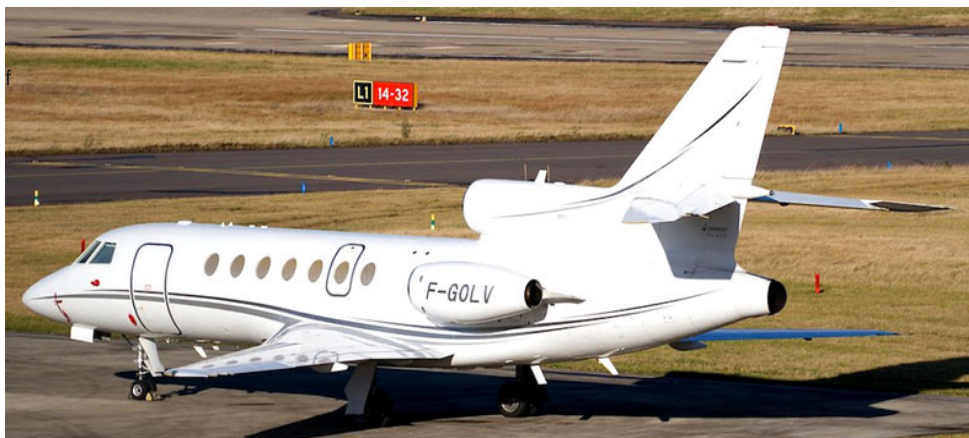
Falcon 50 F-GOLV arrived from Lagos, Nigeria on an Ambulance Flight, 8/11(David Blaker)