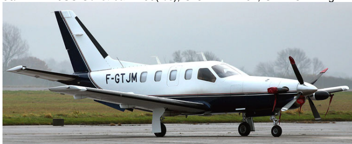
TBM 700 F-GTJM operated by Ouest Participations SARL and based at Le Bourget, visited Teesside on 17/11