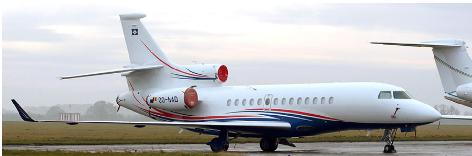
Falcon 7X OO-NAD operated by Flying Group parked on the apron at Teesside, 15/11,

TFM of Euro-Atlantic operated a MOD charter on 1/11 while the following day Air Caraibes A.330 F-ORLY departed, having arrived last month. Arkefly Boeing 767s PH-AHQ and PH-OYE were utilised on 14/11 and 27/11 respectively. On 3/11 Embraer 135 G-RJXK(Kittiwake 8013) arrived from Biggin Hill, transporting Middlesbrough FC following their victory at Charlton. The aircraft later positioned home to LBIA.