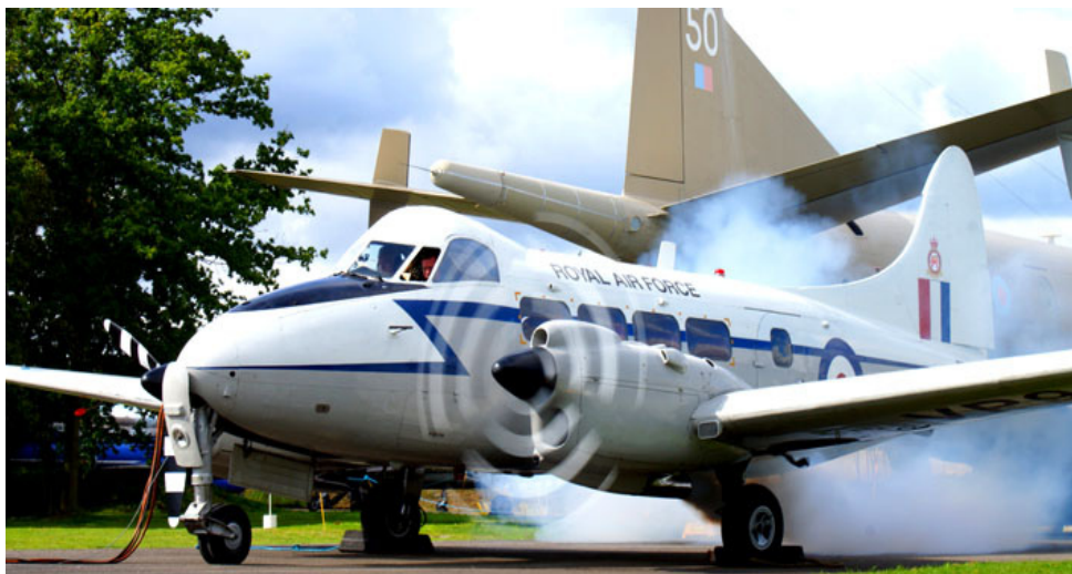
The latest addition to the Yorkshire Air Museum at Elvington is DH.104 Devon C2 VP967 which is seen above recently, carrying out a rather smokey engine start up. The aircraft, which carried the civil registration G-KOOL had until recently been on display outside the "terminal" at Redhill Air-