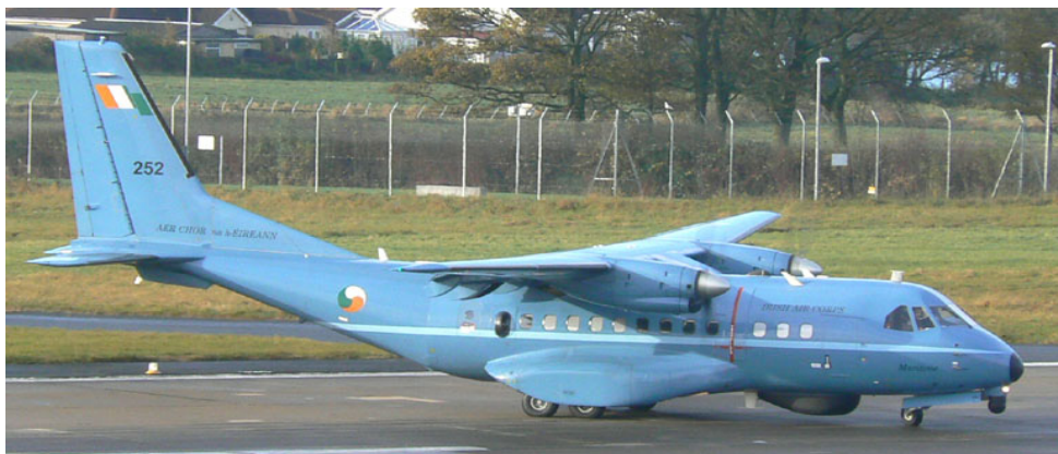
Arriving from Casement, Eire to pick up a patient was Irish Air Corps CASA 235 "252". The same aircraft had operated the inbound Ambulance Flight last month.