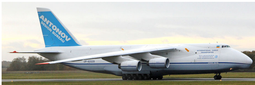
Antonov AN-124 UR-82029 taxiing to the arpon at Doncaster on 6/11

DARLINGTON:- R.22B G-BRXV was noted at a private site here on 16/11, later departing to Peterborough.