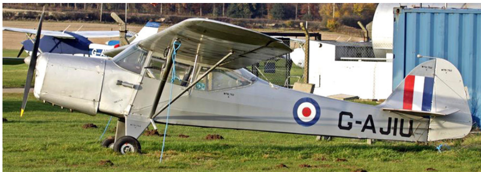
Pictured on a recent visit to Netherthorpe, resident Auster J/1N G-AJIU(Alan/dsaf)

15 & 16 June - Cockpit-Fest 2013 & Aeroboot aviation and avionics sale; this regular two day event provides the perfect opportunity for the public to view a diverse range of visiting aircraft cockpits. {Normal admission rates apply}