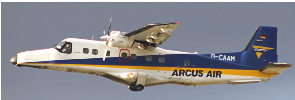
Dornier 228 D-CAAM of Arcus Air departing Doncaster on 8/11(Clive Featherstone)

Apart from the aircraft mentioned above which arrived for maintenance, the following are currently in store/for sale with the Doncaster Citation Centre(formerly Kinch Aviation):- N80364 Citation 1; G-JETA Citation 2; M-VUEZ(ex G-VUEZ) Citation Bravo; N306EC(ex G-CITJ) Citationjet; F-GUFP King Air 200; G-TFLK Citation Sovereign; HB-VWW Citationjet; N411VR Citationjet. The Citation Demonstrator aircraft which were here would appear to have moved to Cambridge and will just appear when requiring maintenance.