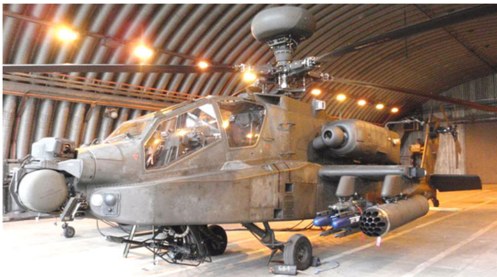
The awesome Apache AH1 ZJ193 tucked up in HAS 18, on detachment from RAF Wattisham