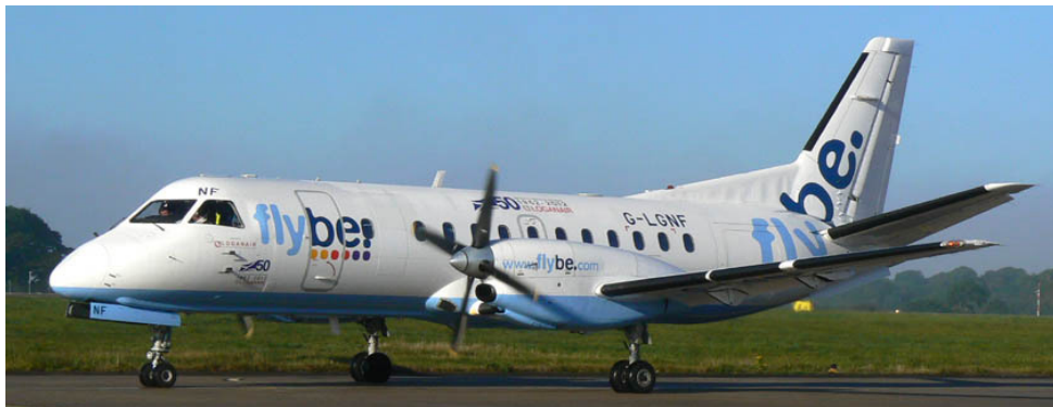
Logenair SAAB 340 G-LGNF taxiing onto stand following its arrival from Glasgow

Glasgow (6984/6985, "54CM/69MN") – 1/11 D-CIRD, 2/11 D-CIRD, 4/11 G-LGNC, 5/11 D-CIRD, 6/11 D-CIRD, 7/11 D-CIRD, 8/11 D-CIRD, 9/11 D-CIRD, 11/11 G-LGNB, 12/11 D-CIRD, 13/11 G-LGNC, 14/11 D-CIRD, 15/11 D-CIRD, 16/11 D-CIRD, 18/11 G-LGNB, 19/11 G-LGNE, 20/11 G-JEDR, 21/11 G-JEDR, 22/11 G-JEDR, 23/11 G-EOA, 25/11 G-LGNC, 26/11 G-ECOD, 27/11 G-ECOD, 28/11 G-FLBA, 29/11 G-FLBD, 30/11 G-ECOD.