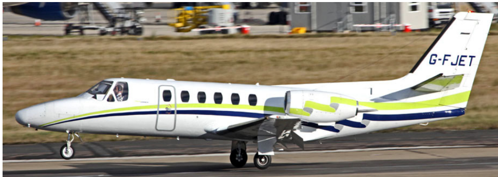
Citation 2 G-FJET of London Executive Aviation departing runway 32, 28/11