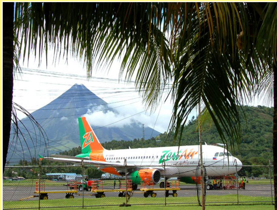
RP-C8990 Airbus A.319 of Zest Airways at Legazi, Philippines, 22/04/12