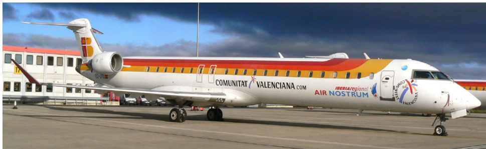
CRJ 900 EC-JTU parked nose out on Stand 17. This aircraft carried additional titling.

Due to fog at Manchester on 30/11 the company operated two of their AT-72 aircraft through LBIA:- EI-REO(3608/3609, "3608/60MA") f/t Shannon EI-REP(3728/3729, "728M/3729") f/t Cork