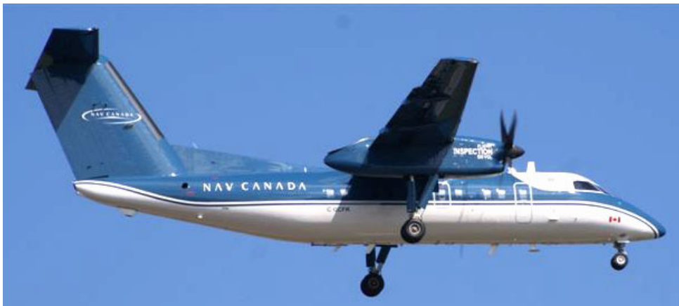
DHC-8-300 C-GCFK calibrating the ILS, Runway 15L at Toronto/Pearson, 29/9/12