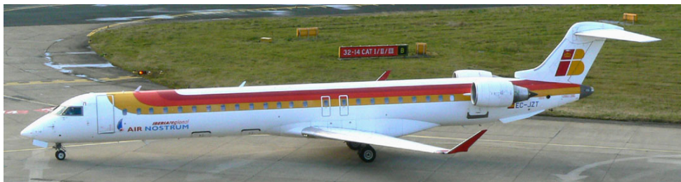
CRJ 900 EC-JZT taxiing onto the apron on 28/11 following its arrival on a charter flight from Lille

EC-JTU(2222/2221) from Le Bourget to Lille, aircraft night stopped parked nose-out on Stand 17