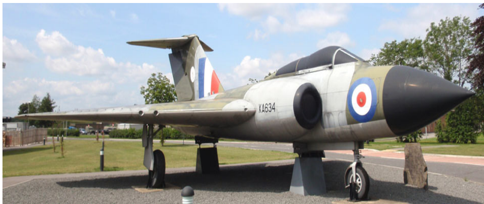
Gate Guardian, Javelin FAW4 XA634