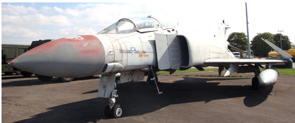
Phantom FGR2 XV499 still languishing in open storage and looking in rather a poor state