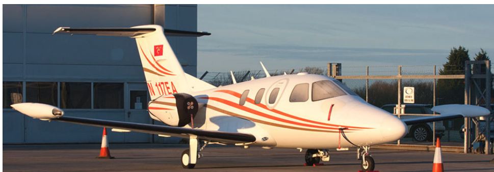
Based in the Isle of Man Eclipse Jet N117EA is pictured parked on the Multiflight/East Apron on a cold frosty morning, 30/11(Robert Burke)