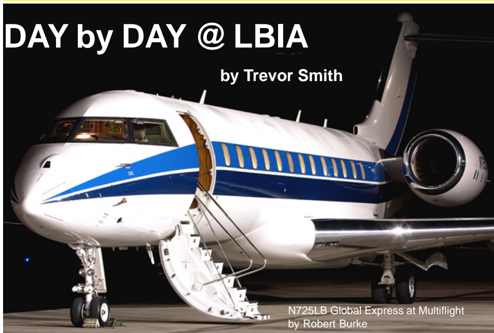
N725LB Global Express at Multiflight

Another new addition to the magazine this month, this section will contain all the daily happenings at LBIA, concentrating on Executive Jets and General Aviation movements. Again if you want any extra information not contained in this section do not hesitate in contacting the editor and I will do my best to furnish the answer.