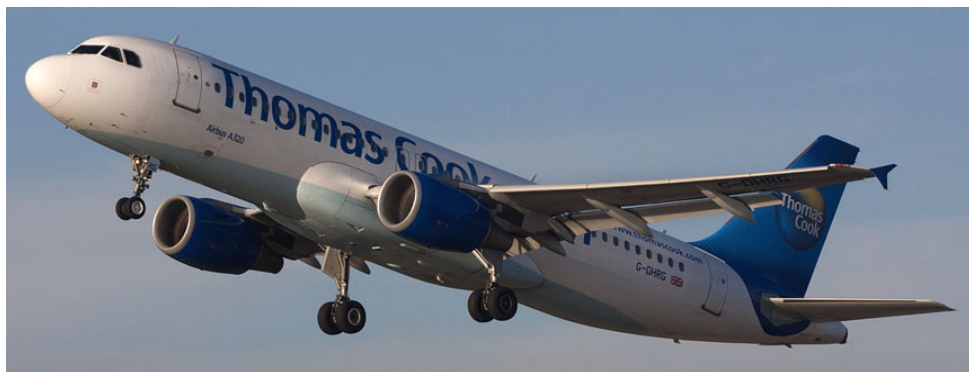
Thomas Cook closed their base at LBIA at the end of November. G-DHRG Airbus A.320

Reasons for the contraventions included snow and the late arrival of the incoming flight. A report to the panel said: "Members need to be aware that LBIA has some of the most stringent night-time noise restrictions of all major UK airports and are currently the only airport not permitted to allow aircraft to depart during the night-time hours that have a noise quota count greater than 0.5. "The majority of the main airports in the UK allow noise quota count of 4.0 during the night-time period." Members heard that the airport had continued to work hard with the airline to minimise night-time breaches. The report said: "As members are aware, the outcome of these previous discussions are that the number of PIA flights from LBIA has been reduced, and the time that they depart from LBIA has been moved forward by two hours. "The result of these ongoing discussions and the changes made is that the numbers of breaches that have occurred have been reduced over time although the performance over the past 12 months is a retrograde step." Councilors agreed to support the approach of continued dialogue rather than formal action at this stage