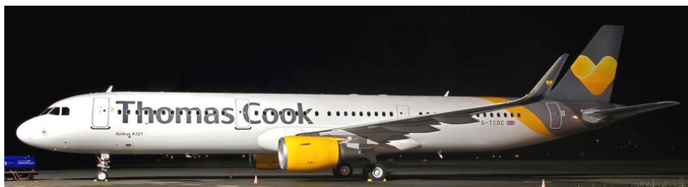
Newly delivered A.321 G-TCDC, the first aircraft in the full new Thomas Cook livery