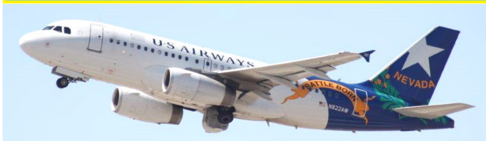
N822AW Airbus A.319, US Airways, Pheonix Sky Harbour, 05/13(David Senior)