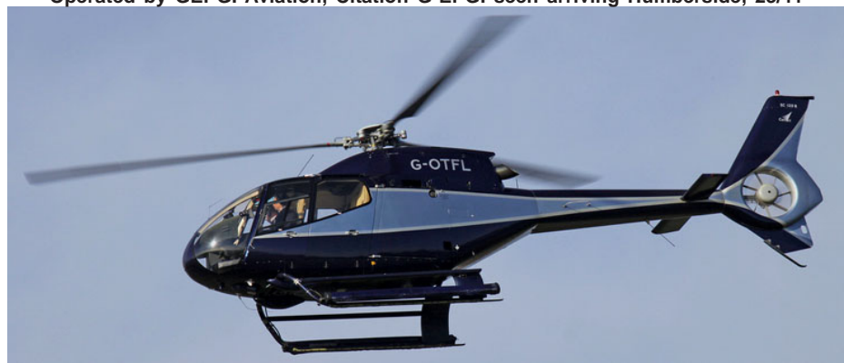
Cobham based EC.120B G-OTFL called for a refuel at Humberside, 8/11