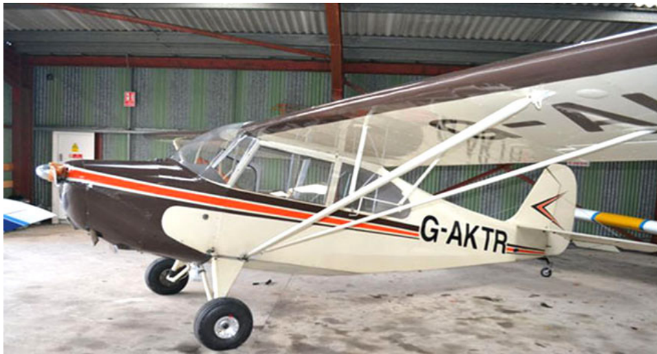
1946 vintage Champion G-AKTR, new resident at Brighton, more next month

No changes here with F-GDQL SE.313B (1250), G-LOYD SA.341G and G-MOTW OTW-145 all present inside, whilst HA-PPC SE.3130 (1500) has been parked up outside throughout and has not flown.