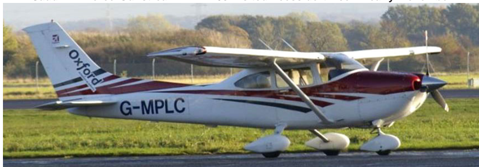
One of the quartet of Cessna 182Ts, G-MPLC, which were based at Teesside early Nov.