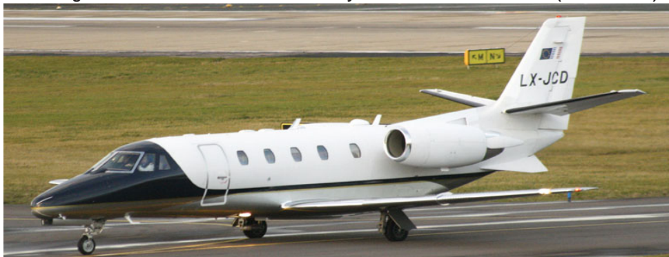
First timer, Citation XL LX-JCD made the short hop from Manchester, 21/11