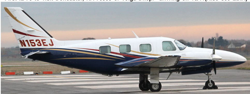
Another type first visit, PA-31P Mojave N153EJ parked on the Doncaster apron, 25/11