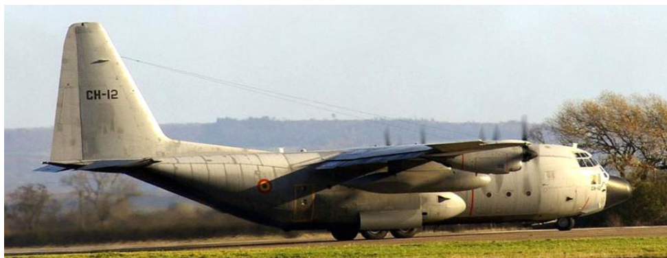
Belgian Air Force Hercules CH-12 made two visits to Teesside on 14/11