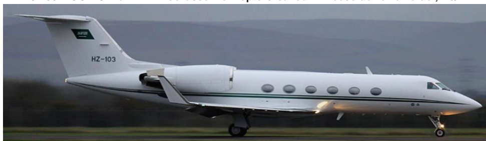
Saudi Air Force Gulfstream 4 HZ-103 visited Teesside twice in early November