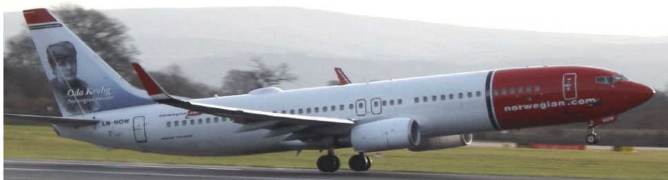
LN-NOW Boeing 737/800, Norwegian, Manchester, 09/12/13