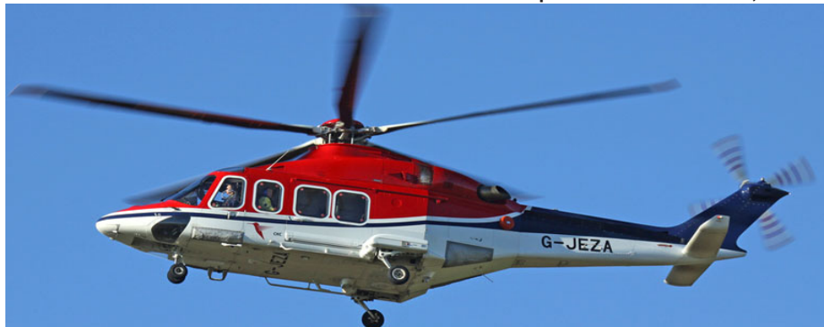
A new resident at Humberside is CHC Scotia AW.139 G-JEZA.