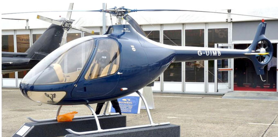
Cabri G-UIMB, which was demonstrated to Multiflight on 1/11, pictured at Helitech 2013.