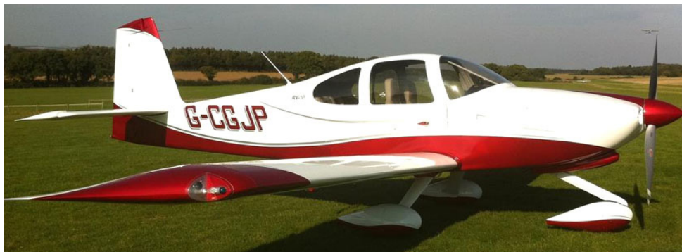
Vans RV-10 G-CGJP, which was noted departing Bagby for Aberdeen on 10/11

BOSTON / WYBERTON:- From the Residents delete G-MWIB Mistral 532GB sold to a new owner in Belfast recently. Following a short time here G-CBVY Ikarus C42 FB UK has moved to Anwick.