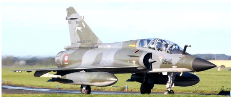
369/125-AG Mirage 2000N EC0200/4 French Air Force