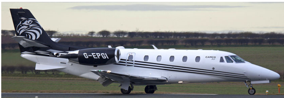
Operated by GEPI Aviation, Citation G-EPGI seen arriving Humberside, 23/11