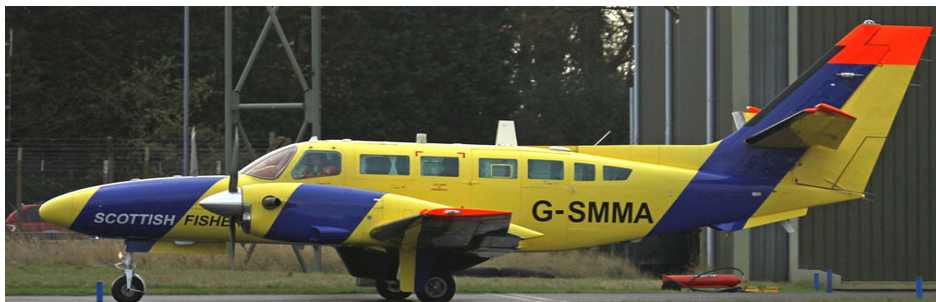
Fisheries Protection Cessna F.406 Caravan G-SMMA parked at Humberside, 26/11