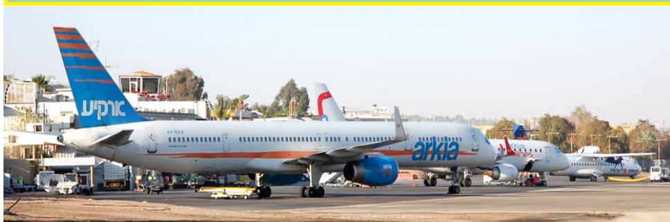
4X-BAW Boeing 757/200, Arkia, Eilat/Israel, 04/02/13(Martin Zapletal)