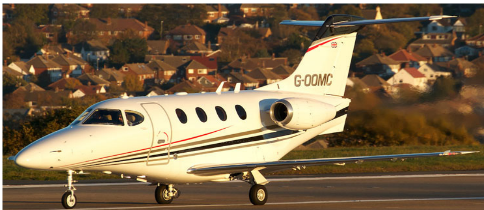
Premier 1 G-00MC(ex M-YAIR) lined up on 32 ready for departure, 4/11 (David Blaker)