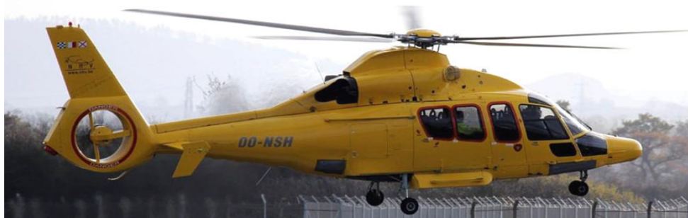
EC155B OO-NSH of NHV Noordsee Helikopters called in Teesside for a refuel, 18/11