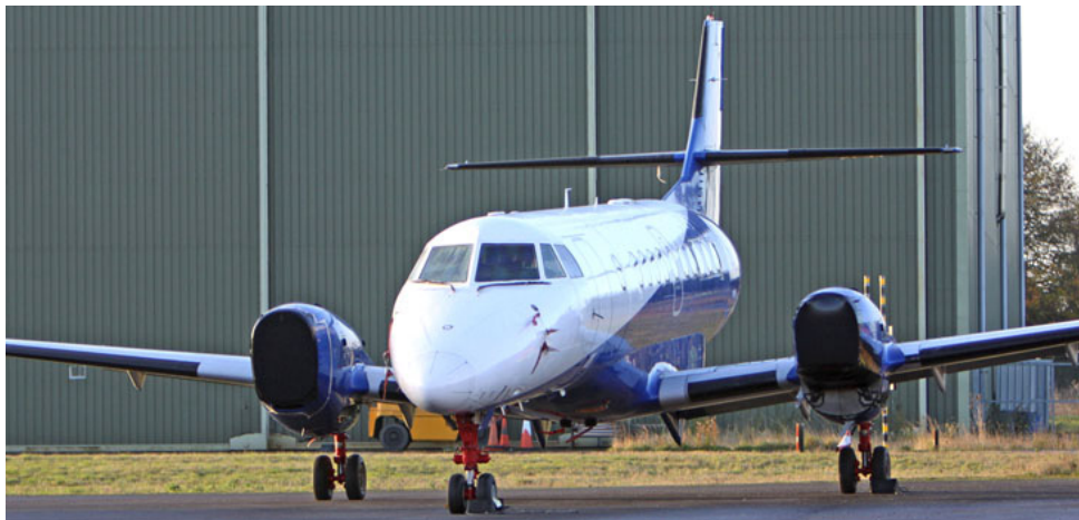
Eastern Airways Jetstream 41 G-MAJT(ex SX-SEC) looking rather forlorn, parked outside at Humberside minus its engines

Airport on the Isle of Grain. The Commission will make a final recommendation to the government in the summer of 2015, after the next General Election. Declan Collier, chief executive of London City Airport (LCY) commented after the press briefing, that the city airport is ideally placed to take up opportunities mentioned by the Commission. He says the city airports can meet the short to medium-term, short-haul (specifically domestic) needs to shift to smaller London airports - in particular on key business routes to UK and Northern Irish destinations. "LCY is an unique airport in terms of location, convenience (transport links) and speed of transit, which serves crucial sectors of the UK economy and the centres of finance, commerce and government in The City, Canary Wharf and Westminster," Collier says. "In the short term, London City Airport can make a contribution to relieving existing capacity constraints at Heathrow."