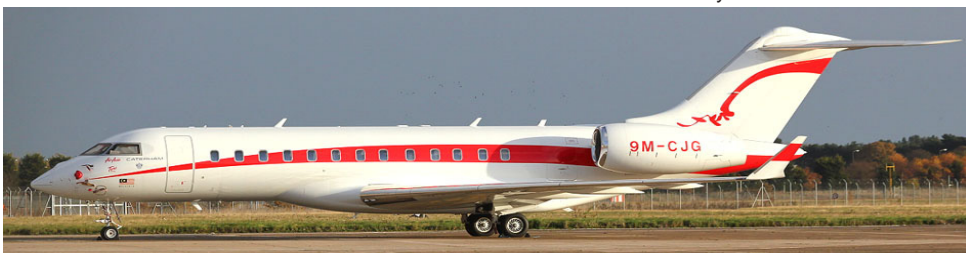
Operated by the Caterham F1 team, Global Express 9M-CJG diverted to Doncaster from Luton in the early hours of 30/11