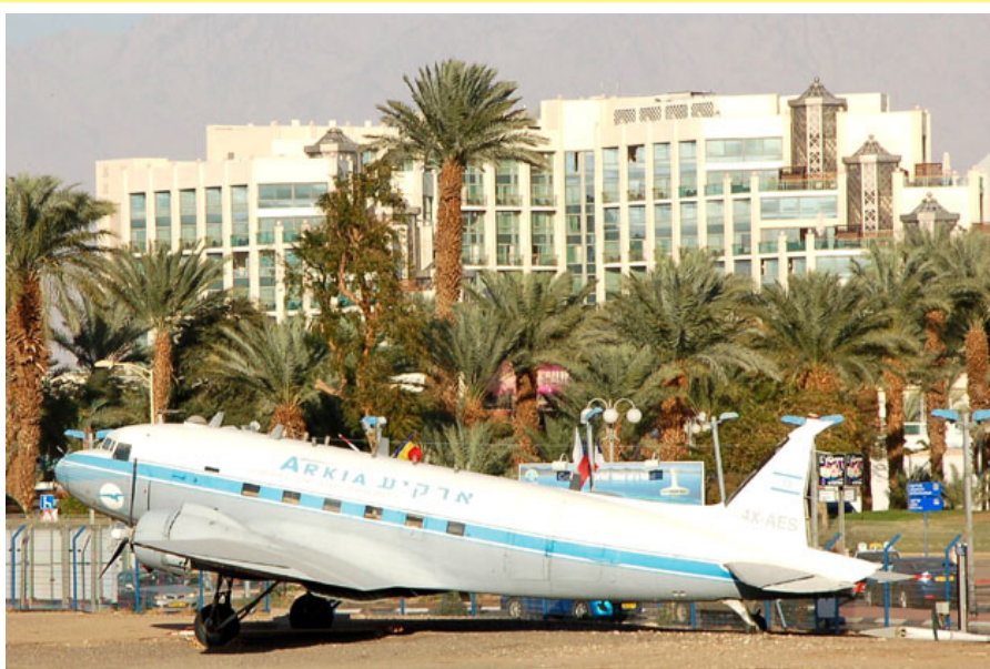
4X-AES Douglas DC-3, Arkia, Israel Inland Airlines Eilat, 04/02/13