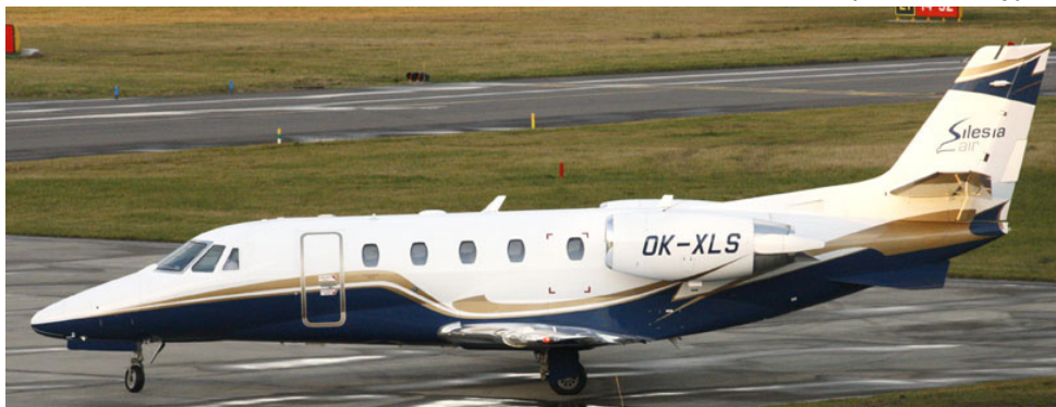
Citation XLS OK-XLS of Silesia Air taxiing on Multiflight/East, 21/11(Mike Storey)