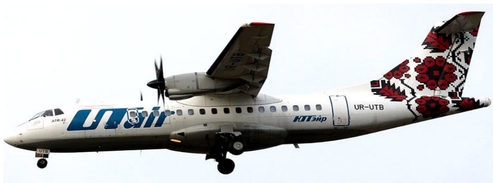
ATR-42 UR-UTB of UTair Ukraine arrived at Teesside in early December for Sycamore Aviation, along with sister-ship UR-UTA. More information on these aircraft next month.....

CREDITS Aircraft Illustrated, ACW, ATW, , Civil Spotters, LBA WEB Site, Teletext, Telegraph and Argus, TTG,