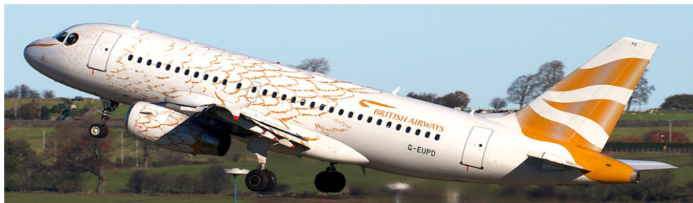
British Airways Airbus A.319 G-EUPD departing on the Heathrow Shuttle Note the aircraft still wears the "Dove" colour scheme

Tenerife(3749/8, "1GJ/92W" –Sun) –10/11 G-TAWB, 17/11 G-TAWB, 24/11 G-TAWB.