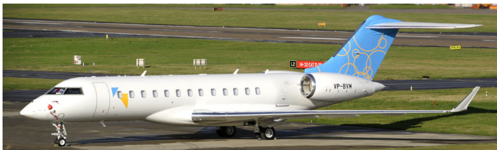
Global 6000 VP-BVM of Jet Aviation arrived direct from Dubai on 3/11