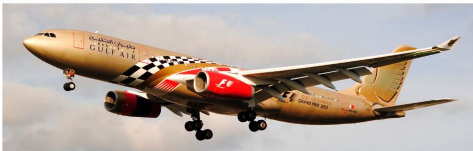
A9C-KB Airbus A.330, Gulf Air, Heathrow, 07/10/13