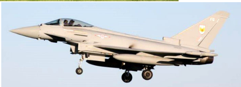
ZK339/FG Typhoon FGR.4 1 Squadron RAF