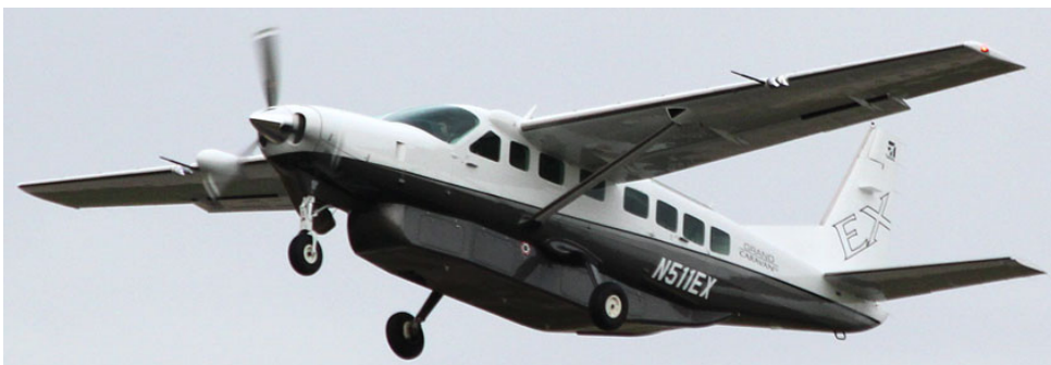
Demonstrator Cessna 208B Caravan N511EX visited the Cessna facility at Doncaster on 9/11