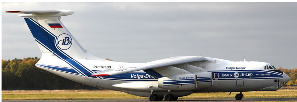
First IL-76 to visit Doncaster, RA-76503 of Volga Dnepr arriving on 16/11(Also see LBIA)