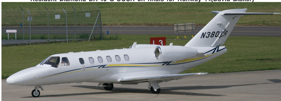
Chris Rycroft's Citationjet 3 N380CR taxiing onto Multiflight/East(Martyn Gill)