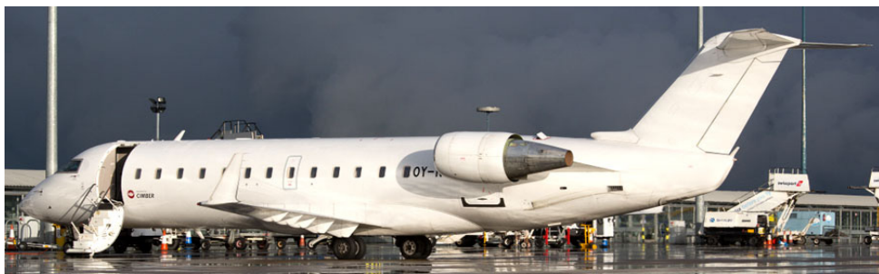
Kimber(SAS) CRJ-200 OY-RJL parked on stand following a very heavy shower The airline will cease operating the Copenhagen flight in early December

10/11 G-GDFX positioned out to Birmingham(109C) positioned back in from Moscow(110C), G-GDFU(052B/059B) test flights, G-GDFO(054F) positioned out to Norwich, G-CELR(032E) positioned out to Edinburgh, 11/11 G-LSAJ(032E) positioned out to Birmingham, 13/11 G-GDFL positioned out to Gatwick(101C), G-CELD(041A) positioned out to Alicante, G-CELP(052K) positioned in from Norwich, G-CELJ positioned out to Alicante(042A), 14/11 G-CELF(111C) positioned out to Gatwick, 14/11 G-GDFL(102C) positioned in from Gatwick, G-CELP(031E) positioned out to Edinburgh, G-GDFU positioned in from Alicante(041A), 15/11 G-CELV(112C) positioned in from Gatwick, 16/11 G-GDFB(051B) test flight, G-CELR positioned in from/out to Edinburgh(031E/032E), 17/11 G-LSAJ positioned in from Birmingham(031E), 18/11 G-LSAN(079W) positioned in from Manchester, 20/11 G-LSAN(042A) positioned out to East Midlands, 22/11 G-LSAA(031E) positioned out to Manchester, 25/11 G-LSAN(043A) positioned in from East Midlands, 26/11 G-GDFW positioned in from Manchester(039E), G-GDFX(038E) positioned out to Manchester, 27/11 G-GDFH(059B) test flight, G-CELU positioned in from Newcastle(039E), 28/11 G-GDFW(041A/042A) positioned out to/in from East Midlands, 29/11 G-CELX(031E). positioned in from Edinburgh.