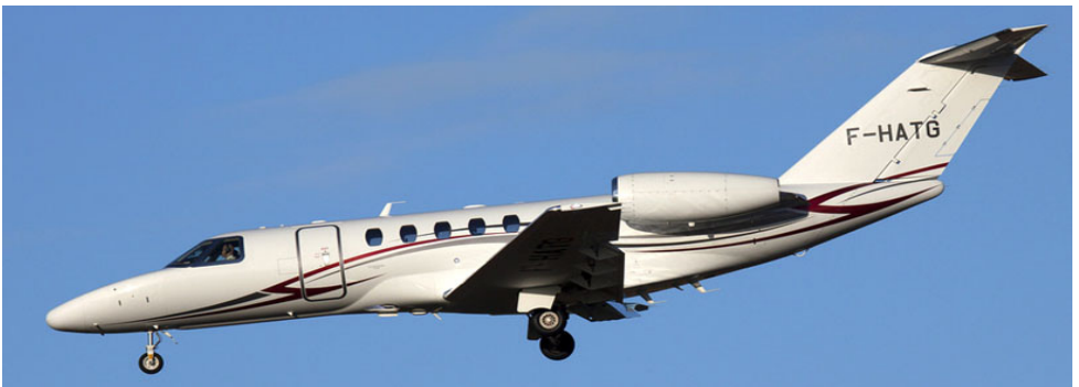
Owned by Flying Faststr Snc. Citationjet 3 F-HATG on final approach, 3/11