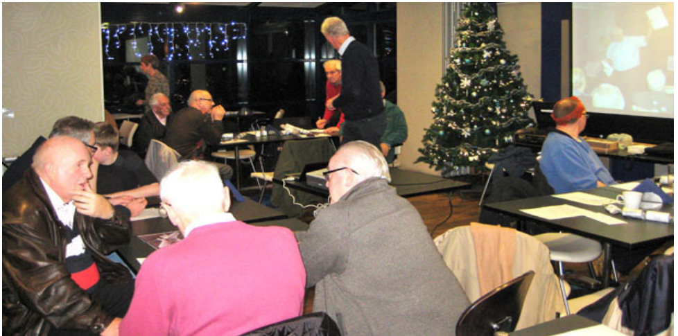
ABOVE- Some quiz answers need a bit of thought