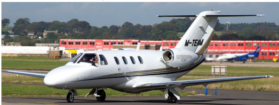
Citationjet M-TEAM, quite a common sight on the Multiflight/East apron in November