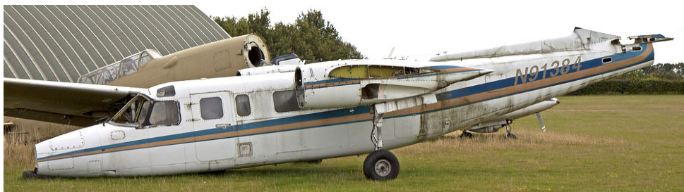
The remains of Commander 690 N91384 dumped at Wickenby(Rich Grimley)

THORPE WOOD:- XV741/DD-41 Harrier GR.3 has been acquired by Jet Art Aviation following its disposal by AESS at HMS Sultan, Gosport.