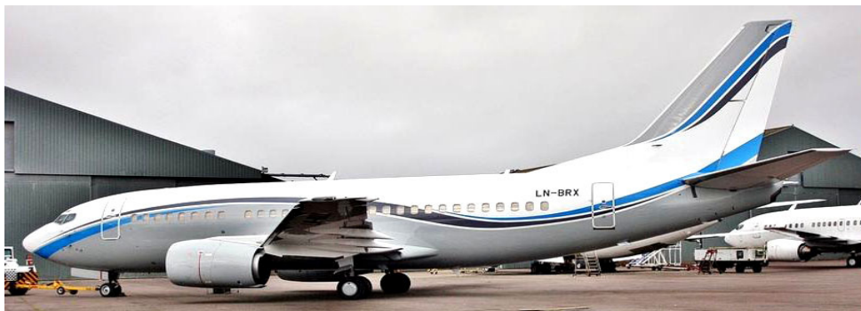
Former SAS 757/500 LN-BRX at Bournemouth being prepared for Executive operations

The Ministry of Defence has placed an order for 22 A400Ms as a reinforcement of its airlift capacity with the first aircraft delivered last month. Flybe CEO Saad Hammad said: "We are delighted to have reached agreement on this significant contract with Airbus Defence and Space. "This is a landmark agreement for Flybe Aviation Services