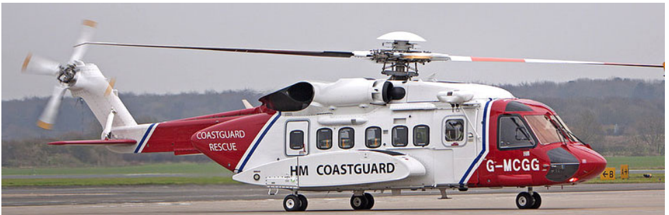
One of the latest arrivals for the HM Coastguard operations, Sikorsky S.92 G-MCGG