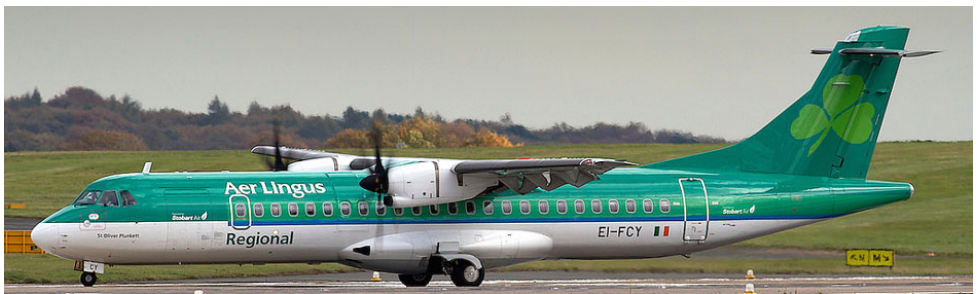
Stobart ATR-72 EI-FCY taxiing for take off the Dublin

Schedules flights to be operated to the following destinations:- Arrecife (7592/3 –Mon/Thu); Tenerife (7504/5 –Tue/Fri); Larnaca (7508/9 –Wed/Sun); Faro (7542/3 –Tue/Thu/Sat), ( Palma (7516/7 –Tue/Thu), Dalaman (7534/5 –Tue/Sat), Heraklion (7558/9 –Wed/Sat/Sun), Antalya (7596/7 –Thu/Sun), Barcelona (7554/5 –Mon/Fri), Bodrum (7536/7 –Mon/Fri). Two Airbus A.320 (normally with “Sharklets”) are based:-G-ZBAA(1/11-30/11), G-ZBAR(1/11-3/11), G-OZBY(9/11-10/11),