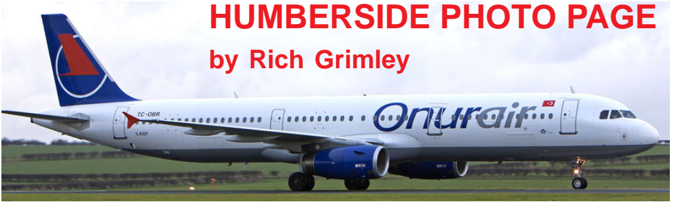
Onur Air Airbus A.321 TC-OBK operated a charter from Helsinki on 19/11