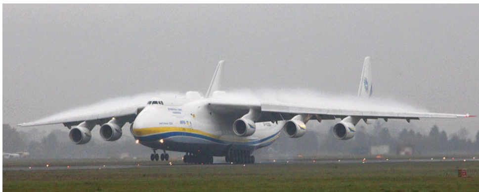
Antonov AN-225 UR-82060 arriving at Doncaster, 16/11