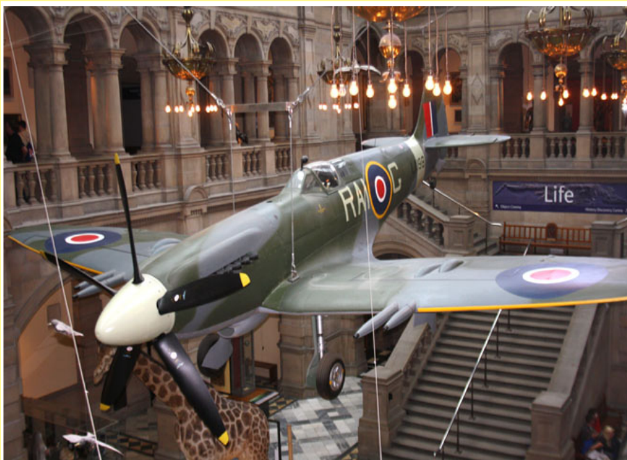
LA198 Spitfire, Kelvingrove Museum, Glasgow, 31/07/14