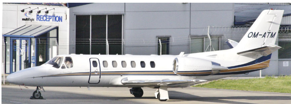
Operated by Trans Europe Citation Bravo OM-ATM on Multiflight/East, 2/11