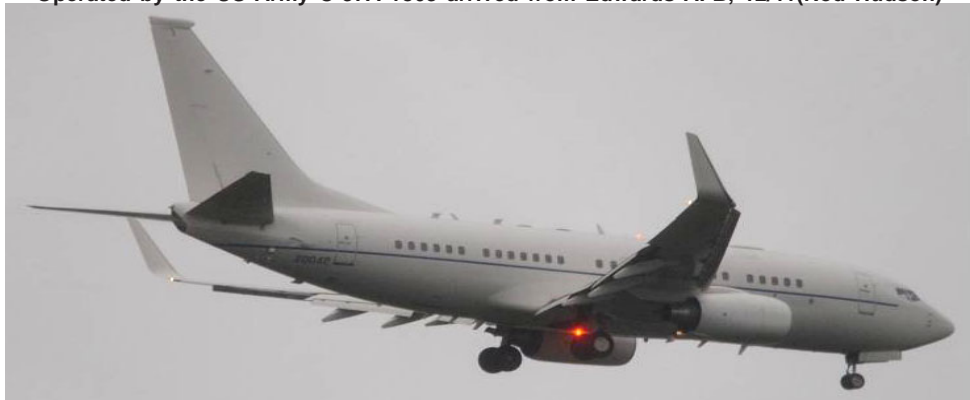
Appearing out of a grey murk on 14/11 was C-40B 02-0042 operated by USAF Europe