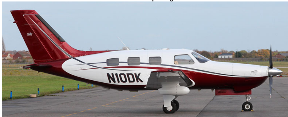
European based Malibu Mirage N10DK parked on the apron, 2/11