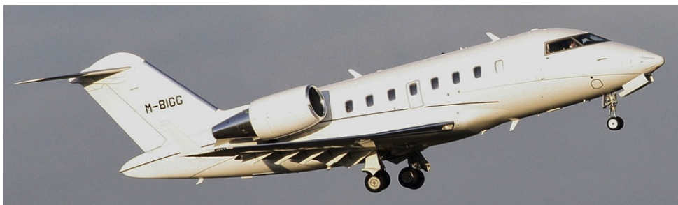
Challenger 604 M-BIGG of Signal Aviation, departing 14 for Teesside, 18/11(Rod Hudson)