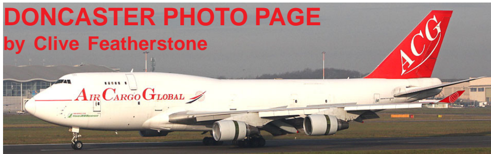
Boeing 747/400 OM-ACG of Air CargoGlobal made several visits during November