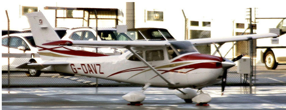
Cessna 182T G-DAVZ based at Elmsett arrived on 17/11 for 2 day stay(Mike Storey)

Citationjet 2 9H-ALL (Luxwing 101/2) from Luton(1251) to Dundee(1345). Agusta A.109S G-MAOL from Leyburn(1710) to a private site near Coventry(1722). Citation Mustang OE-FZD (Dream Team 828G) from Jersey(1819), n/s.