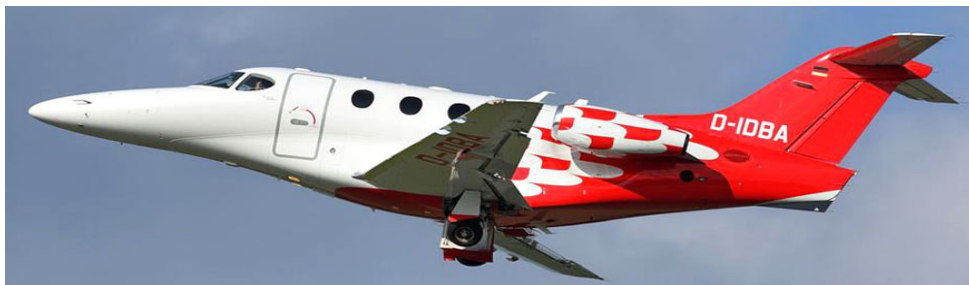
Premier 1 D-IDBA of Alpha Executive was on its first visit to LBIA, 6/11