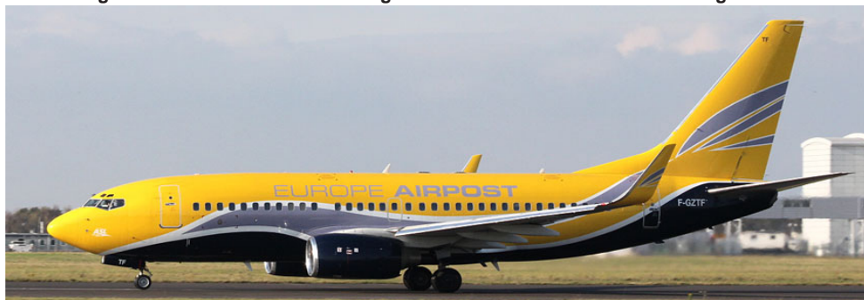
Boeing 737/700 F-GZTF took the cast of Disney on Ice to Dublin on 10/11