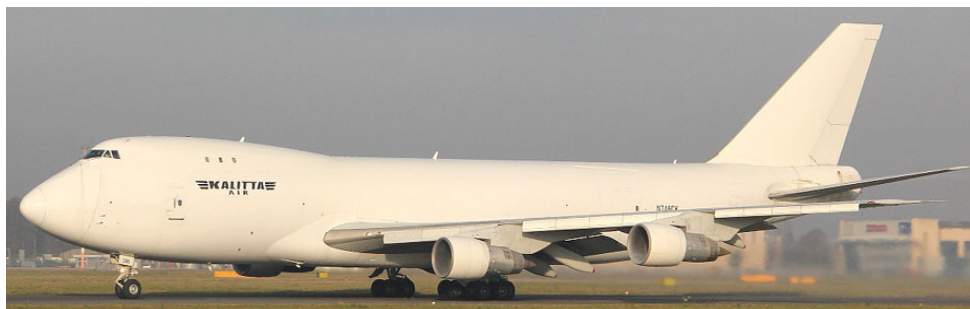
Kalitta Boeing 747/200 N746CK arrived at Doncaster on 4/11 and stayed 2 days