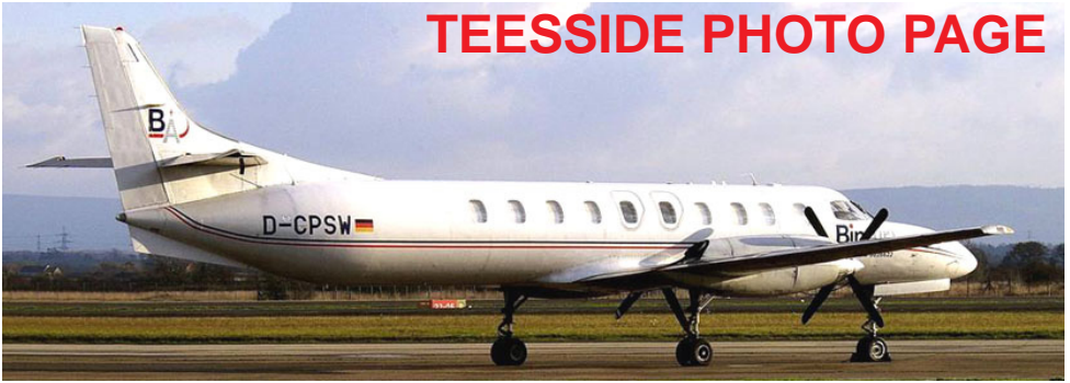
Metroliner D-CPSW of Bin Air operated a freight charter on 18/11