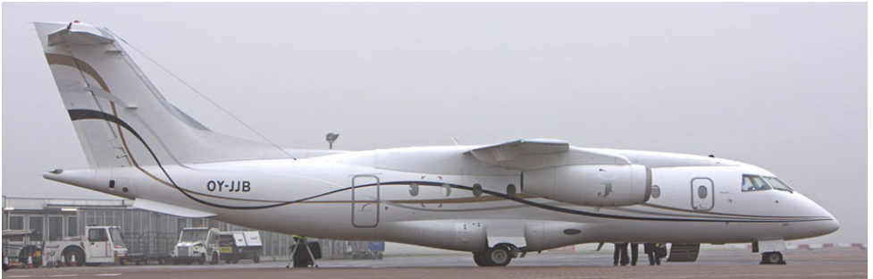
Dornier 328J OY-JJB eventually landed after the clearance of early morning fog on 15/11