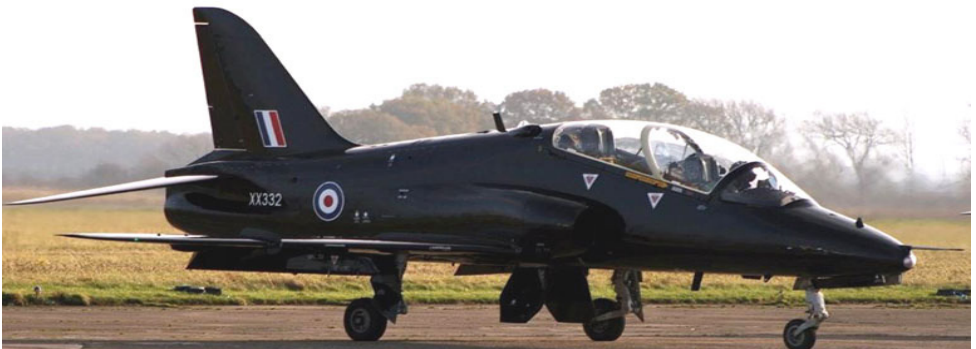
Hawk XX332 arrived from Leeming on 7/11 and carried no squadron markings