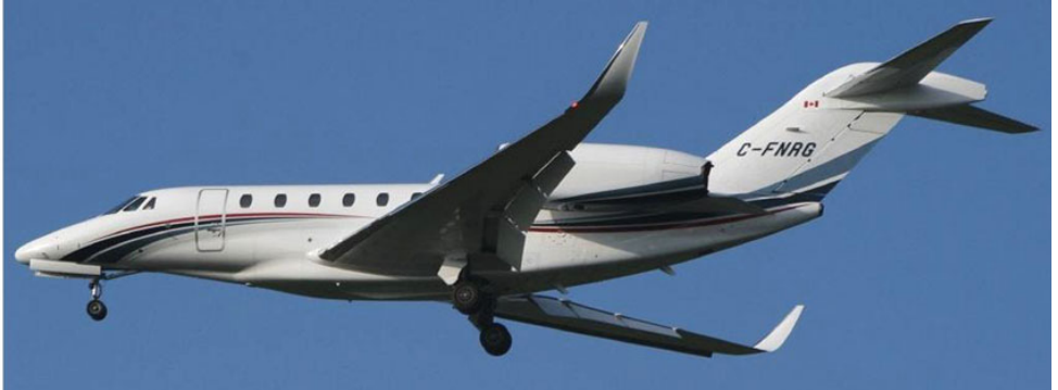
Operated by Albatros Aircraft Corp of Alberta, Citation X C-FNRG on approach, 9/11