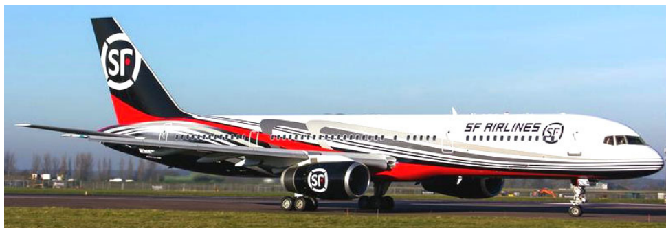
Boeing 757 G-FCLA recently painted in the striking colours of SF Airlines of China