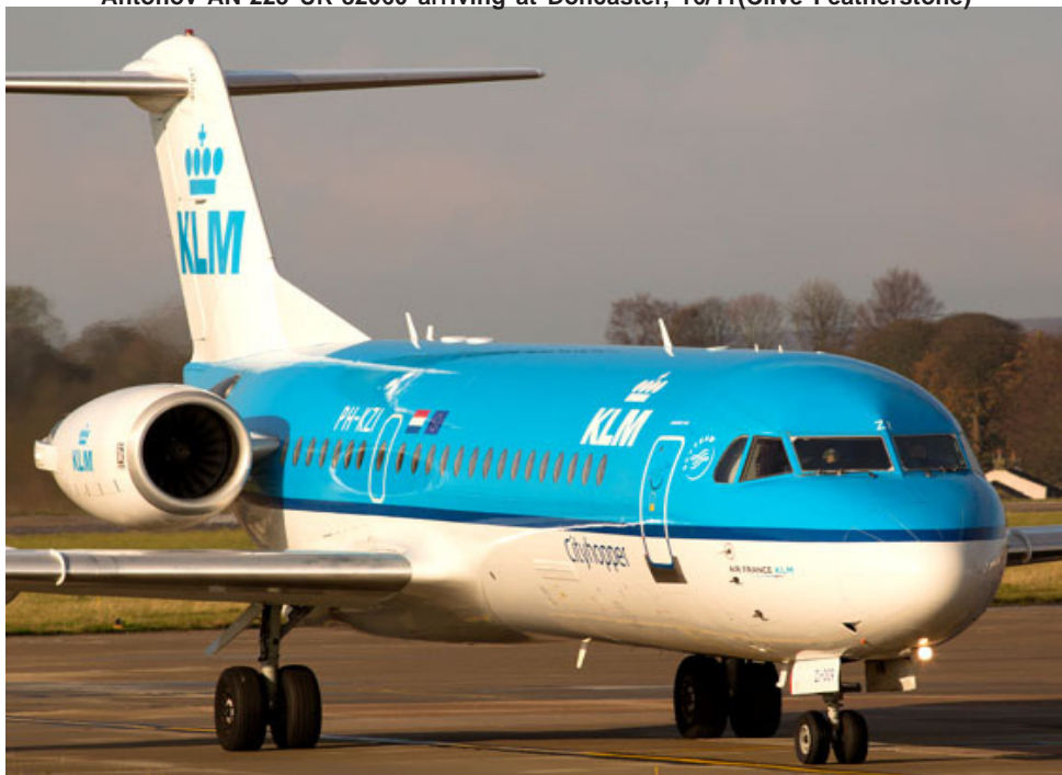
Fokker 70 PH-KZI, an unusual sight at LBIA now, arriving on 9/11(Robert Burke)