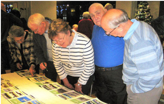
LEFT- Members voting in the annual photo competition