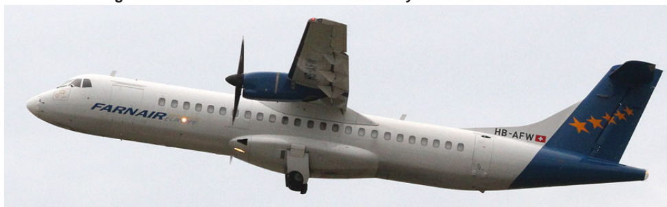
ATR-72 HB-AFW of Farnair departing Doncaster on 8/11