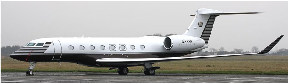
Replacing a Global with the same reg, Gulfstream 6 N288Z was a first visit of type. 12/11