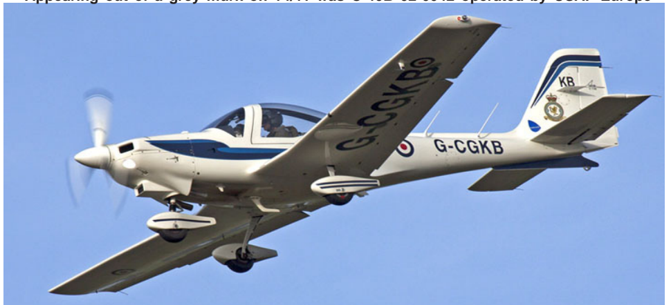
Grob Tutor G-CGKB based a Cranwell paid a visit to Multiflight on 24/11(Rich Grimley)