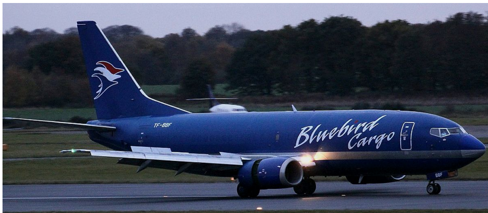
TF-BBF Boeing 737 Bluebird Cargo 13/11

(FV) First Visit. (T) Training. (H) Helicopter. (F) Freighter. (M) Maintenance.