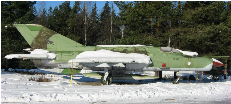
MG-111 MIG-21BIS Finnish Aviation Museum