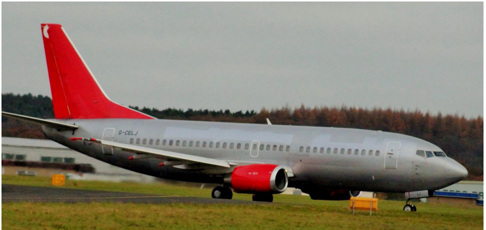
G-CELJ Boeing 737 Jet2.com 25/11 Rod Hudson

GDFM(051B) test flight to Manchester, 10/11 G-GDFG(041A) positioned out to Newcastle, 11/11 G-GDFH(031E) positioned in from Norwich, 13/11 G-LSAA(104C) positioned in from Dublin, 14/11 G-GDJF(032E) positioned out to Manchester, 15/11 G-GDFM(031E) positioned in from Manchester, G-CELI(032E) positioned out to Manchester, 16/11 G-CELR(033E) positioned out to Budapest, 17/11 G-LSAN(061J) positioned out to East Midlands, 20/11 G-CELK(031E) positioned in from Norwich, 21/11 G-CELK(071W) positioned in from Doncaster, 22/11 G-JZHF(032E) positioned in from Glasgow, G-JZHK(71W) positioned in from Doncaster, 24/11 G-CELA(061J) positioned in from Manchester, G-JZHA(031E) positioned in from Manchester, 25/11 G-CELJ(033E) positioned out, G-CELA(041A) positioned out to Berlin, G-CELK(043A) positioned in from Berlin, 26/11 G-LSAI(042A) positioned out to Manchester, G-LSAA(041A) positioned in from Tenerife, G-GDFB(033E) positioned in from Belfast, 27/11 G-GDFP(071W) positioned out to Manchester, G-JZHF(031E) positioned out to East Midlands, 30/11 G-GDFG(300T) test flight.