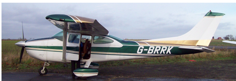
8260 G-BRRK 182Q arrived from Elstree for repaint 11/12