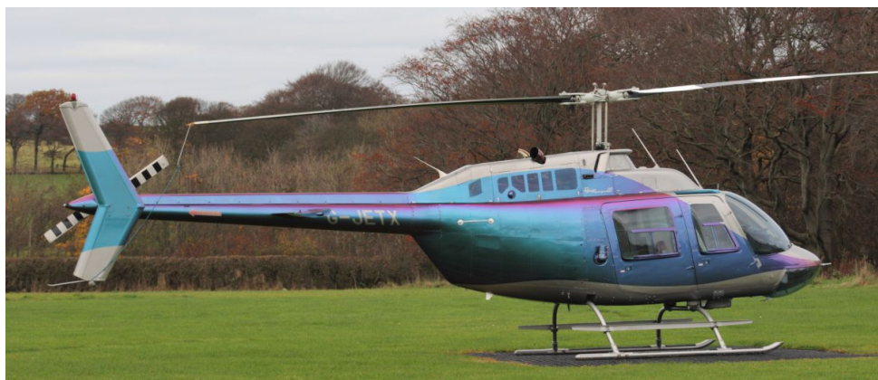
G-JETX Bell 206b Jet Ranger-3