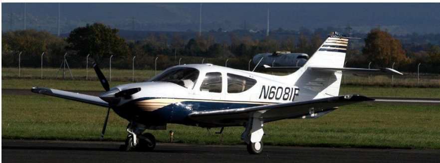
N6081F Commander 114B 01/11

01/11 N6081F Commander 114B f Kemble t ?, LX-TWO Learjet 35A f Lisbon t Luxembourg Ducair, LN-IDC Citation 560 Encore f Oslo Sandefjord n/s Hesnes Air