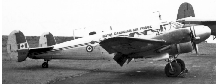
1533 C-45 RCAF