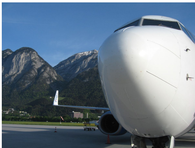
OK-TSJ Boeing 737-8AS Travel Service Innsbruck