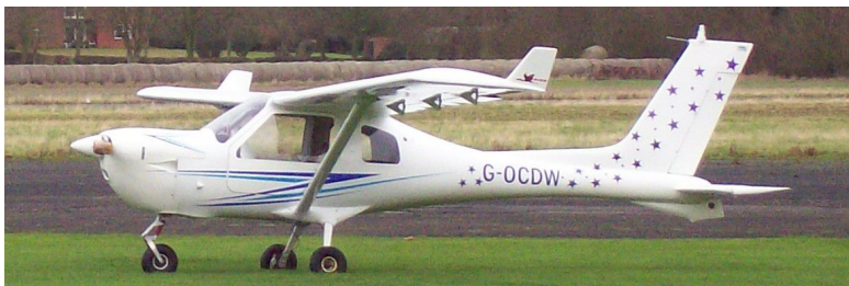
8265 G-OCDW Jabiru 450 visitor from Caunton 11/12