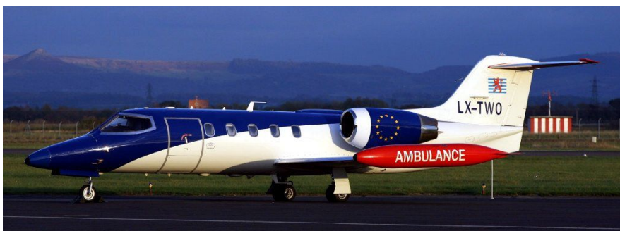
LX-TWO Learjet 35A 01/11