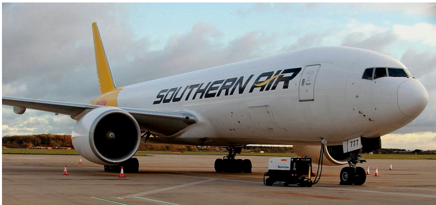
N777SA Boeing 777 Southern Air 07/11