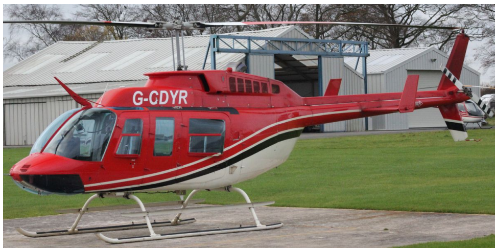
G-CDYR Bell 206i Long Ranger