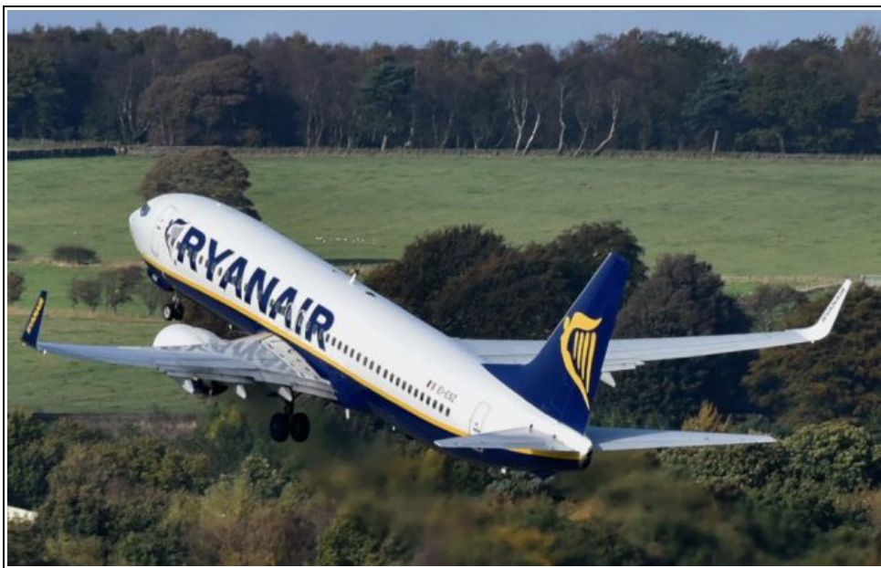
EI-ESZ Boeing 737-8AS Ryanair LBA 21 October 2016