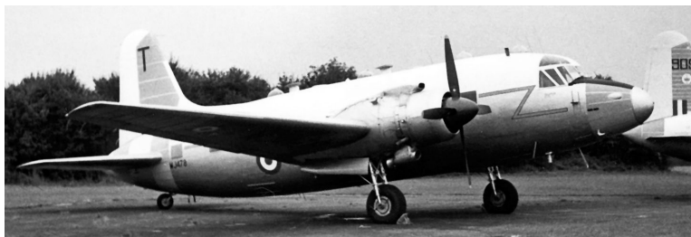
WJ478 Valetta T3 T 2 ANS

We again visited Farnborough in the late afternoon before calling at Blackbushe in the early evening where the most interesting aircraft seen was USAF C-47 0-49208 overflying the airfield. We then returned to the town of Odiham for our final night in the pub.