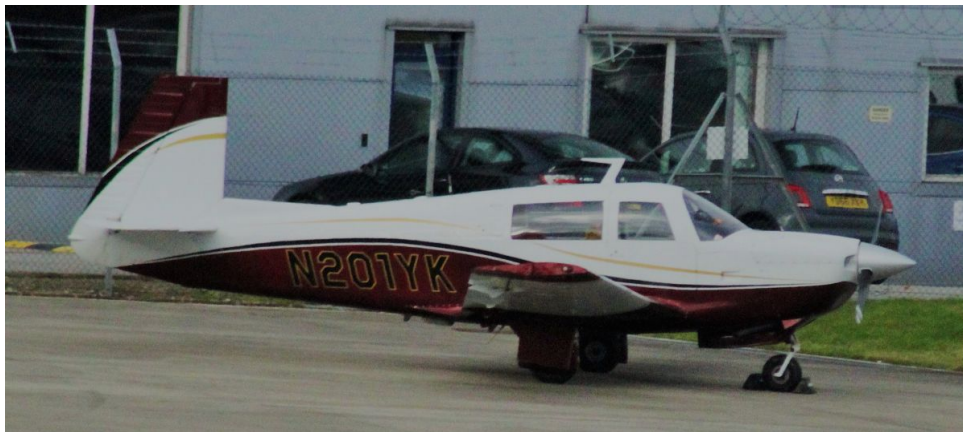
N201YK M20J Mooney 25/11

Piper PA-31 Navajo G-UCAM arr 10:31 from Belfast dep 12:02 to Belfast City, Mooney M20J N201YK f/t Jersey (12:11/14:26),