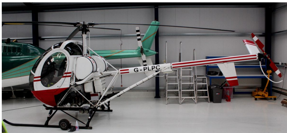
G-PLPC Schweizer Hughes 269c