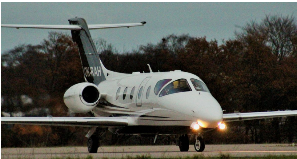
OK-RAH Beechjet 400 24/11

Beech 200 Kingair G-IASA arr 10:02 from Prestwick dep 10:56 to Glasgow, Challenger CL605 D-ABEY dep 10:52 to Abu Dhabi, Beechjet 400 OK-RAH (c/n RK-413) arr 11:26 from Stockholm-Bromma dep 15:37 to Oxford, WAH-64 Apache ZJ189 & ZJ190 f/t Wattisham (12:50/13:46) c/s Viper, Bell 206 Jetranger G-GBRU local flight (14:32/14:56).