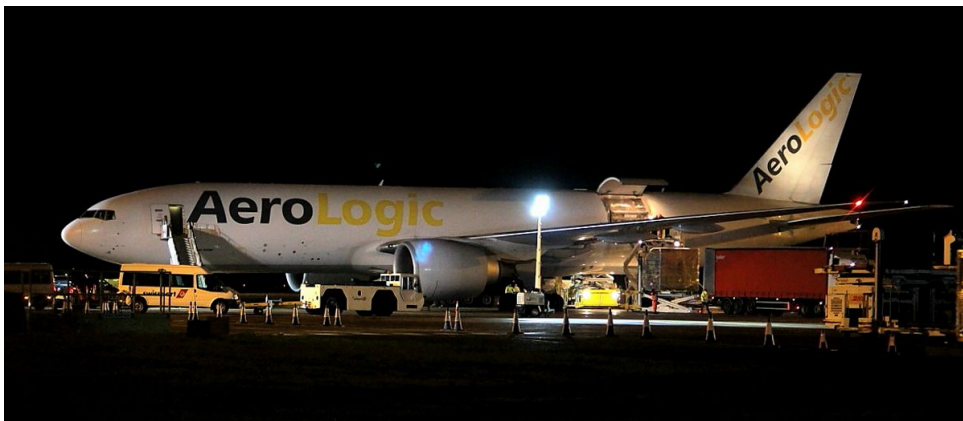
D-AALF Boeing 777 AeroLogic 06/11

20th G-BMRJ Boeing 757 D.H.L. (F) (FV) Dep. 21st +27th-28th 25th HA-FAU Boeing 737-400 ASL Airlines Hungary (F) (FV) Dep 28th 26th G-DHLH Boeing 767-300 DHL (F) dep early hrs 27th 27th N778LA Boeing 777-200 Southern Air Cargo/D.H.L. Night-stop (F) (FV) (in partial Lan Chile colours) Dep 27th D-AEAD Airbus A-300 D.H.L. (F) (FV)