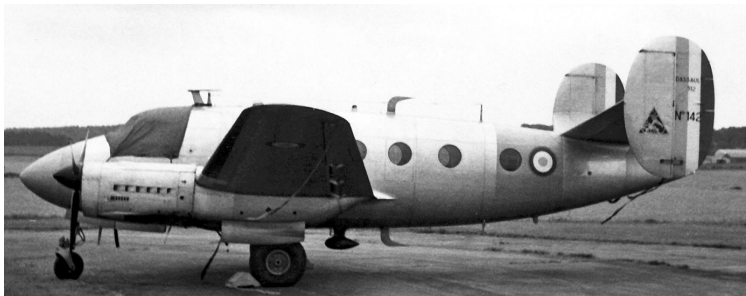
142 Flamant SEAM

142 Flamant S.E.AM. WP313 Sea Prince T.1 LM638 XM961 Twin Pioneer N9012P Piper Comanche 400