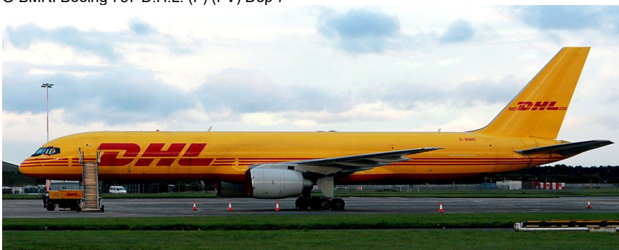
G-BMRI Boeing 757 DHL 07/11