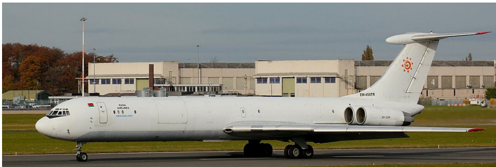
EW-450TR Ilyusin IL-62 Rada Airlines 02/11