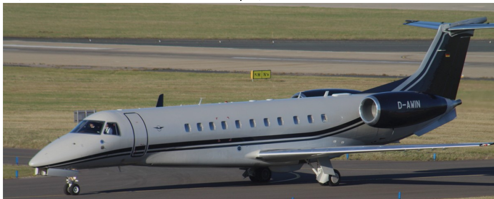
D-AWIN EMB 135 Legacy 650 02/11 Ian Gratton

Grob G120 Prefect ZM313 f/t Cranwell (11:22/14:18) c/s CWL62, Cessna 182T G-CWTT arr 11:43 fr Staverton dep 12:54 to Southend, EMB 135 Legacy 650 D-AWIN arr 14:07 fr Malaga n/s, Cirrus SR22 N347DC arr 15:05 fr Le Touquet,