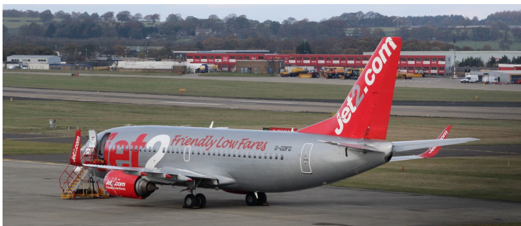
G-GDFG Boeing 737-300 04/11