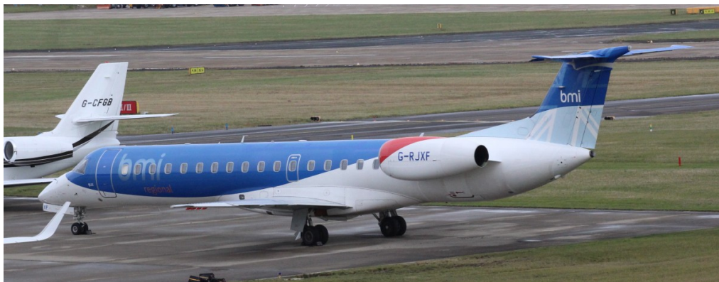
G-RJXF ERJ145 BMI 10/11 Mike Storey

9/11 G-RJXF(8101) operated in from Stansted, 10/11 G-RJXF(8102) operated back to Stansted, 23/11 G-EMBN(8124/9151) operated in from Bristol, then positioned out to Newcastle, 24/11 G-CKAF(9163/8125) positioned in from Newcastle/operated out to Bristol, 30/11 G-RJXB(8991) operated in from Gatwick.