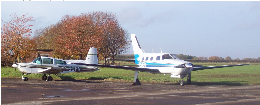
N264DB PA-46 at Sturgate 06/11