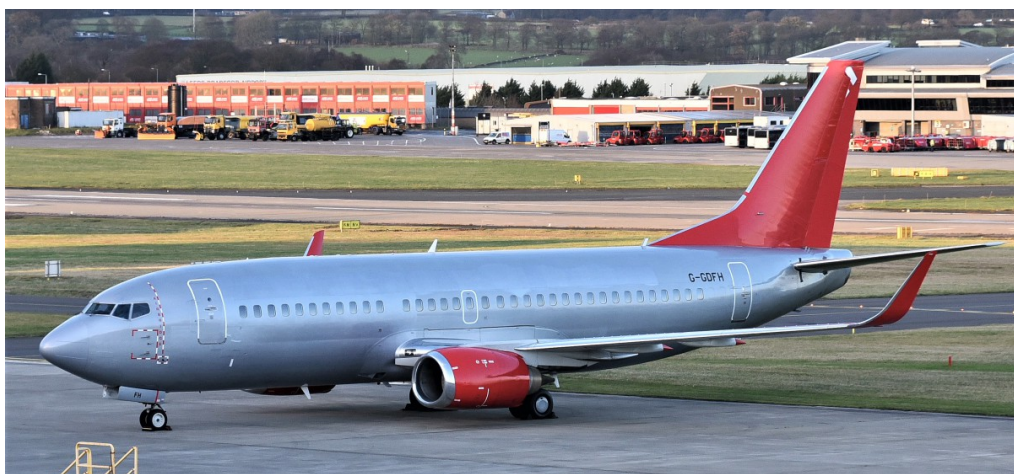
G-GDFH Boeing 737-3Y5 Jet2.com 30/11