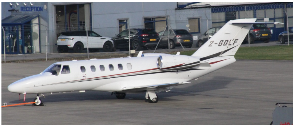
2-GOLF Citation 525A 30/11 Mike Storey