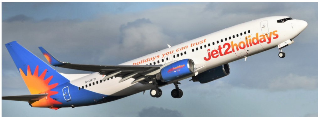
G-DRTD Boeing 737-808 Jet2Holidays 12/11 Rod Hudson