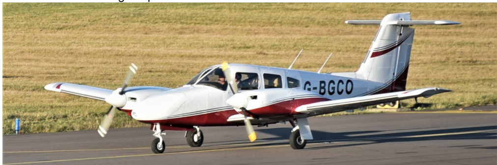
G-BGCO Piper PA-44 Seminole 13/11 Rod Hudson

Beech 200 Kingair G-WCCP arr 07:11 fr Doncaster dep 17:37 to Liege, Piper PA-44 Seminole G-BGCO arr 10:07 fr Warton ret at 10:52 and back again at 14:32 ret Warton at 14:59, Gulfstream 200 EC-JQE arr 10:26 fr Valencia n/s, Phenom 100 ZM333 ILS approach at 10:50 c/s CWL34, Falcon 7X G-OIMF dep 13:25 to Doncaster, Cessna 750 Citation X N950M arr 16:05 fr IOM until 19 th , Britten Norman BN-2T defender ZG996 ILS approach at 16:51 c/s AAC501, BAE Hawk T1 XX348 ILS approach at 16:58 c/s Pirate24, Beech 200 Kingair G-WCCP arr 17:17 fr Liege dep 17:31 to Doncaster.