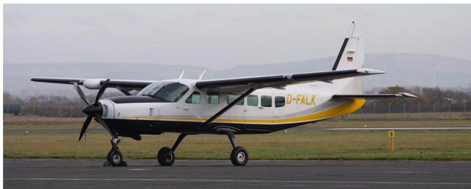
D-FALK Cessna 208 Caravan 08/11