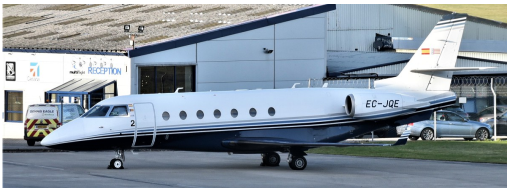
EC-JQE Gulfstream 200 13/11 Rod Hudson