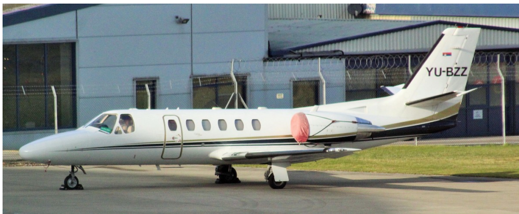
YU-BZZ Citation Bravo 04/11 Mike Storey

14:33 to EMA, Citation Bravo YU-BZZ dep 14:46 to Vnukovo, Gulfstream G280 N905G arr 18:32 fr Toledo until 6 th , Falcon 7X G-OIMF arr 20:34 fr Louisville until 13 th ,