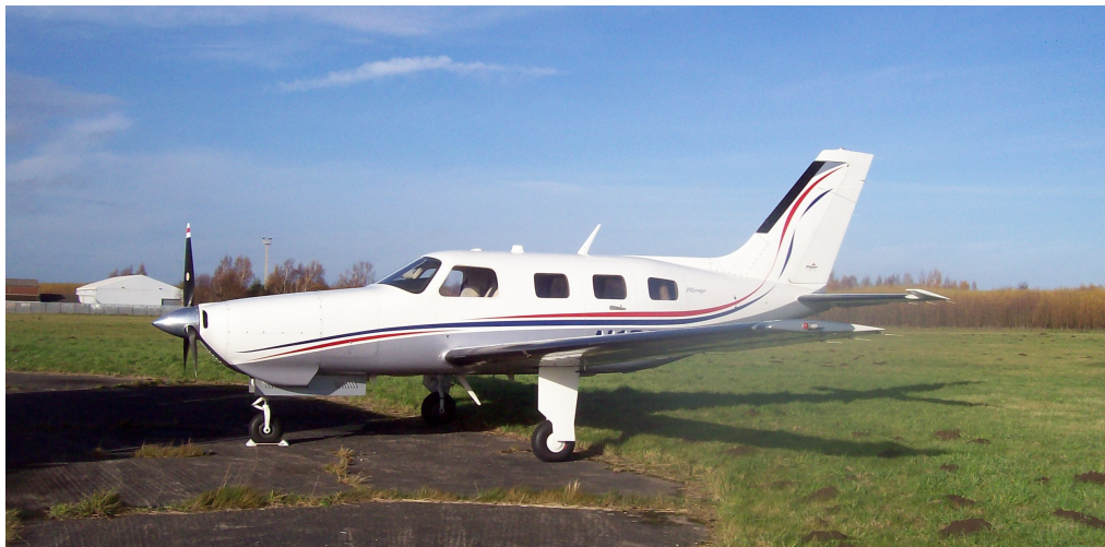
N10522 PA-46-350P at Sandtoft 10/11