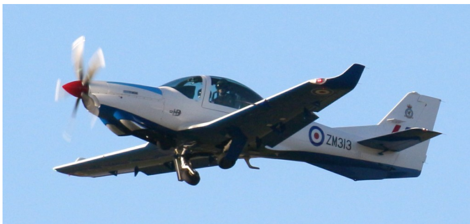
ZM313 Grob Prefect 12/11

5th 064 Embraer 121 Xingu French Air Force +16th 19th