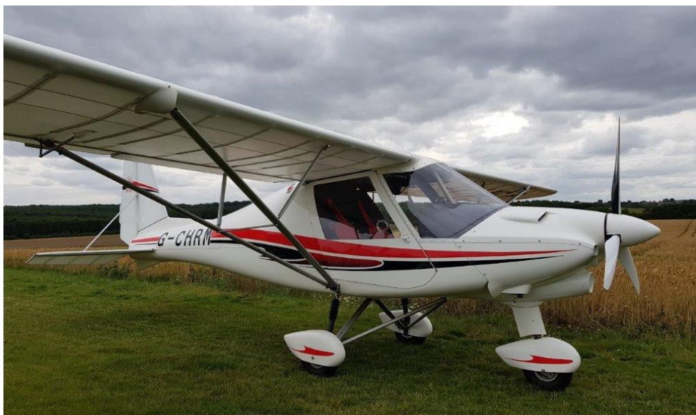
G-CHRM Ikarus C42 FB80 Bravo

All aircraft except for the PA-30 are known to be residents .