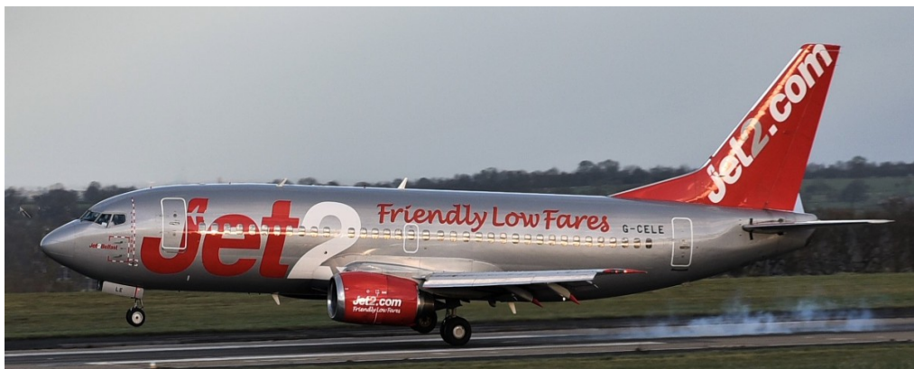
G-JZHR Boeing 737-8MG Jet2.com 30/11 Rod Hudson

Other flights:-1/11 C-GNCH(SWG9335/SWG9335) operated in from Norwich then positioned out to Toronto, 5/11 G-TAWW operated a charter in from Tenerife(2707), then positioned out to Manchester(2707F).