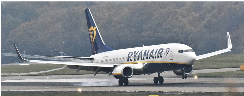
EI-GDR Boeing 737-800 Ryanair 06/11 Rod Hudson

Additional flights:-22/11 EI-EKV(253) positioned in from Liverpool, EI-DAF(907P) positioned in from Liverpool,