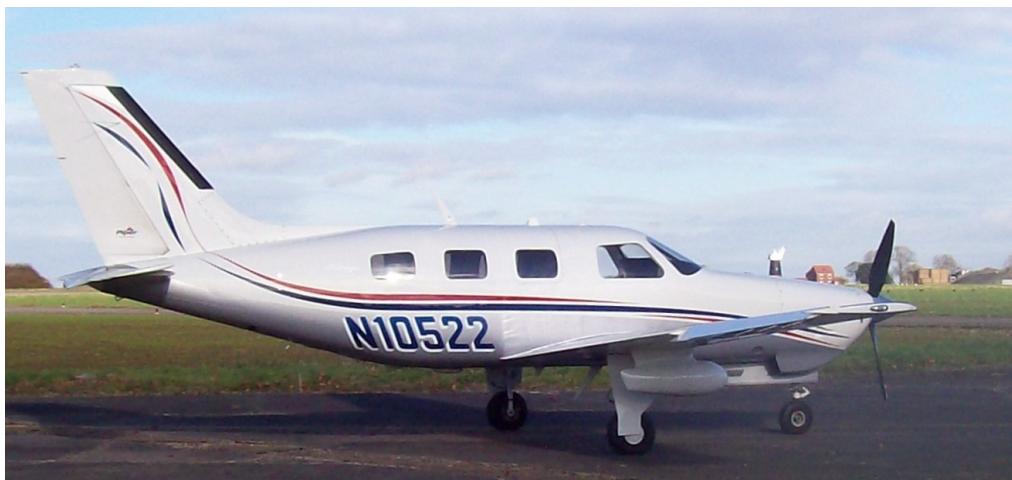
N10522 PA-46-350P at Sturgate 03/11