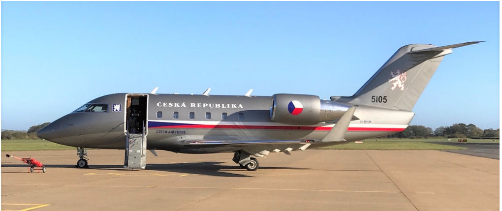
The Czech Air Force VIP Canadair CL601-3A Challenger '5105' , c/s CFE229 made a short stop at RAF Linton On Ouse on the morning of the 22 October 2018 and is seen here in the bright autumn sunshine