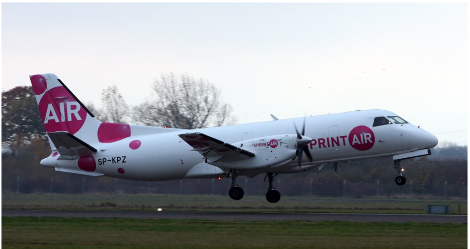
SP-KPZ Saab 340A 09/11