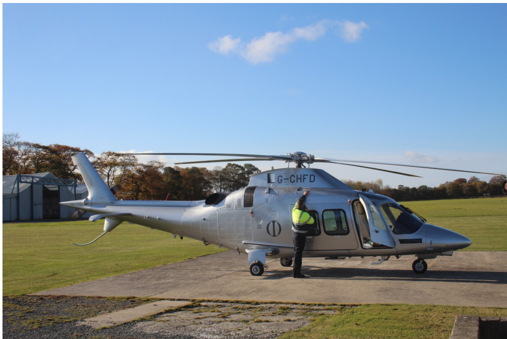
G-CHFD-Augusta AW109sp 01/11 Ian Gratton