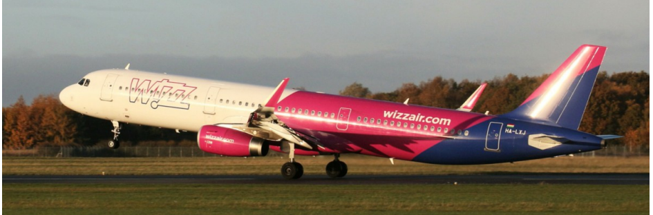
HA-LXJ Airbus A321 Wizzair 12/11

27th EC-LXA Airbus A-330-300 Evelop Airlines The first 300srs unfortunately in the dark (FV) 27th TF-AMU Boeing 747-400 Air Atlanta Icelandic Astral Aviation Livery (F) A/D 27th G-SCIR Piper PA-31 Navajo 29th LX-VCV Boeing 747-400 Cargolux (F) A/D 29th VQ-BVB Boeing 747-800 Silkway (F) A/D (FV) 30th G-YEOM Piper PA-31 Vodafone Huawei P20 livery 30th G-UCAM Piper PA-31 Navajo Chieftain 30th TF-AMM Boeing 747-400 Air Atlanta Icelandic Astral Aviation Livery (F) A/D 30th LX-GCL Boeing 747-400 Cargolux (F) A/D (FV) 30th 4K-SW888 Boeing 747-400 Silkway (F) A/D (FV) Dep early morning 1st December.