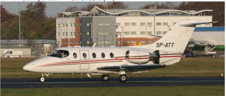
SP-ATT Beechjet 400XP 12/11

1st M-YGIG Gulfstream VI Private (FV) 1st N252KA Beech 200 King Air (FV) 5th F-GULY Beech 90 King Air 7th SE-RNR BD-100-1A10 Challenger 350 (FV) 8th G-RSXP Citation 560XLS (FV) 10th G-YMKH Embraer-135BJ Legacy 650 (FV) 11th 9H-VCM BD-100-1A10 Challenger 350 (FV) 12th SP-ATT Beechjet 400XP +19th-D. 22nd (FV)