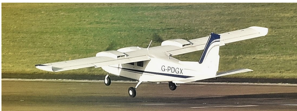
G-PDGX Vulcanair P.68C-TC 30/11 Rod Hudson