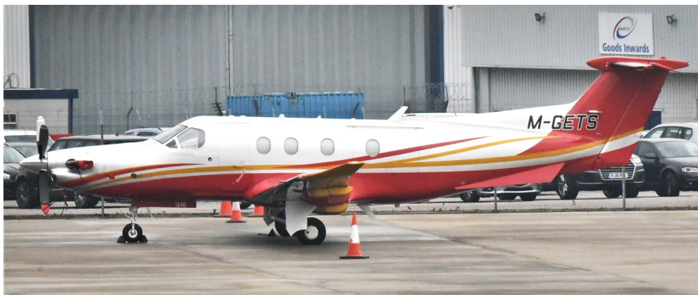
M-GETS Pilatus PC XII 06/11 Rod Hudson

Pilatus PC XII OO-PCJ arr 10:16 fr Charleroi dep 11:05 to Stuttgart, Beechjet 400 G-FXCR arr 13:48 fr Farnborough ret at 17:57, Pilatus PC XII M-GETS dep 15:29, Beechjet OK-BII arr 20:00 fr EDI n/s.