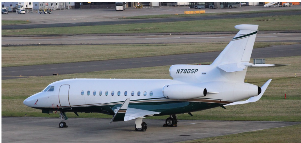
N780SP Falcon 900 30/11 Mike Storey