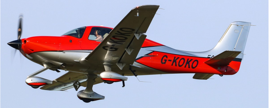
G-KOKO Cirrus SR22T 03/11

03/11 G-TAAB Cirrus SR22 f/t Oxford Kidlington Alpha Bravo Aviation, LX-FLH Pilatus PC-12 NGX f Cambridge n/s Jeffly Aviation, N122DR Cirrus SR22T f/t Tatenhill, G-KOKO Cirrus SR22T f Oxford Kidlington t Oxford