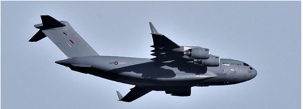
ZZ171 Boeing C17 Globemaster III 23/11 Rod Hudson

Phenom 300 CS-PHF dep 07:19 to Altenrhein, Boeing C17 Globemaster III ZZ171 performed 3 ILS approaches starting at 13:35 c/s ascot821,