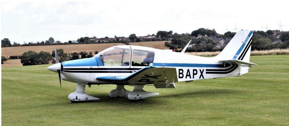
G-BAPX Robin DR400