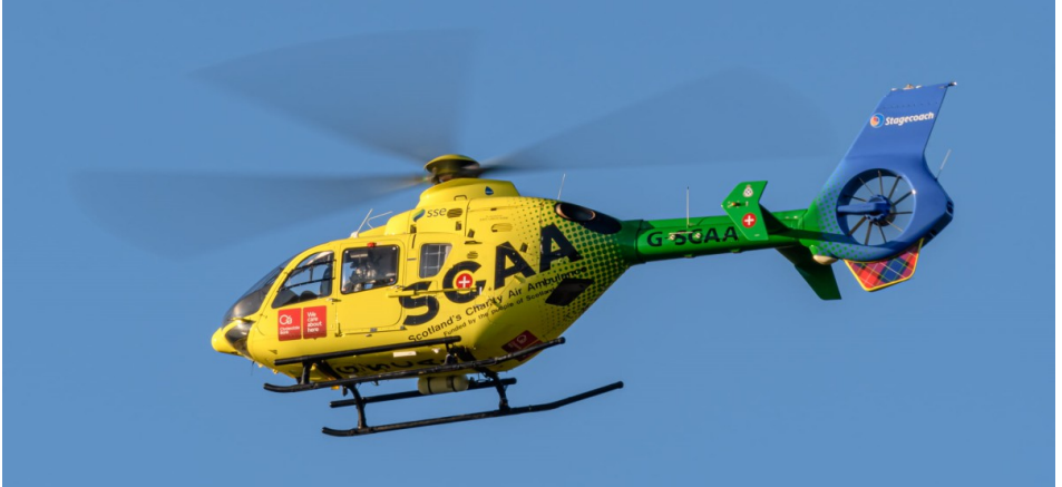
G-SCAA Eurocopter EC135 T2+ 19/11

24/11 N517FD Piper PA-32R Saratoga IITC f Bagby t Liverpool, ZM417 Airbus A400M Atlas C1 f Brize Norton c/t RAF - 24/70 Sqdn, G-BILU Cessna 172RG Cutlass f Full Sutton c/t Full Sutton Flying Centre