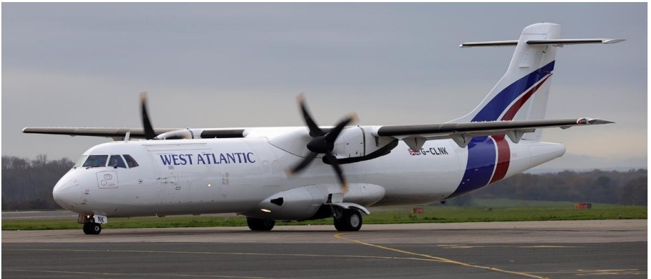
G-CLNK ATR 72-211F West Atlantic 05/11

05/11 G-FLYK Beech 200 Super King Air f Haverfordwest t/f Local flight t Haverfordwest, G-CLNK ATR 72-211F f/t East Midlands West Atlantic, G-HUBB Partenavia P68B f Aberdeen t Bristol Ravenair, G-OCCX Diamond DA-42 Twin Star f Doncaster Sheffield c/t Aeros Global