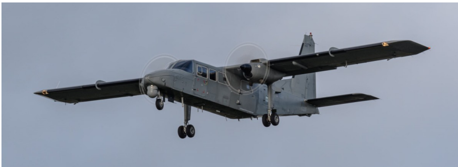
ZG997 BN-2T Defender R2 12/11