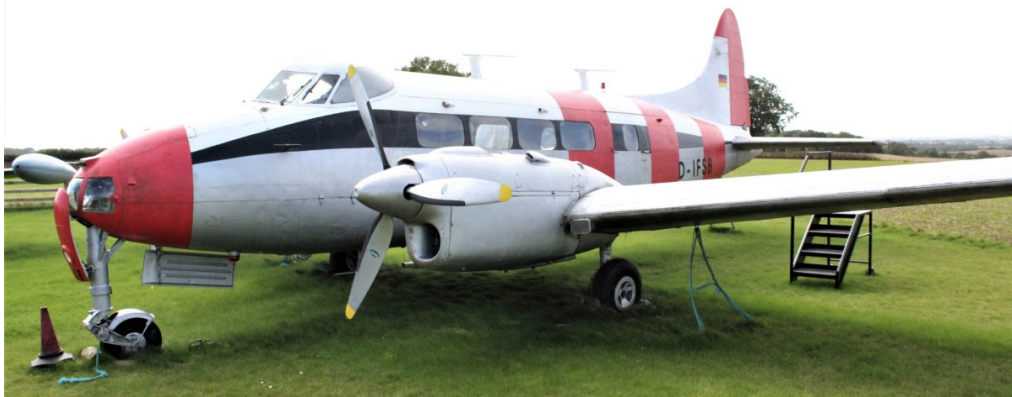
D-IFSB DH104 Dove