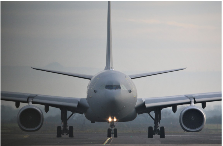
ZZ343 Airbus Voyager KC2 28/11

27/11 ZE707 BAe 146-200 C3 f/t Northolt 99RAF - 32 Sqdn, CS-DXG Ce560XL Citation XLS f