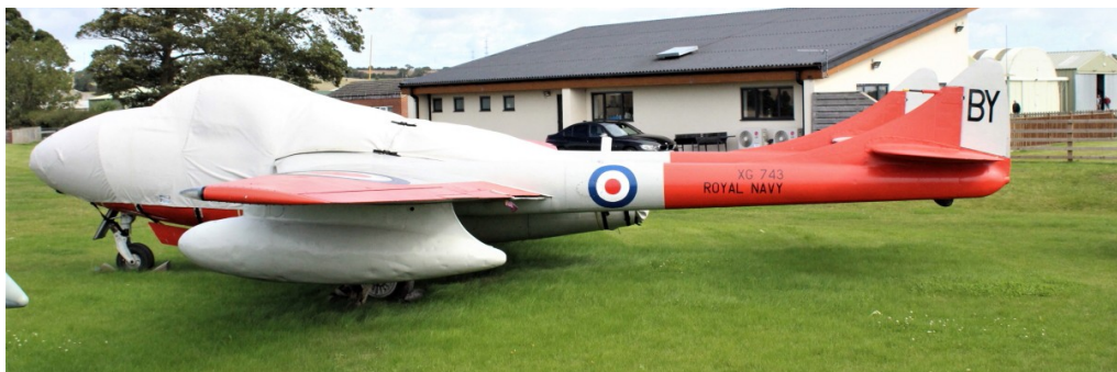
XG743 DH115 Sea Vampire