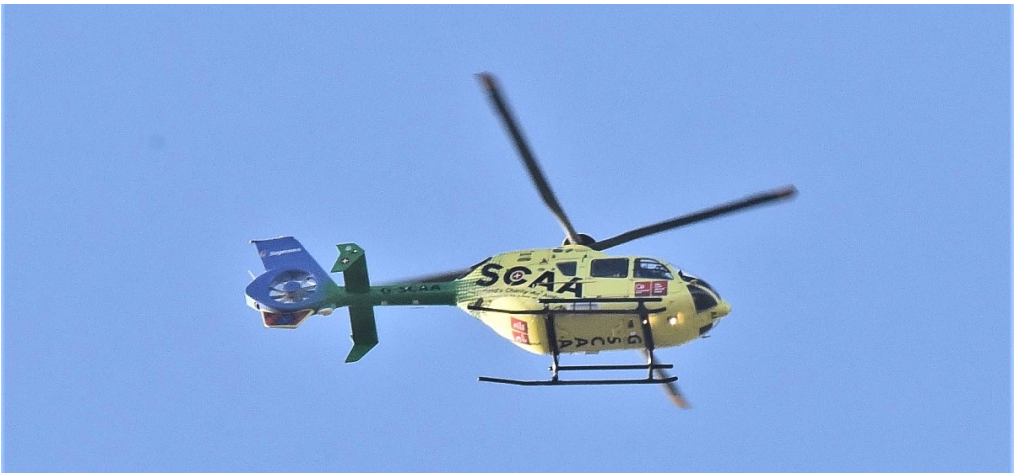
G-SCAA Eurocopter EC135-T2 23/11