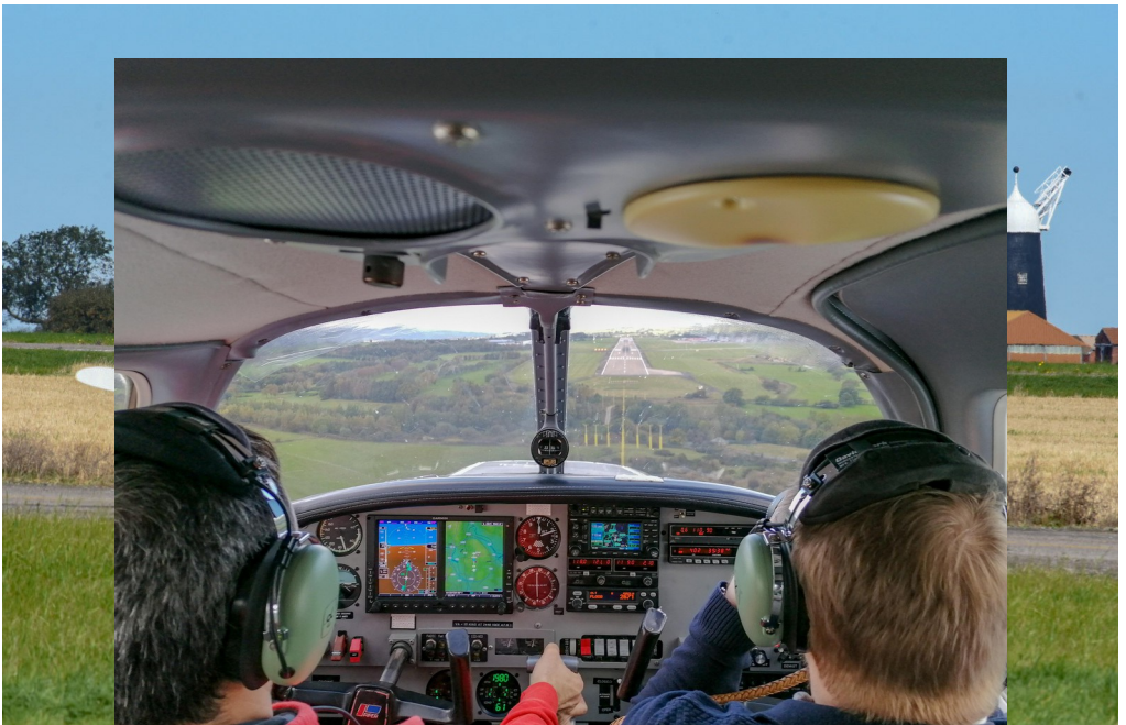
Landing at LBA

One of the books we bought was about aircraft wrecks and sites throughout the UK. We came across a USAF B29 Super Fortress wreck at Bleaklow known as the Overexposed crash site. This is probably one of the more poignant trips we took. Firstly we took a drastic detour and after an hours walk through wet boggy marshland we found the site, quite a sombre site, but amazingly a lot of wreckage there to see. With the engines