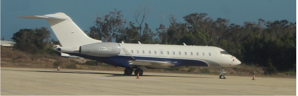
9H-TDI BD700 Global 5000 Taken at PFO 30/9

BD700 Global 5000 9H-TDI arr 09:39 fr Antigua dep 11:54 to Luton, TBM700 N700CS dep 10:37 ret at 11:19, PA-32 Cherokee Six G-WINS arr 11:49 fr Jersey ret at 13:02, Cessna 525A CJ2 G-SONE arr 12:31 fr Jersey dep 15:46 to Bristol,