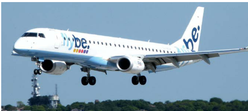
G-FBEM Embraer ERJ.190-200LR of Flybe. Pictured on 24/05/09 just before touchdown on Runway 32 at LBIA