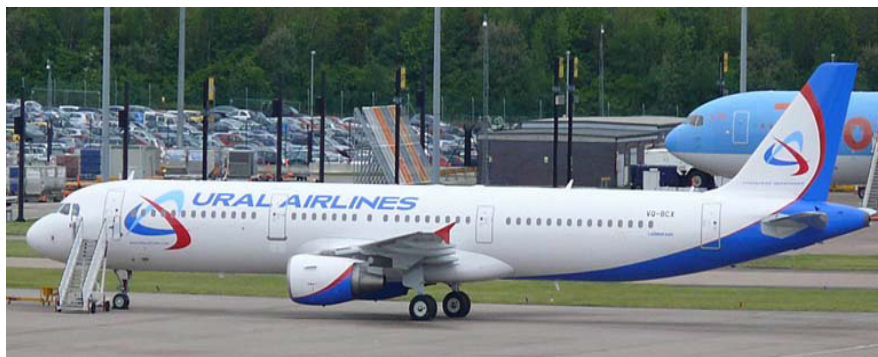
VQ-BCX Airbus A.321-211 Ural Airlines Pictured on 04/05/09 by Clive Featherstone awaiting delivery at Manchester having formerly been operated by First Choice as G-OOAV