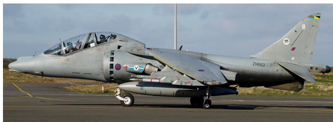
ZH663/111 Harrier T.10