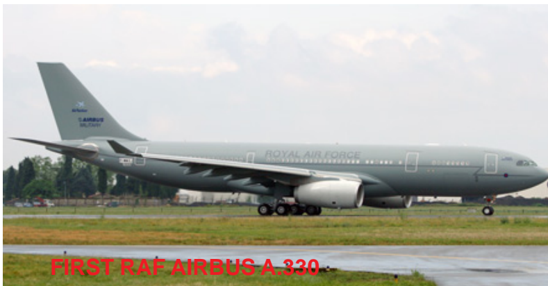
ZZ330(c/n 1033) pictured at Toulouse following painting, still with test registration F-WWKJ taped over the serial. The aircraft first flew on 01/06/09 and is currently at the EADS facility in Madrid for fitting out.

Many years ago RAF Wyton was the main base for the RAF'S Canberra fleet and Nimrod R.1 The Nimrods left many years ago for Waddington and the Canberra's have now been scrapped but a Canberra PR.9 XH170 is on display at the main gate which is along the B1090