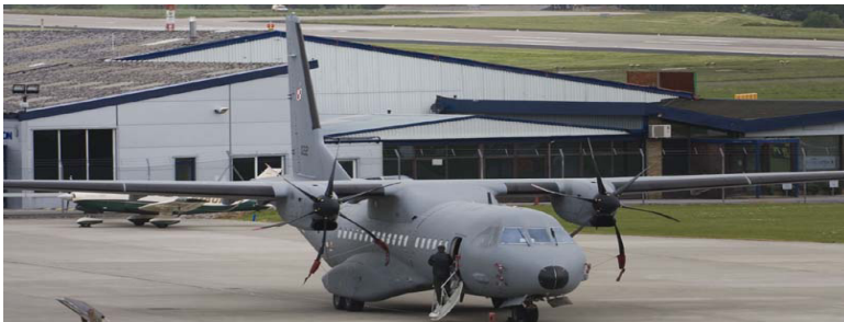
022 CASA-295M operated by 8.BLot Wing of 13.eltr Squadron, Polish Air Force based at Krakow/Balice

Sunday May 17th saw a couple of interesting military arrivals and Simon Titchmarsh was there to photograph both aircraft:-