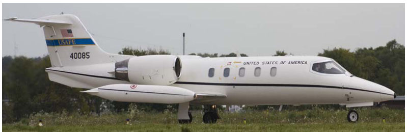
84-0085 C.21A(Lear Jet 35A) operated by 86th Air Wing, 76th Air Squadron, USAF/Europe based at Ramstien AFB, Germany