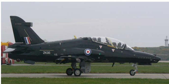
ZK015 Hawk T.2 of 19 Squadron at RAF Valley, Anglesey