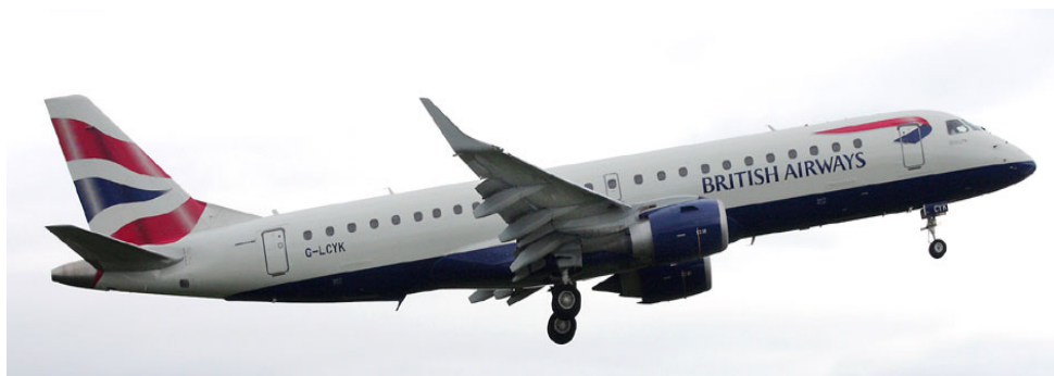
Cityflyer Express Embraer 190 G-LCYK departing to Naples, 21/5

GENERAL AVIATION:- SR.20 N40GD f/t Haydock Park(1255/1330) and again 1602/1615. Hughes 369E G-JIVE f/t Shelf(1716/1737). Diamond DA.40D G-OCCH arrived from Coventry at 1633 and is a new resident for Innovative Aviation, living in the Multiflight/West hangar.