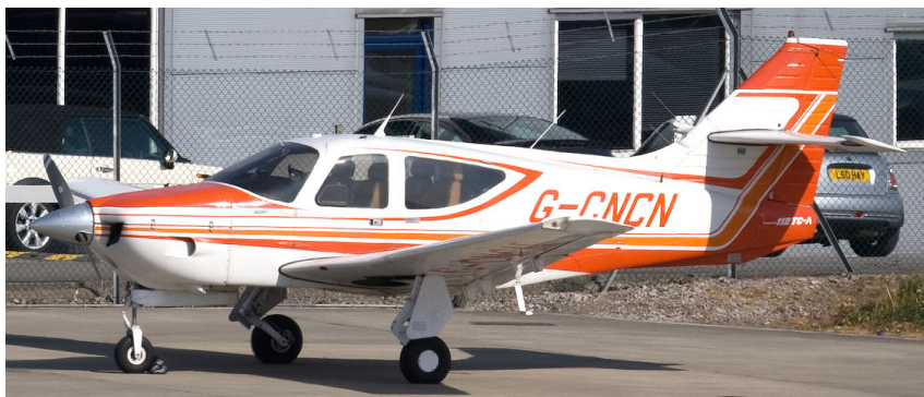
Colourful Commander 114 G-CNCN parked on Multiflight/East apron, 18/5

GENERAL AVIATION:- King Air 90 M-ONTI f/t Guernsey(0936/1031). King Air 200 G-BYCP (Lonex 85CP) from Biggin Hill(1305) to Stapleford(1357). King Air 200 G-BVMA from Cardiff(1657) to Dublin(1738).