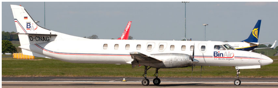
Metroliner D-CNAG departing to Norway on a freight flight, 4/5

MILITARY :- Grob Tutor G-BYVJ (CFN 05), ILS and overshoot(1247), f/t Church Fenton.