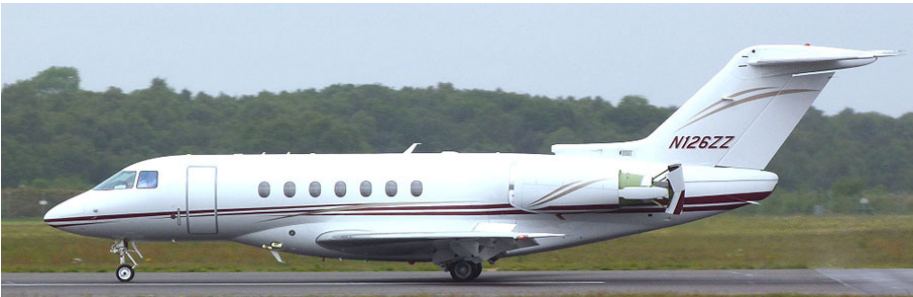
First visit of type, Hawker Horizon N126ZZ operated by Meir Aviation Inc.