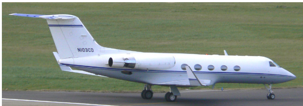
Gulfstream 3 N103CD taxiing onto Multiflight/East apron on 3/5 for an overnight stay

GENERAL AVIATION:- DA-42 Twin Star G-DSKY (White Knight 06/02) from Gamston(1152) to Denham(1301). PA-34 Seneca G-VVBK (Ravenair 47T) ILS and overshoot(1359), f/t Liverpool. Hughes 369HS G-OGJP , which had been parked on Multiflight/East for 3 days, departed to Malton at 1430.