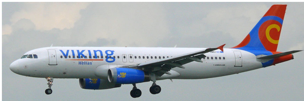
A.320 SX-SMU of Viking Hellas on final approach to Humberside

3/5 EC-HCH Metroliner(OVA 612), G-HUBB P.68B(Raven 03), G-RVRZ Aztec(Raven 06) 5/5 G-FPLE King Air 200(Calibrator 218) 9/5 PH-DYN P.180 Avanti(Jet Netherlands 710), M-TSRI King Air 90(Ambassador 909A) 10/5 M-ONTI King Air 90, M-OTOR King Air 90, G-KDMA Citation V(Eastflight 08J) 11/5 G-OAMB Citation Mustang, G-UTTS R.44, N44NE Cessna 414A 12/5 D-ISIX King Air 90, G-AXJX PA-28 15/5 M-ICRO Citationjet 2 17/5 EC-HCH Metroliner(OVA 612), ZK458 King Air 300(Cranwell 67, ILS) 20/5 D-FGAG Pilatus PC-12 24/5 D-IWIN Citationjet 2(Silver Cloud 231, n/s) 27/5 D-ILHD Citationjet(Lufthansa 9893, training)