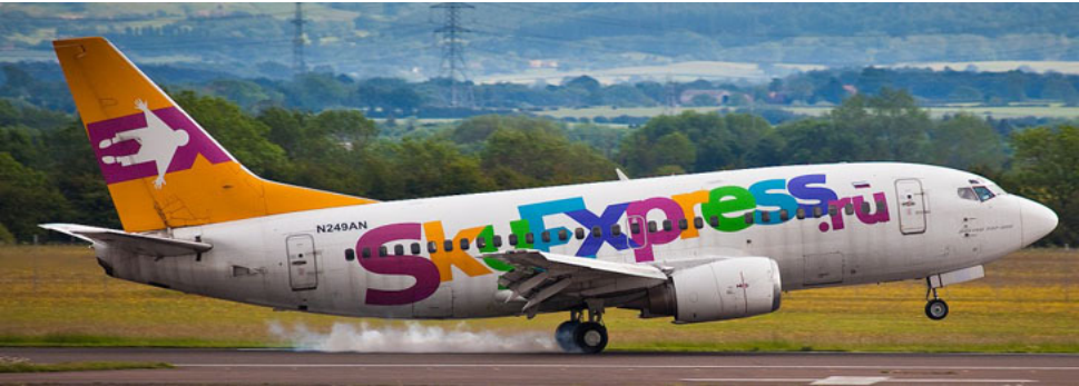
Aircraft 1 - N249AN Boeing 737-53A c/n 24921 first flown 29 November 1990

Sycamore Aviation, have set up a branch at Teesside, they part out and then scrap the remaining airframes. Initial work will be carried out on stand 9 before moving the aircraft landside to be broken up inside hangar 4 (this landside on left hand side as you pass the tower).