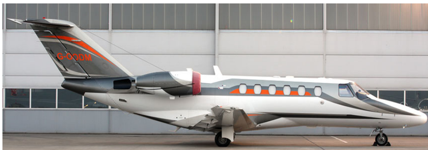
Citationjet 2 G-ODDM of Edinburgh Air Charter visited on 27/5(Robert Burke)

EXECUTIVE JETS:- Challenger 604 OE-INN (Vista Jet 652) from Le Bourget(0711) to Palma(1013). Challenger 300 M-NEWT (Bizjet 1WT/2WT/3WT) from Luton(0801) to Northolt(0924), return 1856 and night stop until 28/5, to Faro(1658).