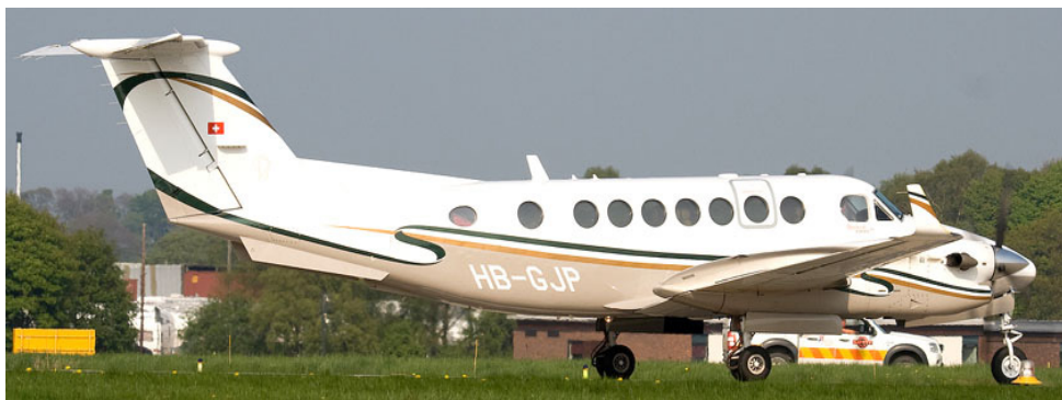
King Air 350 HB-GJP operated by Nestle is a regular visitor to LBIA, 26/5

GENERAL AVIATION:- Twin Squirrel G-IFBP from Kirkby Overblow(1243) to Huggate(1340). Be.76 Duchess G-BXXT f/t Humberside(1426/1443).