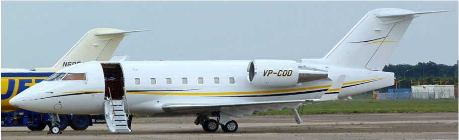
Fresh from the paint shop, Challenger 604 VP-COD destined for Iceland Frozen Foods