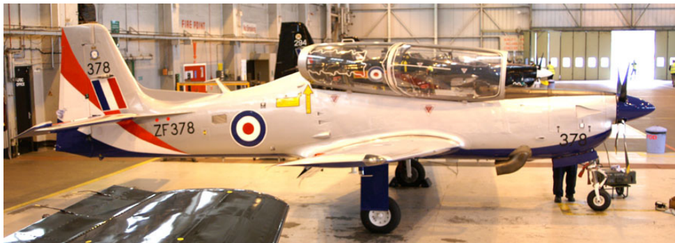
Tucano ZF378 painted in the 2011 Display colour-scheme at Linton

and goes followed by a very vigorous display. The two "Fly Navy" Hawks departed to Culdrose at 1700.