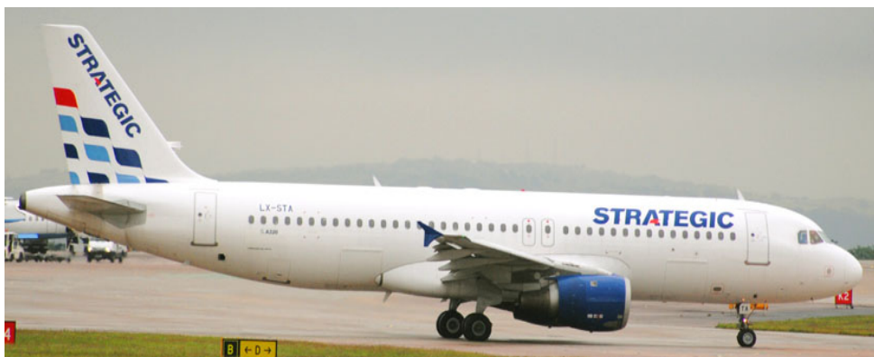
LX-STA Airbus A.320, Strategic Airlines, Manchester 13/06/11(Steve Lord)