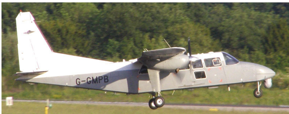
G-GMPB BN.2T Defender 4000, Greater Manchester Police, 06/06/11(Alan Sinfield)