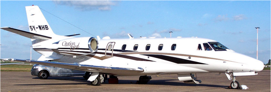
Kenyan registered Citation XL 5Y-WHB spent most of the month with Kinch Aviation

The airport received some very interesting visitors during May and the following were captured by Clive Featherstone.