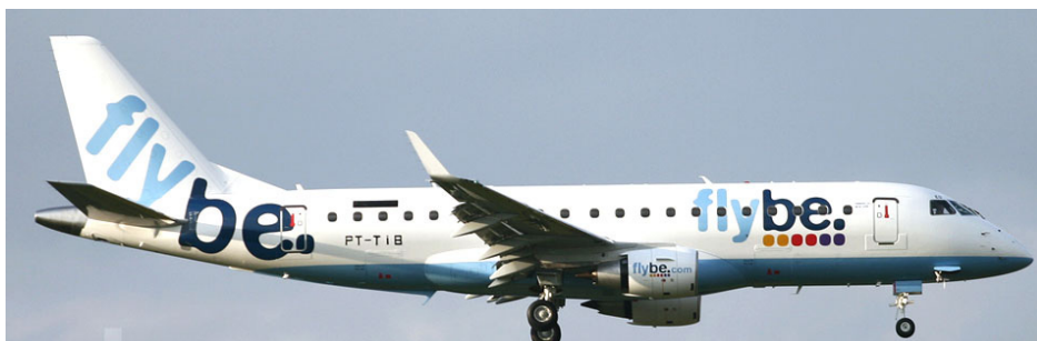
The first Embraer 170 for Flybe, to be registered G-FBEO , for delivery in July

Jet2. is to dispose of B733s G-CGET (27455) & G-GDFA (24011), Former TNT B733 OO-TNF (24131) was ferried from Brussels to Norwich on 25/6 & will become G-GDFE with Jet2.