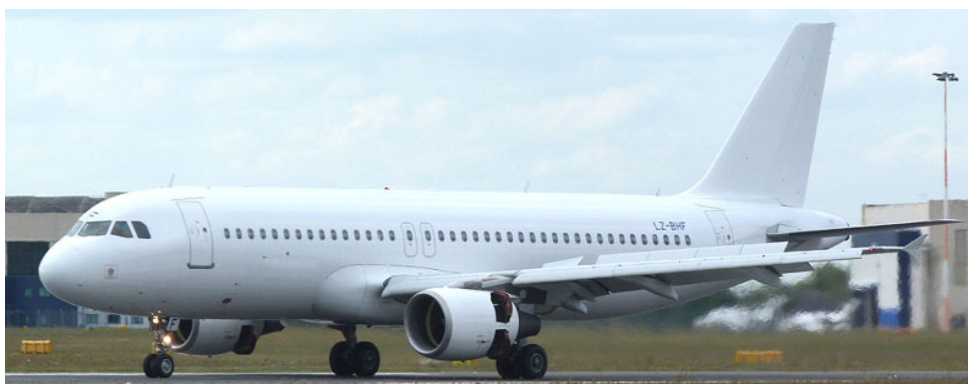
The "new" A.320 for BH Air has a truly inspiring colour scheme!