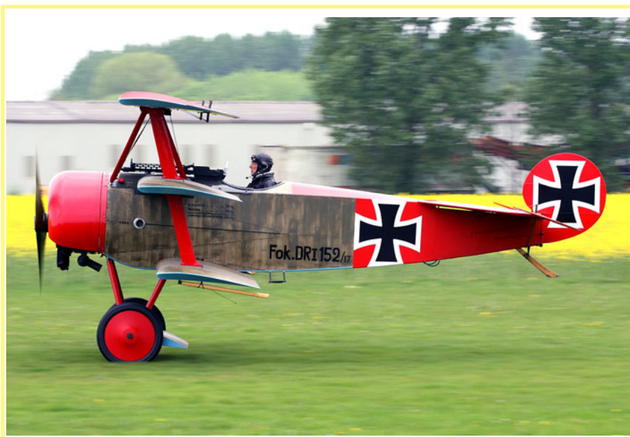
G-BVGZ Fokker DR.1 Replica Brighton Easter Fly-in, 24/04/2011