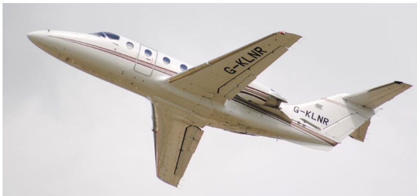
Hawker 400XP G-KLNR departing Runway 32, 10/5

GENERAL AVIATION:- Cherokee Six G-ELDR f/t Oxford(1048/1734). Be.76 Duchess G-BXXT ILS and overshoot(1150), f/t Humberside. King Air 200 G-MEGN from Dublin(1228) to Belfast City(1809).