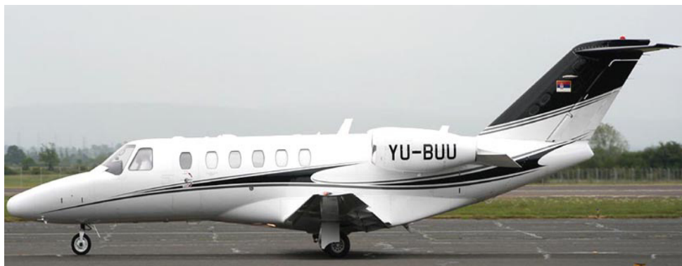
Operated by Air Pink Citationjet 2 YU-BUU is seen here parked on the apron at Teesside

spend more time here now. Visitors 11.25 – 13.50hrs. G-ASAU MS.880B, G-AWJE T.66, G-AXPB B.121, G-BARH Beech C23, G-BCSL DHC.1, G-BJDF MS.880B, G-BNSL PA-38, G-BOZI PA-28, G-BTWF/WK549 DHC.1, G-BULO Luscombe 8F, G-BVGW Luscombe 8A, G-BWCY Rebel, G-BWNY AMT.200, G-CCCJ HN.700, G-CCCN R.3000/160, G-CCPX DA.40D, G-CCSR EV.97A, G-CDFL CH.601UL, G-CDFP Sky Ranger 912, G-CDLD Quik, G-CDRV RV.9A, G-CDTL Jabiru J400, G-CDYY Pioneer 300 G-CESA DR.1050, G-CFIA Sky Ranger 912S, G-CMED TB.9, G-CUTE MCR.01, G-DJET DA.42, G-EHGF PA-28, G-ENVY Blade 912, G-GBRB PA-28, G-GIRY AG-5B, G-HULL F.150M, G-IGHT RV.8, G-JEEP EV.97A, G-OPAZ PL.2, G-OSLD Europa XS-TG, G-PARI 172RG, G-PBAT Sportcruiser, G-RRVX RV.10, G-RVDR RV.6A, G-RVNS RV.4, G-STVT Sportcruiser, G-WOOO Sportcruiser, G-XRVX RV.10. Visitors 5.6 12.00 – 14.00hrs. G-ATDO Bo.208C, G-ATEW PA-30, G-BJDF MS.880B, G-BXMV SF.25C, G-CBIN Minimax 91, G-CDON PA-28, G-CFFJ CTSW, G-CMED TB.9, G-EKOS FR.182RG, G-GURU PA-28, G-IGHT RV.8, G-KITH Pioneer 300, G-LORC PA-28, G-RIVT RV.6, G-RJMS PA-28R, G-RVNS RV.4, G-SACT PA-28, G-SELL DR.400, G-WLGC PA-28.