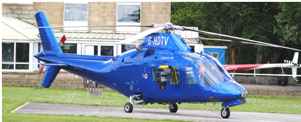
The aptly registered Castle Air A.109 Camera ship G-HDTV, Coney Park in early May

Cherry Willingham:- Thruster T.600N G-ORAM have moved out, following sale to new owners In Armagh, N. Ireland.