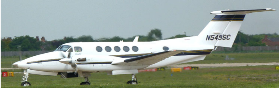
King Air 200 N549SC(ex G-MAMD), carrying out engine runs prior to delivery to the USA