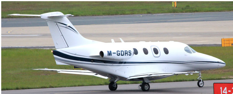
Premier 1 M-GDRS, a recent addition to the Manx register visited on 19/5(Rod Hudson)

GENERAL AVIATION:- TB.10 Tobago G-VMJM f/t Enstone(0736/1718), n/s. King Air 200 G-KVIP (Prestige 647) from Valencia(1922) to Biggin Hill(2013).