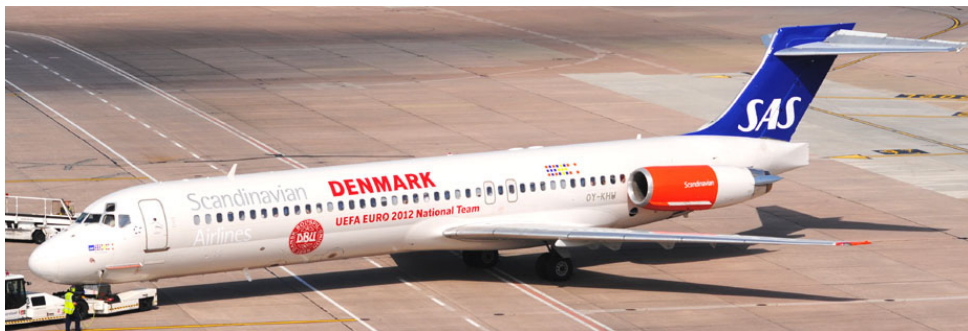
MD-80 OY-KHW of SAS at Manchester has added titles for Euro 2012(Steve Lord)