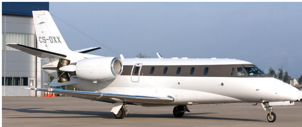
Netjets Citation XL CS-DXX taxiing from Multiflight/East on 7/7

MILITARY:- Sea King XZ599 (SRG 128) ILS and overshoot(1152), f/t Leconfield.