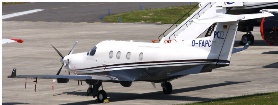
Pilatus PC-12 D-FAPC parked on Multiflight/East Apron, 25/5

EXECUTIVE JETS:- Lear Jet 45 N66SG (Bizjet 1SG/2SG) from Farnborough(1100) to Belfast City(1121).