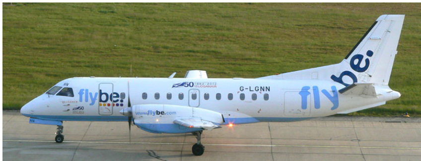
Now a regular sight at LBIA, Loganair SAAB 340 G-LGNN is seen taxiing onto stand.

MILITARY:- Tucano ZF243 (LOP 64) ILS and overshoot(0911), f/t Linton. Sister-ships ZF204 (LOP 92) and ZF205 (LOP 72) carried out ILS and overshoots at 1202 and 1225 respectively.