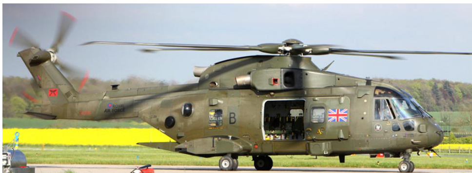
Pictured at Humberside, Merlin ZJ118 visited Coney Park, 1/5.