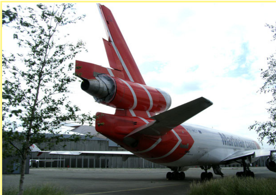
PH-MCY McDonnell/Douglas MD-11F Martinair Cargo Amsterdam(In Storage)