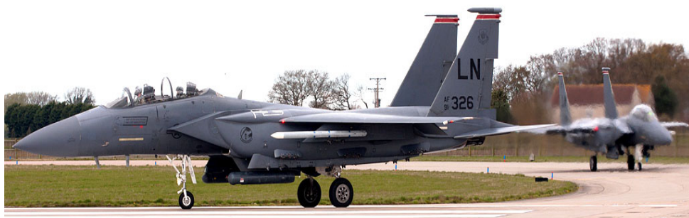
Robert Burke, on a recent visit to Coningsby caught this F-15E Fighting Eagle 91-326 and colleague lining up for departure home to Lakenheath