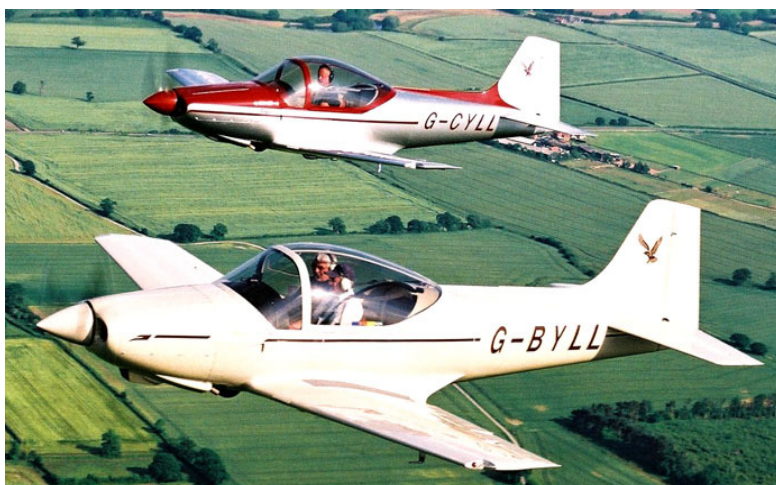
Brighton's resident Falcos, picture from the back seat of the YAK52

OUTSIDE PARKING/TEMPORARY RESIDENTS G-ASIB F.172D, G-BDGM PA-28, G-BGAX PA-28 and G-BOIY 172N have been present throughout the period of this report. G-BBJX F.150L t Sherburn for maintenance 2.6 returning on 8.6. G-XTRA EA.230 was here from 20.5 to 26.5 then 14.6 to 17.6 whilst the owner used his other mount G-BVXJ. D-EARY FWP.149D (057) t Abbeyshrule 31.5 with the pilot returning the same day with D-ECXA Sbach 342 (109) which was still present 17.6. D-EFUC 172S (172S8003) arrived sometime week commencing 21.5 and was still present 17.6. G-LMAO F.172N departed sometime week commencing 21.5 presumably for further duties at Enniskillen.