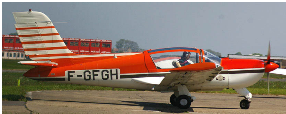
Rallye F-GFGH is nominally based at Bagby and in France.

EXECUTIVE JETS:- Lear Jet 45 N66SG (Bizjet 1SG/2SG/3SG/4SG) from Luton(0748) to Dublin(0816), from Dublin(1406) to Northolt(1426). Citationjet D-INFS from Dortmund(1725), n/s.