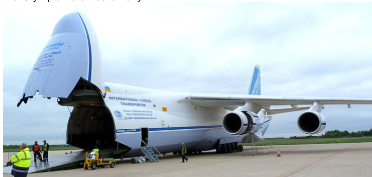
The mighty AN-124 UR-82027 parked on the apron at Robin Hood awaiting its freight.

YORK RACE COURSE:- On 6/6 aptly registered Agusta A.109S G-FRZN, operated by Iceland Frozen Foods was noted departing home to Hawarden late afternoon. Visiting on 15/6 were Hughes 369E G-JIVE and EC.120B G-DEVL. Performing a fly past over the National Railway Museum on 2.6 were AB910/RF-D Spitfire VB, LF363/YB-W Hurricane IIC and PA474/HR-W Lancaster B1 of the BBMF. The National Railway Museum were unveiling an engine dedicated to the BBMF. Operating over the Racecourse on the evening of 19.6 were G-HPOL MD.900 and G-TAKE AS.355F1 in connection with the Olympic Torch ceremony