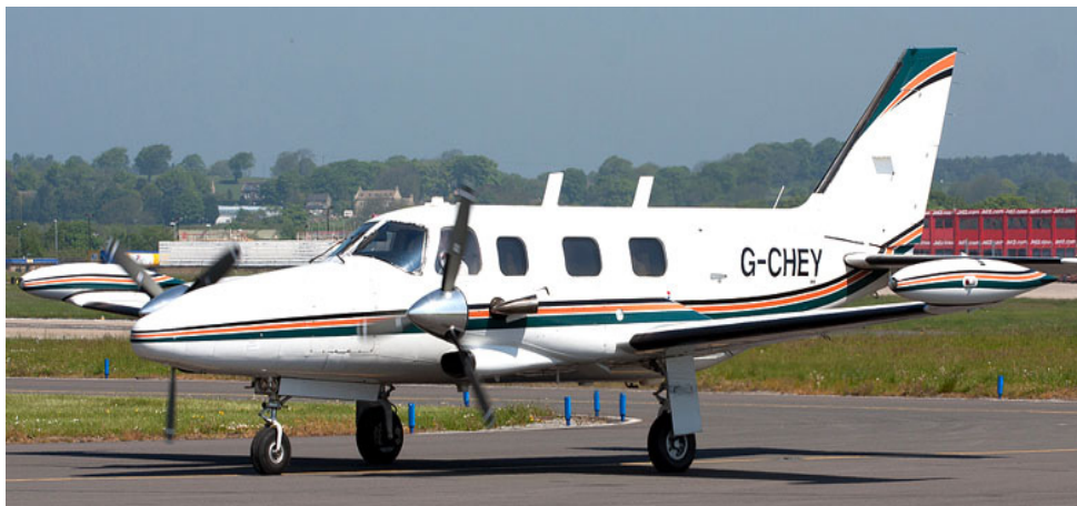
PA-31T Cheyenne G-CHEY operated an ambulance flight from Belgium, 3/5(Robert Burke)

GENERAL AVIATION:- Sikorsky S.76C G-JCBJ (JCB 2) from East Midlands(0739) to Rocester(0755), from Rocester(1501) to Uttoxeter(1528). King Air 200 G-PCOP (Gama(808) from Jersey(1057) to Luton(1122). PA-31T Cheyenne G-CHEY (Air Med 064) from Charleroi(1357) to Oxford(1500).