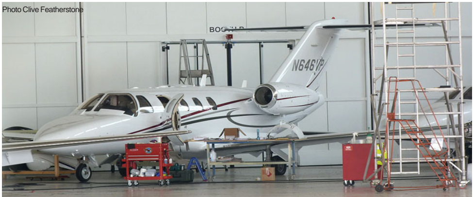
Citationjet N646VP in the Kinch hangar a Doncaster being prepared for delivery to USA