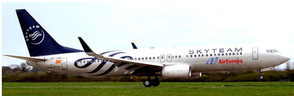
Boeing 737/800 EC-JHK of Air Europa, in Skyteam livery arriving at Teesside, 5/5

SUTTON BANK Of interest at the Vintage Glider Rally on 6.6. were BPV/BGA.1134 T.49B, BRA/BGA.1163 T.49B, BTN/BGA.1223 EoN 460 Srs.1, BUC/BGA.1237 T.49B, BUT/BGA.1251 T.43, G-BUGT T.61F and G-CJSZ ASK18 amongst the more usual inmates.