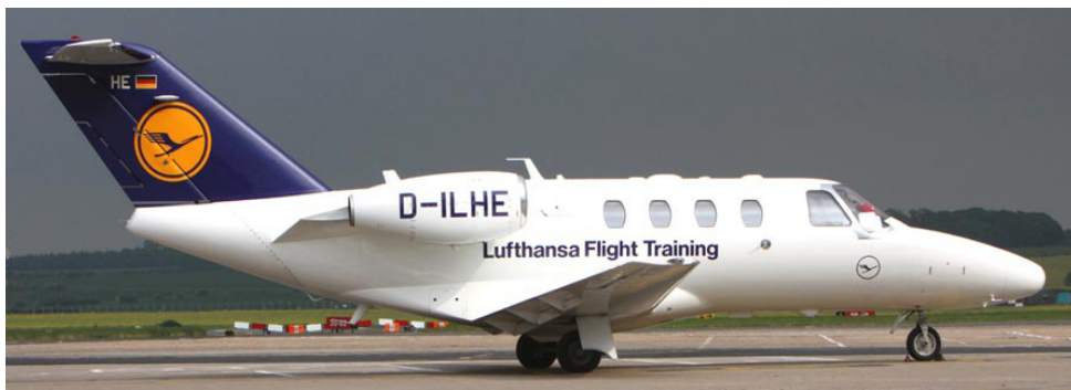
Citationjet D-ILHE passed through Humberside on a training flight, 30/5