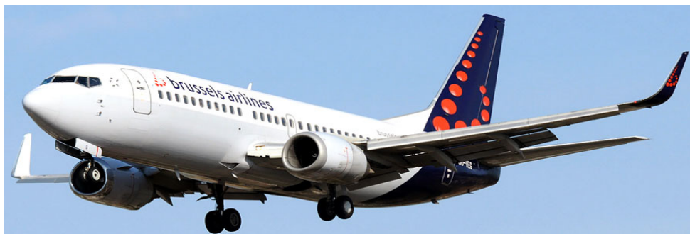
Jet2s latest 737/300 G-GDFL when previously operated by Brussels Airways, note winglets