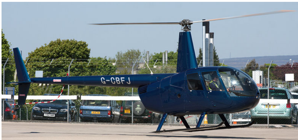
Scottish based Robinson R.44 G-CBFJ called in for fuel on 26/5(Rober Burke)

MILITARY:- Tucano ZF144 (LOP 48) ILS and overshoot(1207), f/t Linton