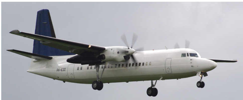
PH-KXX Fokker 50, Denim Air(ops for Flybe), Leeds/Bradford, 10/06/12(Paul Whincup)