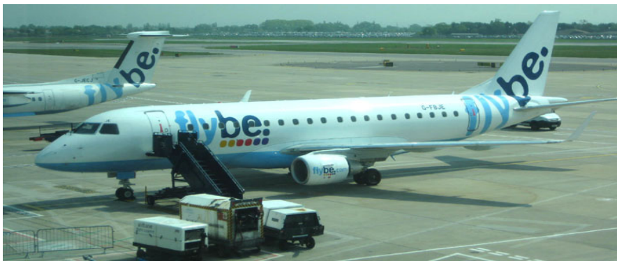
"a Womble awaits on stand at T.3"

Today's flight was to be a Flybe Embraer ERJ 195, affectionately known to we old lags of the spotting fraternity as a "Womble", with destination Milan Malpensa. So first time in T.3 (..... almost), first time in a "Womble" and first time to Malpensa. All very exciting. T.3 is used by Flybe and many of the gates had ERJs and Dash 8s from that airline. Ryanair has recently moved flights to this terminal and consequently one or two of their aircraft were also to be seen. Our check-in executive expressed some reservations about the expected change in passenger profile that the Ryanair transfer would bring. Another first for me was at Security, where I was invited to pose for the "Naked X-ray Scanner"..... luckily I was wearing clean underwear!