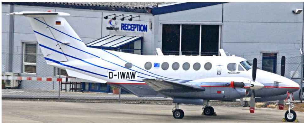
King Air 200 D-IWAW arrived on 21/5 to carry out local survey work

GENERAL AVIATION:- Cirrus SR.22 G-OOEX from Peterborough/Conington(0846) to Peterborough/Sibson(0958). Beech F.33 G-FOZZ f/t Blackpool(1052/1232) to Multiflight Engineering, n/s until 25/5. Twin Squirrel N766AM from Loughborough(1142) to Multiflight/Engineering, n/s to West Beacon Farm, near East Midlands(1009). Cirrus SR.22 G-DOLI f/t Blackpool(1301/1436).