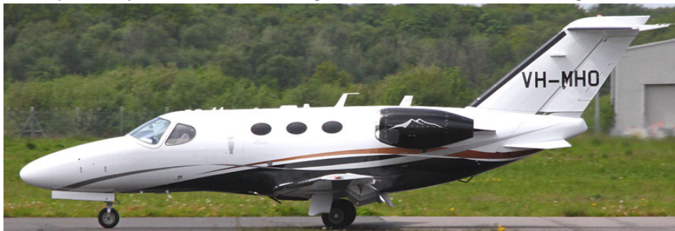
Citation Mustang VH-MHO(ex N363MU) destined for new owners in QueenslandAustralia