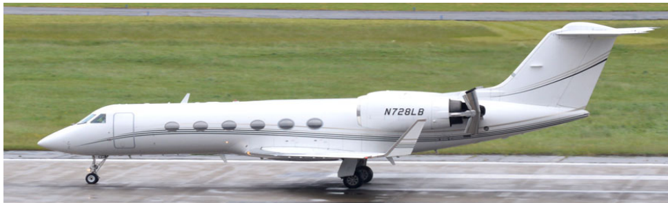
Gulfstream 4 N728LB arrived from Glasgow, 23/5 with Prince for his concert at the Arena