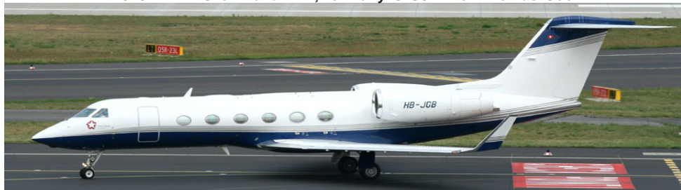
Gulfstream 450 HB-JGB is owned by NW NordWest SA