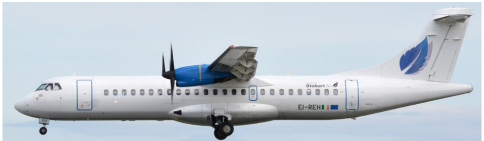
Former Aer Arran ATR-72 EI-REH painted in the colours of Stobart Air landing at Dublin