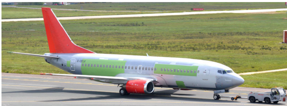
Boeing 737/300 G-CELX returned from Sofia on 14/5 following major repairs to the fuselage skin. Sistership G-CELI, having had similar attention flew straight to Manchester from Sofia later in the month, for repainting