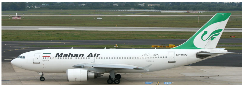
A.310 EP-MNO of Mahan Air, formerly G-OJMB of Thomas Cook