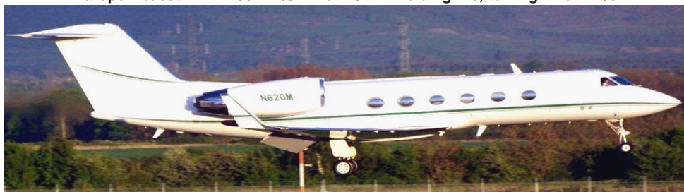
Based at Newport Beach, California, Gulfstream 4 N620M about to touch down on 14/5