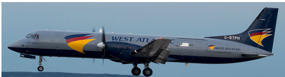
G-BTPH BAe ATP owned by Atlantic Airlines, flown in the colours of West, Air Sweden