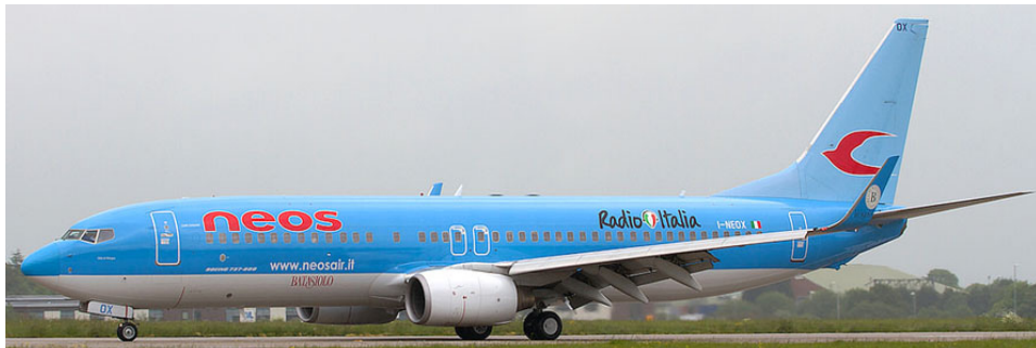
Jet2 leased Noes 737/800 I-NEOX on 22/5 to operate the Faro flight(David Blaker)

Additional flights:-28/5 PH-WXC(1489) arrived from Amsterdam, then positioned to Humberside.