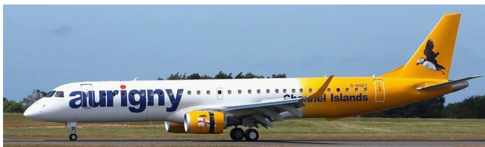
Aurigny has just taken delivery of a new Embraer 190 G-NSEY

Thomson and First Choice will also increase the number of destinations they serve from Doncaster Sheffield Airport to up to 20 with the announcement of weekly flights to Antalya and Zante starting next year. Mr Gill added: "In total Doncaster Sheffield Airport offers flights to more than 30 destinations around the world. "Before the recession hit the globe, our passenger figures were at their height in 2008 with 1.1m people using the airport. Economies across the world were affected by the economic climate and this led to a decline in people travelling from the airport." "We are now on a path of growth again, in line with the economy, and are pleased to see passenger numbers continue to grow." "A lot of hard work has gone into developing key relationships with airlines, both new and current, to maximise the potential of this fantastic airport." "The airport is still the UK's newest and is relatively young in its business model. We did not make a profit in the last financial year, nor did we forecast or expect one." Obviously our strategy is to work more closely with the incumbent airlines to develop their business and to attract new airlines to operate from the airport. "The new FARRRS link road which is progressing well will help in that bid as it will make access to the airport even easier from Sheffield and the surrounding areas." Our aspirations are for growth and we will continue to work to develop the airport and its offering to the Yorkshire public."