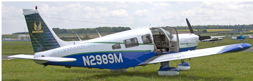
PA-32 N2989M is based on a farm strip at Middleham, North Yorkshire(Rich Grimley)

RUFFORTH/WEST:- Arriving 30.5 were D-EFPA PA-28 (2890077), D-EKKL DA.40 (40072) and D-EOCD 172S (172S9675) night stopping and departing late morning 31.5.