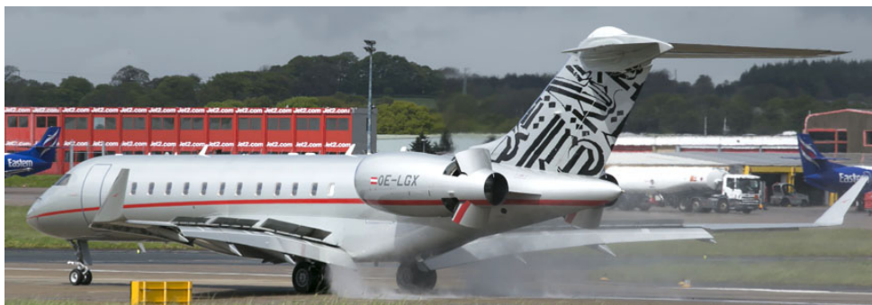
Vista Jet Global Express OE-LGX arriving on 10/5 for a charter to Tel Aviv