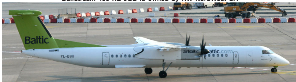
Dash-8-400Q YL-BBU of Air Baltic