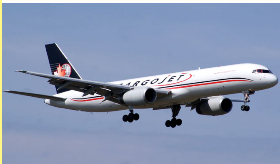
C-FKAJ Boeing 757/23A(PCF) of Cargojet Airways Landing at Toronto/Pearson, 18/05/14