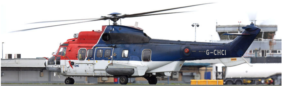
Super Puma G-CHCI of CHC Helicopters departing for Aberdeen on 9/5