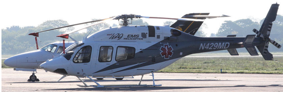
Bell 429 Global Ranger demonstrator N429MD designed for AirAmbulance use visited 14/5