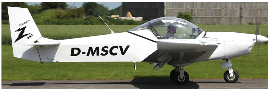
Roland Aircraft 602 D-MSCV, one of two of the type visiting Brighton on 1/6