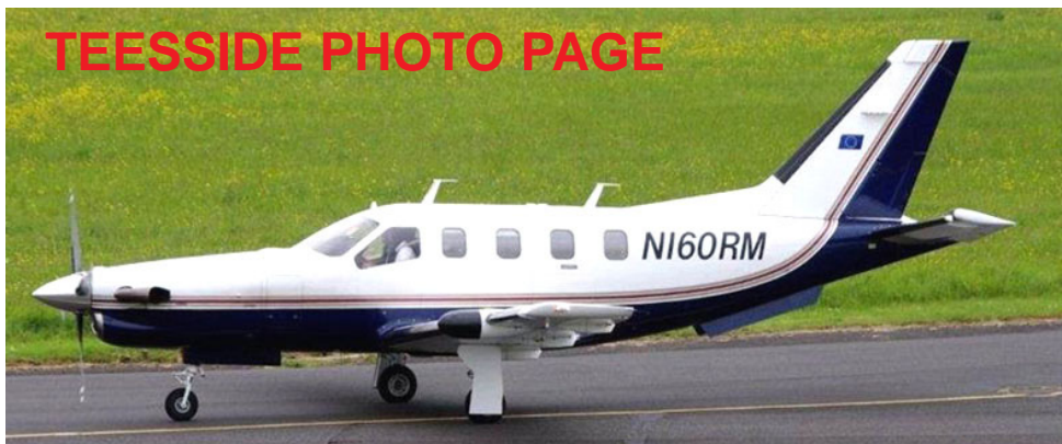
European based TBM-700 N160RM of TJ Air Holding Inc, taxiing in on 24/6