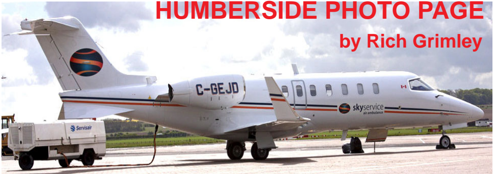
Lear Jet 45 C-GEJD of Skyservice arrived on an Ambulance flight from Montreal, 7/5