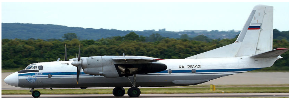
RA-26142 Antonov AN-26B of Pskovavia, one of five examples operated by the airline