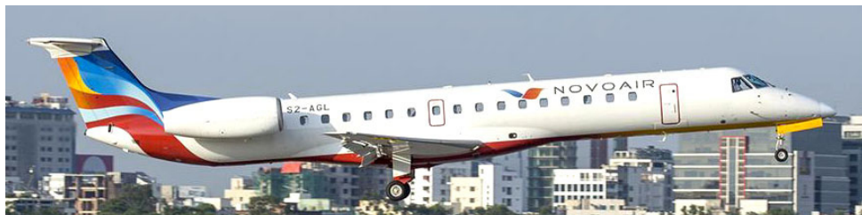
EMB.145 G-EMBP, which had been parked out at Humberside for some time, has now found a new lease of life operating for NOVOAIR in Bangladesh as S2-AGL

Land's End Airport is due to shut for more than two weeks next month as part of work to build hard-surface runways. The airport will close from 4 July to 20 July during which time Skybus services will fly from Newquay. Land's End had seen "severe disruption" over the last two winters as bad weather affected the existing grass runways, staff said. Airport managers wanted to go ahead with the resurfacing before the peak of the summer season, they added. Airport owner the Isles of Scilly Steamship Company said it wanted to complete the work in July rather than wait until the autumn and risk bad weather affecting the project. The company is the sole provider of commercial flights to the Isles of Scilly. Land's End Airport was closed to flights for three months in the winter of 2012/13 when the airfield became waterlogged. About £1.3m from the European Regional Development Fund has been confirmed for the £2.6m project, the airport's owners said