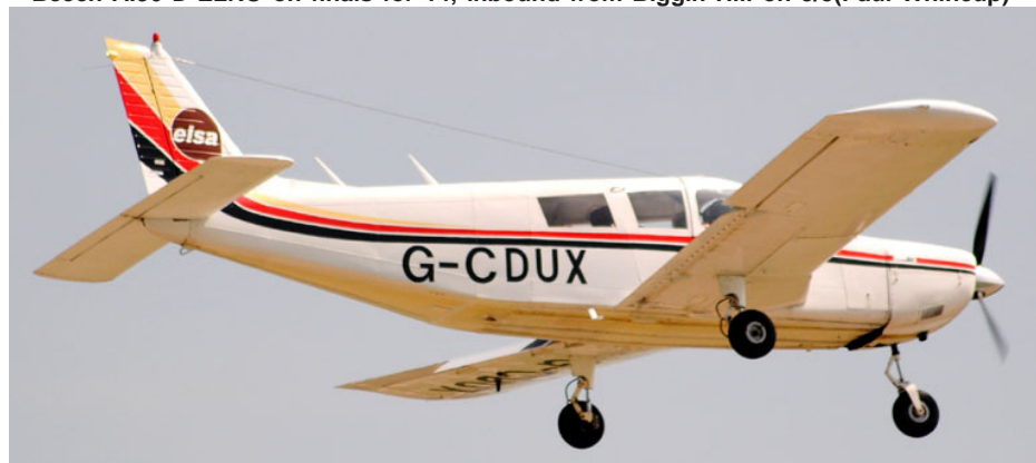
PA-32 Cherokee 6 G-CDUX arrived from its home, Ronaldsway on 19/5(Steve Lord)