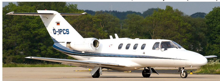
Citationjet 2 D-IPCS lining up for departure on Runway 14, 19/5(David Blaker)