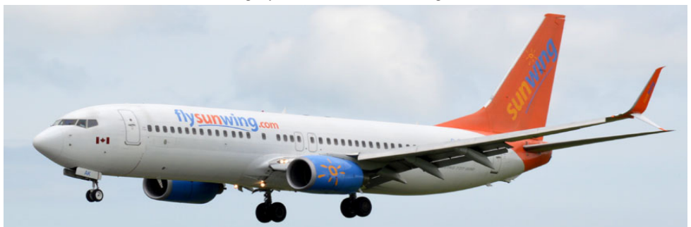
Boeing 737/800 C-PEAK of Sunwing is on loan to Thomson for the Summer season This aircraft is fitted with the Split Scimitar wing-tips, which can just be seen pointing downwards