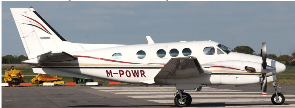
Operated by Northside Aviation, King Air 90 M-POWR was noted visiting on 2/5