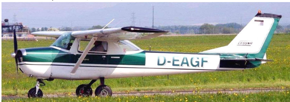
Despite its German registration Cessna 150F D-EAGF is UK based. It visited on 19/5