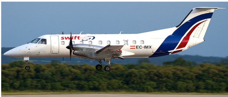
EMB.120 Brasillia EC-IMX of Swiftair, landing at East Midlands, 26/06/14(David Blaker)