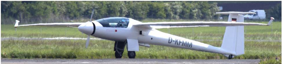
Stemme S-10VT motorglider D-KFMM taxiing onto the apron following its arrival on 14/5