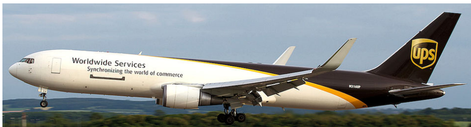
N316UP Boeing 767/300 of UPS, which has been with the airline since new in 1997