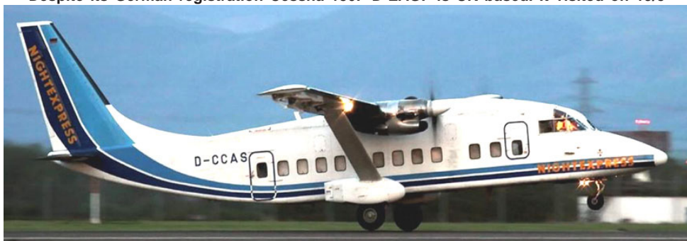
Departing into the evening gloom on 9/5 Shorts 360 D-CCAS(ex G-OLBA) of Nightexpress