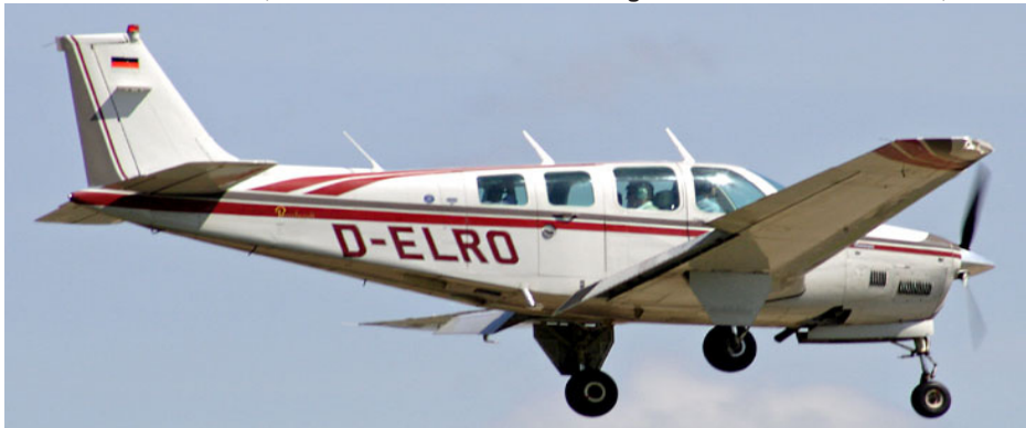
Beech A36 D-ELRO on finals for 14, inbound from Biggin Hill on 3/5