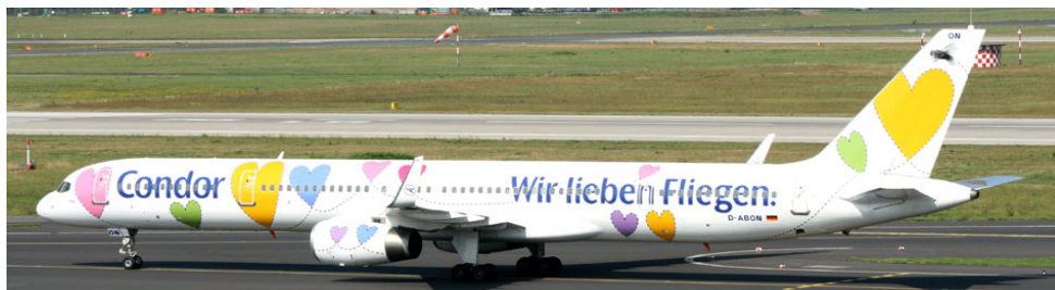
Boeing 757/300 D-ABON of Condor Flugdienst