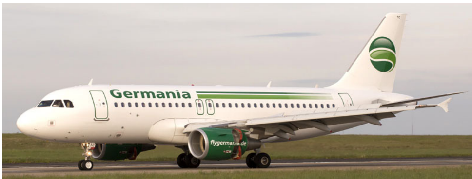
Germania operated 2x charters for Hurtigruten Cruises using A.319 D-ASTC

4/5 D-ASTC positioned in from Gatwick, then operated to Bergen(7136). 15/5 D-ASTC(7137) arrived from Bergen, then positioned back to Gatwick.