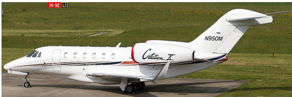
Citation X N950M arrived 18/5 and stayed until 25/5 before heading home to USA(D Blaker)