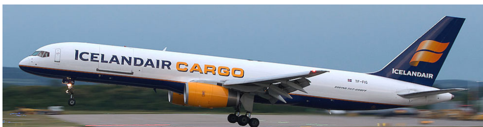
TF-FIG Boeing 757/200 of Icelandair, previously operated by Challenge Air Cargo , N571CA