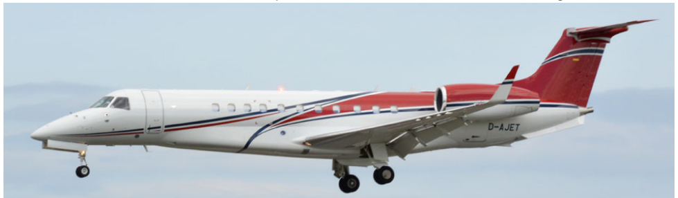
Embraer 145BJ Legacy D-AJET of Air Hamburg on finals for Dublin