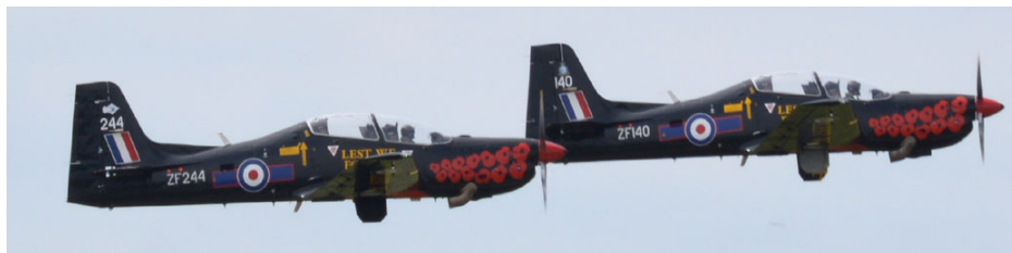
"Cordite Formation", Tucanos ZF140/ZF244 heading home to Linton-on-Ouse, 27/5