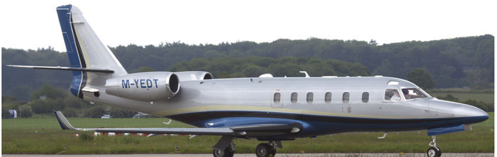
IAI Astra SPX M-YEDT of Opal Consulting visited on 23/7