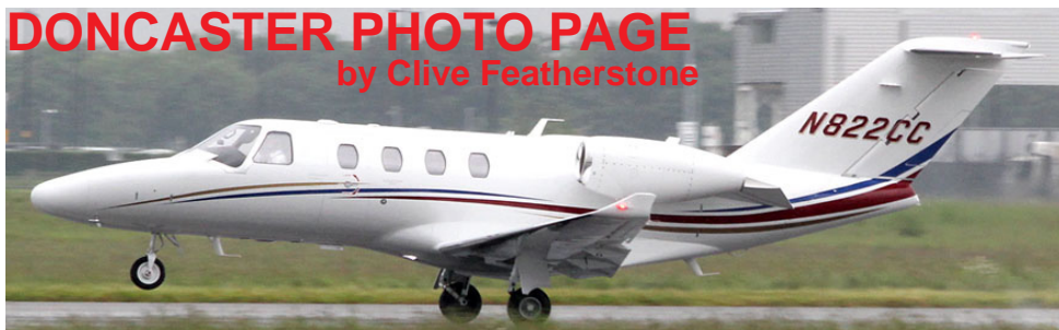
N822CC is the latest M2 version of the Citationjet, with new wings, visited on 24/5