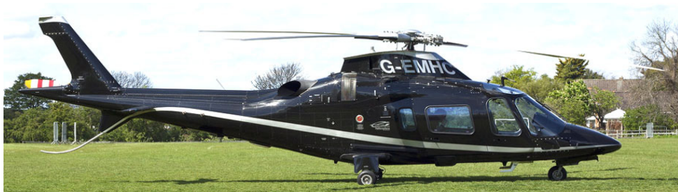
East Midlands Helicopters A.109E G-EMHC on a recent visit to Cleethorpes

1st ZD842 Tornado (FV) 8th ZH874 C-130 Hercules 14th ZJ707 Bell 412 Defence Helicopter Flying School (H) (T) 15th ZF485 Tucano (T) 19th G-CGKB G115 Grob Tutor 19th G-BYVO G115 Grob Tutor (FV) 23rd ZE701 BAe-146 32Sqn Royal Flight from Northolt (T)