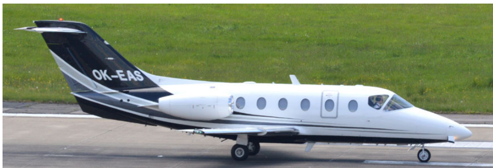
Beechjet 400A OK-EAS of Time Air, made two visits to LBIA toward the end of the month