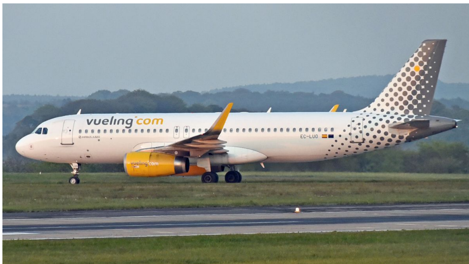
EC-LUO Airbus A320 Vueling 09/05 Rod Hudson

More photographs of airliners taken at LBA please!