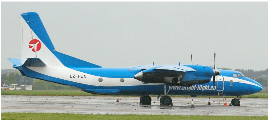
LZ-FLA AN-26 Bright Flight 18/05