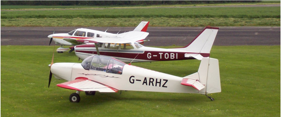
Visitors G-ODUD PA-28-181 f/t Gamston, G-TOBI F172K f/t Leicester and G-ARHZ D62 Condor f/t Gamston