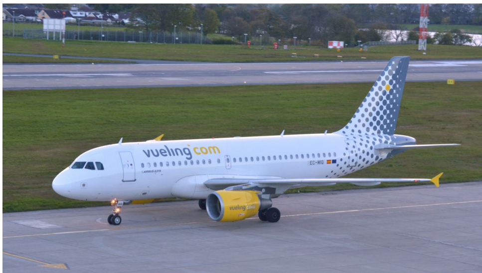
EC-MIQ Airbus A319 Vueling 02/05

Barcelona (8794/8795) :-2/5 EC-MIQ, 6/5 EC-JGM, 9/5 EC-LUO, 13/5 EC-LAA, 16/5 EC-KDT, 20/5 EC-MDZ, 23/5 EC-LQJ, 27/5 EC-LZE, 30/5 EC-LVA.