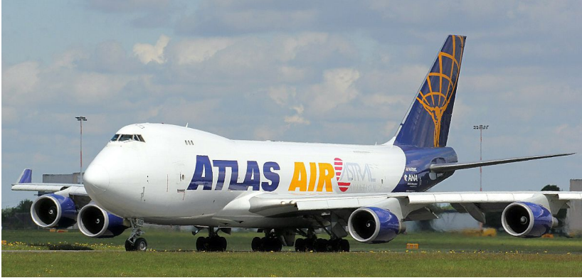
N408MC Boeing 747-400 Atlas Air 23/05