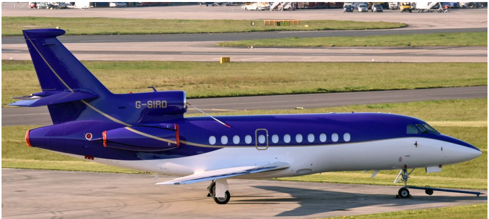
G-SIRO Falcon 900EX 09/05 Rod Hudson