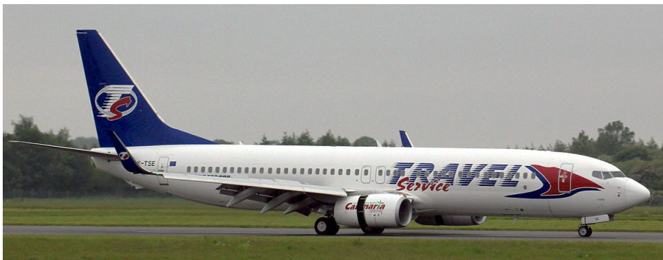
OK-TSE B737-800 Travel Service Doncaster 31/05/16 (Clive Featherstone)