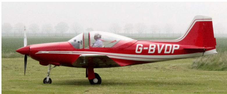
G-BVDP Sequoia Falco North Coates