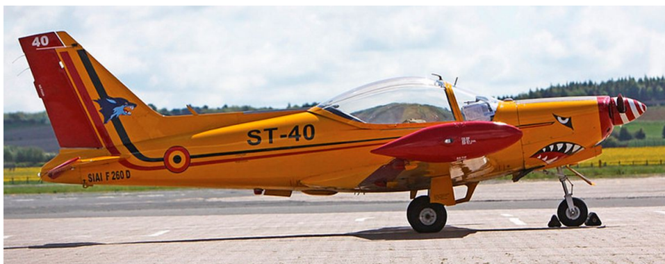
ST-40 Siyai SF260D Humberside 24/05/16