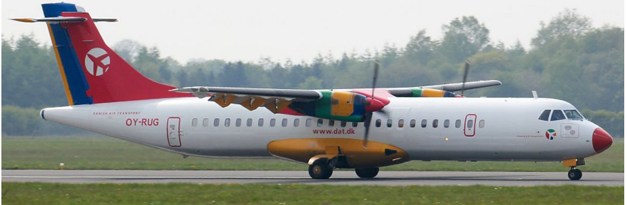
OY-RUG ATR-72 Storbart Air (On lease from DAT)