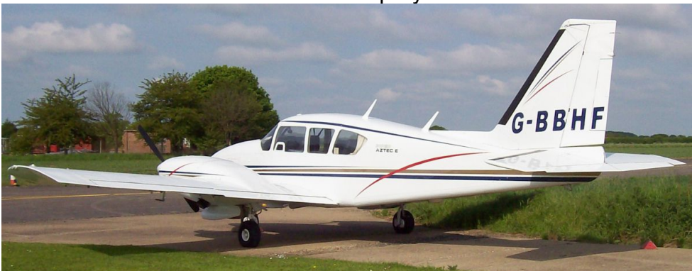
G-BBHF PA-23-250 actually out of the hangar which is very rare