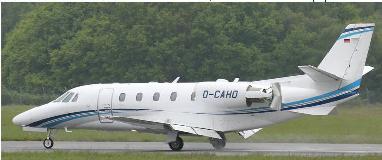
D-DAHO Citation 560XLS Air Hamburg