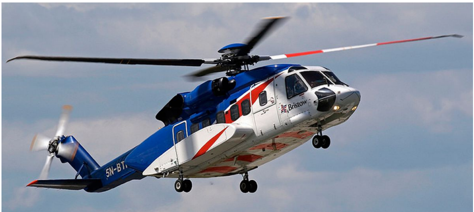
5N-BTI Sikorsky S.92 24/5