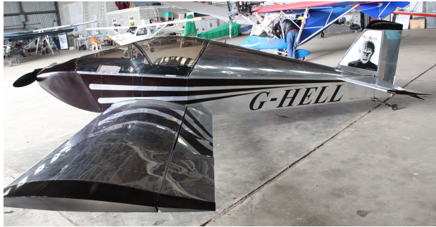
G-HELL Sonex 3300 North Coates

The prospects for more visitors was now looking unlikely so we took the decision to cut our losses and divert to Brighton Airfield near Selby.