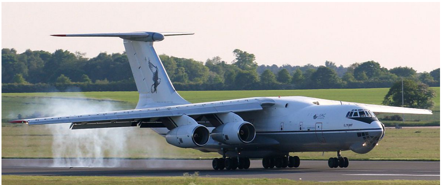
360/JY-JIC Ilyushin IL-76MF Jordan Intl. Air Cargo 28/05

(FV) First Visit. (T) Training. (H) Helicopter. (F) Freighter. (M) Maintenance