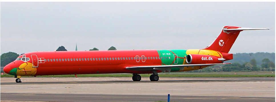
OY-RUE MD-83 29/5