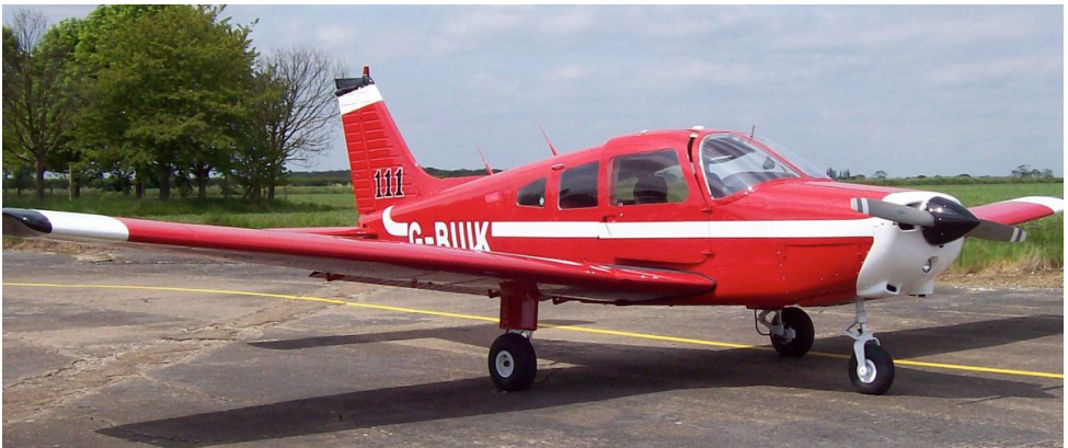
G-BUIK/111 PA-28-161 just before take off back to North Weald after its respray