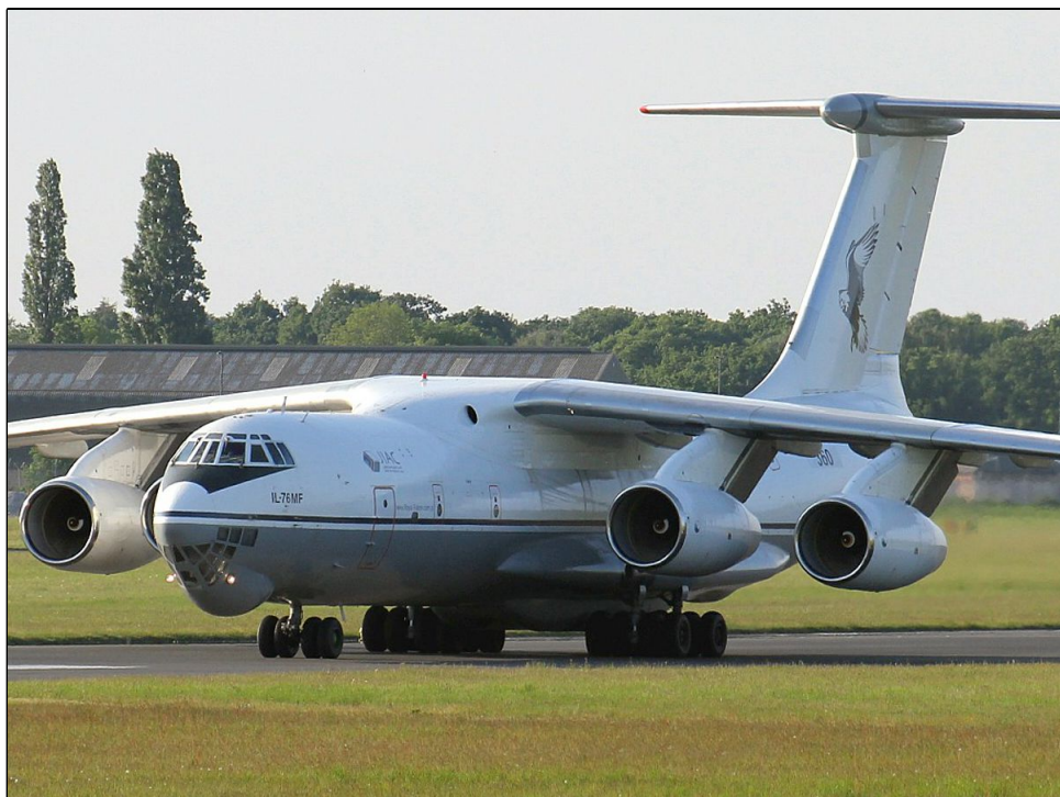
360/JY-JIC Ilyushin IL-76MF Jordan Intl. Air Cargo Doncaster 28 May 2016