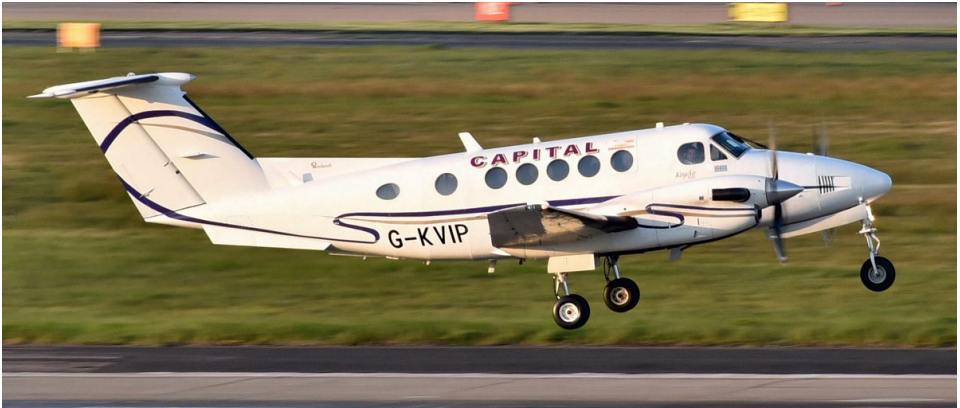
G-KVIP Beech 200 Super KingAir 09/05 Rod Hudson

Cessna 560XL D-CNOC arr 10:19 fr Gatwick dep 12:58 to Seville, Cirrus SR22 N220AD arr 11:56 fr Wellesbourne-Mountford for maint, BN-2T Defender ZG998 finally departs to Waddington 14:28, Global 6000 CS-GLB dep 15:50 to Luton as NJE150Q, Beech 200 Kingair G-KVIP arr 16:20 fr Menorca dep 18:56 to Exeter c/s Eagle 62V, Cirrus Sr22 N95GT arr 16:24, , Cessna 680 Sovereign G-CFGB arr 18:35.