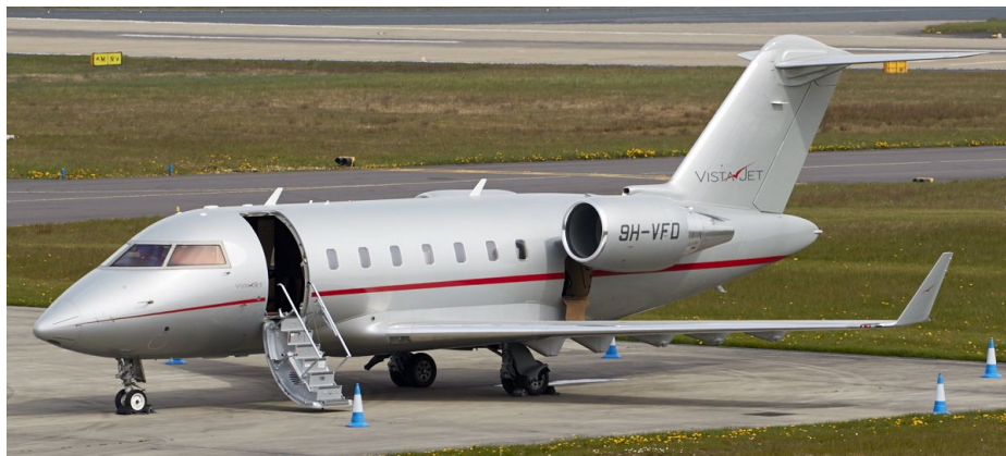
9H-VFD Bombardier Challenger 605 Vistajet 06/05 David Blaker

Global 6000 CS-GLB dep 06:05 to Malaga as NJE540E, Cessna 560XL CS-DXH dep 07:04 to Farnborough as NJE100H, Hawker 800 CS-DRN arr 08:51 fr Cannes as NJE211M dep 09:55 to Le Bourget as NJE930L, Challenger 605 9H-VFD dep 09:51 to Cork as Vistajet 570W, Cessna 550 G-IPLY arr 15:24 fr Southampton dep 16:12 to Staverton.