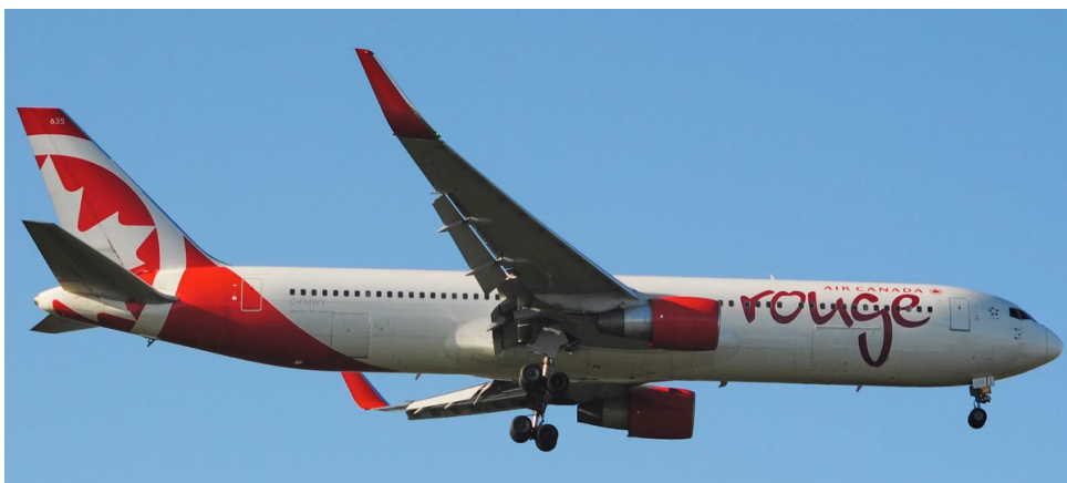
C-FMWY B767-333ER Rouge Dublin 27/04/16