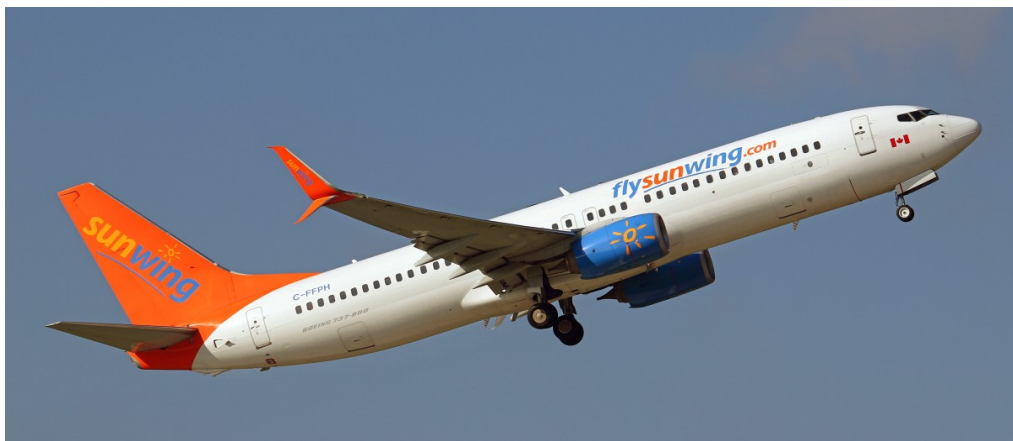
C-FFPH Boeing 737-81D Sunwing 20/05 Paul Whincup

Based Aircraft:-C-FWGH(1/5-19/5), C-FFPH(19/5-29/5), C-FEAK(29/5-31/5).