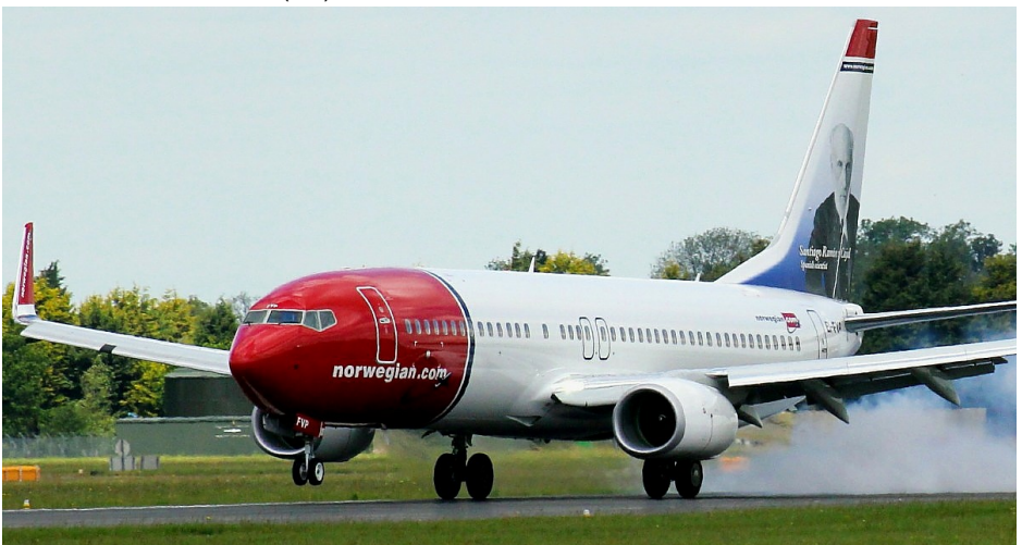
EI-FVP Boeing 757-800 Norwegian 23/05