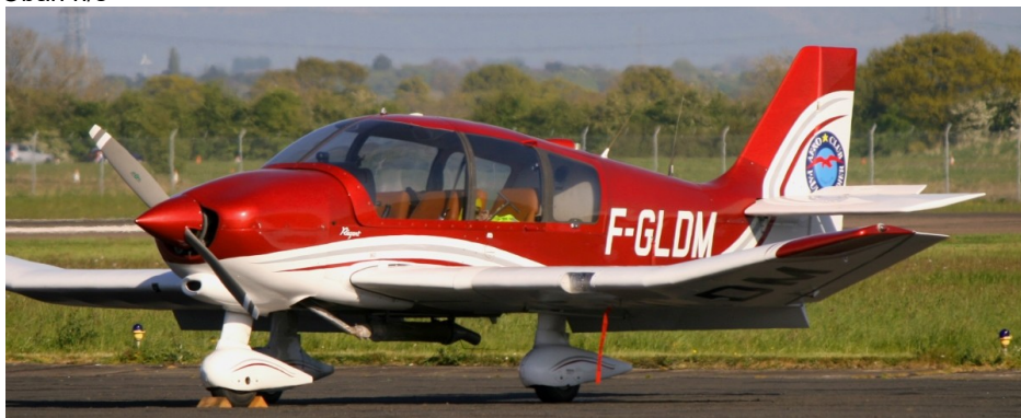
F-GLDM Robin DR400-180 09/05