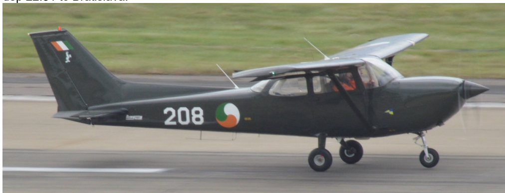
Cessna 172 "208" Irish Air Corps 06/05

Cessna 560 Excel D-CAWM arr 09:44 from Oxford return at 18:40, Cessna 172 '208' IAC dep 11:14 to Weston after maint, Cirrus SR22 N147LK arr 11:21 from Blackbushe n/s, Cessna 560 Excel D-CXLS dep 11:54 to Biggin Hill, Boeing 737-33J 9H-PAM arr 21:40 from Perpignan dep 22:51 to Bratislava.