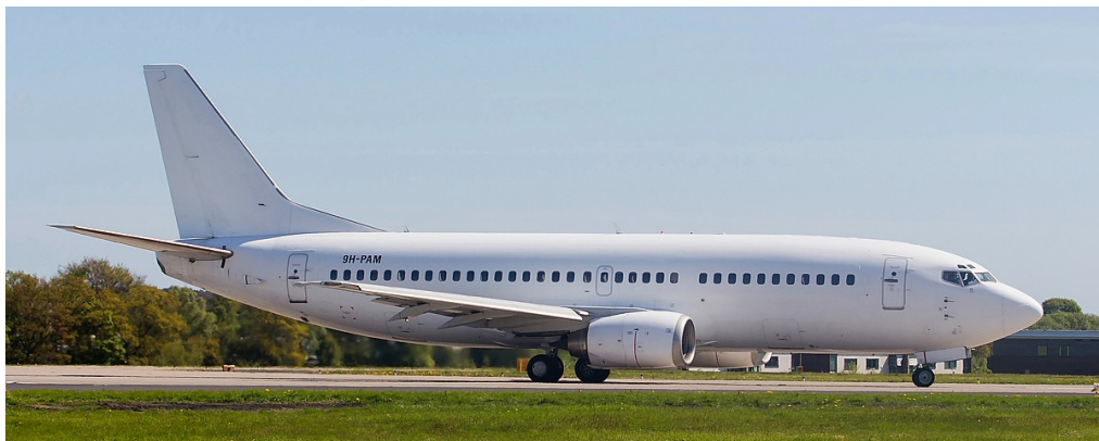
9H-PAM Boeing 737 Go2Sky Ltd 06/05