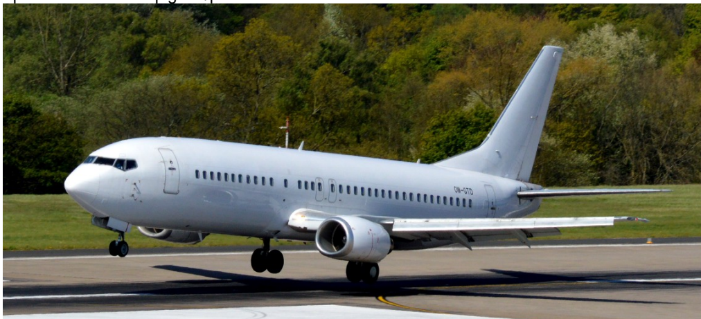
OM-GTD Boeing 737-400 Go2Sky Ltd 05/05

4/5 9H-PAM(803F) operated in from Orly, 5/5 OM-GTD(803G/803) positioned in from Bratislava/out to Perpignan, 9H-PAM(803F) positioned out to Lasham, 6/5 9H-PAM(804/804F) operated in from Perpignan/positioned out to Bratislava.