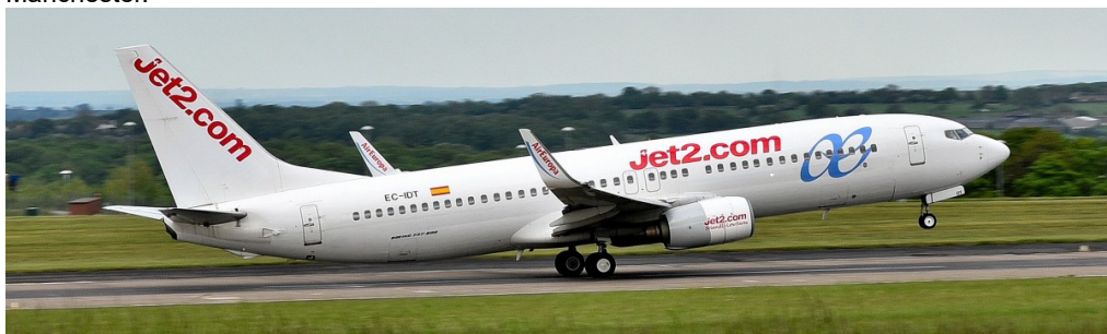
EC-IDT Boeing 737-86Q Air Europa (Op for Jet2) 21/05 Rod Hudson

operated in from/out to Palma, G-CELV(031E) positioned in from Edinburgh, 15/5 G-JZHC(041A) positioned in from Edinburgh, G-LSAC(059B) test flight, G-GDFC(051B) test flight, 16/5 G-JZHH(031E) positioned out to Manchester, G-LSAA(059B) test flight, G-CELV(055B) test flight, G-GDFE(031E) positioned in from Newcastle, G-CELV(032E) positioned out to Newcastle, 17/5 G-LSAB(059B) test flight x 3, G-JZHC(031E) positioned out to Manchester, 20/5 G-GDFU(041A) positioned in from Manchester, G-GDFC(042A) positioned out to Manchester, 21/5 EC-IDT (228/227) operated in from/out to Palma, 23/5 G-LSAA(051B) test flight, 24/5 G-CELV(300T) test flight, G-LSAD(049A) positioned out to Manchester, 26/5 G-JZHS(041A) positioned in from Manchester, G-GDFM(051B) test flight, 27/5 G-JZHS(031) positioned out to Manchester, G-LSAI(041A) positioned in from Manchester, 28/5 G-LSAI(042A) positioned out to Manchester, EC-IDT (228/227) operated in from/out to Palma, G-LSAG(044A) positioned in from Malaga, 29/5 G-CELA(041A) positioned out to Newcastle, G-GDFF (042A/044A) positioned in from/out to Manchester, G-CELV(043A/045A) positioned in from/out to Newcastle, G-LSAG(031) positioned out to Manchester, 30/5 G-LSAI(032E) positioned in from Manchester, G-GDFD(079W) positioned in from Birmingham, G-GDFZ(071W) positioned in from Birmingham, G-LSAB(072W) positioned in from East Midlands, G-LSAE(041A) positioned in from Manchester, 31/5 G-LSAE(041A) positioned out to Manchester.