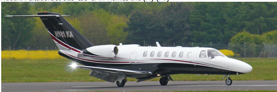
N181KA CitationJet 525 CJ3 02/05

2nd N181KA CitationJet 525 CJ3 CMH Homes Inc (M) (FV)