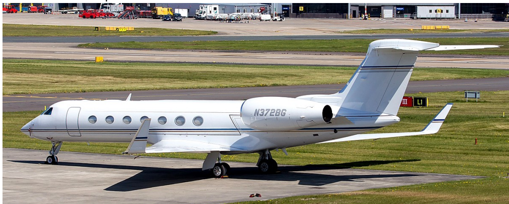
N372BG Gulfstream G550 04/05

Dublin as NJE880F, Cessna 560 Excel D-CXLS arr 14:40 from Firenze n/s, Phenom 300 CS-PHC arr 15:26 from Catania as NJE049C dep 16:29 to Jersey as NJE427E, Agusta A109SP G-SKBH arr 18:51 dep 19:37.