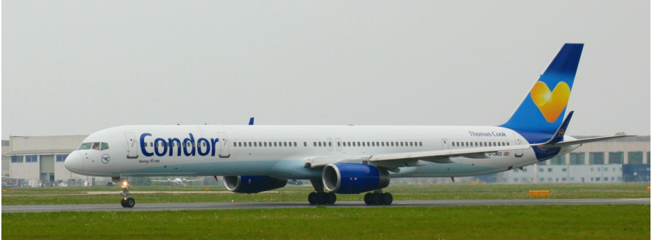
G-GMOG Boeing 757-300 Thomas Cook 02/05