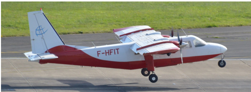
F-HFIT BN-2T Islander 23/05

Learjet 75 G-ZNTH arr 06:49 from Biggin Hill dep 08:13 to Palma, Phenom 300 CS-PHB arr 07:36 from Luton as NJE511W dep 10:41 to Stockholm-Bromma as NJE822E, Cessna 510 Mustang F-HBIR dep 11:14 to Liverpool as Blink9I, Cessna 560 Excel G-IPAX arr 11:39 from Newquay n/s, Socata TBM-850 N989PR (ex M-SHEP) arr 12:19 from Cambridge return at 14:28, Piper PA-28 Cherokee G-AYPV f/t IOM (13:10/16:03), Learjet 60 D-CSLT arr 15:20 from Antalya n/s, BN-2T Islander F-HFIT arr 15:34 from Le Touquet dep 17:00 to Cumbernauld,