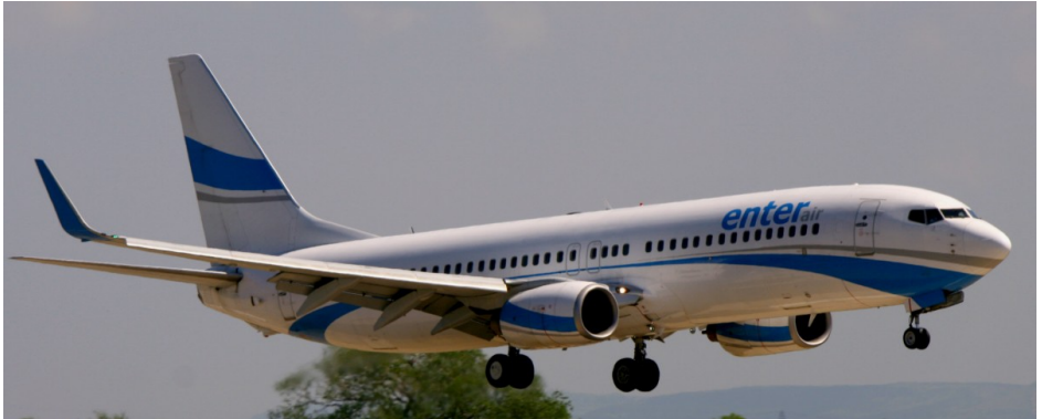
SP-ENZ Boeing 737-85F Enter Air 26/05

26/05 OK-TVV Boeing 737-86N f Niederrhein t Tarbes-Lourdes Travel Service Airlines, G-FEGN PA-28-236 Dakota f/t Private site, SP-ENZ Boeing 737-85F n/s t Tarbes-Lourdes Enter Air, N397CM Ce510 Citation Mustang f Denham t Kemble, OO-PCJ Pilatus PC-12-47E f Charleroi n/s European Aircraft Pvt Club, G-BURR Auster AOP.9 f Private site n/s, N397CM Ce510 Citation Mustang f/t Jersey, G-KAMY AT-6D Harvard III f Yeovilton n/s Orion Enterprises, D-IJOA Citation 525A CJ2 f Gdansk n/s OHL Charter Flug, G-SPEY AB206B Jetranger II f Gloucester n/s Castle Air