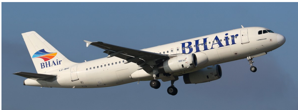
LZ-BHI Airbus A320 BH Air 20/05 Paul Whincup

Bourgas "5569/5570" :-20/5 LZ-BHI, 27/5 LZ-BHH.