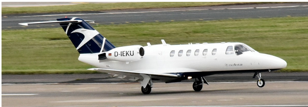
D-IEKU Cessna 525A Citationjet 21/05 Rod Hudson

Cessna 510 G-FBKF arr 09:07 from Le Bourget dep 10:20 to Lille as Blink6F, BN-2T Defender ZG998 overshoot x 2 10:08 c/s ascot 7940 then arr 13:13 and dep 15:43 to RAF Alconbury, Cessna 510 Mustang F-HBIR arr 12:24 from London City as Blink9I until 23 rd , Cessna 510 Mustang OE-FNP arr 16:08 from Bergerac dep 17:03 to Manchester, Cessna 525A CJ2 D-IEKU arr 16:11 from Wick dep 16:49 to Manchester. Boeing CC-177 Globemaster CAF 177702 dep 16:57 to CFB Trenton.