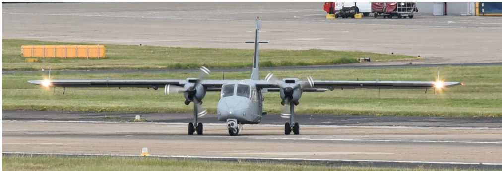
ZG998 Defender AL1 21/05 Rod Hudson