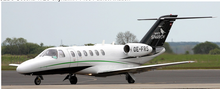
OE-FRS Ce525A CitationJet CJ2 14/05