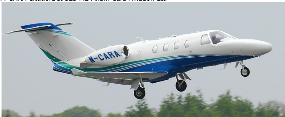
M-CARA CitationJet 525 M2 02/05

1st M-GCAP Piaggio P-180 Avanti II Dep 2nd 2nd M-CARA CitationJet 525 M2 Anam Cara Aviation Ltd