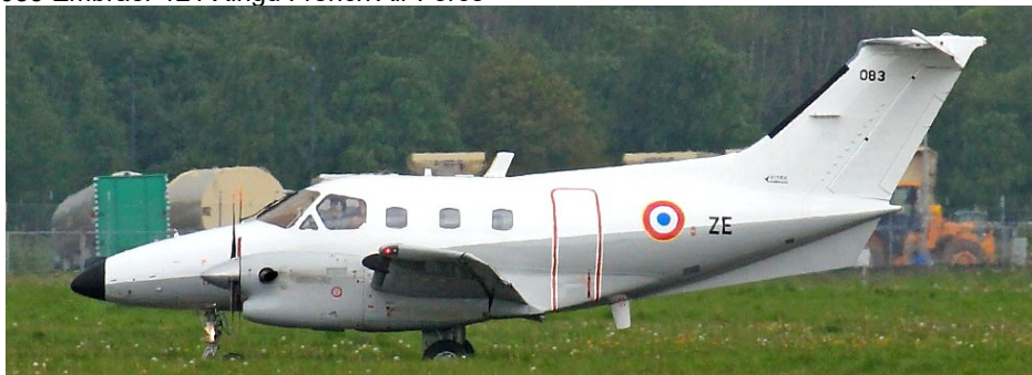
083 Embraer 121 Xingu 02/05

2nd 083 Embraer 121 Xingu French Air Force