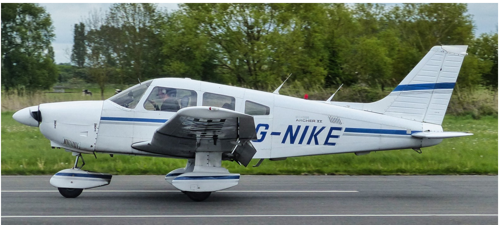
G-NIKE PA-28 22/05