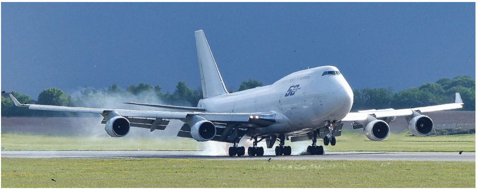
VQ-BWT Boeing 747-400 Longtail Aviation 26/05