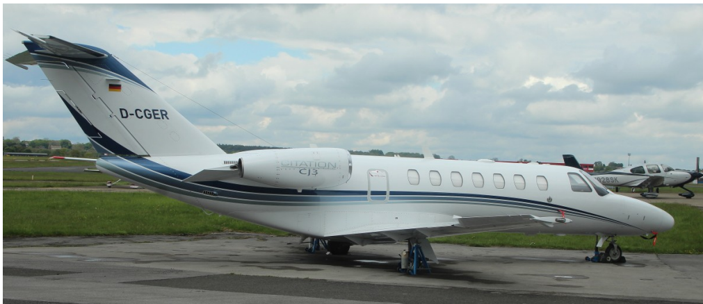
D-CGER Cessna 525B CJ3 26/05 Ian Gratton

Liverpool, Bell 505 Jetranger X 2-BELL dep 14:01 ret at 14:17, Cirrus SR22 G-OZZT arr 15:15 fr Cranfield, Cessna 525A CJ2 G-IJOA arr 17:10 fr Memmingen-Allgau n/stop,