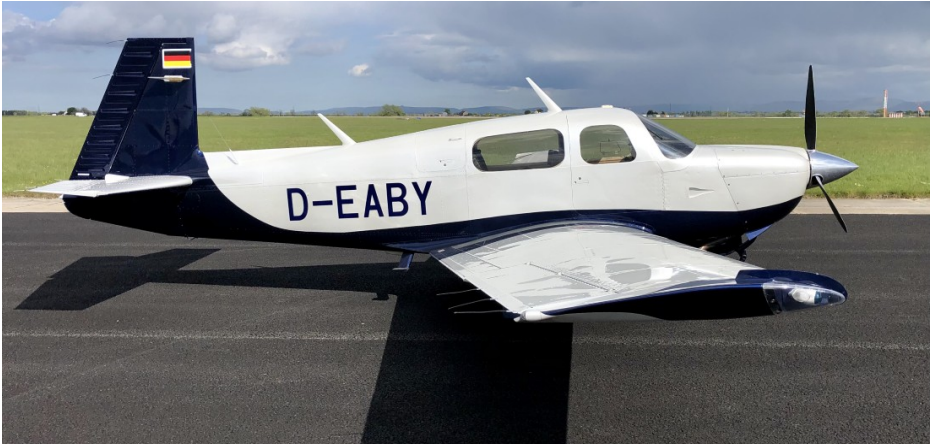
D-EABY Mooney M20J-201 19/05