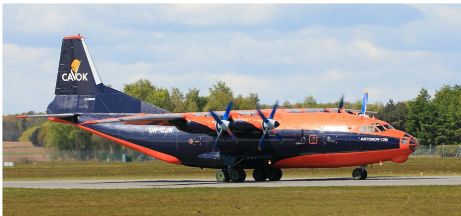
UR-CJN Antonov AN-12 Cavok Airlines 06/05