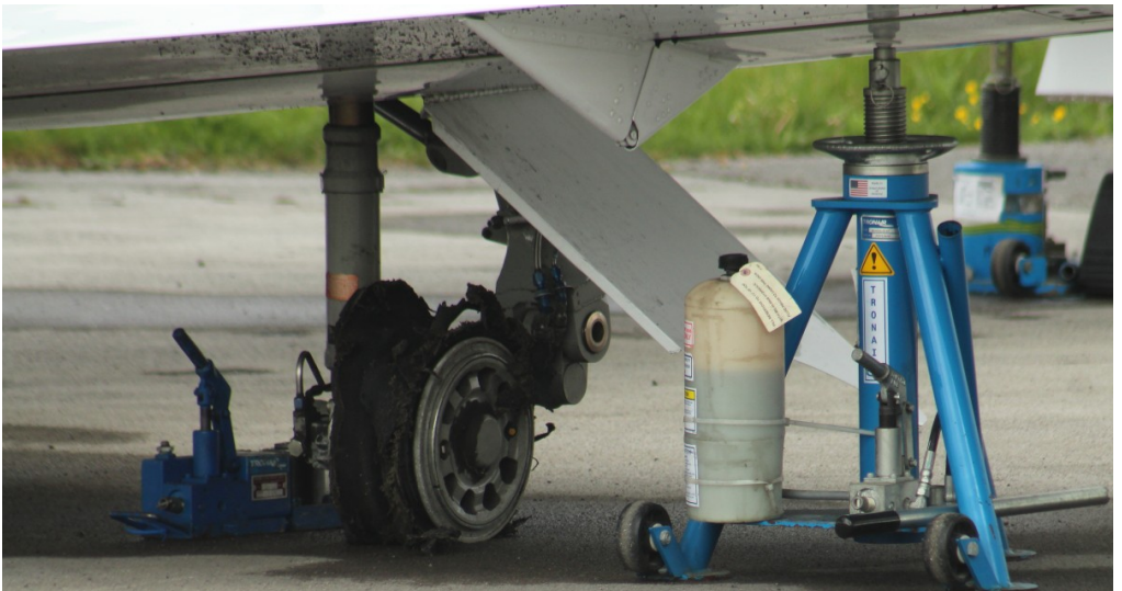
Citation 525 CJ3 Excellent Air Damaged Undercarriage Ian Gratton