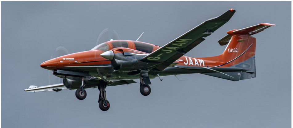
G-JAAM Diamond DA62 25/05

26/05 G-HOTB Eurocopter EC155 Dauphin f Leeds Bradford t Private Site Multiflight, OE-LTF Gulfstream G650 f/t Katowice Sparfell Luftfahrt, N288Z Gulfstream G650 arrived 24/05 t Syracuse Hancock Solairus Aviation