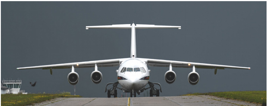
ZE700 BAe 146-100 CC2 25/05

26/05 G-HOTB Eurocopter EC155 Dauphin f Leeds Bradford t Private Site Multiflight, OE-LTF Gulfstream G650 f/t Katowice Sparfell Luftfahrt, N288Z Gulfstream G650 arrived 24/05 t Syracuse Hancock Solairus Aviation