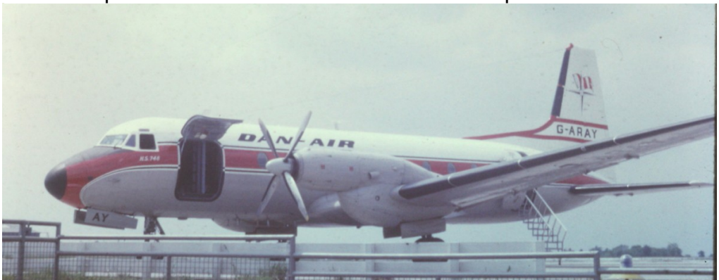
HS848 G-ARAY, sorry for poor shot, it was always parked on this corner stand. Second Prototype and eventually scrapped.