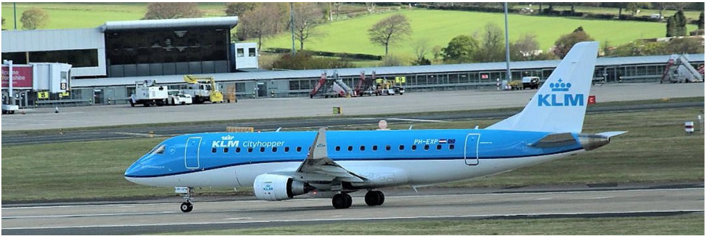
PH-EXP Embraer 170 KLM 06/05 Mike Storey