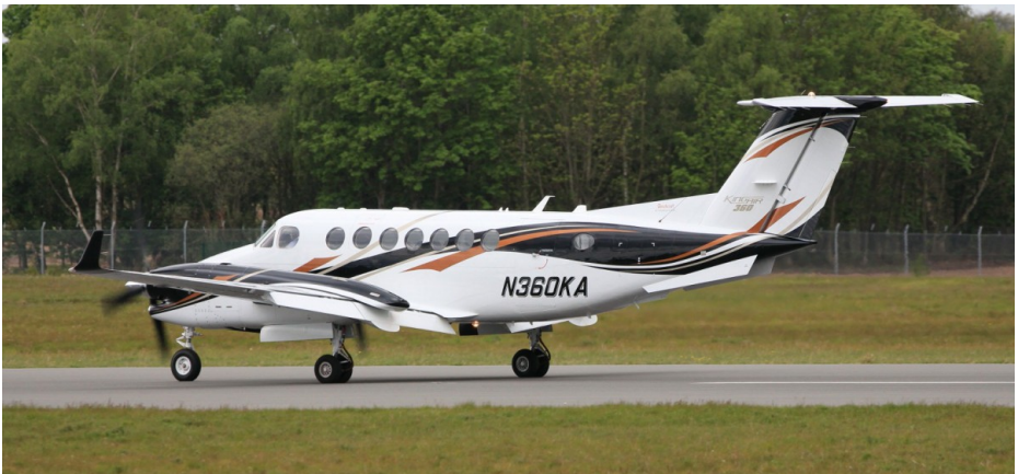
N360KA Textron Beech King Air 360 09/05