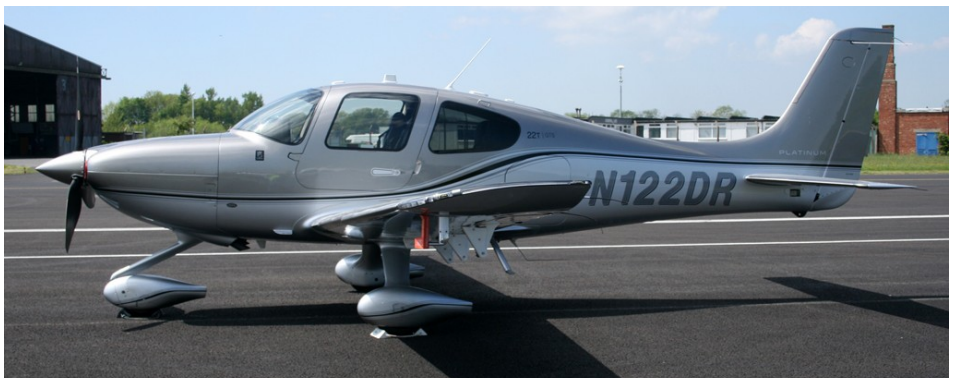
N122DR Cirrus SR22T 31/05

31/05 G-FHFX Embraer Praetor 600 f Biggin Hill t Faro Flexjet, G-AWOT Cessna 150 f Eshott t Leeds East Purple Aviation, N122DR Cirrus SR22T arrived 28/05 t Tatenhill, G-JAAM Diamond DA 62 f Blackpool n/s Fly Private Ltd