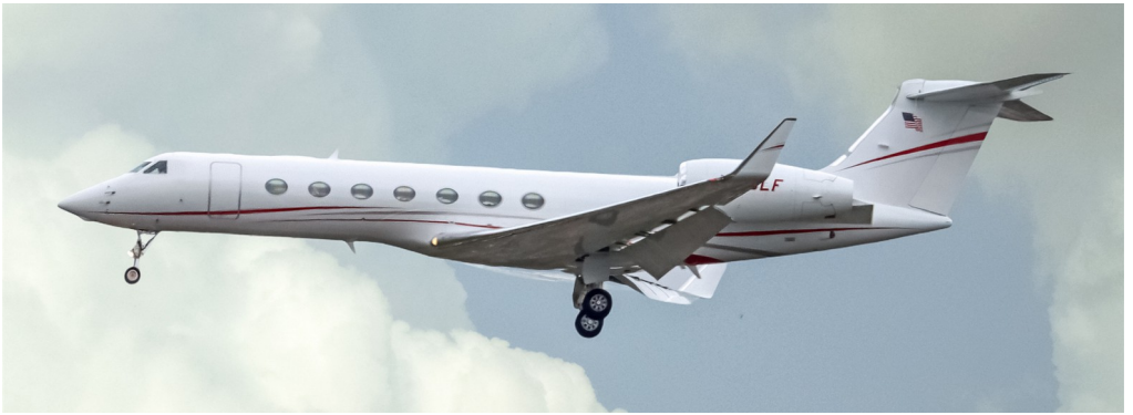
N613LF Gulfstream G550 22/05 Paul Whincup