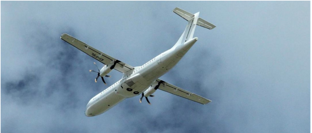
EI-FSL ATR72-600 Stobart Air Mike Storey 06/05

Belfast (3678/3679, “3678/3679”, Sun):-9/5 EI-FMJ, 16/5 EI-FSL, 23/5 EI-FSK, 30/5 EI-FSL.