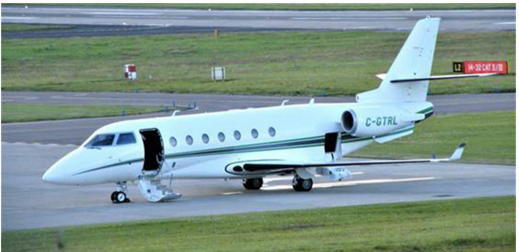
C-GTRL Gulfstream Aerospace G200