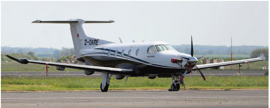
2-DARE Pilatus PC-12 28/05

29/05 G-BOCU Piper PA-34 Seneca III f Sherburn in Elmet c/t Advanced Flight Training, G-PEKT Socata TB20 Trinidad f ? c/t The WERY Flying Group, N147VC Cirrus SR22 f Blackpool t Oxford