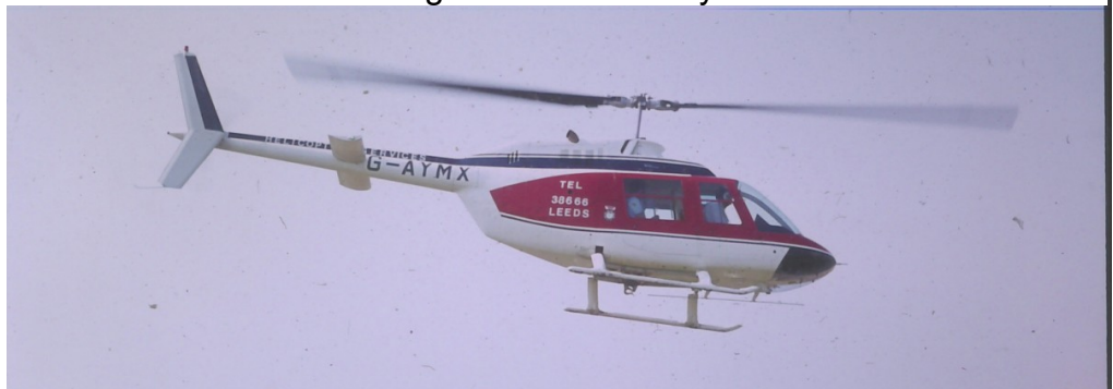
Bell 206 Jetranger G-AYMX eventually re-registered G-ONOW and then exported to USA. Was based at Leeds heliport near Seacroft.