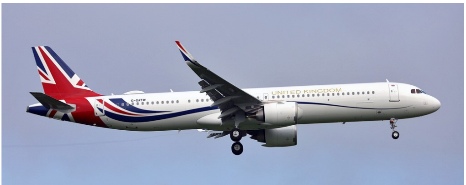
G-XATW Airbus A321-253NX(LR) 13/05

12./05 G-EMPP Diamond DA42NG Twinstar n/s t Retford Gamston DEA Aviation, CS-LTF Ce680A Citation Latitude f Sion t Copenhagen Netjets Europe, G-BPOM Piper PA28-161 Warrior II f/t Humberside POM Flying Group, G-HOLA Piper PA-28 Dakota f Fishburn c/t