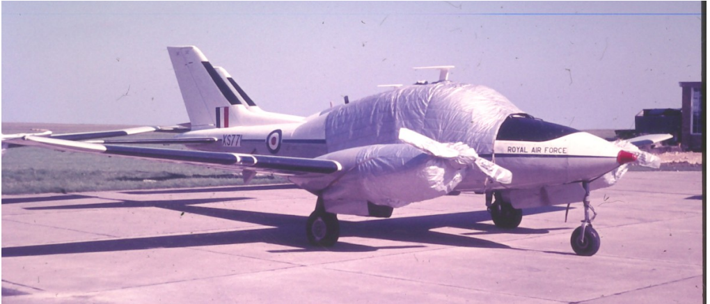
One of 3 Beagle Bassets bought by Northern air Taxis and civil registered eventually