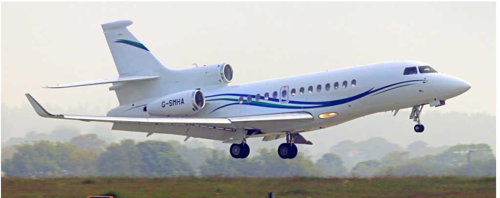
G-SMHA Falcon 7X 29/05 Paul Whincup