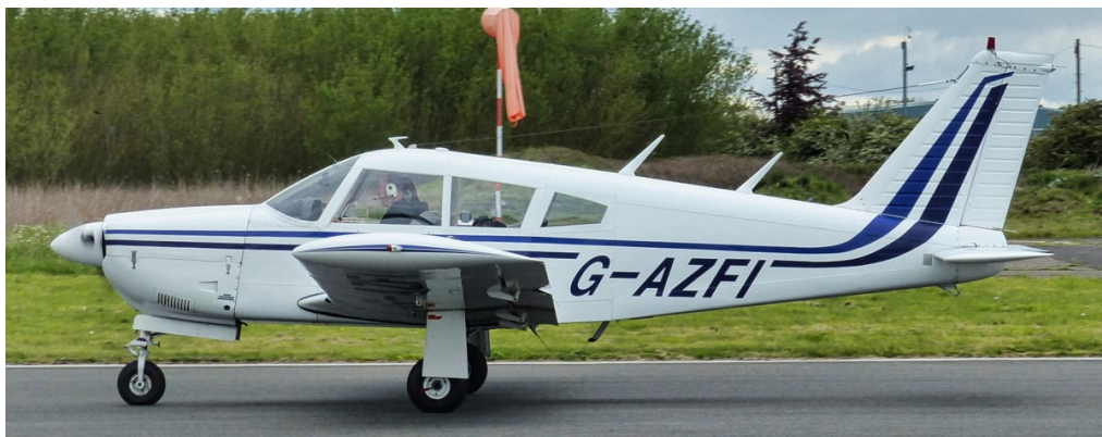
G-AZFI PA-28 22/05