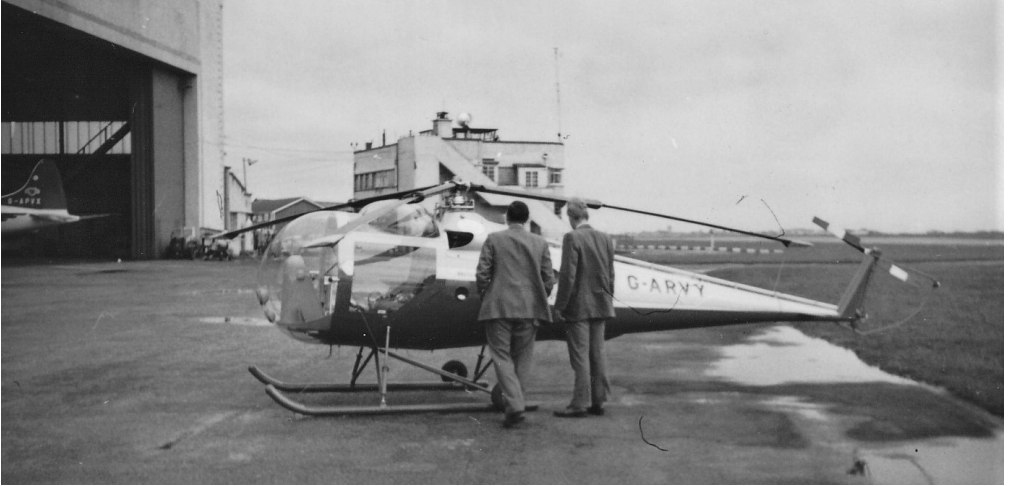
G-ARVY Brantley B.2 parked in front of the Municipal hangar at Yeadon c.1963. I believe this was operated by British Executive Air Services, Kidlington. In the background is the Terminal with the Control Tower on top. The then public enclosure was between the Terminal and the Municipal hangar and I remember spending many hours spotting from there.