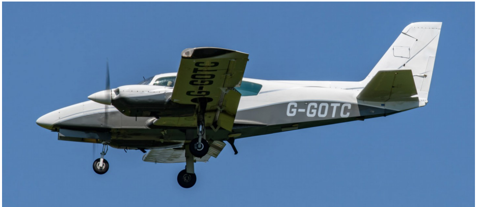
G-GOTC GA-7 Cougar 30/05

31/05 G-FHFX Embraer Praetor 600 f Biggin Hill t Faro Flexjet, G-AWOT Cessna 150 f Eshott t Leeds East Purple Aviation, N122DR Cirrus SR22T arrived 28/05 t Tatenhill, G-JAAM Diamond DA 62 f Blackpool n/s Fly Private Ltd