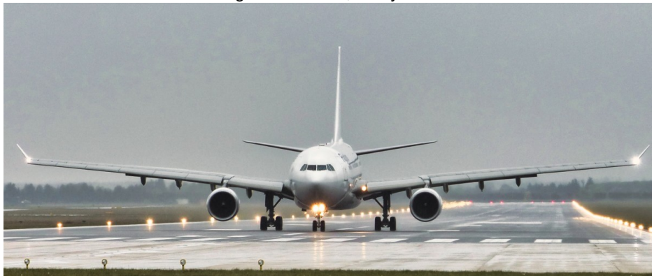
9H-BFS Airbus A-330-200 Maleth-Aero Pax/(F) 03/05 Michael Hanks