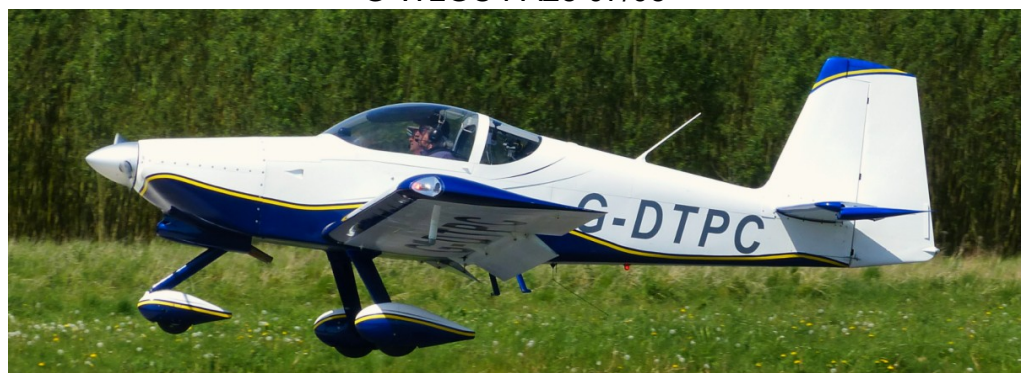
G-DTPC Vans RV-9A 14/05