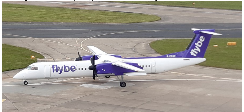
G-ECOR Bash 8 Flybe 29/05 Nigel Berry

Other flights:-16/5 G-JECX(041P) positioned in from Birmingham.