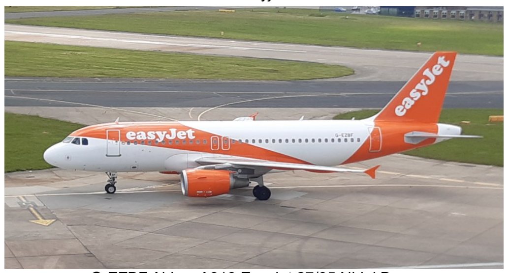
G-EZBF Airbus A319 Easyjet 27/05 Nidel Berry