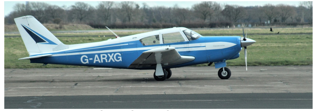
G-ARXG Piper Commanche