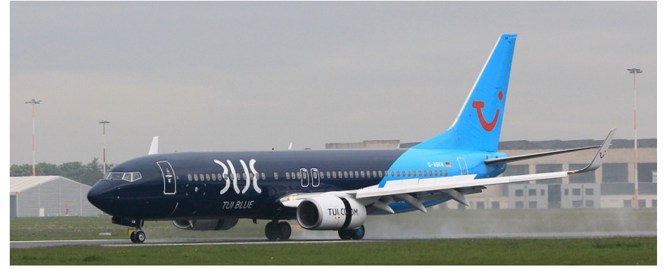
D-ABKM Boeing 737-800 TUI Blue Hotels Livery 04/05