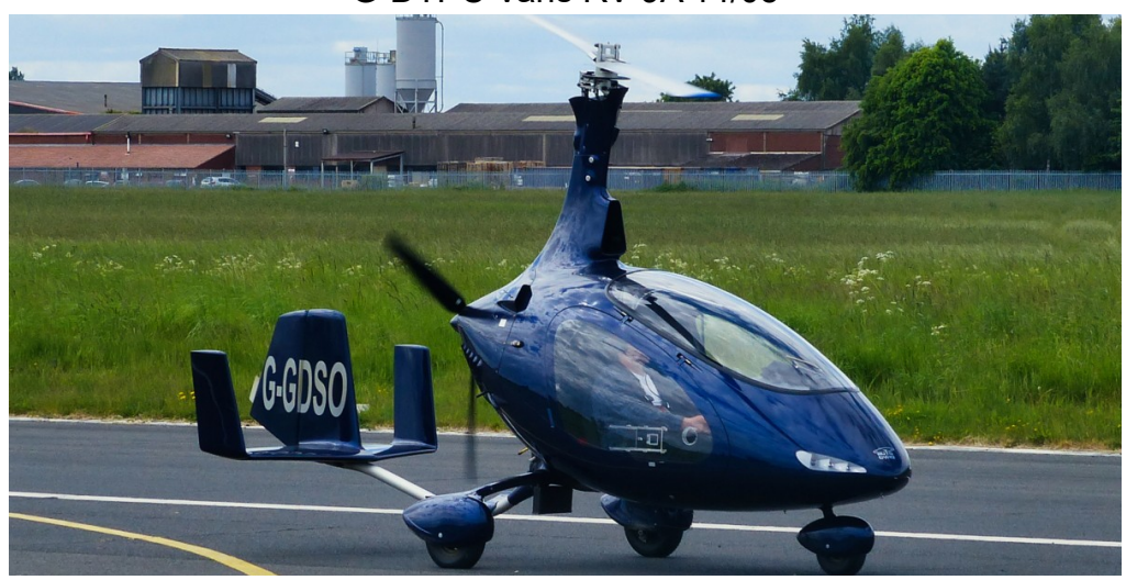
G-GDSO Rotorsport Cavalon 28/05