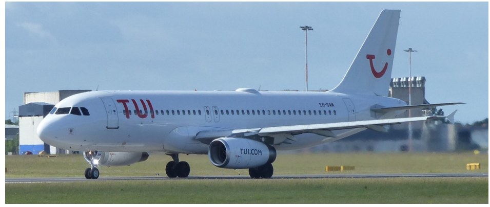
ES-SAM Airbus A320 Smart Lynx (TUI) 27/05 Michael Hanks