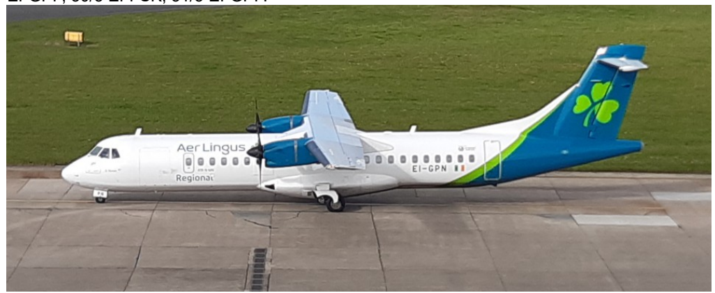
EI-GPN ATR72 Emerald 27/05 Nigel Berry

Belfast City(3676/3677, "76LC/77LD", Daily):-1/5 EI-GPN, 2/5 EI-GPP, 3/5 EI-GPP, 4/5 EI-GPP, 5/5 EI-GPP, 6/5 EI-GPP, 8/5 EI-GPP, 9/5 EI-GPP, 10/5 EI-GPP, 11/5 EI-GPP, 12/5 EI-GPN, 13/5 EI-GPN, 15/5 EI-GPP, 16/5 EI-GPP, 17/5 EI-GPP, 18/5 EI-GPP, 19/5 EI-GPP, 20/5 EI-GPP, 22/5 EI-GPP, 23/5 EI-GPP, 24/5 EI-GPP, 25/5 EI-GPP, 26/5 EI-FSK, 27/5 EI-GPP, 29/5 EI-GPP, 30/5 EI-FSK, 31/5 EI-GPP.