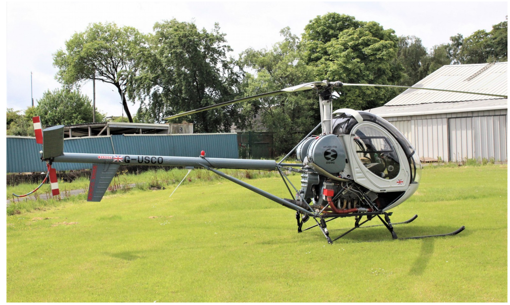
G-USCO HUGHES 269C New Resident