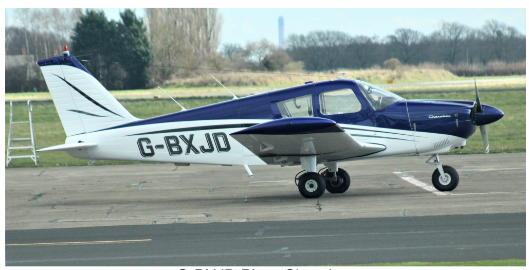
G-BXJD Piper Cherokee