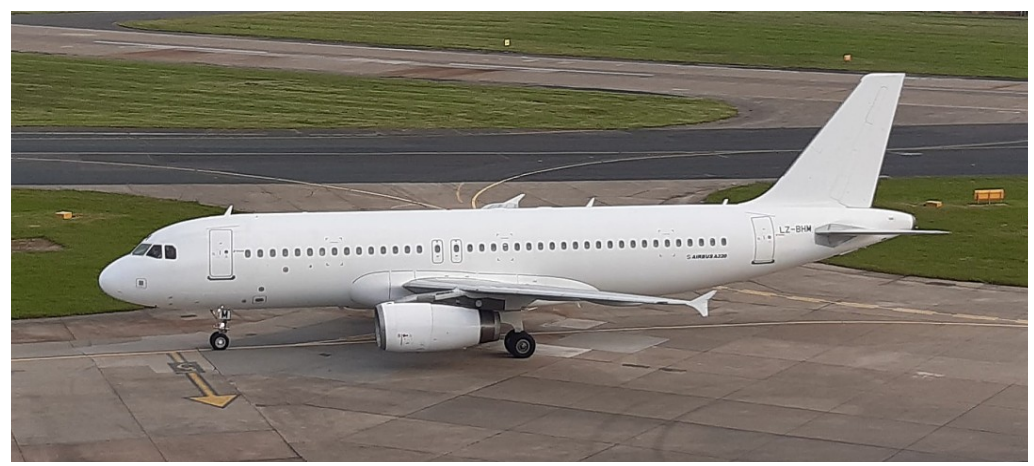
LZ-BHM Airbus A320 BH Air 21/05 Nigel Berry easyJet(EZY/U2, "Easy")

Balkan operate a once a week charter from/to Burgas using A320 aircraft. Burgas (5569/5570, "5569/5570" Sat):-21/5 LZ-BHM, 28/5 LZ-LAC.