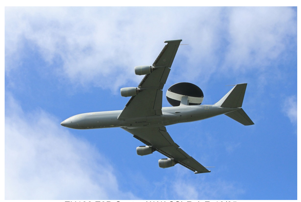
ZH106 E3D Sentry (AWACS) R.A.F. 10/05