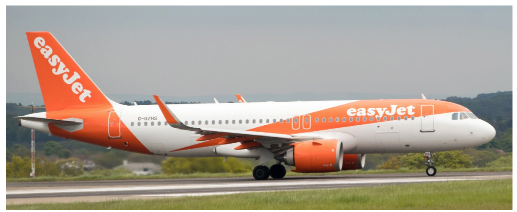
G-UZHS Anirbus A320 NEO Easyjet 06/05 Stewart Robertshaw

Belfast (289/290, "289/290", Sun/Fri):-1/5 G-EZBA, 6/5 G-UZHS, 8/5 G-EZBF, 13/5 G-UZHS, 15/5 G-EZTJ, 20/5 G-UZLA, 22/5 G-UZHS, 27/5 G-EZBF, 29/5 G-UZLA.