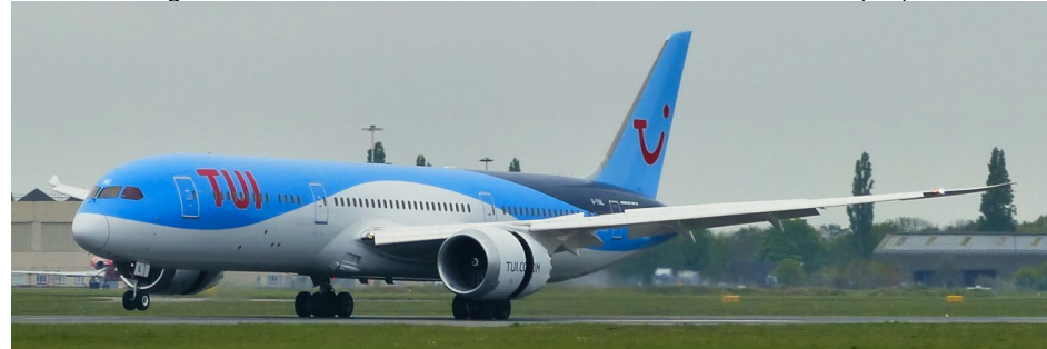
G-TUIL Boeing 787-900 TUI 02/05

1st G-TUIL Boeing 787-900 Dreamliner TUI +2nd. The first 900srs. of theirs (FV)