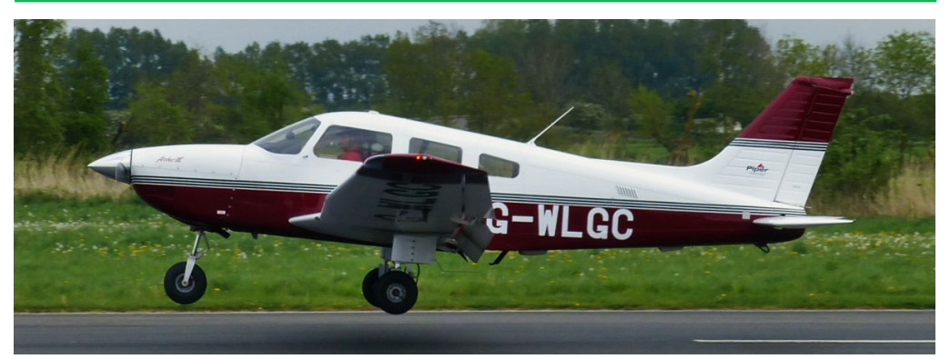
G-WLGC PA28 07/05