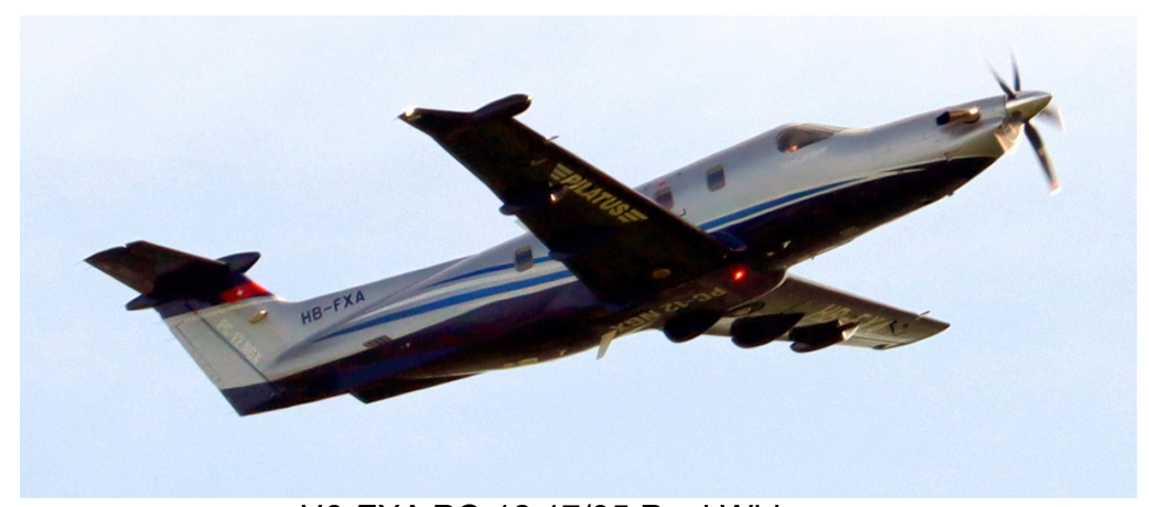
H8-FXA PC-12 17/05 Paul Whincup