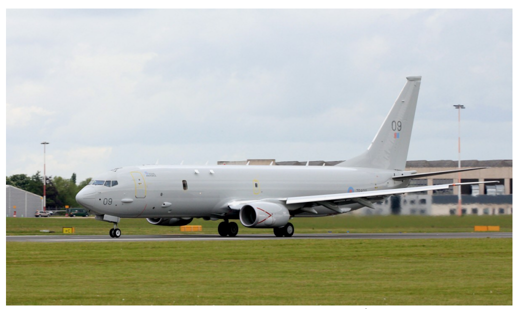
XP809 P-8A Poseidon R.A.F. 12/05