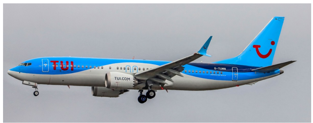
G-TUMN Boeing 737 -8 MAX TUI 13/05 Paul Whincup

Corfu (3551/3550, "6HD/3DA", Fri):-6/5 G-TUMF, 13/5 G-TUMN, 20/5 G-TUMJ, 27/5 G-TAWA. Ibiza(3619/3618, "70N/7KN", Sat):-7/5 G-FDZD, 14/5 G-FDZD, 21/5 G-TAWK, 28/5 G-TAWD. Palma (3251/3250, "65D/85K", Tue):-3/5 G-TAWI, 10/5 G-FDZD, 17/5 G-TAWS, 24/5 G-FDZX, 31/5 G-TAWK.