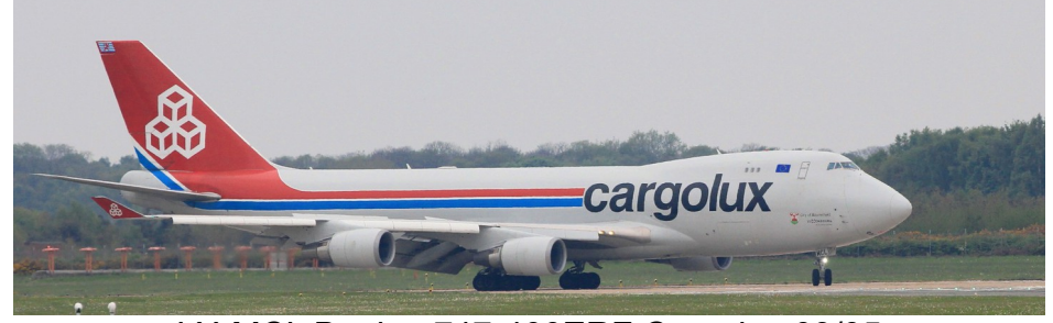
LX-MCL Boeing 747-400ERF Cargolux 03/05

LX-MCL Boeing 747-400 Cargolux (F) D. To Houston (FV)