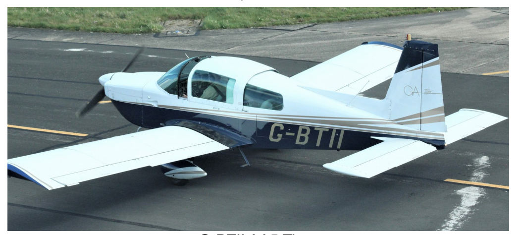
G-BTII AA5 Tiger