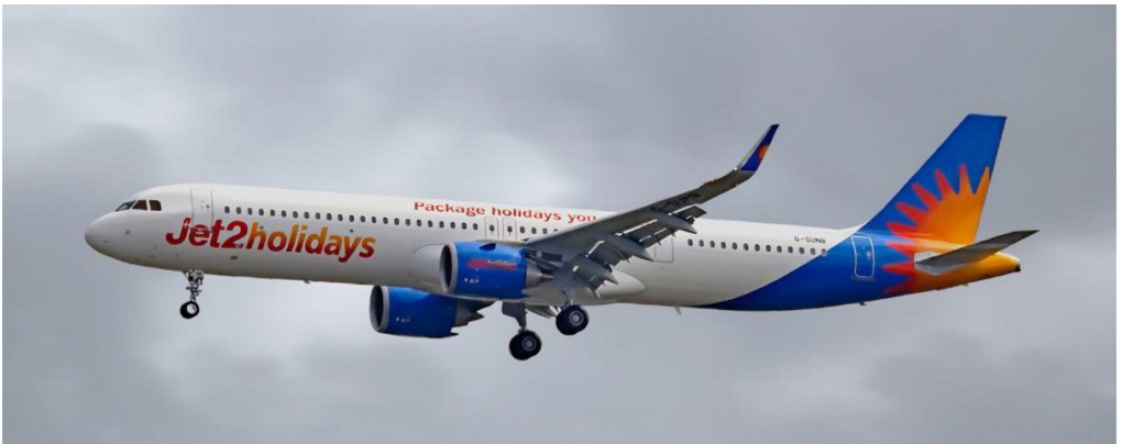
G-SUNB Airbus A321N Jet2.com 06/05 Paul Whincup