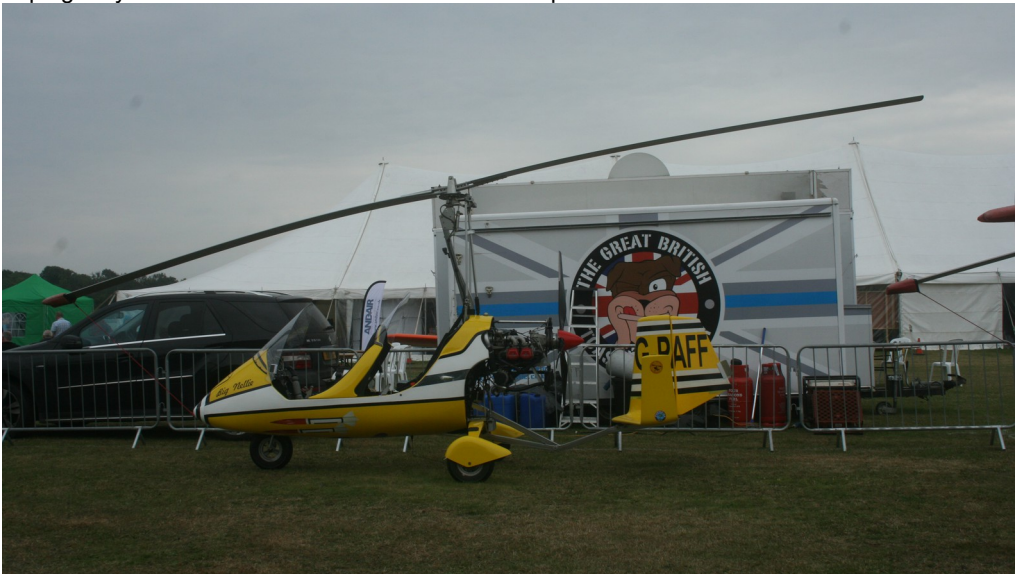
G-PAFF ROTOSPSPORT MTO name 'Big Nellie' pays homage to Wallis WA-116 Agile 'Little Nellie' that starred in 1967 James Bond Film you only live twice

What of this coming year? Well, it seems the LAA are sticking with September but as yet at an unidentified location. I cant see them using Popham again but personally I'd like to see a return to Sywell or Cranfield. An annual rally on the scale of Sywell requires exclusive use of the airfield plus additional days to set up and break down. They cost about £100K to run and are reliant on many volunteers. In fact the Popham event cost in the region of £50K. So here's hoping they find a suitable location soon so we can plan to be there!