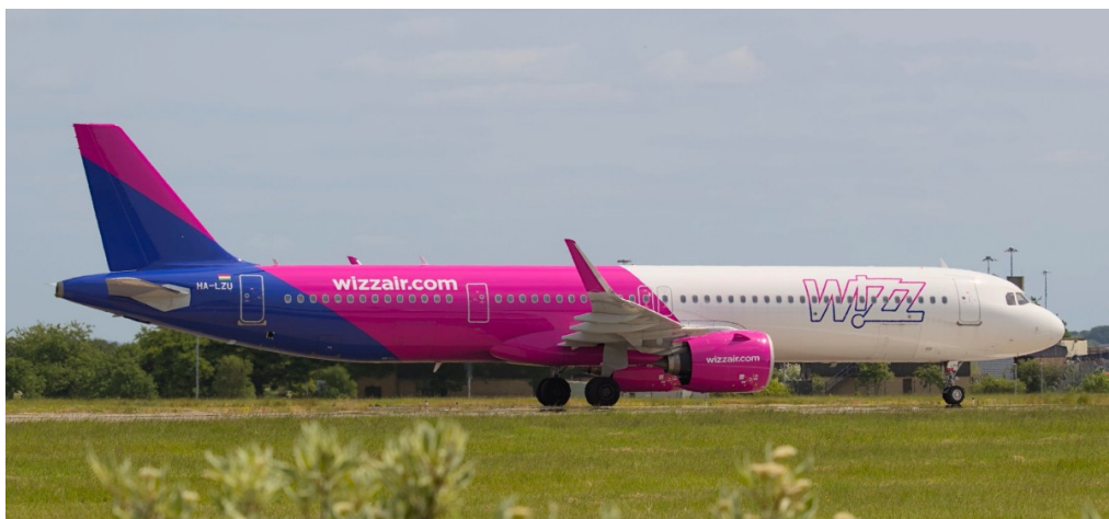
HA-LZU Airbus A321N 30/05

Wroclaw (1815/1816, “5183/9550”, Tue/Sat):-2/5 HA-LZP, 6/5 HA-LTC, 9/5 HA-LXB, 13/5 HA-LXB, 16/5 HA-LTD, 20/5 HA-LXB, 23/5 HA-LXB, 27/5 HA-LTD, 30/5 HA-LXG.