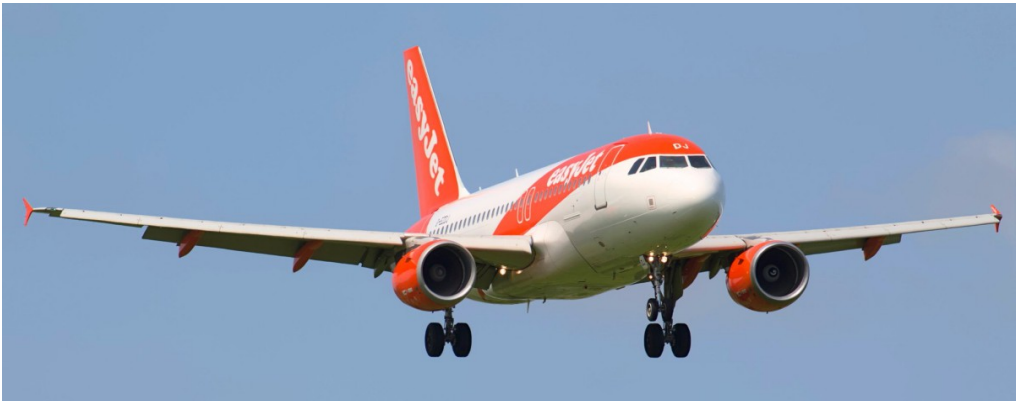
G-EZDJ Airbus A319 Easyjet