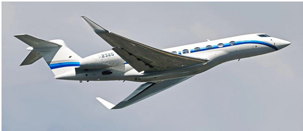
N232G Gulfstream 650ER 26/05 Paul Whincup

Phenom 300 CS-PHT dep 08:23 to Cannes, Cirrus SR20 N203CD arr 09:15 fr Liverpool, ret at 16:10, Phenom 300 CS-PHA arr 09:35 fr Geneva ret at 11:47, Learjet 40 M-DMDP arr 09:37 fr Dublin ret at 17:22, PA-28 Cadet G-SACR touch & go at 11:25 fr Sherburn, Cessna 525A CJ2 D-ICMD dep 13:56 to Teesside, Beech 200 Kingair G-WVIP dep 41:21 to Exeter, Sikorsky S-76C G-XXED arr 14:56 n/stop, Cessna 560 Excel D-CSCE arr 16:37 fr Nice dep 17:19 to Luton, PA-28R Cherokee Arrow G-AZFM dep 16:55 to Thrupton. Cessna 172 SkyHawk G-MOFO arr 17:27 fr Gamston dep 18:17 to newcastle, PA-28RT Turbo Arrow G-RCMP arr 17:40 fr Blackbushe n/stop, Diamond Da62 G-IRJE arr 17:43 fr Gamston, n/stop, Global express C-GLXM dep 17:49 to Farnborough, Cessna 525A D-IAKN arr 18:43 fr Dortmund n/stop, Gulfstream 650ER N232G arr 20:39 fr Teesside n/stop,