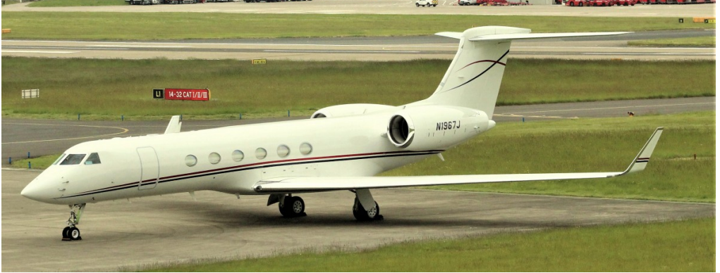
Illustration 1: N1967J Gulfstream 5 30/05 Mike Storey

Legacy 650 D-AZUR dep 07:58 to Olbia, Phenom 300 CS-PHF dep 09:11 to Firenze, Grumman AA5b Tiger G-BTII arr 09:26 fr Church Fenton n/stop, Grob G115E Tutor G-BYXT ILS approach at 09:58 c/s UAQ13 fr Leeming, Gulfstream 5 N1967J arr 10 :51 fr Fort Worth n/stop, Cessna 560 Excel CS-DXQ arr 11:44 fr Bari ret at 17:38, Global 6000 CS-GLH arr 12:24 fr Ibiza n/stop, Hawker 400XP SP-=EAK arr 14:29 fr Albert-Bray, dep 16:13 to Faro, Aero Commander AC114B G-HPSL f/t Bagby (19:28/19:58), Beech 350 Shadow ZZ419 2x Touch and goes at 20:11 fr Waddington, Phenom 300 CS-PHJ arr 20:18 fr Faro n/stop