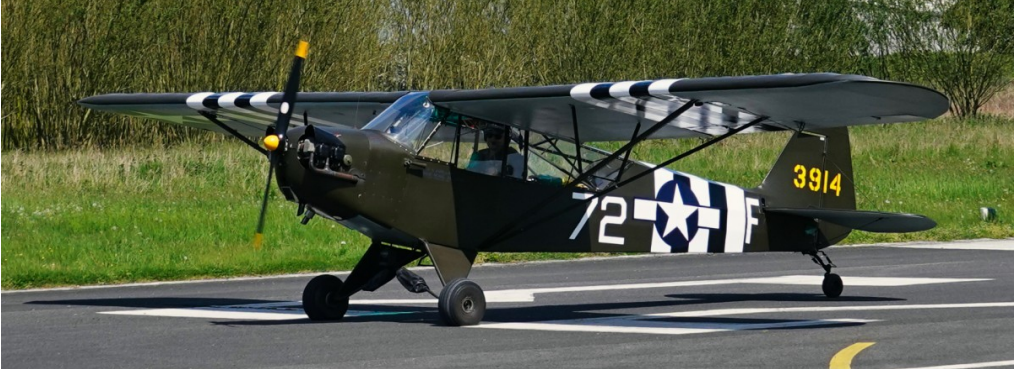
G-BHZU PAJ3C-65 Cub 20/5