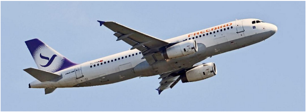
TC-FHM Airbus A320 Freebird 24/05 Paul Whincup