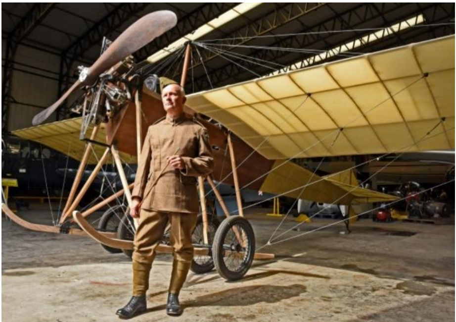
The replica Blackburn Monoplane at Elvington

On 4th June 2011, 100 years after flying from the beach commenced, a public information board about the Blackburn Flying School was unveiled, appropriately, by the two daughters of Robert Blackburn. It can be seen at the southern end of the new Filey Sea Wall, overlooking the beach where the early flights took place. A faithful replica of the Blackburn Mercury II is on display at the Yorkshire Air Museum, regarded by many as the first successful all British aeroplane. It had been made for the Yorkshire TV Edwardian programme Flambards, first broadcast in 1979.