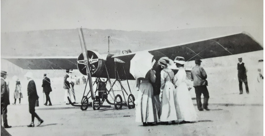
An evocative picture of a Blackburn Monoplane on Filey Sands

91. The Blackburn was rebuilt and with a second Monoplane the site became the base for the Blackburn School of Flying, eventually a third machine was added. It may seem odd today but many early training aircraft were single seaters. By this time the two Bleriot had left Filey Aerodrome.