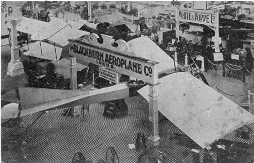
The Blackburn Light Monoplane at the Olympia Aero Show