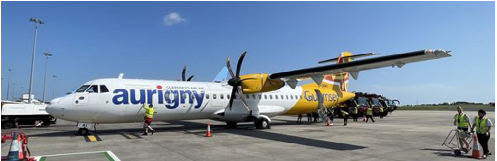
G-ORAI ATR72 Aurigny 24/5

Guernsey (664/665, "66V/66W", Wed/Sat):-24/5 G-ORAI, 27/5 G-ORAI, 31/5 G-OGFC.