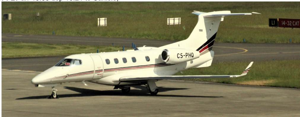
CS-PHQ Phenom 300 23/05 Mike Storey

Cessna 560 Excel D-CRON arr 08:28 fr EDI dep 09:10 to Faro, Phenom 300 D-CMMP arr 09:33 fr Geneva dep 11:48 to Cannes. Cirrus SR22 N590CD dep 10:33 to Sherburn, Legacy 500 G-TULI dep 13:27 to Birmingham. Cirrus Sr22 2-FFLY arr 15:29 n/stop, Cirrus SR22 G-PFLY arr 15:38 dep 16:21 to Carlisle,