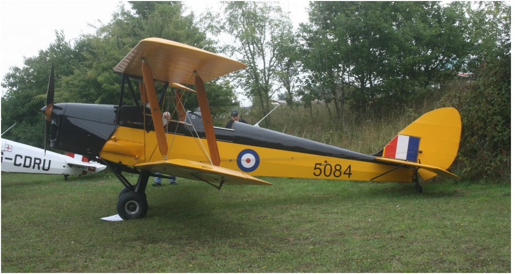
Newly restored DH82C Tiger Moth G-FCTK