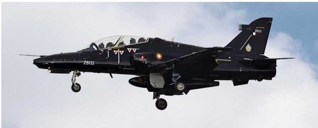
ZB132 Hawk T2 Qatari RAF 16/05 Paul Whincup