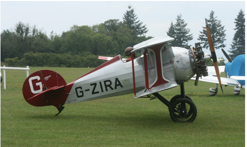
Z1R Stmmelfitzer G-ZIRA