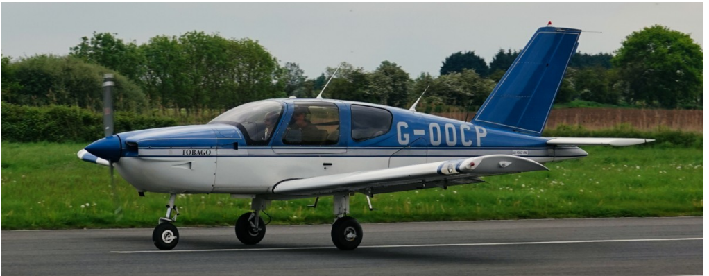
G-OOCP Socata TB10 13/05