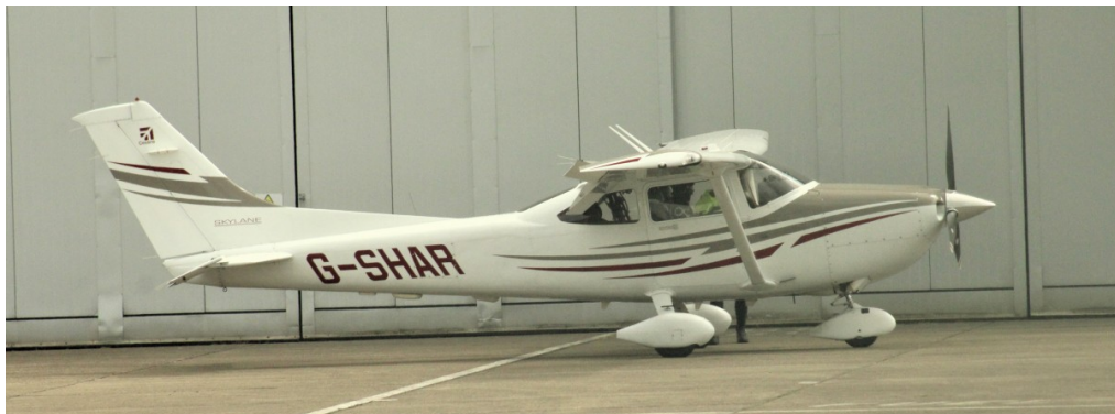
G-SHAR Cessna 182T Skylane 16/05 Mike Storey

Legacy 500 G-TULI dep 06:17 to Napoli, Hawker 800XP LY-HCW arr 07:42 fr Barcelona dep 09:15 to Faro, Legacy 500 9H-XFX dep 11:33 to Firenze, Learjet 45XR G-OSRL dep 12:06 to Santiago, Global Express C-GLXM arr 12:08 fr Venice n/stop, Cessna 560 Excel D-CAWP arr 13:15 fr EDI dep 15:49 to Hannover, Cessna 525 CJ1 D-ICEE arr 14:97 fr Schonefeld dep 16:32 to Torino, Cessna 182T Skylane G-SHAR arr 14:18 fr Old Buckenham n/stop, Cirrus SR22 N57DG arr 14:21 fr Elstree ret at 17:46, Challenger 350 9H-VCM arr 14:33 fr Malaga dep 16:16 to Stansted, Socata TBM930 N11MA arr 16:21 fr Lydd n/stop, Beech 200 Kingair 2-FIFI dep 16:52 to Jersey, Beech 200 Kingair G-FLYK arr 17:11 fr IOM dep 17:41 to Haverfordwest, Cessna 525A CJ2 G-NOCM arr 17:39 fr Oxford dep 18:41 to Farnborough, Cessna 525 CJ1 G-SOVH arr 17:49 fr Le Mans dep 18:58 to Biggin Hill, Learjet 45 LX-RSQ arr 20:00 fr Liege n/stop.