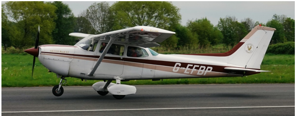
G-EFBP Cessna FR172K