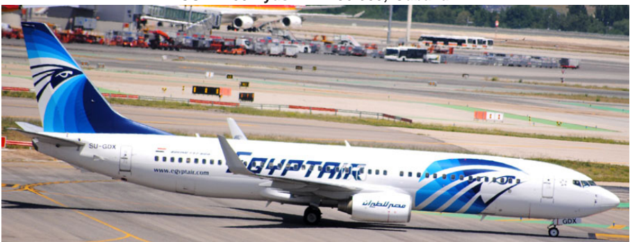
SU-GDX Boein 737/866, EgyptAir