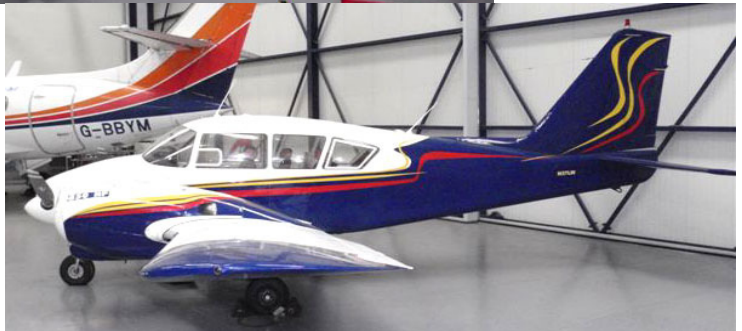
N37LW PA-23 Aztec 250 built in 1960