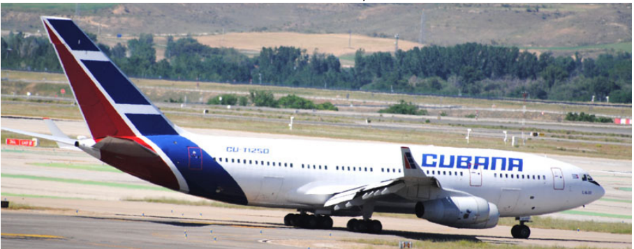
CU-T1250 Ilyushin IL-96-300, Cubana