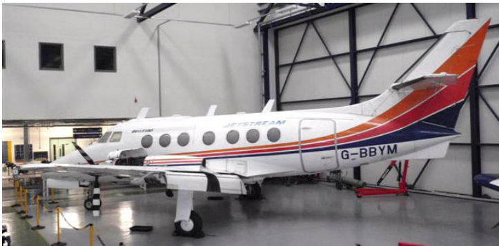
G-BBYM Jetstream Srs. 200