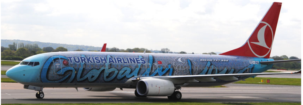
TC-JHL Boeing 737/800 Turkish Airlines, Manchester International, 09/05/12(Steve Lord)