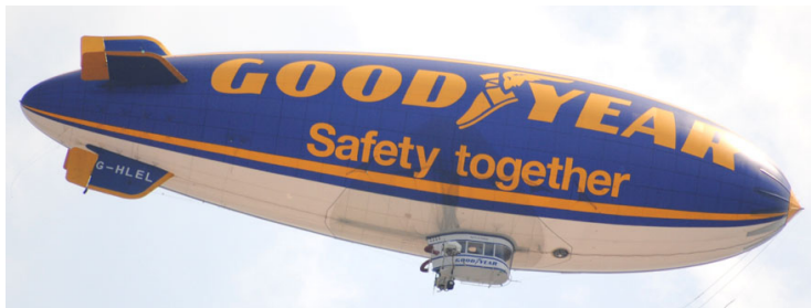
Airship G-HLEL, based at Rufforth was active in the Leeds/Bradford area towards the end of May

GENERAL AVIATION:- PA-28RT Arrow G-SKYV f/t Ronaldsway(1001/1705). Cessna F.150G G-AVER f/t Barton(1351/1500). Commander 112 G-BDKW f/t Top Farm(1408/1549). This aircraft came to collect resident Beech 36 N671B , which carried out a local demo flight 1458/1515 before heading to Top Farm(1525).