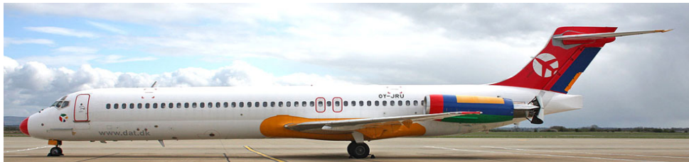
Danish Air Transport MD-83 OY-JRU parked on the ramp at Teesside, 14/4