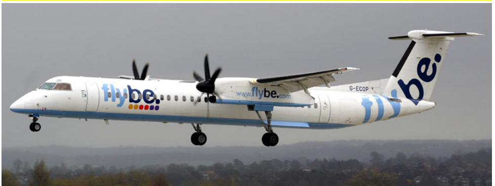
G-ECOP Dash-8-400Q, Flybe about to touch down on Runway 32 at LBIA, 31/03/12