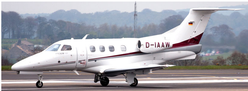
Phenom D-IAAW of Arcus Air lining up on Runway 32 for departure, 23/4

GENERAL AVIATION:- Hughes 369E G-JIVE from Shelf(1443) to Masham(1514), return 1746/1817.