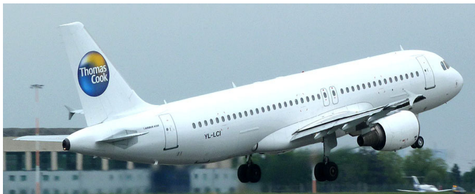
Thomas Cook have leased A.320 YL-LCI for the Summer Season from Smart Lynx. The aircraft, which is based at Newcastle is seen here on a recent visit to Doncaster