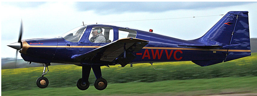
Colourful Pup G-AWVC about to touch down at its base, Sturgate(Alan/dsaf)