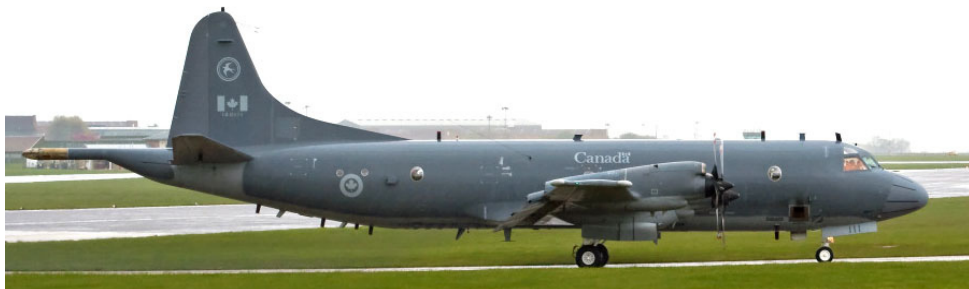
Canadian Air Force CP-140 Aurora 140624 arriving at Waddington on 28/4