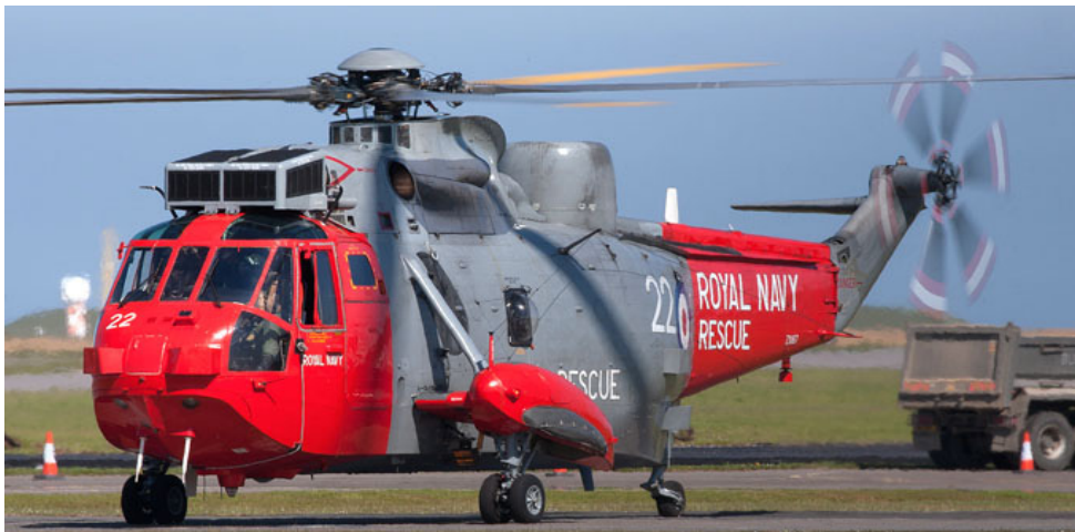
ZA164 Westland Sea King HU5