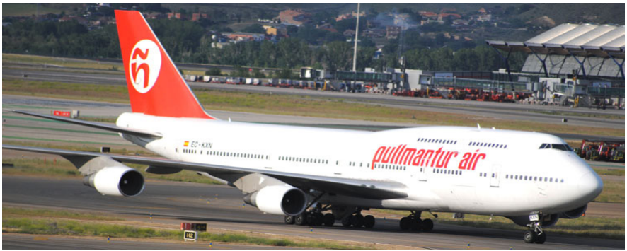
EC-KXN Boeing 747-4H6, Pullmantur Air