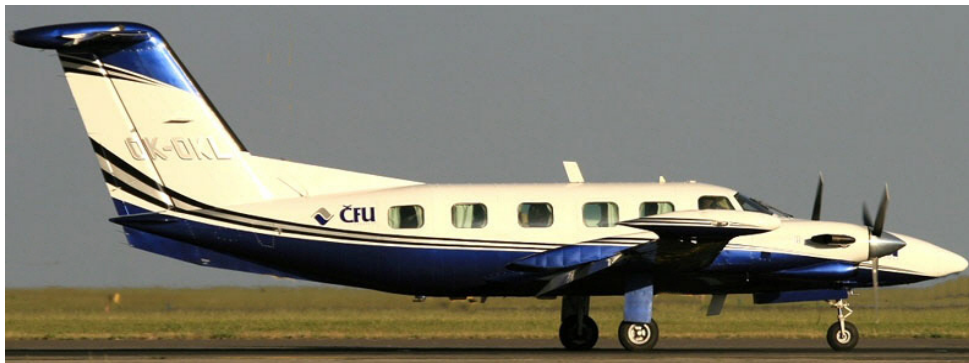
Czech registered PA-42 Cheyenne 3 OK-OKL arrived from Prague on 25/4

GENERAL AVIATION:- Mooney M.20P N400MW f/t Pattonville(1747/0936), n/s until 25/4.