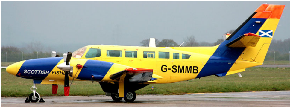
Cessna 406 G-SMMB diverted into Teesside due bad weather at Inverness on 18/4