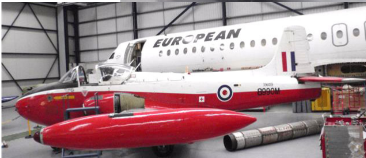
XM419/8990M Jet Provest T.3A