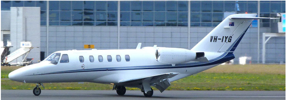
Citationjet 3 VH-IYN, prior to delivery to Austrailia on 21/4(Clive Featherstone)