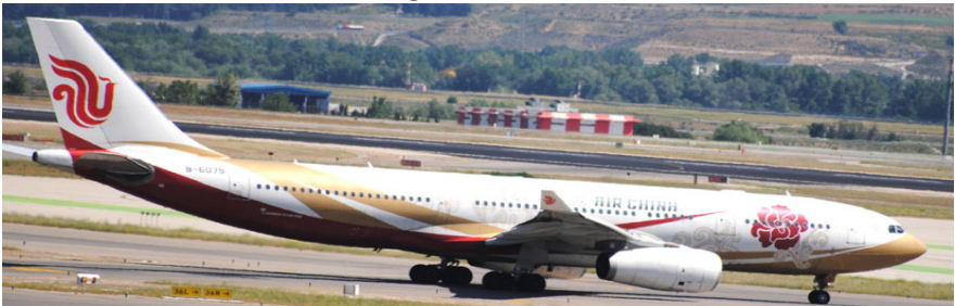
B-6075 Airbus A.330-243, Air China