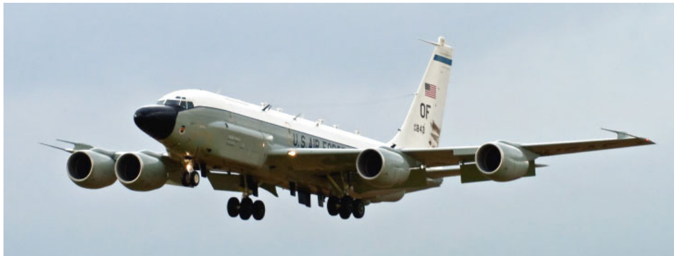
RC-135 Rivet Joint 63-14843(Hawg 95) arrived at Waddington on 26/4 to carry out circuit training

YORK:- Noted flying locally on 27.4 was G-VBFR Cameron Z-375