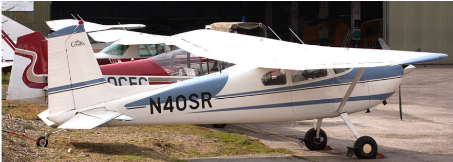
Vintage Cessna 180E N40SR. This registration was formerly carried by a Gulfstream 5!!