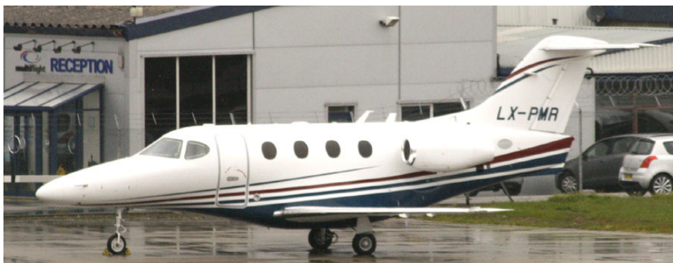
Premier 1 LX-PMR parked on a very wet Multiflight/East Apron, 19/4

GENERAL AVIATION:- King Air 350 G-KLNB (Saxonair 35A) from Amsterdam(1754) to Norwich(1843).