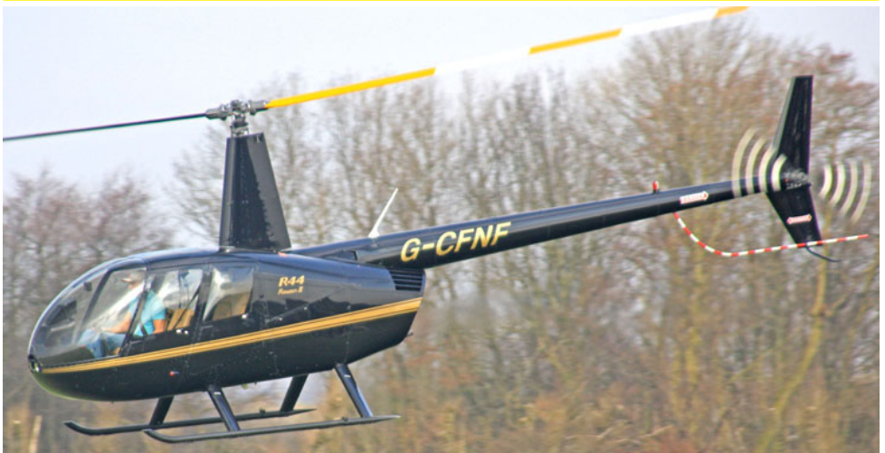
G-CFNF Robinson R.44 Raven II, Manchester/Barton, 13/03/12