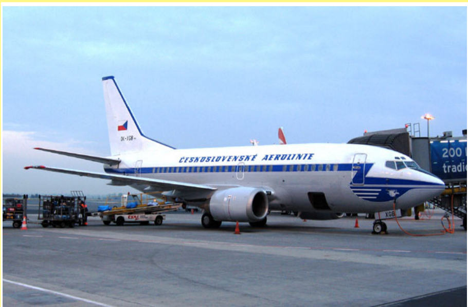
OK-XGB Boeing 737/55S Czechoslovak Airlines(Retro Scheme) Prague/Ruzyne International, 03/04/12 Martin Zapletal