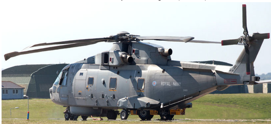
ZH851 EH.101 Merlin HM1(Mk.111)