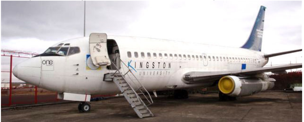
C-GWJO Boeing 737/2A3 formerly operated by Westjet