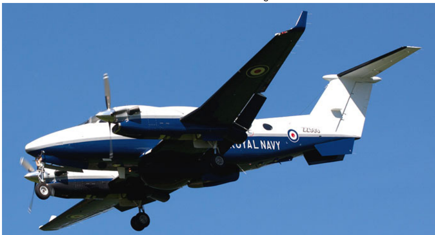
ZZ500 Hawker Raytheon Avenger T1(350CER)