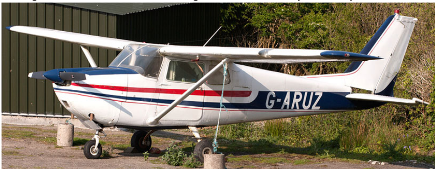
G-ARUZ Cessna 175C(Modified) owned by The Cardiff Skylark Group