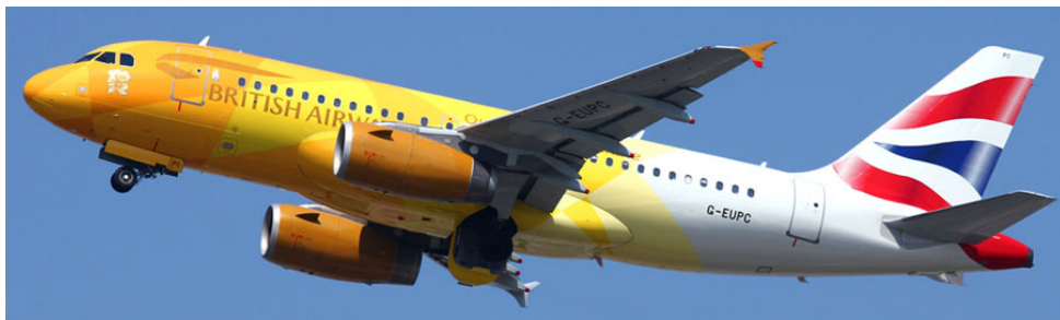
A.319 G-EUPC was painted in this special scheme to fly the Olympic torch from Greece

G-THOO (29335) flew its last revenue service on 29/4 from Heraklion to Manchester & was ferried to Shannon the same day on return to the lessor.