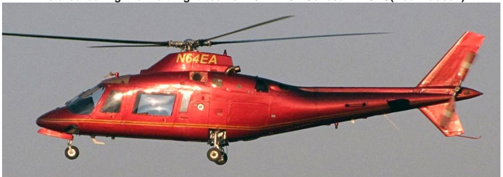
Agusta A.109A N64EA arrived from Skipton on 6/4 for a refuel from Multiflight