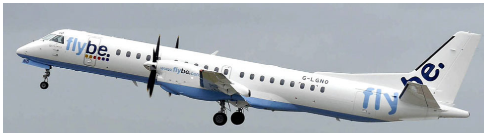
G-LGNO, the first SAAB 2000 for Loganair, training at LBA, 9/4(Rod Hudson)

Additional flights:- 4/4 G-MAJY(052P) positioned in from Durham Tees Valley, 7/4 G-MAJW(012P) positioned out to Aberdeen.