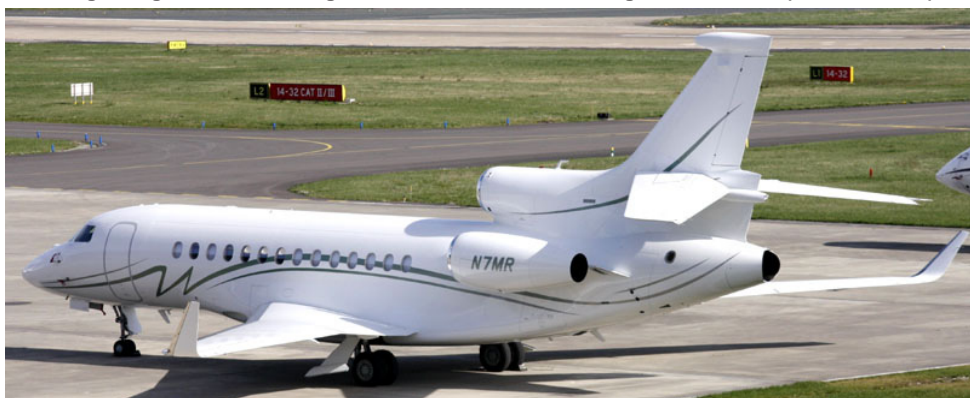
Falcon 7X N7MR arrived on 7/4 and spent 4 days parked on Multiflight/East(Mike Storey)