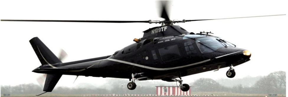
Inbound for landing on 3/4, Agusta A.109A N109TF is based at Henfield in Sussex