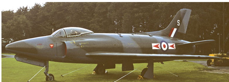
WK281 Swift FR5 ex "S", 79 Sqn