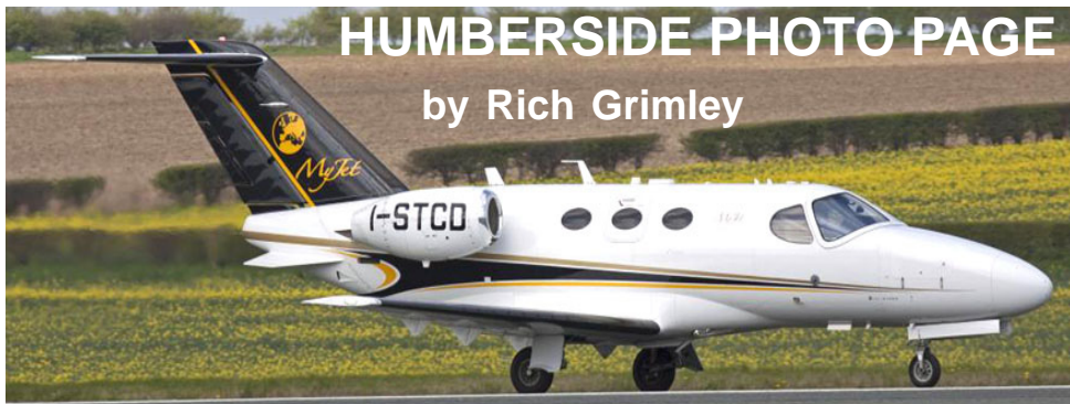
Citation Mustang I-STCD of MyJet arriving on 13/4