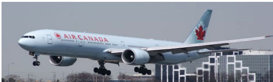
Boeing 777 C-FITL of Air Canada about to touch down

To celebrate Airport Watch Canada's 10th anniversary, Pearson put on a bus for us to have an airside tour. They apologised for it being early in the year but the summer becomes very busy with publicity tours so planned it for Monday(27/3) last to co-incide with the first arrival of Hainan Airways Boeing 787(B-2731, photo above ). It was a beautiful spring day which was a bonus. The only downside is that we are not allowed off the bus at times so some pictures suffer from window reflection. However, we did get out at the end of Runway 33R and also at some of the gates.