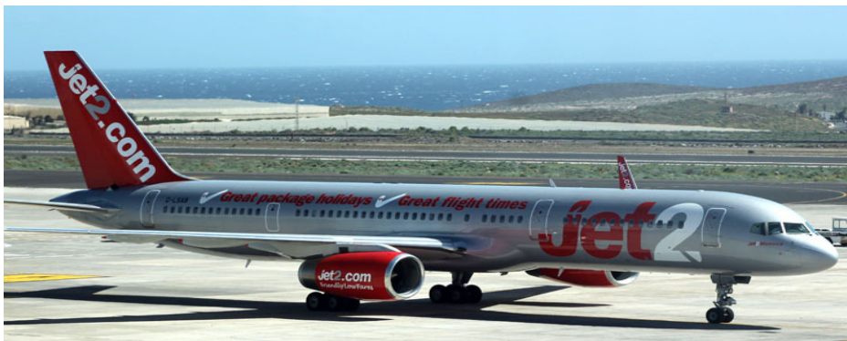
G-LSAB Boeing 757 of Jet2.com, Tenerife, 02/03/14