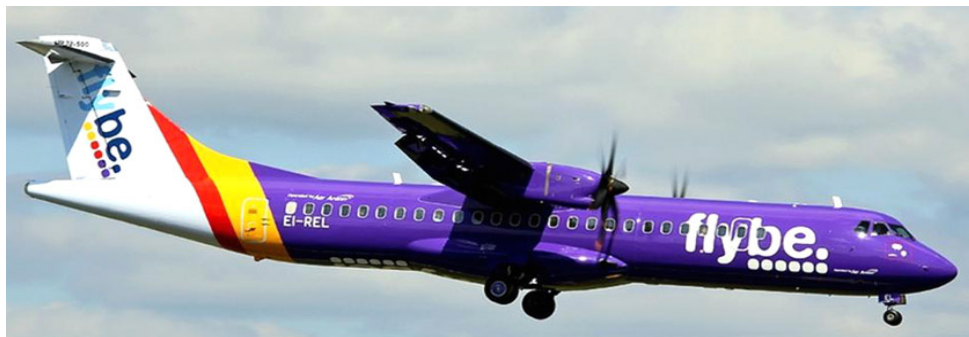
Stobart Air has painted ATR.72 EI-REL in the new Flybe colours This plus another of the type will operate out of Southend