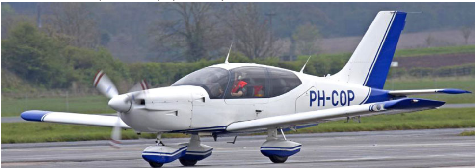
Seen arriving on 26/4, TB-10 Tobago owned by JW Westerhoft from Eindhoven