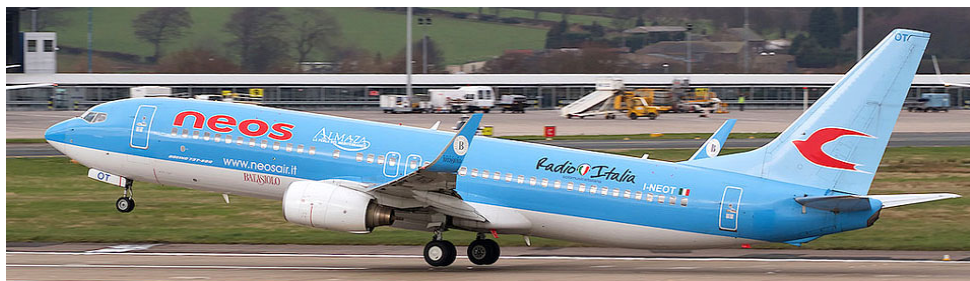
Boeing 737/800 I-NEOT of Neos, chartered by Jet2 on 3/4, departing LBIA

Belfast City (735/736, "3BH/1JY") –1/4 G-FLBB, 2/4 G-ECOB, 3/4 G-JECJ, 4/4 G-JECN, 6/4 G-ECOT, 7/4 G-ECOB, 8/4 G-JECJ, 9/4 G-KKEV, 10/4 G-JECJ, 11/4 G-ECOM, 13/4 G-ECOB, 14/4 G-KKEV, 15/4 G-JECY, 16/4 G-ECOE, 17/4 G-ECOC, 18/4 G-ECOJ, 19/4 G-FLBB, 21/4 G-ECOJ, 22/4 G-FLBB, 23/4 G-ECOJ, 24/4 G-FLBB, 25/4 G-FLBA, 27/4 G-FLBC, 28/4 G-ECOJ, 29/4 G-ECOC, 30/4 G-FLBD.