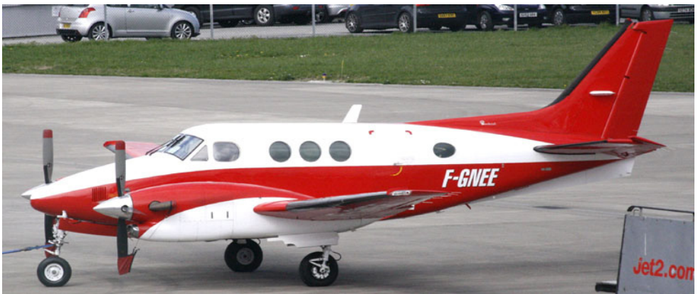
King Air 90 F-GNEE, a first time visitor, arrived from Lyon on 10/4(Mike Storey)