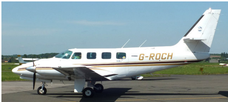
Cessna T.303 Crusader G-ROCH visiting Gamston 27/4

SALTERSGATE:- An unidentified Proctor is undergoing restoration locally more details when known.