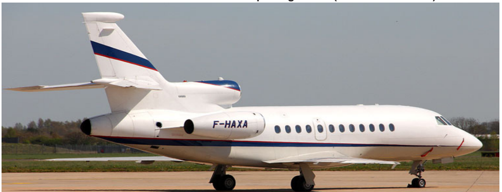
Falcon 900EX F-HAXA of AXA Reassurance SA, parked on the apron, 16/4