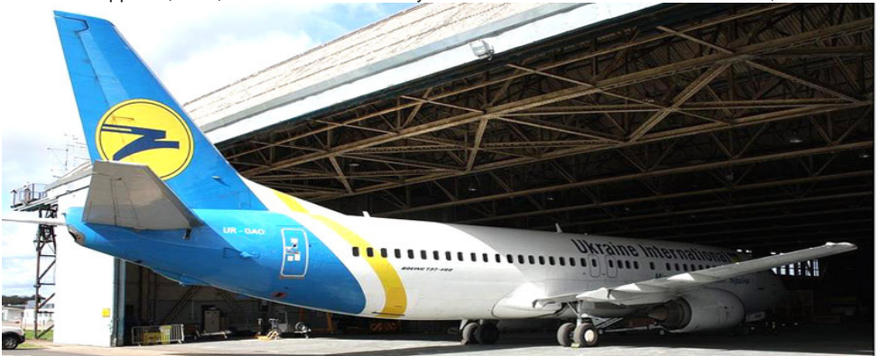
Ukraine International Boeing 737/400 UR-GAO arrived on 10/4 for scrapping by Sycamore