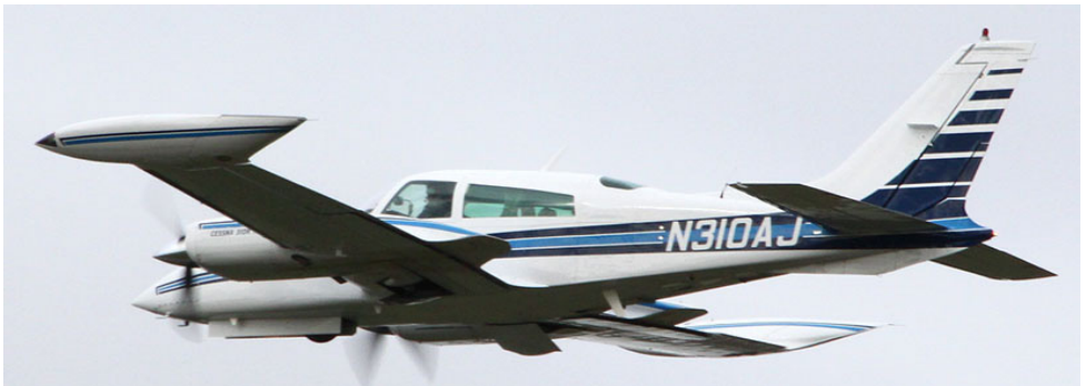
UK based Cessna 310R N310AJ departing on 9/5(Clive Featherstone)