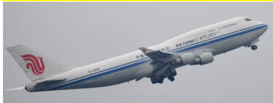
B-2458 Boeing 747/400F of Air China Cargo, Amsterdam, 03/03/14