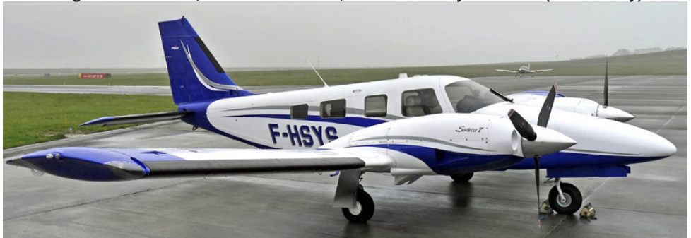
Pictured during the Multiflight tour on 4/4 PA-34 Seneca F-HSYS(Rod Hudson)