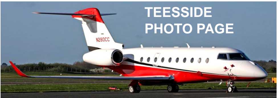
Noted on 13/4 Gulfstream G-280 N280CC owned by Cummins Inc of Columbus, Indiana