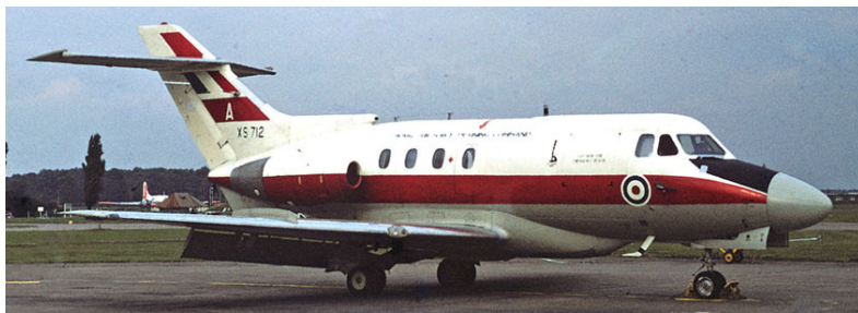
XS712 Dominie T.1 "A", 6FTS