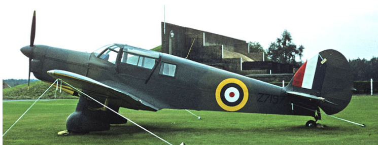
Z7197 Proctor 3