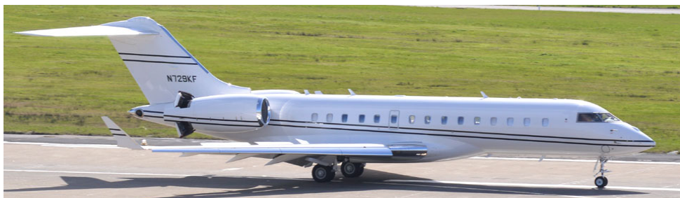
Global Express N729KF arriving direct from Van Nuys, California on 8/4