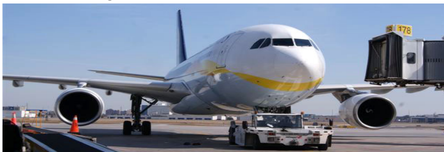
Airbus A.330/300 VT-JWP of Jet Airways being pushed back