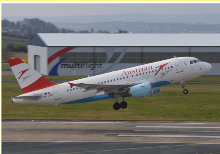
OE-LDE Airbus A.319 of Austrian Airlines departing Runway 32, LBIA, 01/03/14