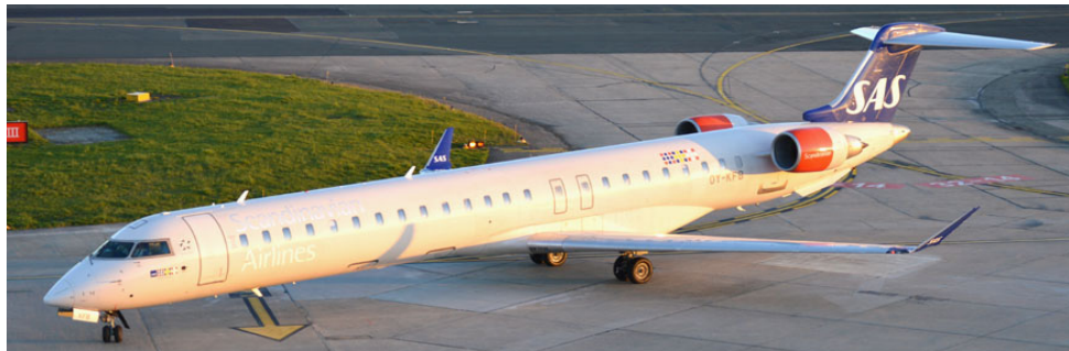
Canadair CRJ-900 OY-KFB pulling onto stand in the evening sunshine at LBIA, 18/4

Additional flights:-28/4 EI-DHX positioned in from East Midlands (2), then operated 2472/2473 to/from Montpellier, then positioned back out to East Midlands (3).