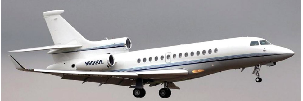
On final approach, 25/4, Falcon 7X is owned by Emerson Electric Co from Chersterfield, Missouri