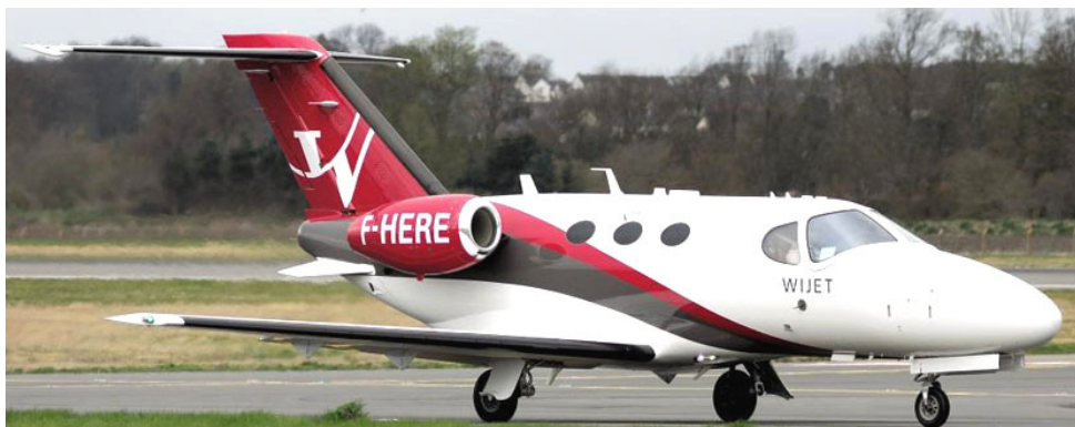
Citation Mustang F-HERE(“Wijet”) made its first visit to LBIA on 23/4, f/t Paris

After quite an absence resident Falcon 900 G-SIRO arrived from Bermuda/LF Wade International at 0922 this morning. PA-31 Navajo G-GURN (Neric 02/03) f/t Guernsey(0942/1510). Global Express N683GA owned by LMI 11 LLC of Alpharetta, California, from Gwinnett County, Georgia(1003). King Air 90 G-ORTH (Enzo 8JT) t/f Edinburgh(1057/2033).