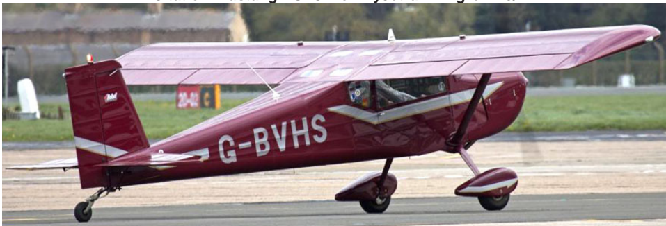
Murphy Rebel G-BVHS on 10/4 is based at a farm strip, Grange Farm, Huntingdon