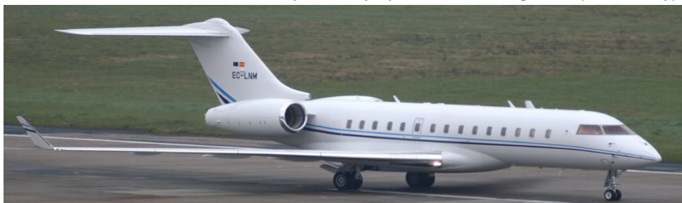
Global Express EC-LNM of Gestair back tracking 14 for departure to Dusseldorf, 22/4