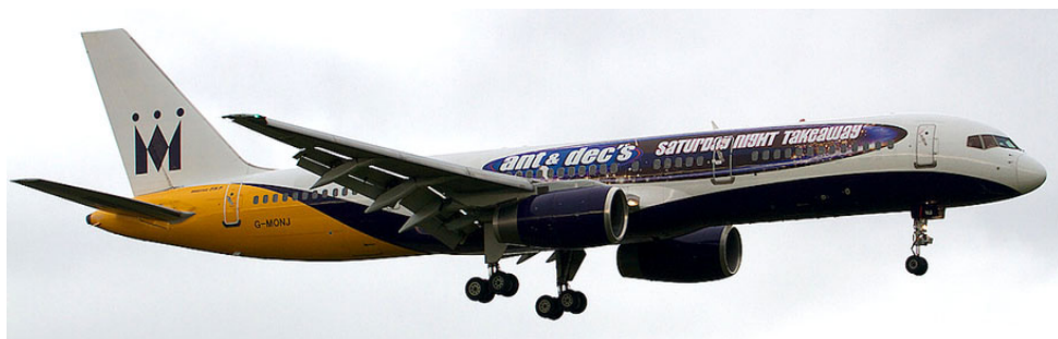
Monarch Boeing 757 G-MONJ on finals to runway 14 at a grey LBIA, 5/4(David Blaker) The aircraft operated a charter to Florida and took off live on the BBC show Ant and Decs Saturday Night Takeaway. The return trip operated the following week.

Amsterdam (1551/1540, "69W/78E", aircraft night stops) -1/4 PH-KZI, 3/4 PH-KZC, 4/4 PH-KZD, 5/4 PH-KZT, 6/4 PH-KZL, 7/4 PH-KZM, 8/4 PH-KZF, 9/4 PH-KZC, 10/4 PH-KZT, 11/4 PH-KZB, 12/4 PH-WXD, 13/4 PH-KZR, 14/4 PH-KZN, 15/4 PH-KZE, 16/4 PH-KZO, 17/4 PH-KZD, 18/4 PH-KZM, 19/4 PH-KZP, 20/4 PH-KZK, 21/4 PH-KZU, 22/4 PH-KZP, 23/4 PH-KZR, 24/4 PH-KZM, 25/4 PH-KZH, 26/4 PH-KZT, 27/4 PH-KZU, 28/4 PH-JCT, 29/4 PH-KZO, 30/4 PH-KZH.