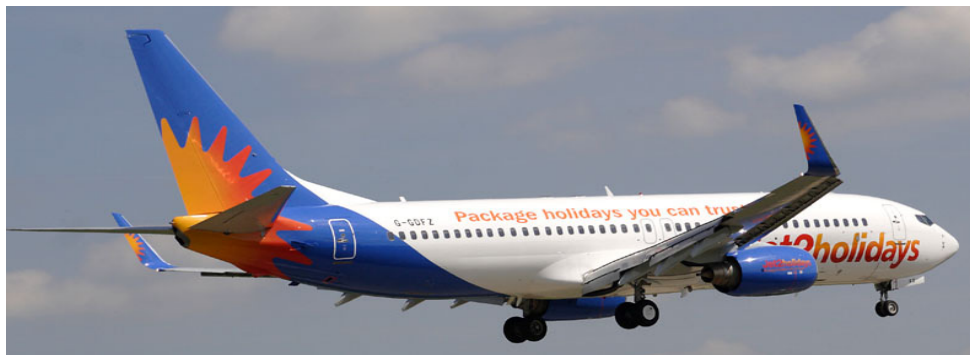
One of the latest Boeing 737/800s for Jet2 G-GDFZ on finals for runway 14

Tenerife(3749/8, "1GJ/92W" –Sun) :-6/4 G-TAWP, 13/4 G-TAWS, 20/4 G-TAWL, 27/4 G-TAWL.