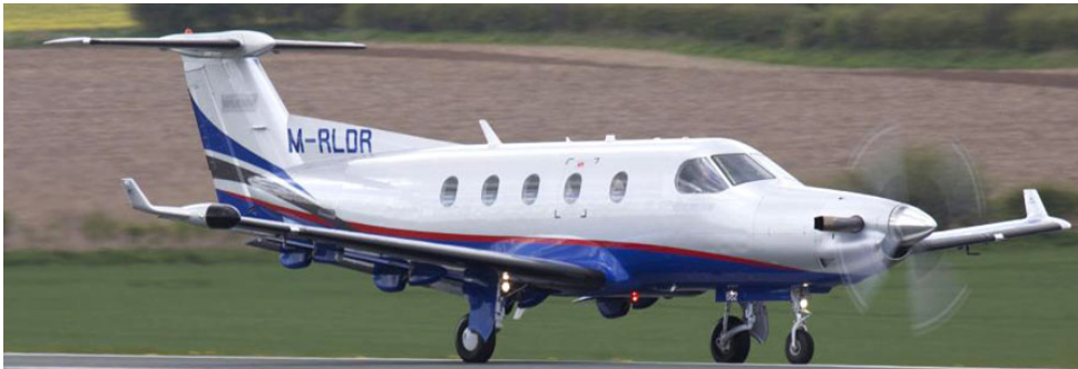
PC-12 M-RLDR(ex G-MATX) operated by RLDR Air, based at Denham visited on 14/4