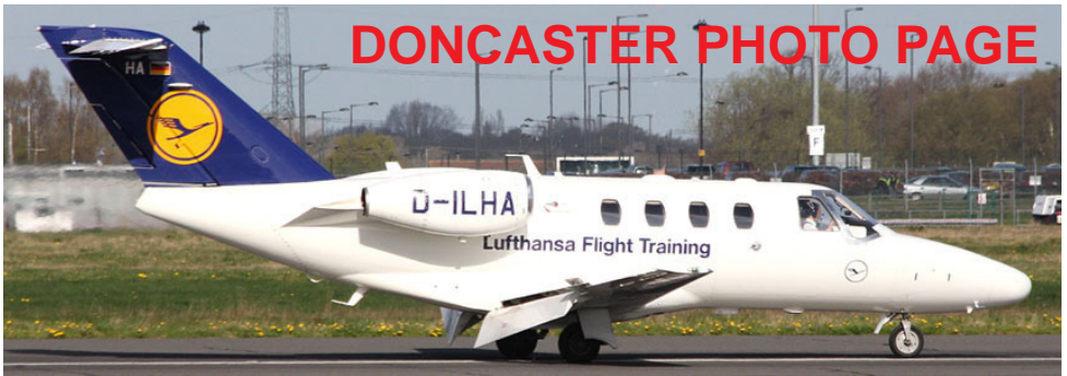
Citationjet 1 D-ILHA of Lufthansa Flight Training visited on 14/5(Clive Featherstone)