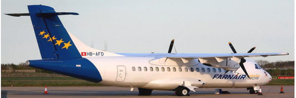
ATR-42 HB-AFD of Farnair/Europe arrived on 14/5 for an overnight stay(Correne Calow)