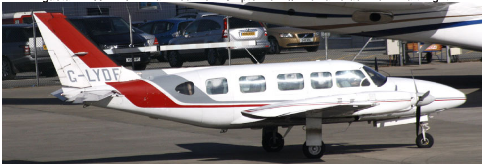
PA-31 Chieftain G-LYDF of Lyddair operated a charter into LBIA on 10/4(Mike Storey)