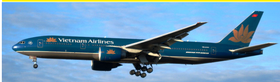
VN-A141 Boeing 777/300ER of Vietnam Airlines, Prague, 07/01/14(Martin Zapletal)