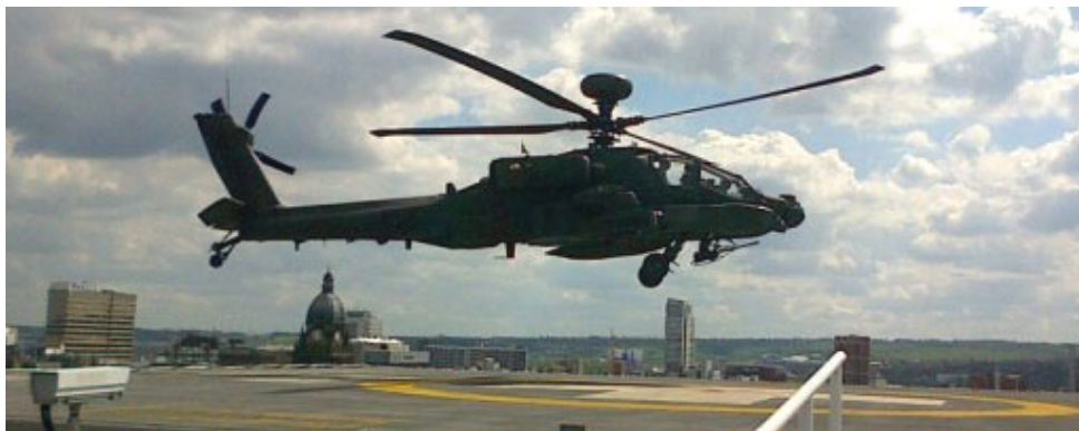
Apache ZJ328 touching down on the roof-top helipad at Leeds General Infirmary, 5/5

4/4 M-USHY Cessna 441, G-RJXE EMB.145(Kittiwake 8170) 5/4 M-IKEL 2000LX, G-CIEC SAAB 2000(Eastflight 11W) 7/4 G-LEAB Citation Mustang(Lonex 03AB), G-BNTD PA-28 8/4 F-HATG Citationjet 3, CS-DFQ Citation XL(Fraction 160R) 9/4 D-ISIX King Air 90, N131CD SR.22, CS-DHO Citation Bravo(Fraction 1ZQ) 10/4 G-BVHS Murphy Rebel, CS-DXN Citation XL(Fraction 120A) 11/4 G-PKPK Schweizer 269C 12/4 M-715 Merlin(Danish Air Force 3175) 13/4 I-STCD Citation Mustang(DSP 3710, G-KVIP King Air 200(Prestige 69X), G-KAFT DA-42 14/4 M-RLDR Pilatus PC-12, CS-DXR Citation XL(Fraction 3CQ), G-LAFT DA-42 15/4 N192NC Gulfstream 450(n/s), G-DJET DA-42(WKT 07), N228AM PA-28 Archer 16/4 EC-JCU Metroliner(OVA 72K), G-AYAW PA-28 17/4 G-BUOS/SM845 Spitfire FR.XVIII, G-BIHI Cessna 172N 19/4 G-RJXB EMB.145(Kittiwake 8141, Arsenal FC) 20/4 G-SPUR Citation XL(Lonex 53PU), N228AM PA-28 21/4 I-STCA Citation Mustang(DSP 614), G-BUOS Spitfire FR.XVIII 22/4 M-TSRI King Air 90(Ambassador 922B), D-EKNA Mooney M.20F 23/4 OY-PPS PA-34 Seneca, G-SACW AT-03, G-MOSJ King Air 90(Enzo 623P) 25/4 N7NP Hughes 369E, G-MSVI A.109S, CS-DXD Citation XL(Fraction 081Y) 26/4 PH-COP TB.10 Tobago, G-CHCT Agusta AW.139 27/4 G-KLNW Citation Mustang(Saxonair 51D) 28/4 CS-DXT Citation XL(Fraction 439D) 30/4 N113WJ Gulfstream 4(n/s)