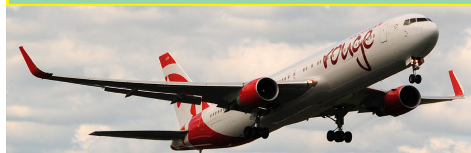
C-FMXC Boeing 767/300 of Air Canada/Rouge, Dublin, 21/05/14(Steve Lord)